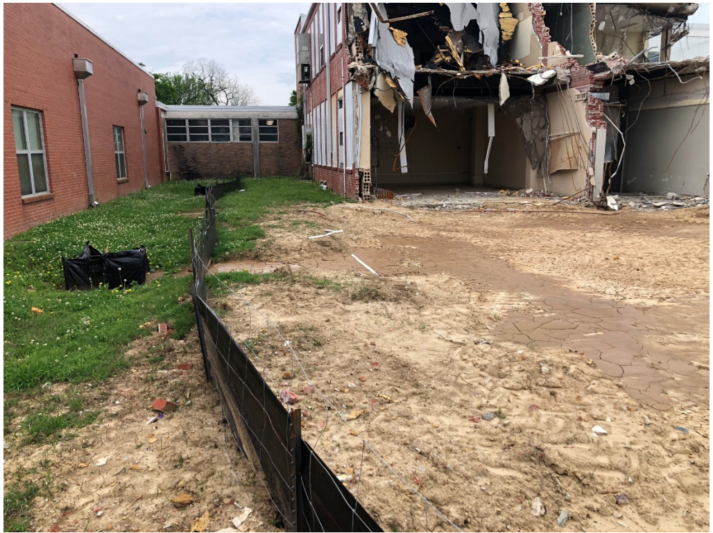
Figure 7 – Storm Sewer & Silt Fencing