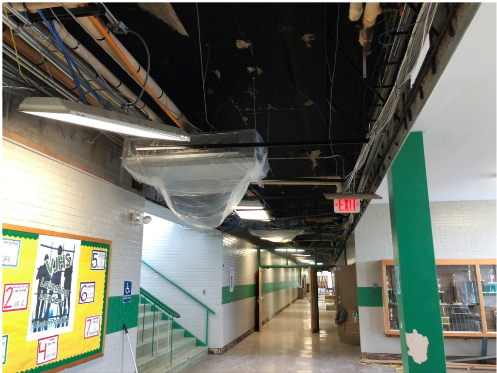
Figure 4 – HVAC Units Hung