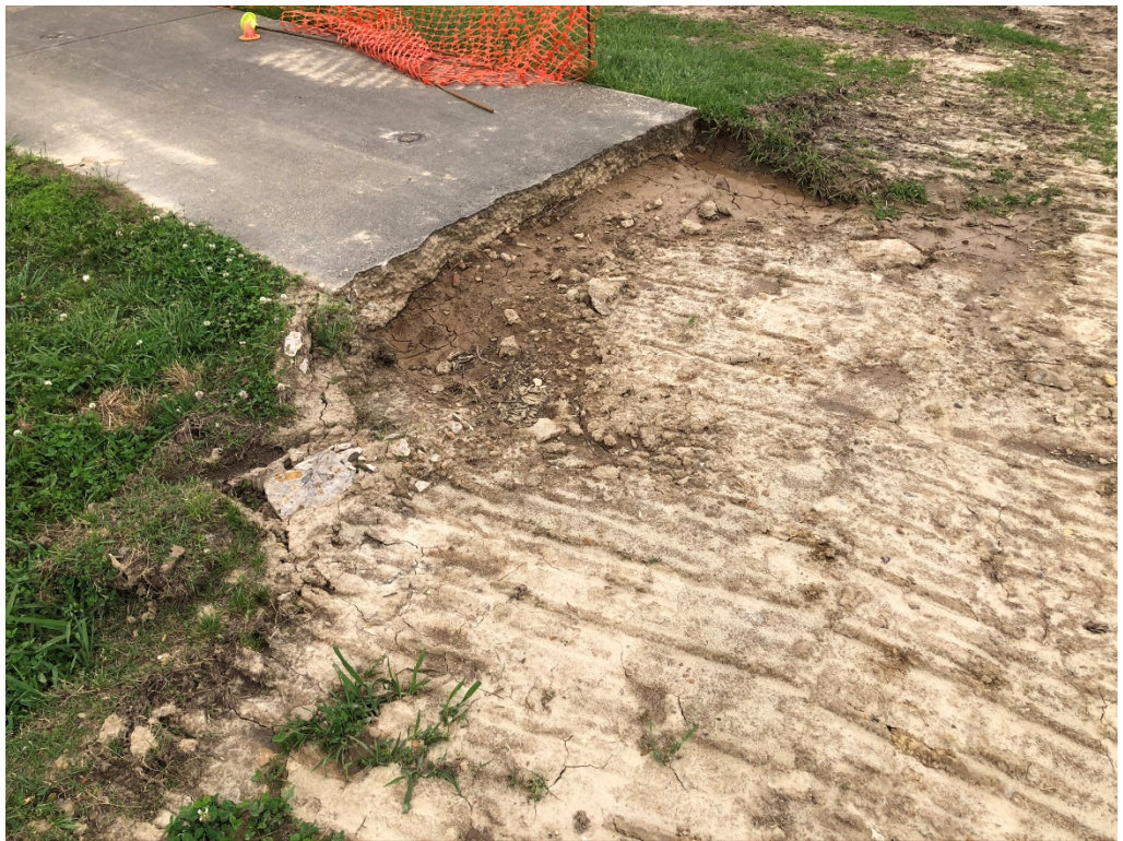
Figure 8 – Demo Cut at Sidewalk