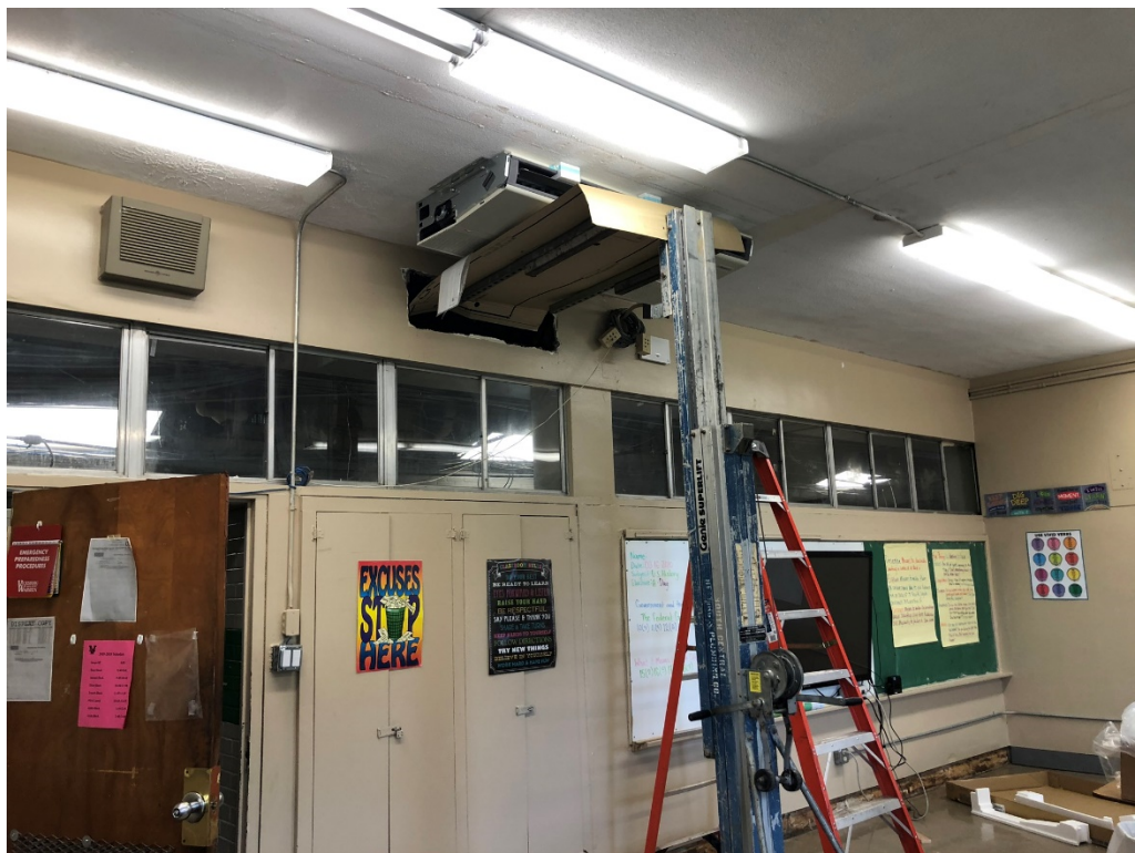
Figure 6 – Classroom Units Install in Progress