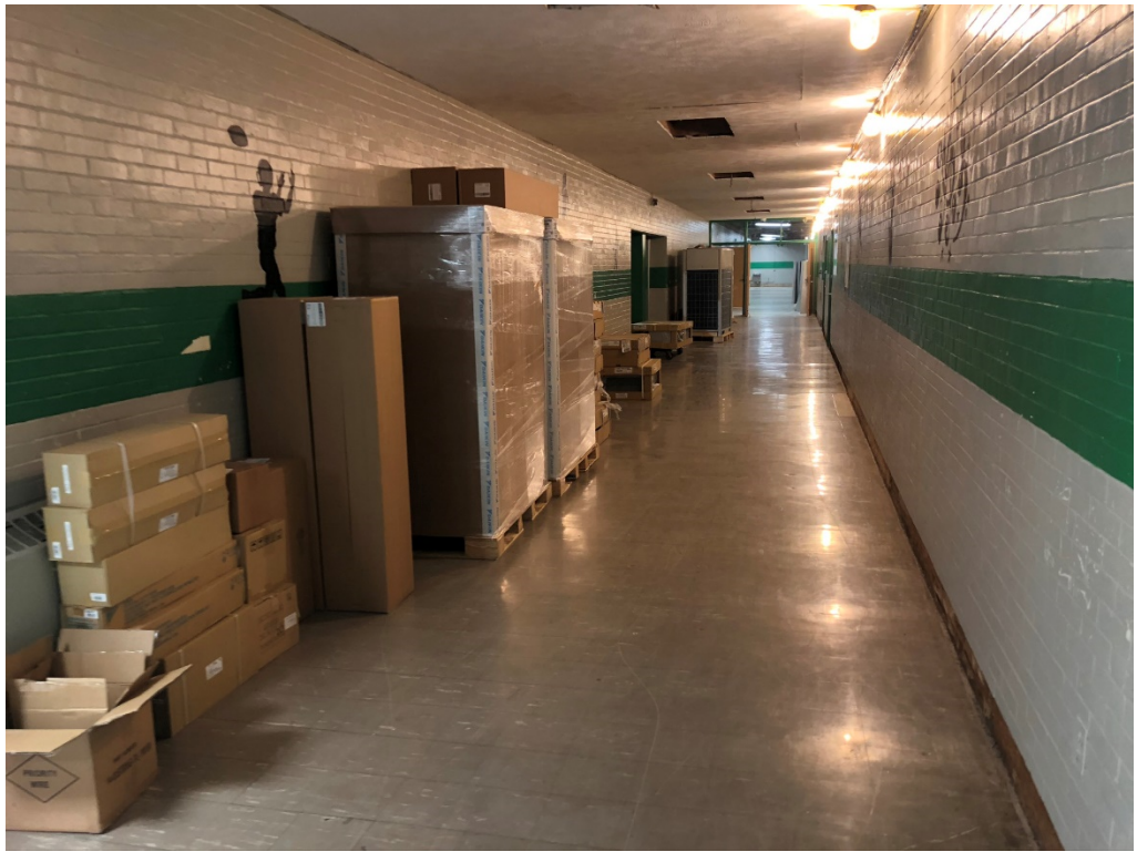
Figure 1 – HVAC Staging Area