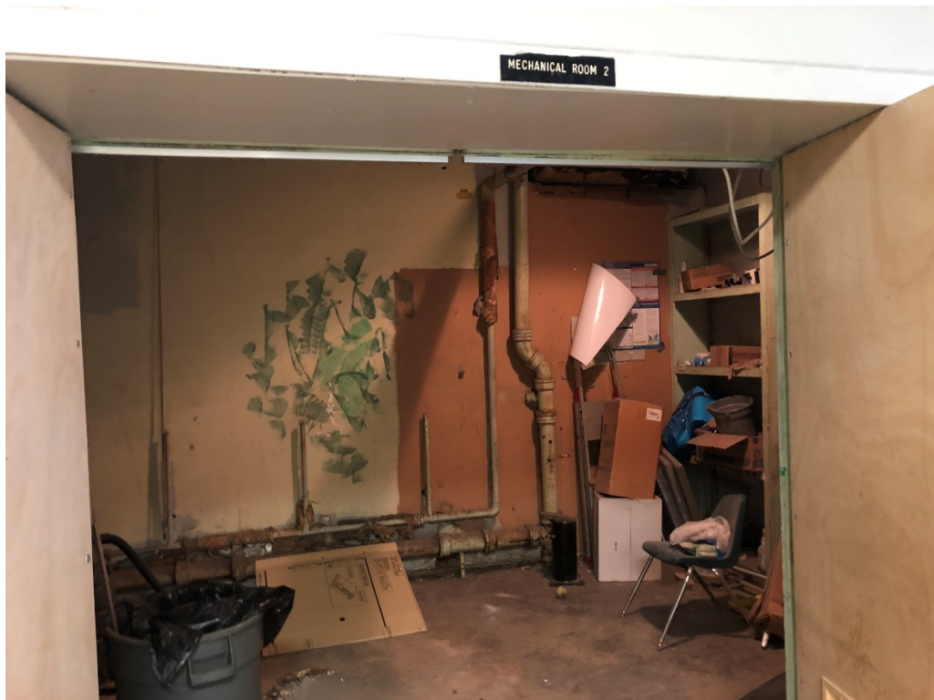
Figure 5 – Demo @ Mechanical Room