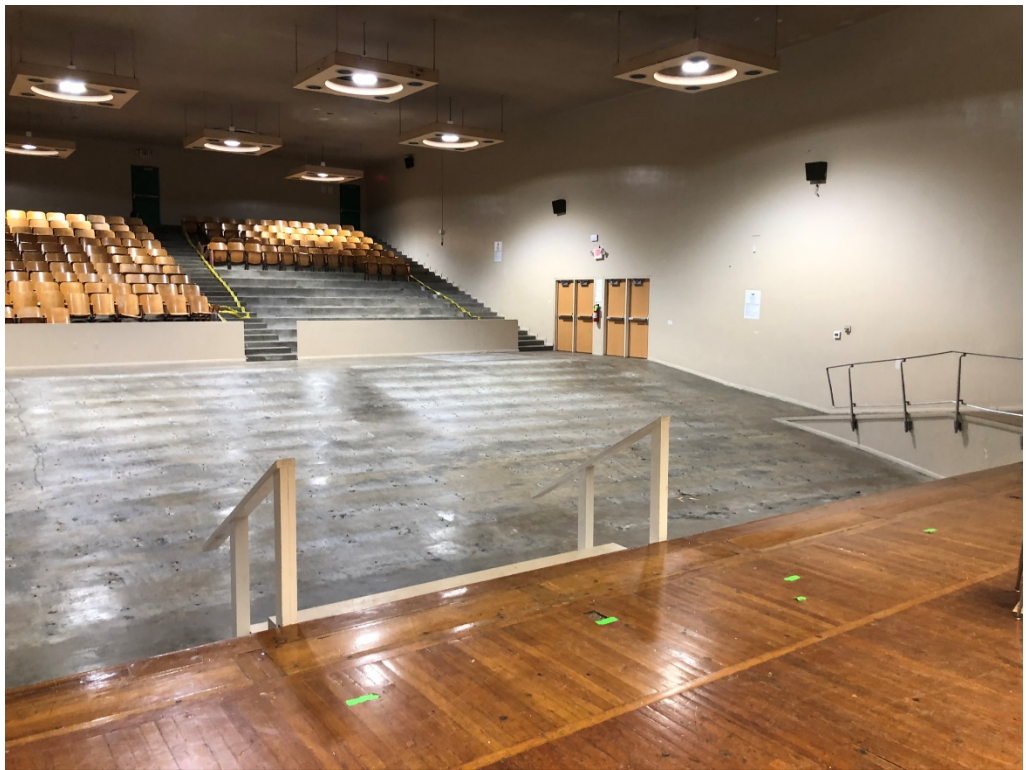
Figure 2 – Auditorium Chair Demo Progress