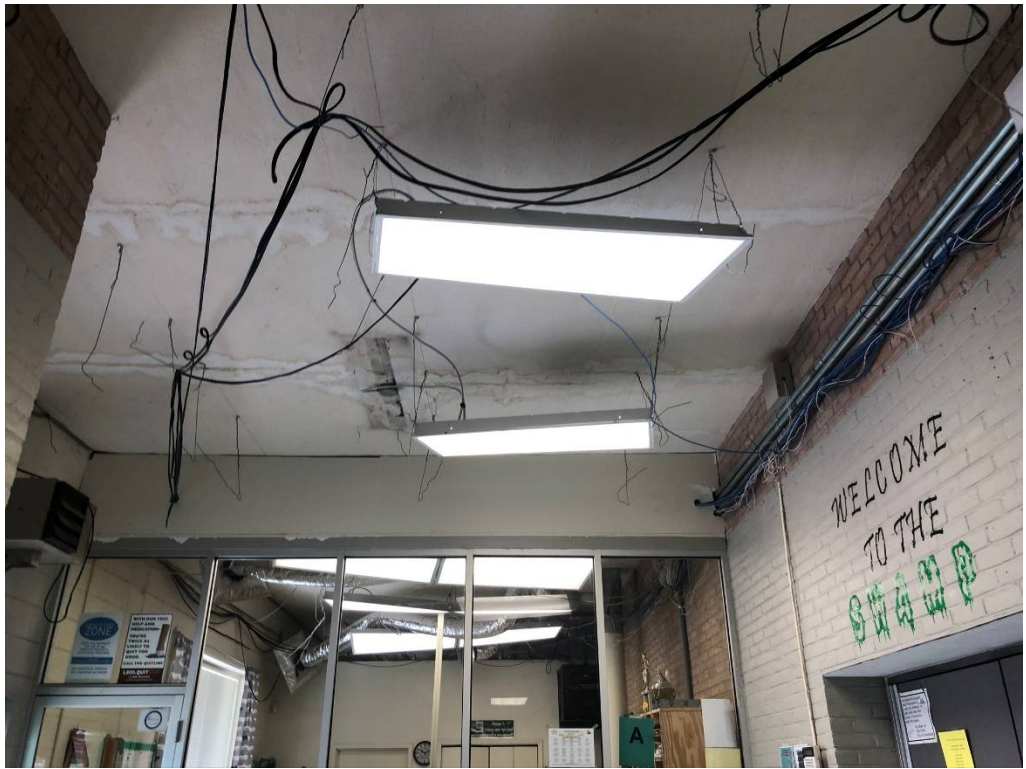
Figure 1 –Front Entry Ceiling Demoed