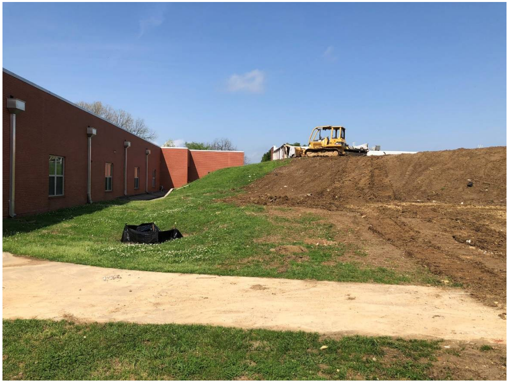
Figure 5 – Building Demo is OnGoing