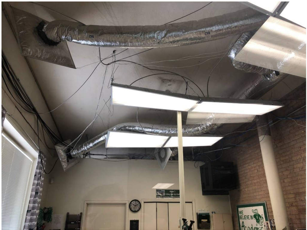
Figure 2 – Front Office Ceiling Demoed