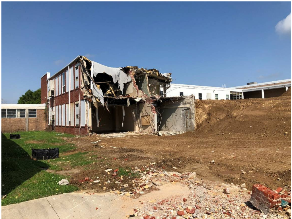
Figure 6 – Building Demolition