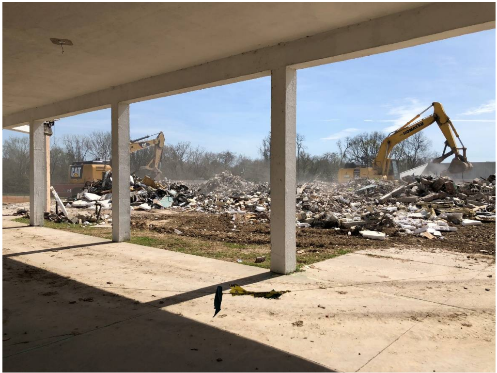
Figure 5 – Building Demolition