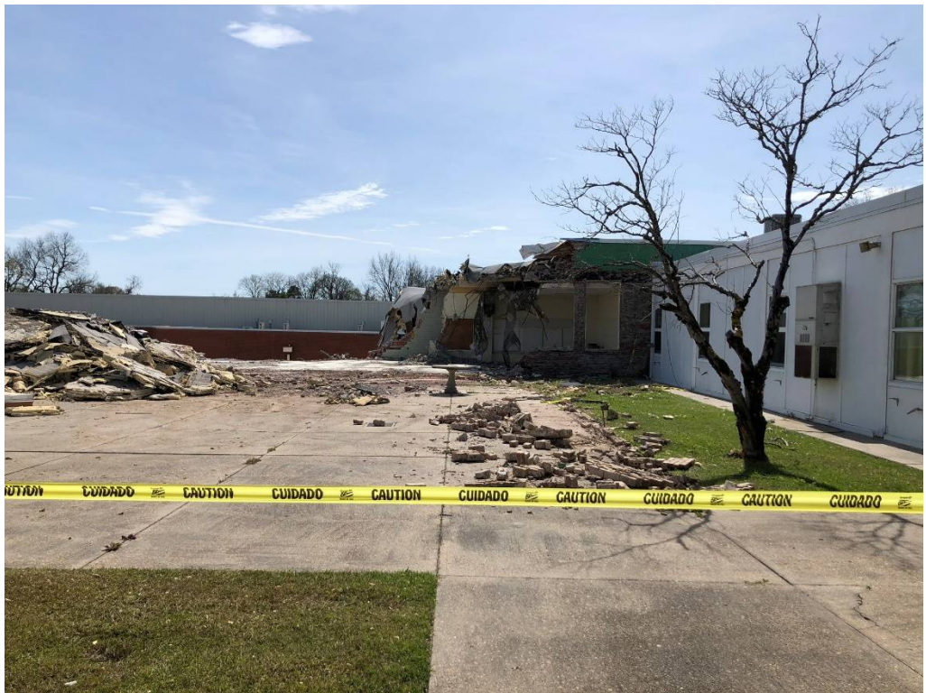
Figure 6 – Building Demolition