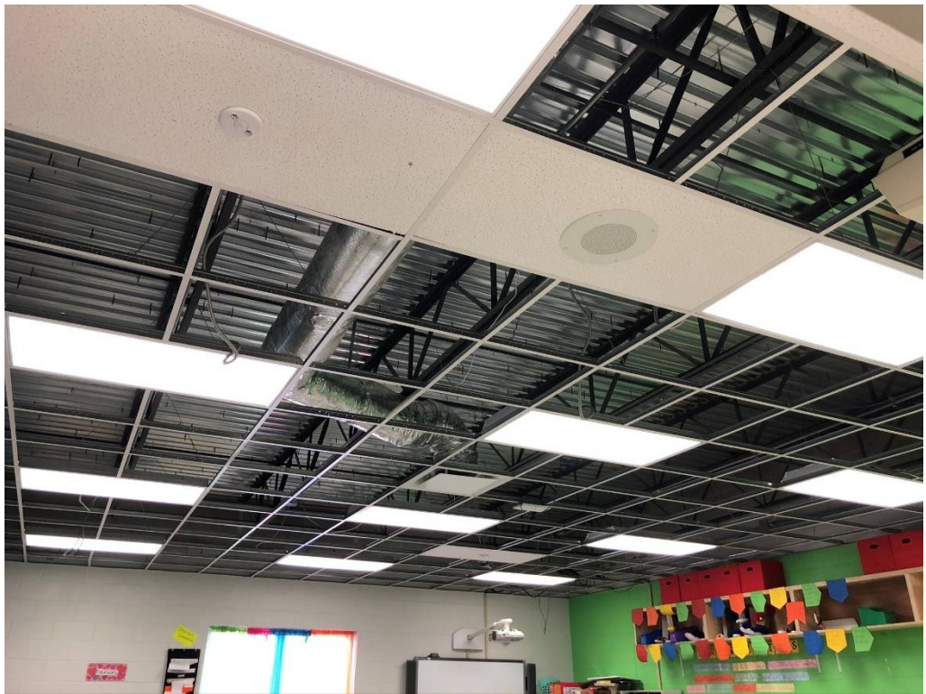
Figure 4 – Classroom Tile Demo (typical)