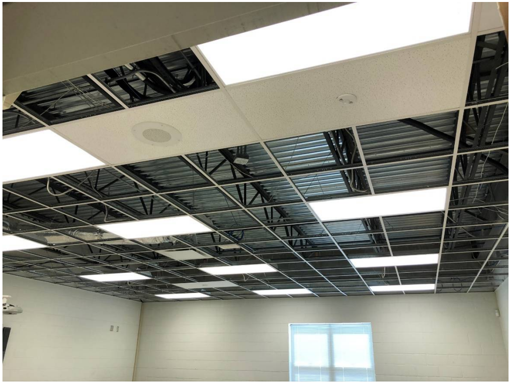
Figure 3 – Classroom Tile Demo (typical)