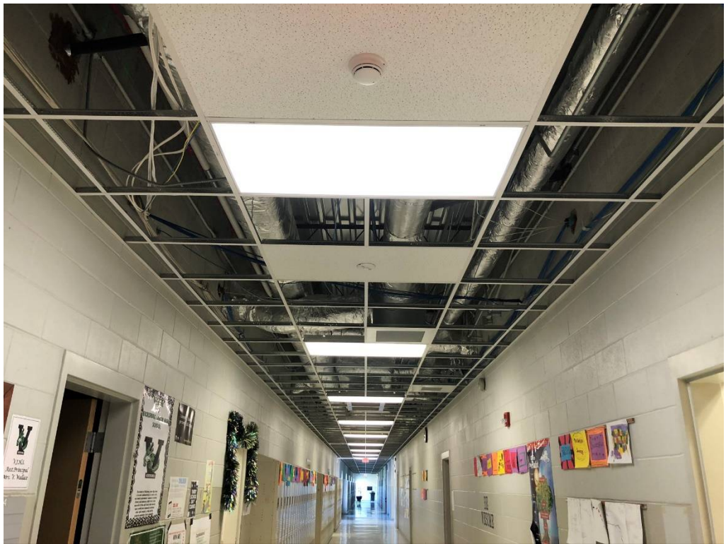
Figure 2 – Hall Demo