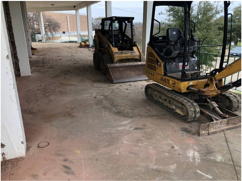
Figure 1 – Building Abatement before Demolition