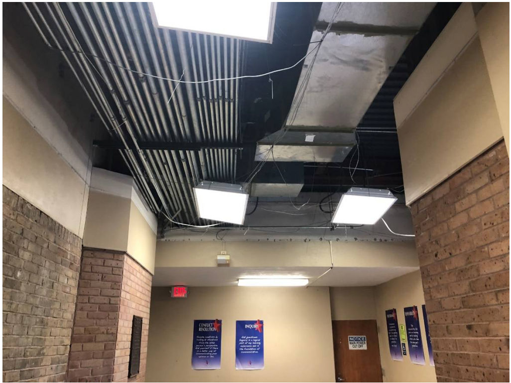
Figure 19 – Ceiling Tile & Grid Removal at First Floor