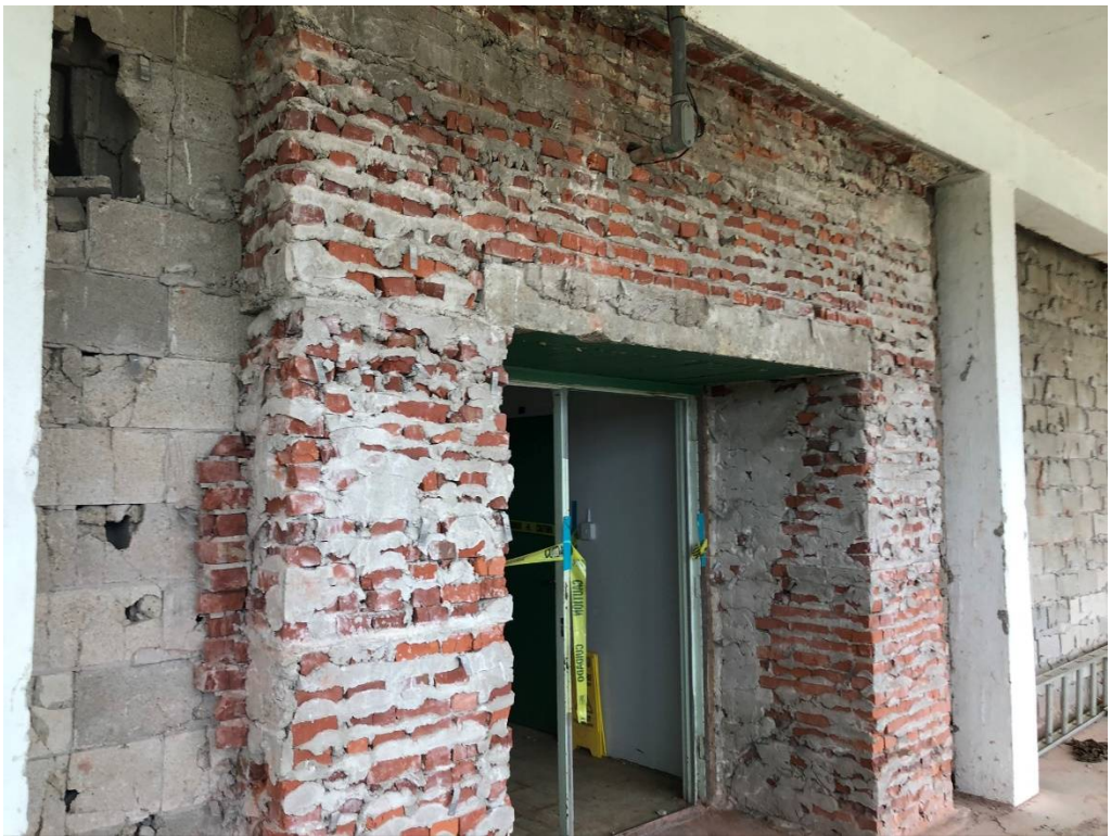
Figure 2 – Building Abatement before Demolition