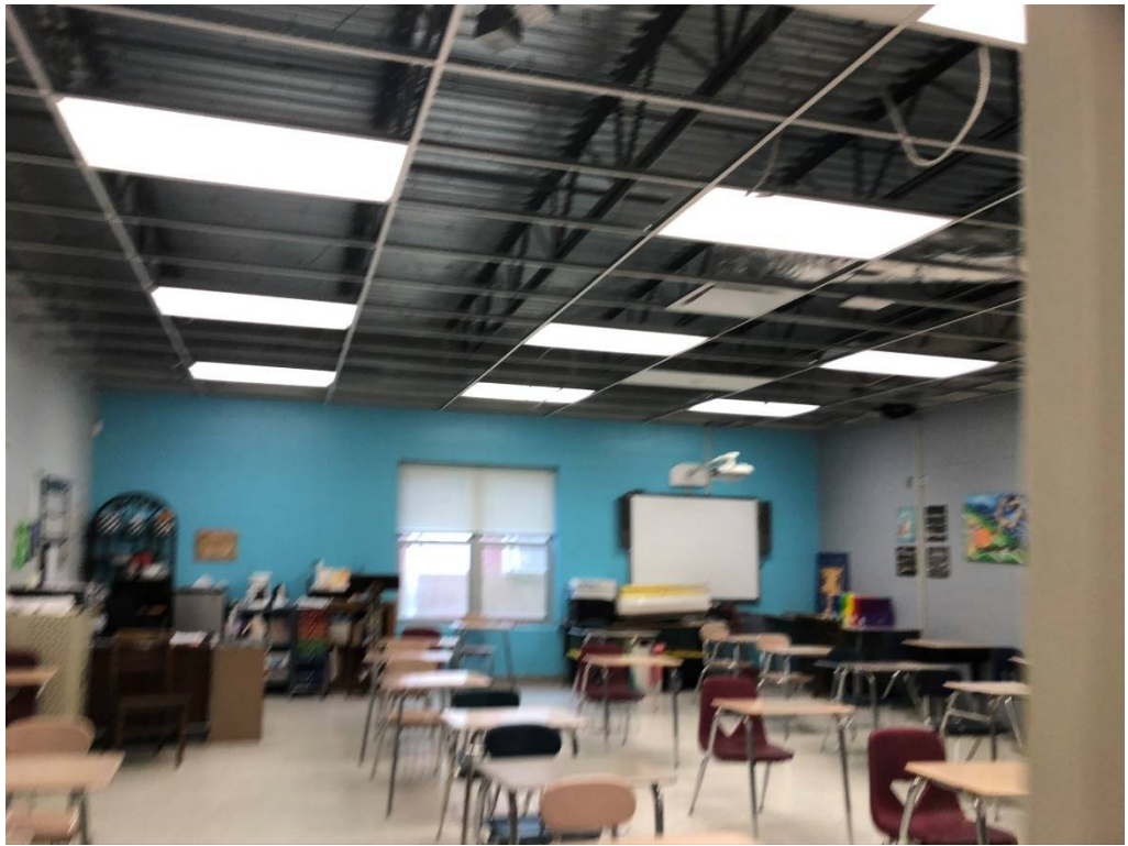
Figure 11 – Ceiling Tile Removal at Second Floor Classrooms