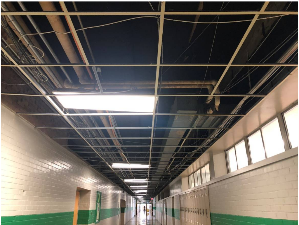
Figure 6 – Ceiling Tiles and Grid Removal at 2 nd Floor