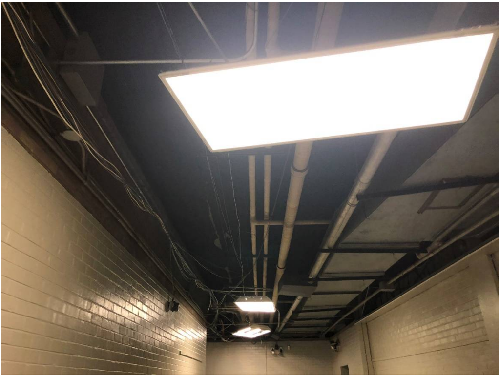
Figure 5 – Ceiling Tiles and Grid Removal at 2 nd Floor