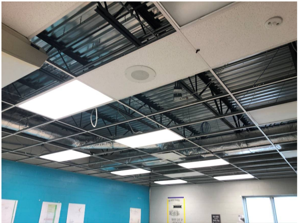
Figure 12 – Ceiling Tile Removal at Second Floor Classrooms