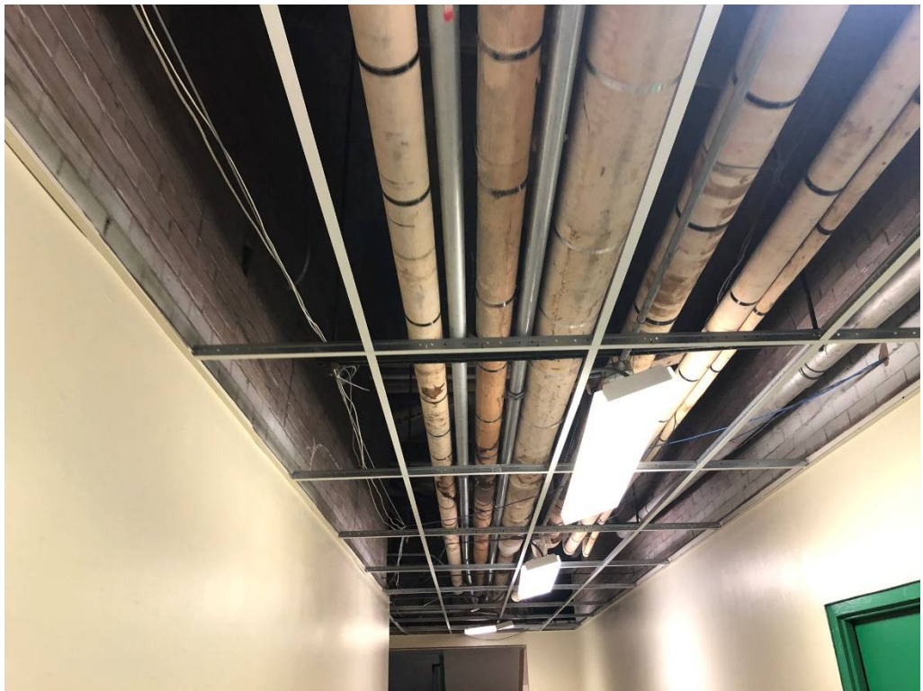
Figure 20 – Ceiling Tile Removal at First Floor