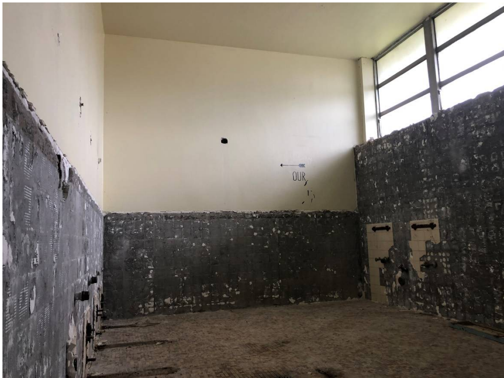
Figure 8 – Bathroom Demo at 2 nd Floor E-217B