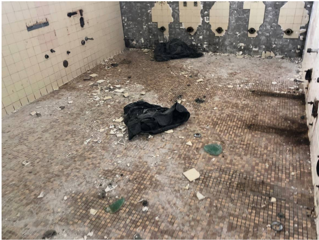
Figure 7 – Bathroom Demo at 2 nd Floor E-217A