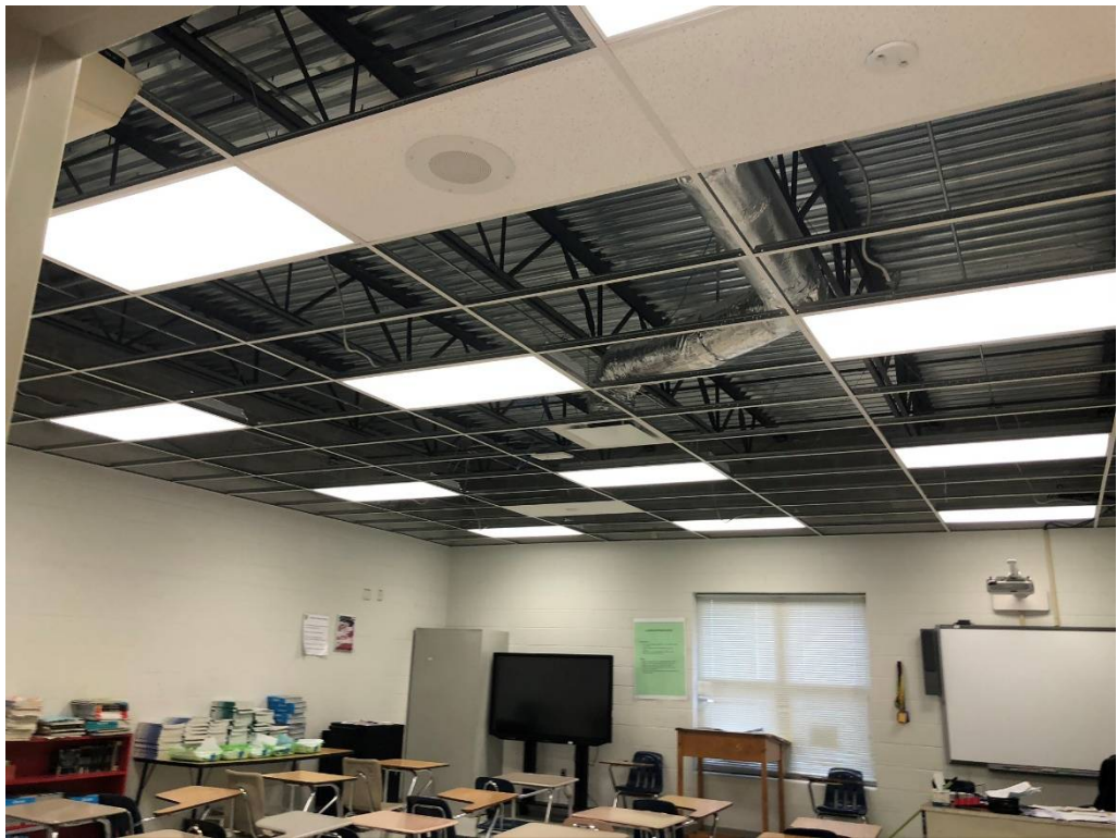
Figure 14 – Ceiling Tile Removal at Second Floor Classrooms