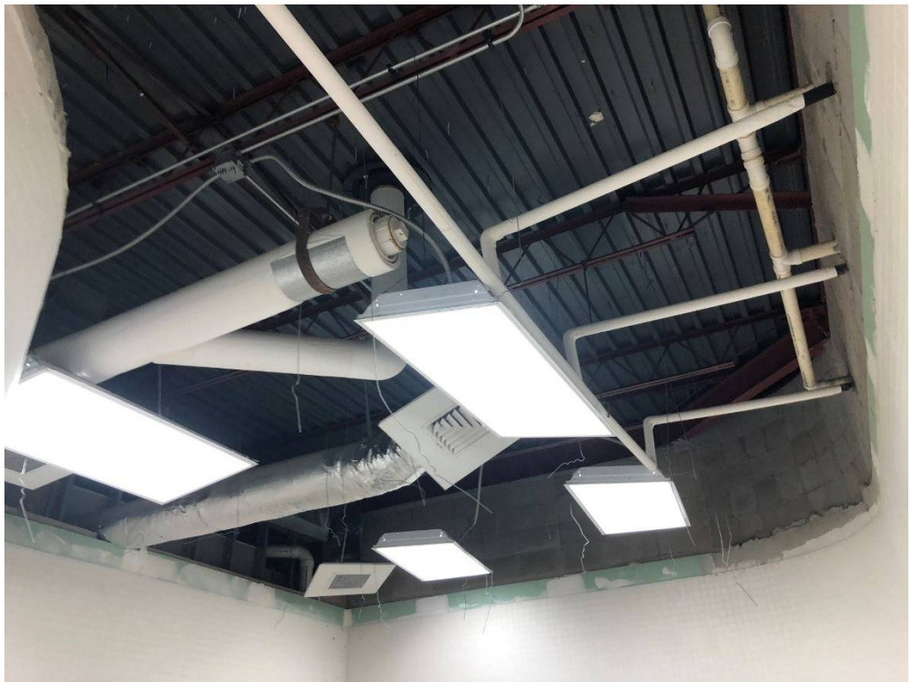
Figure 16 – Ceiling Tile & Grid Removal at First Floor Bathrooms