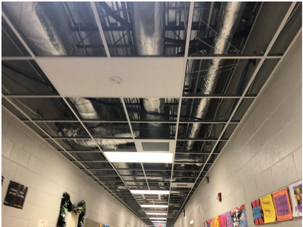
Figure 10 – Ceiling Tile Removal On-Going