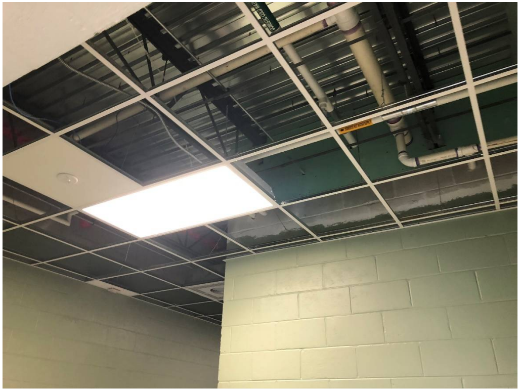
Figure 13 – Ceiling Tile Removal at Second Floor Classrooms