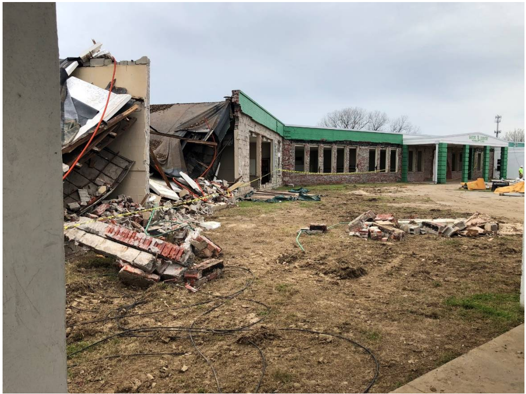
Figure 3 – Building Abatement before Demolition