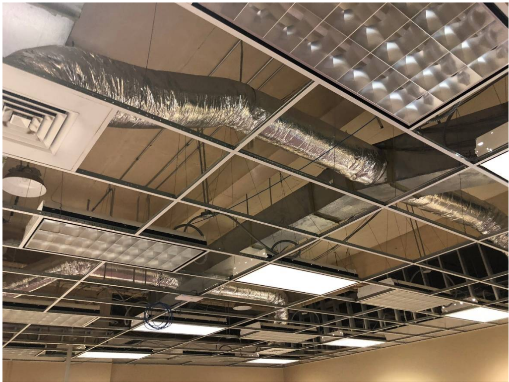
Figure 18 – Ceiling Tile Removal at First Floor Classrooms