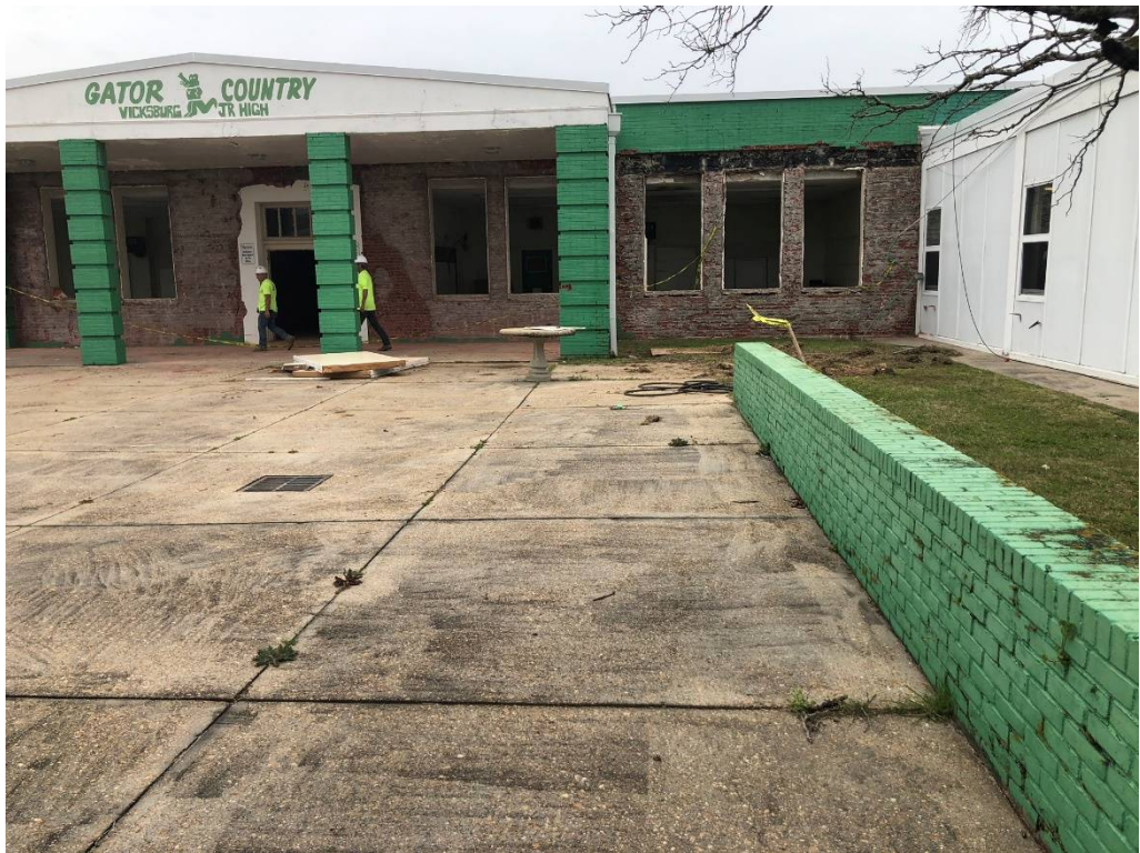
Figure 4 – Building Abatement before Demolition