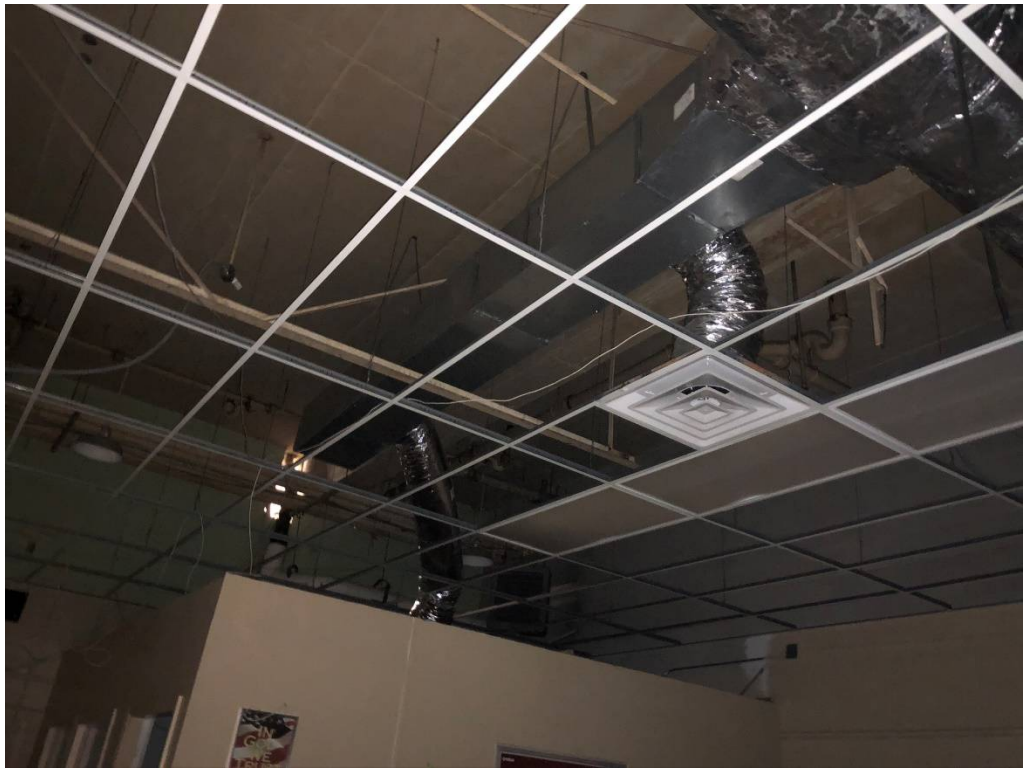
Figure 17 – Ceiling Tile Removal at First Floor Classrooms