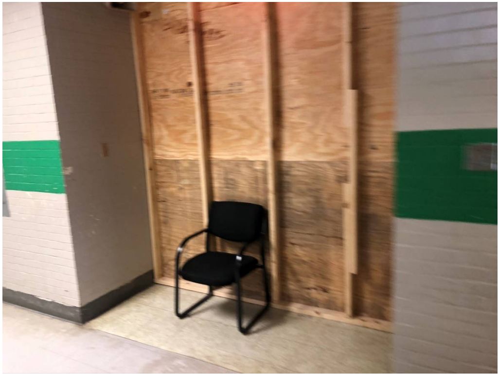
Figure 9 – Temp Wall to Block Construction at Second Floor