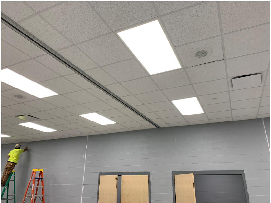
Figure 12 – Ceiling Tile Installed