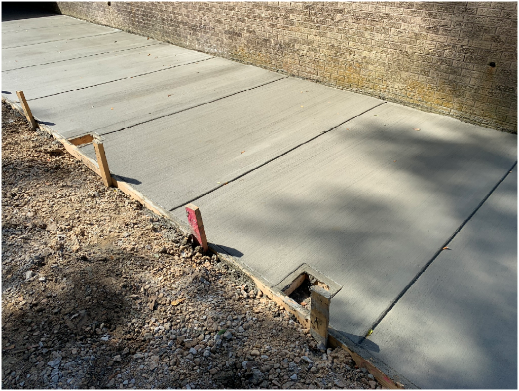
Figure 3 – Sidewalk Install