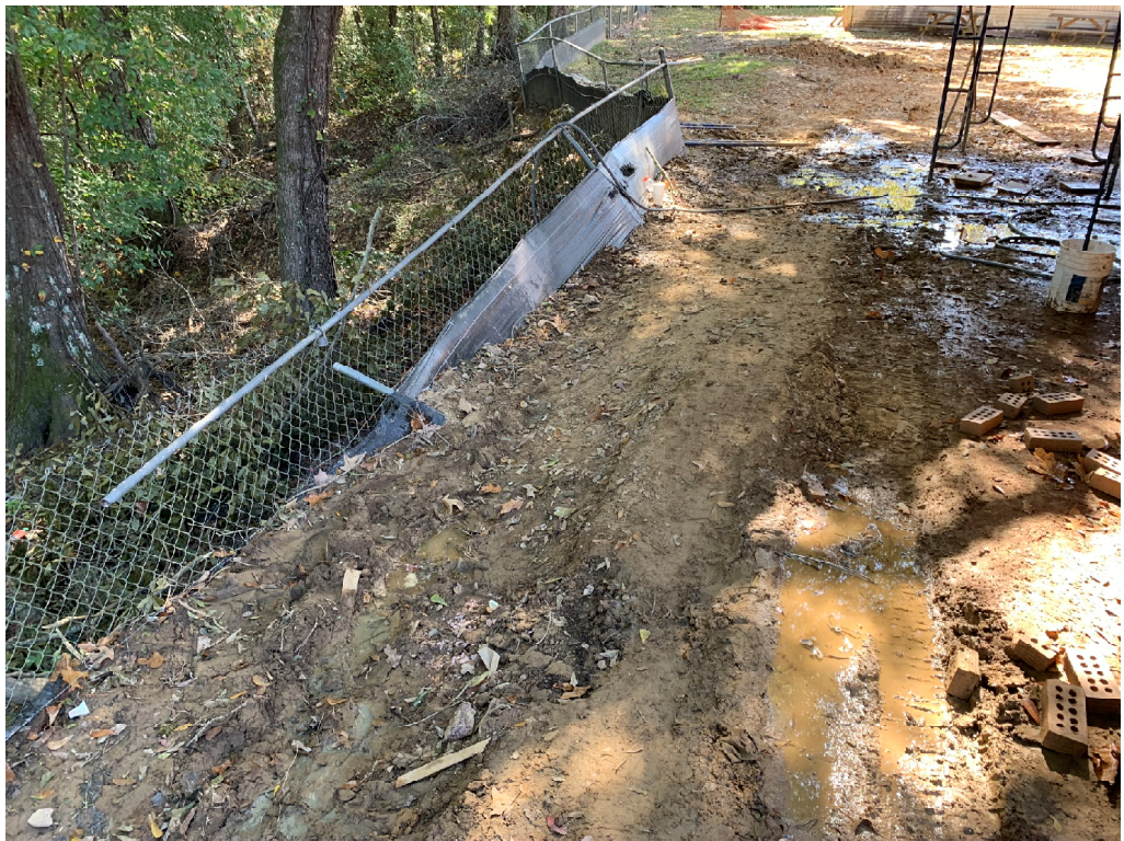
Figure 8 – Back Corner of Addition