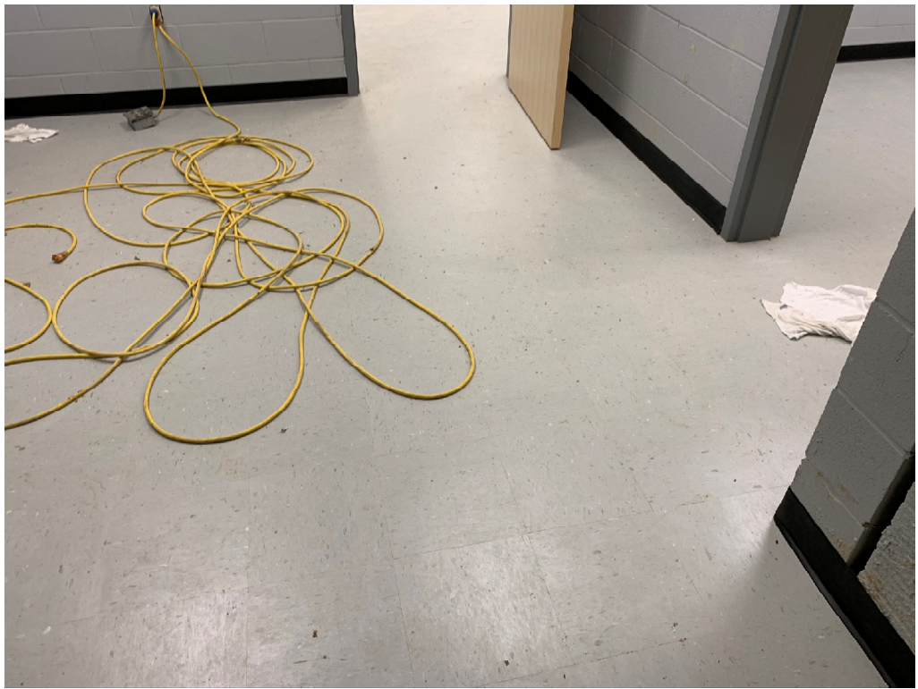
Figure 9 – Base Installed; preformed corners are required at inside and outside corners per spec