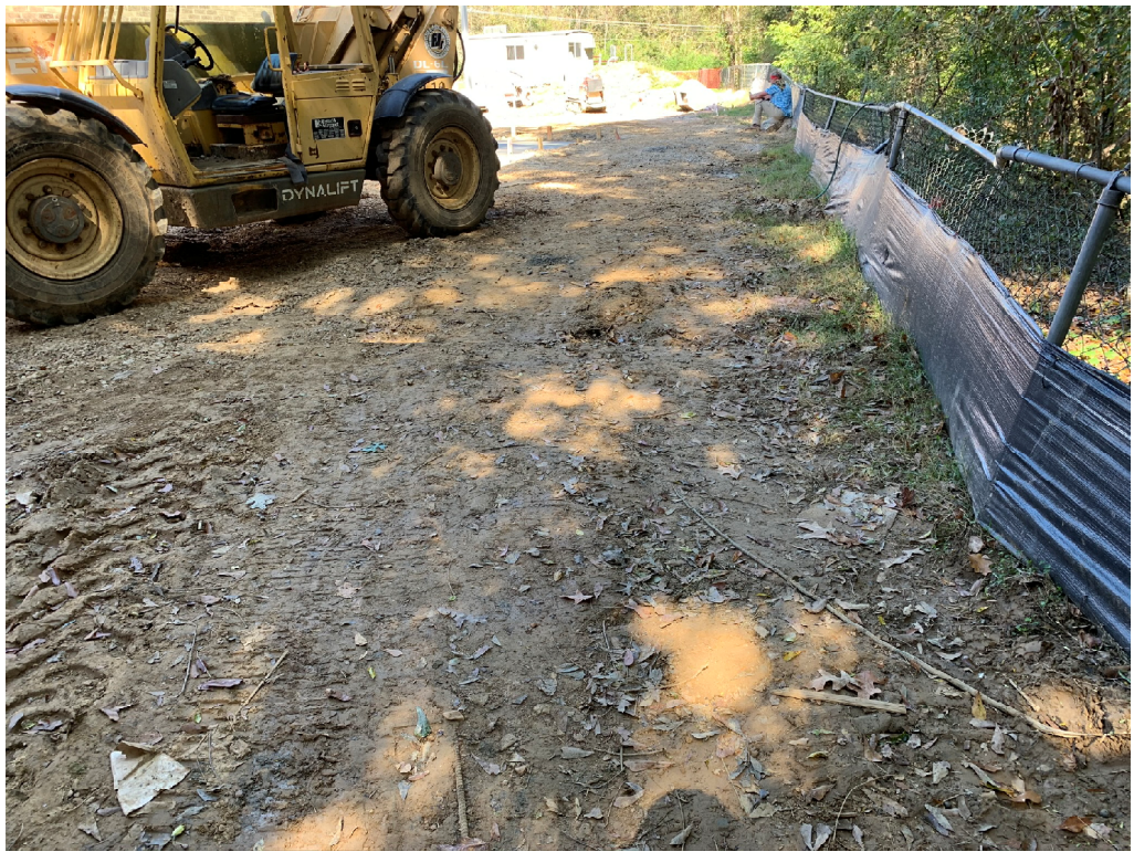
Figure 7 – Back Corner of Addition