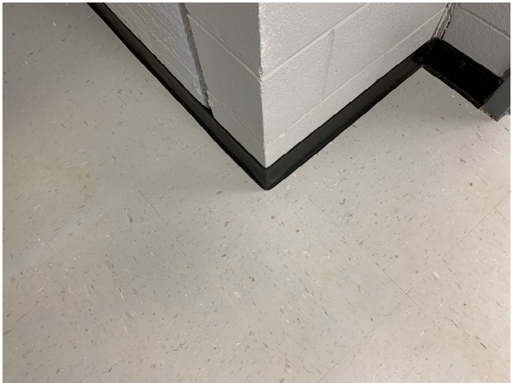
Figure 14 – Preformed Corners Required