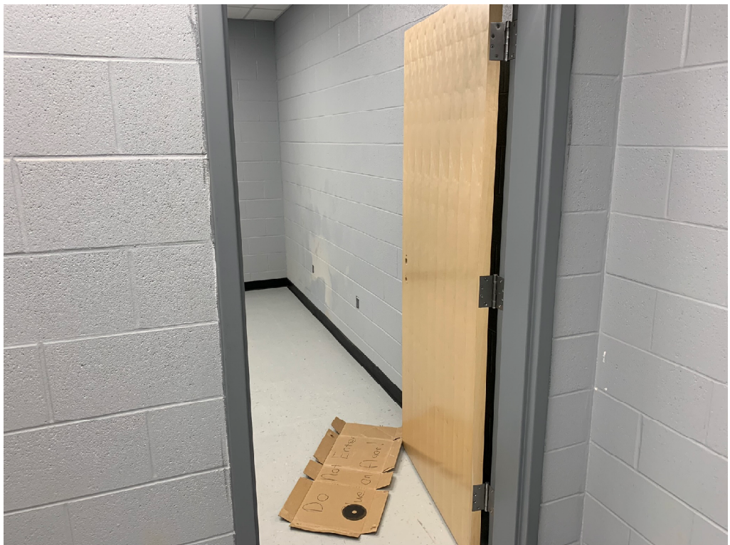
Figure 10 – Interior Door Panels Installed