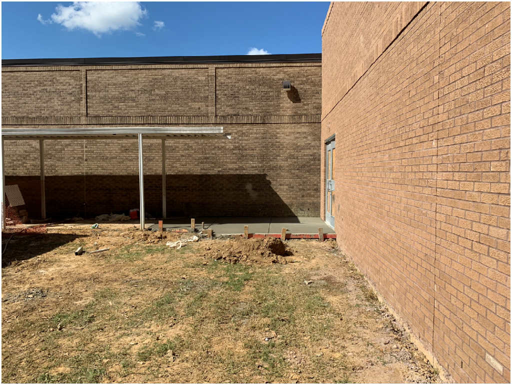
Figure 6 – Sidewalk Install