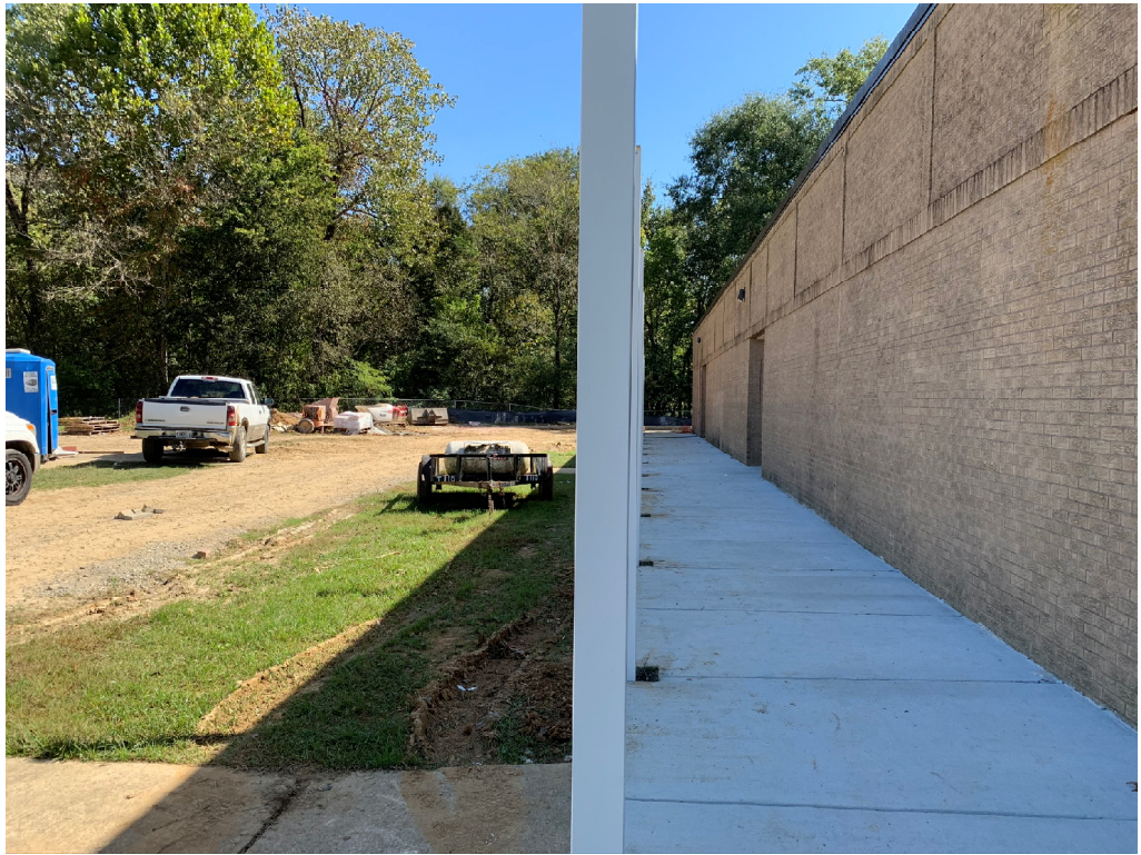
Figure 1 – Awning Columns Set