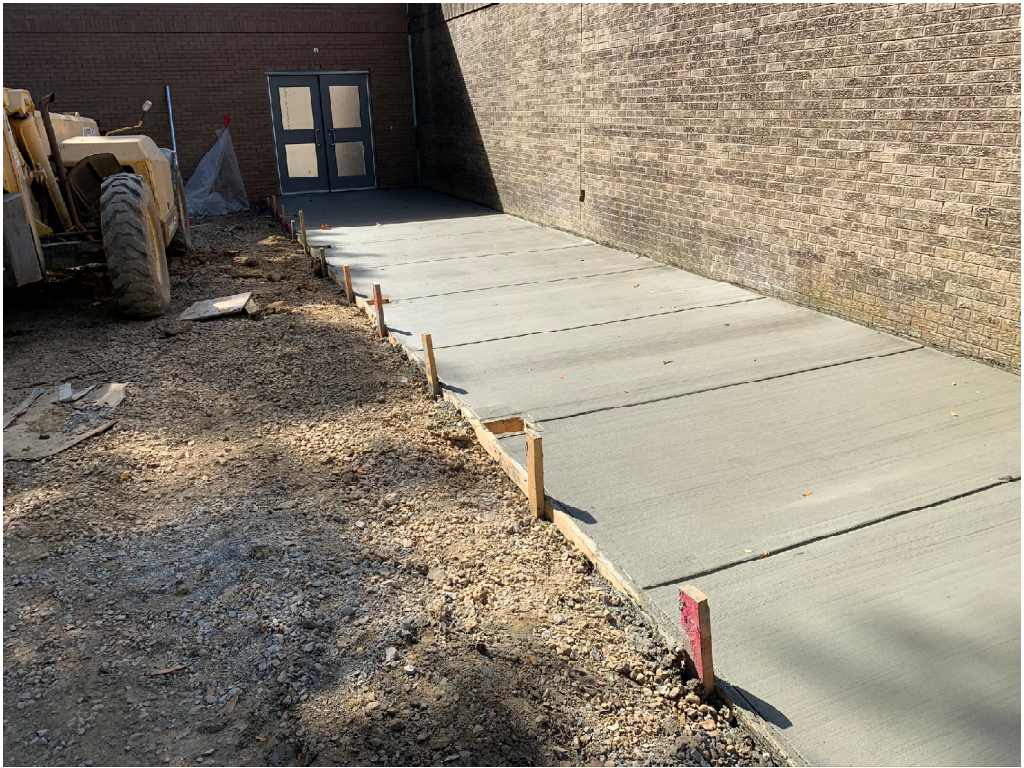
Figure 4 – Sidewalk Install