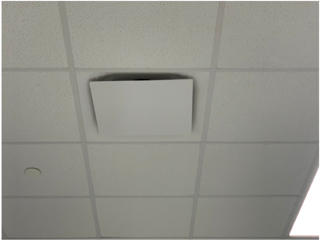
Figure 13 – Crooked Vent at Ceiling Requires Correction