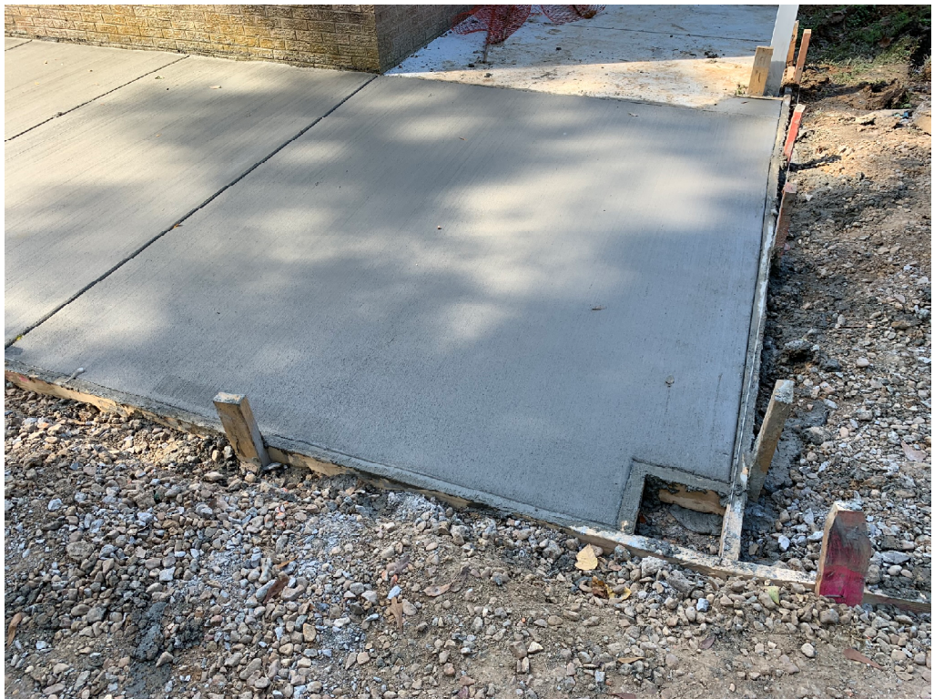
Figure 2 – Sidewalk Install