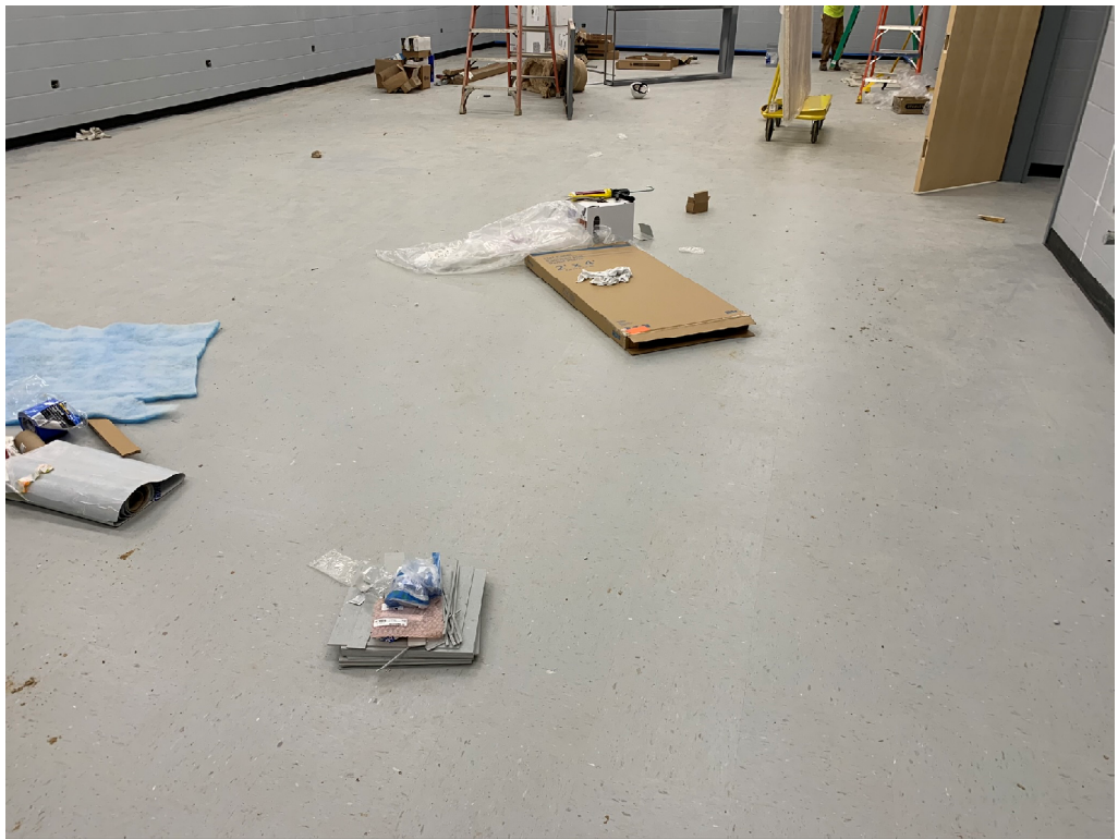
Figure 11 – VCT Flooring Installed