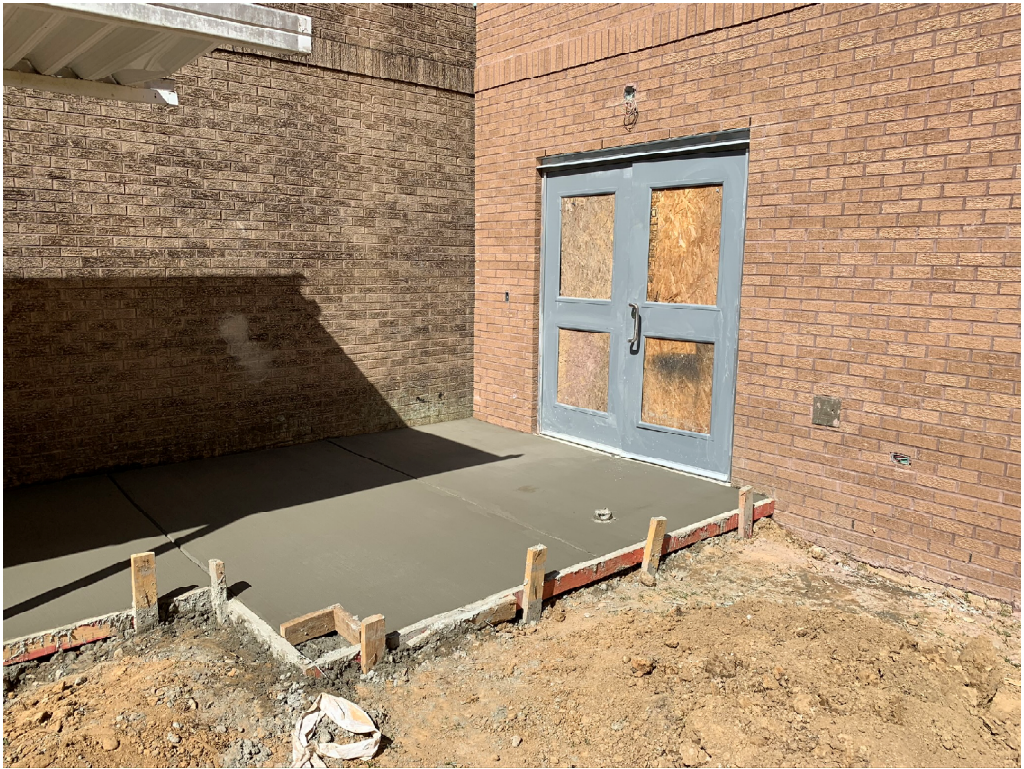
Figure 5 – Sidewalk Install