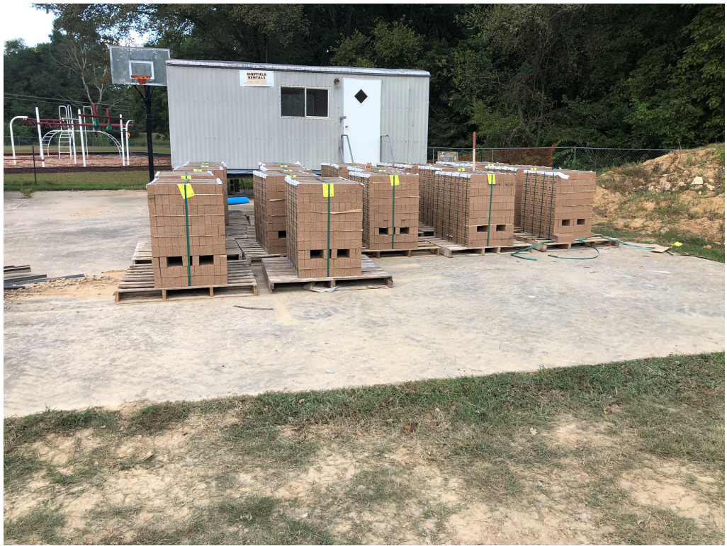
Figure 1 – Brick On Site