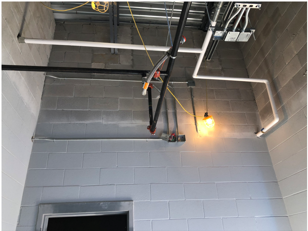
Figure 2 – Continued Above Ceiling Work