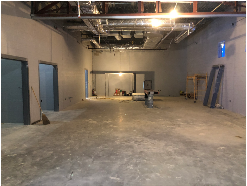
Figure 3 – Interior Addition