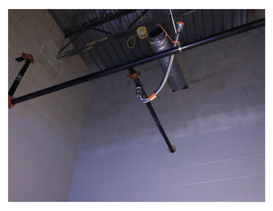
Figure 4 – Sprinkler Pipes Installed