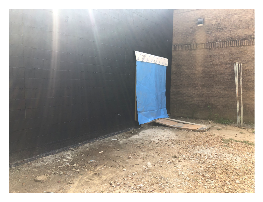
Figure 1 – Coverings Installed at Openings