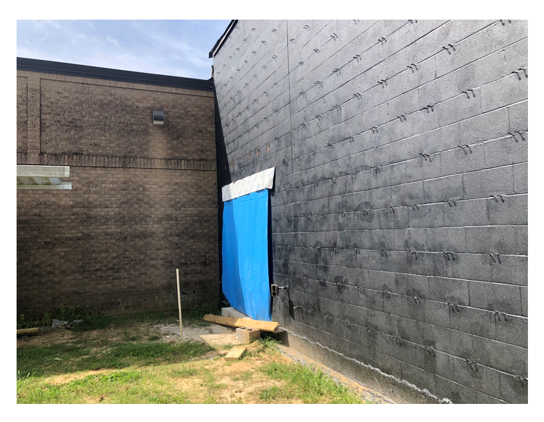
Figure 3 – Coverings Installed at Openings