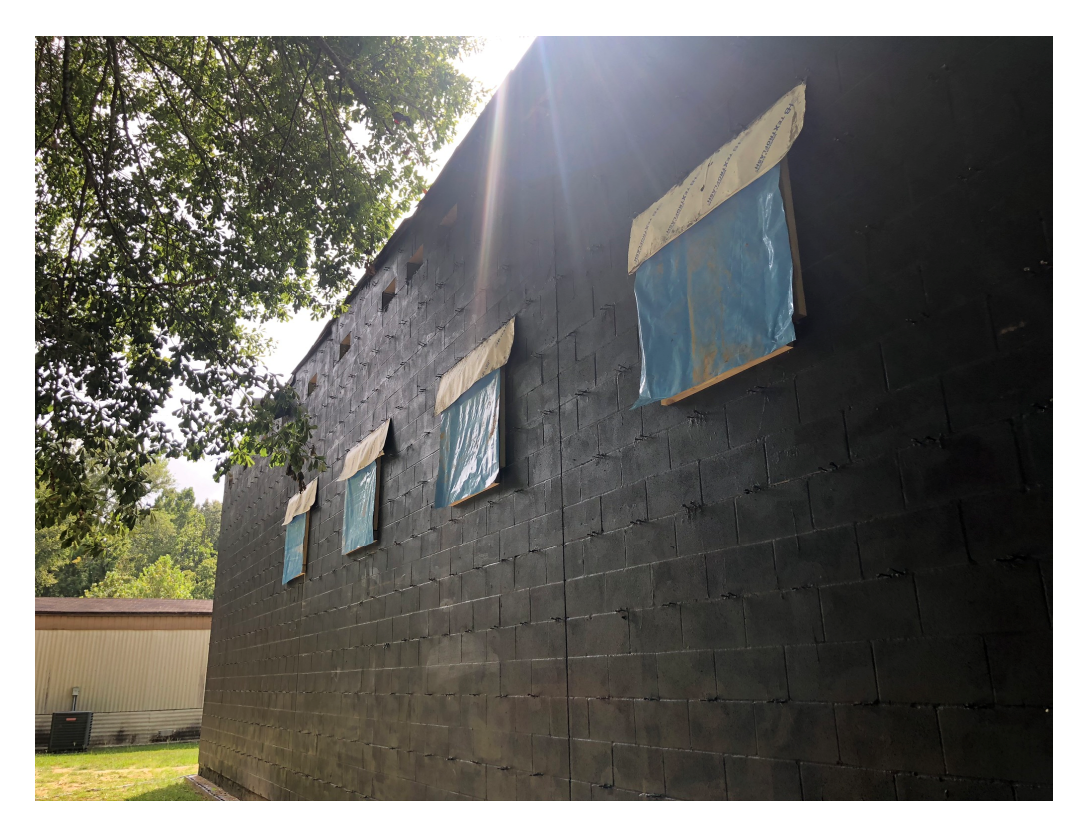
Figure 2 – Coverings Installed at Openings