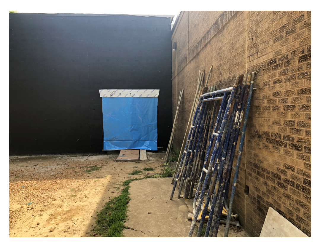
Figure 6 – Mason's Scaffold On Site; Brick to be delivered within the next week