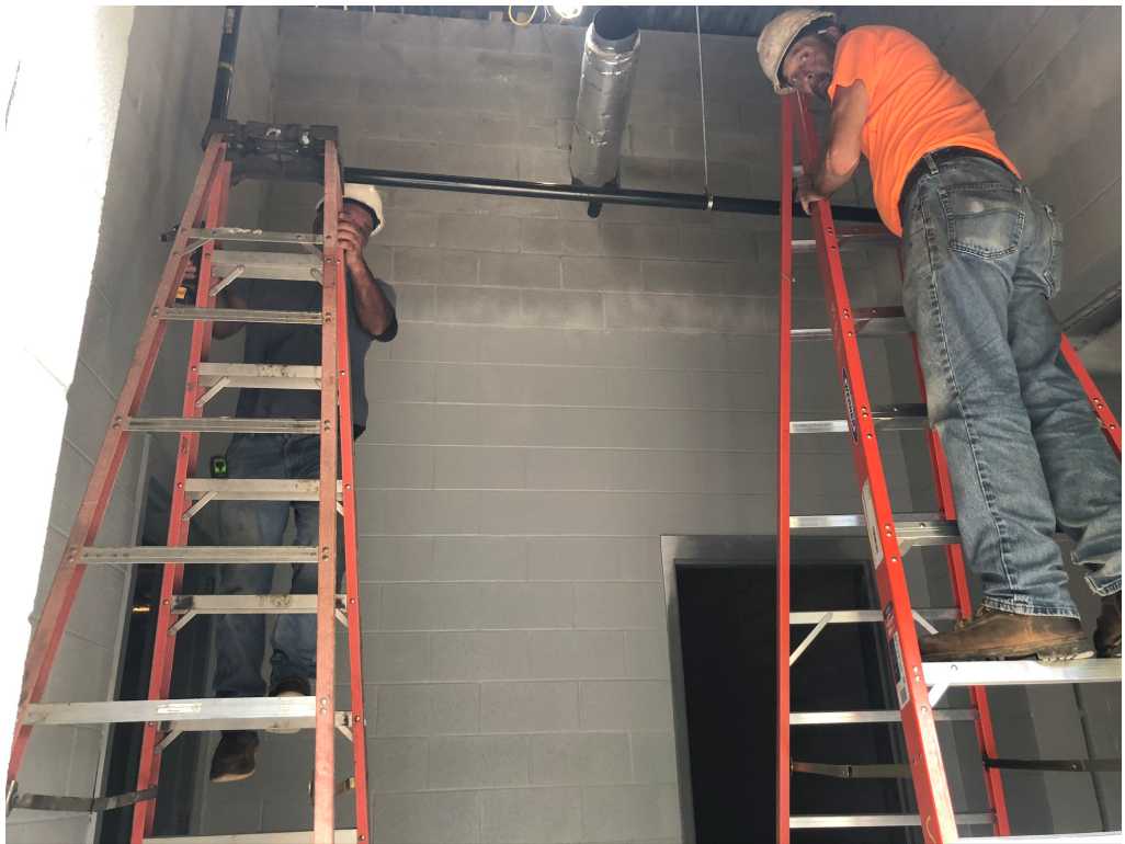
Figure 2 – Fitters Hanging Sprinkler Pipe