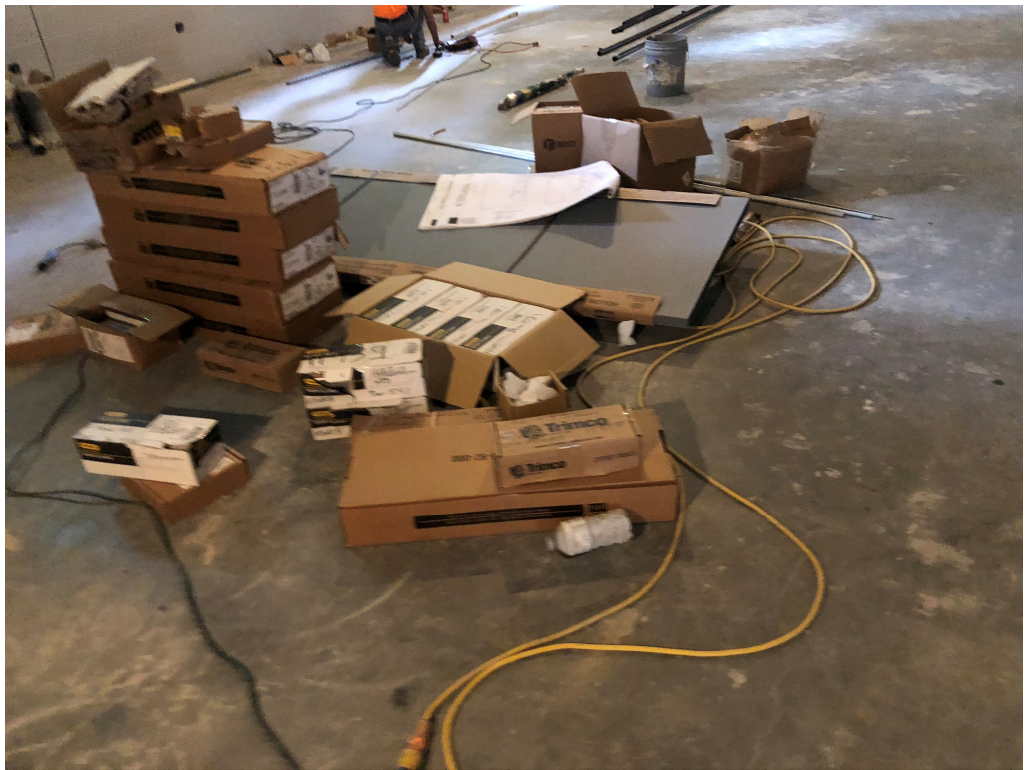
Figure 4 – Hardware Stored On Site