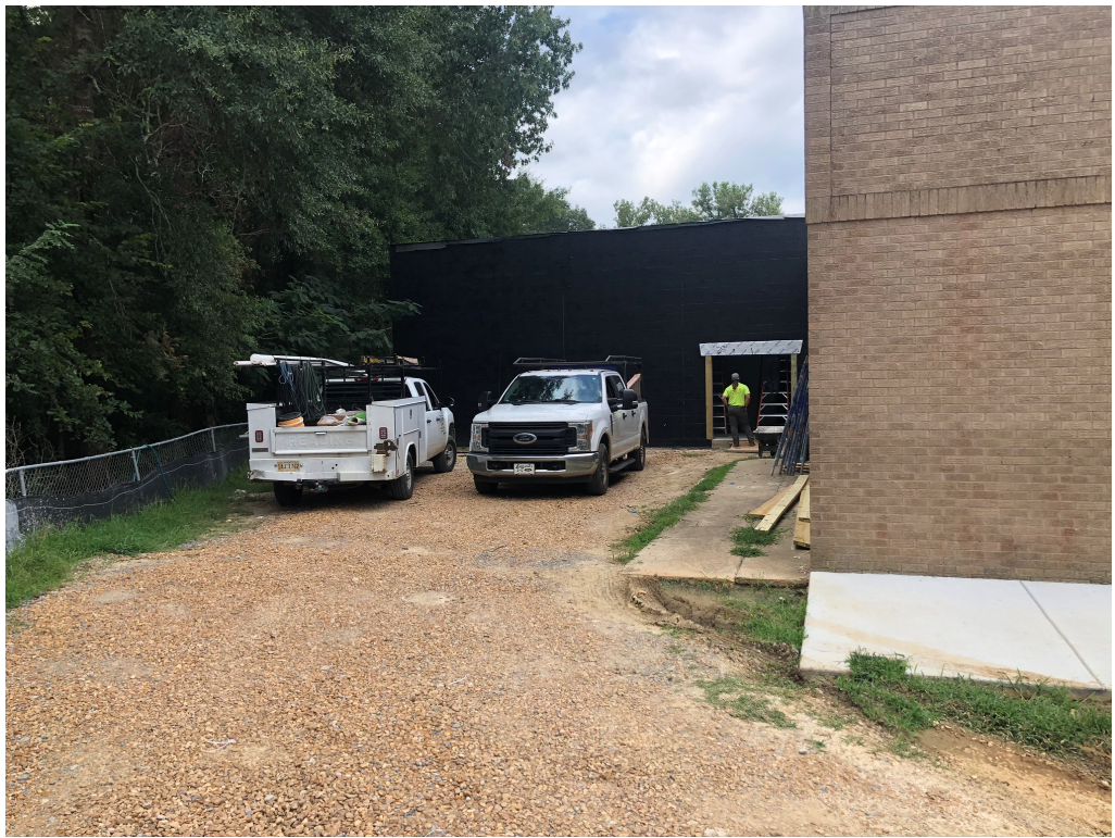
Figure 1 – Pipe Fitters On Site