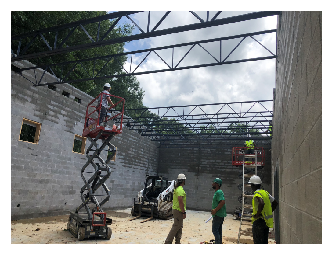
Figure 4 – Truss Installation