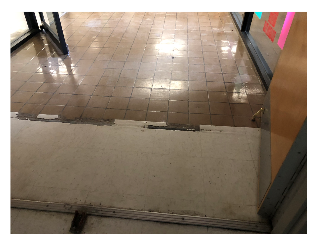
Figure 2 – VCT to be removed to threshold and ceramic tiled overlaid with new VCT