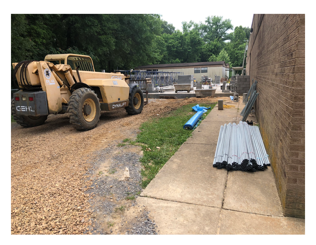
Figure 1 – Location at Addition