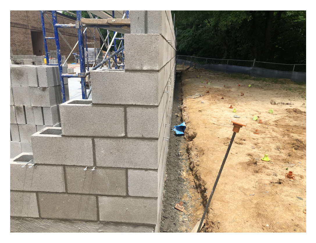
Figure 4 – Rear Wall at Addition