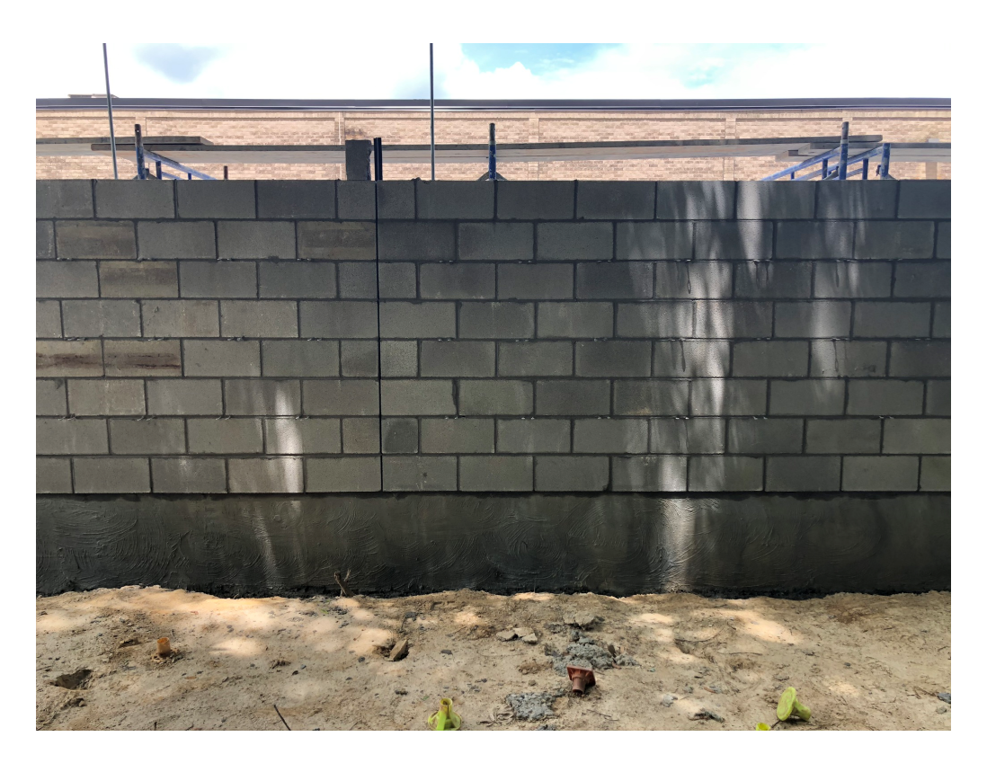
Figure 7 – Rear Wall Assembly