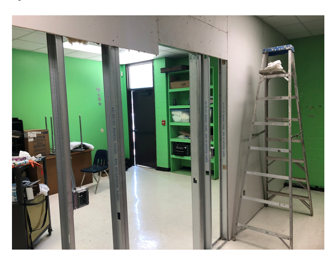
Figure 10 – New Wall at Room 153