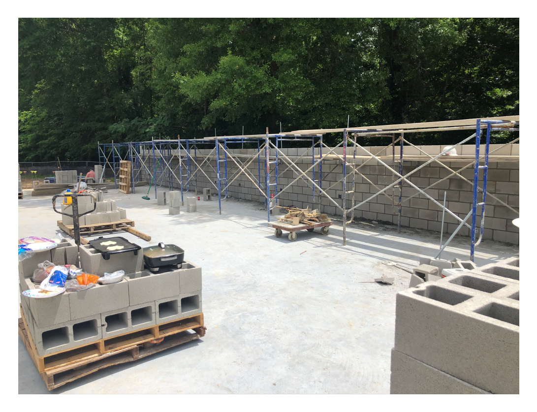
Figure 8 – CMU Work Ongoing