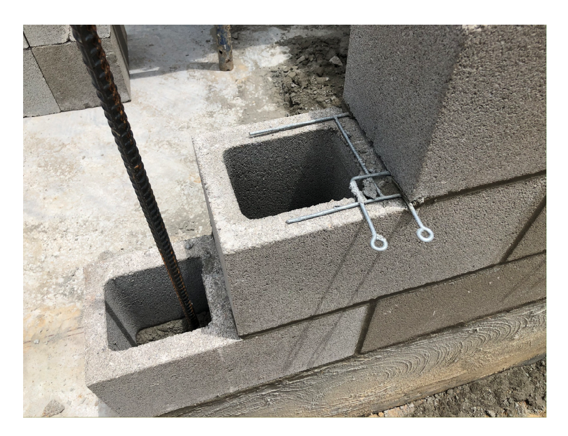
Figure 5 – Detail at CMU Construction