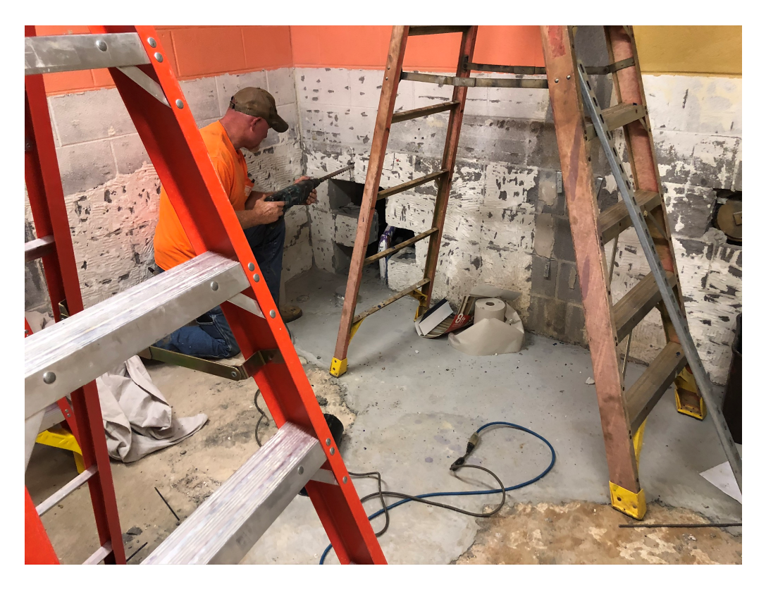
Figure 12 – Plumbing Structure Install