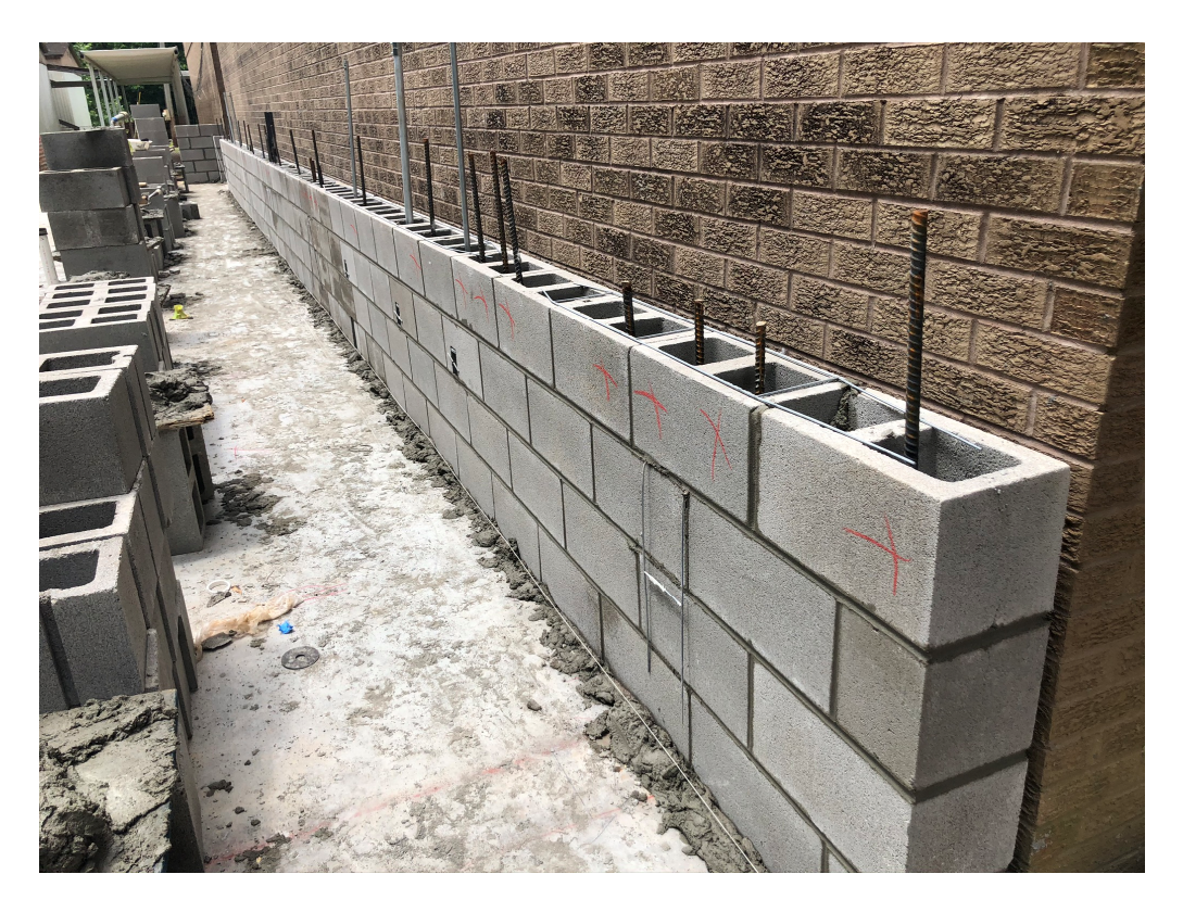
Figure 3 – New Bearing Wall Construction Ongoing