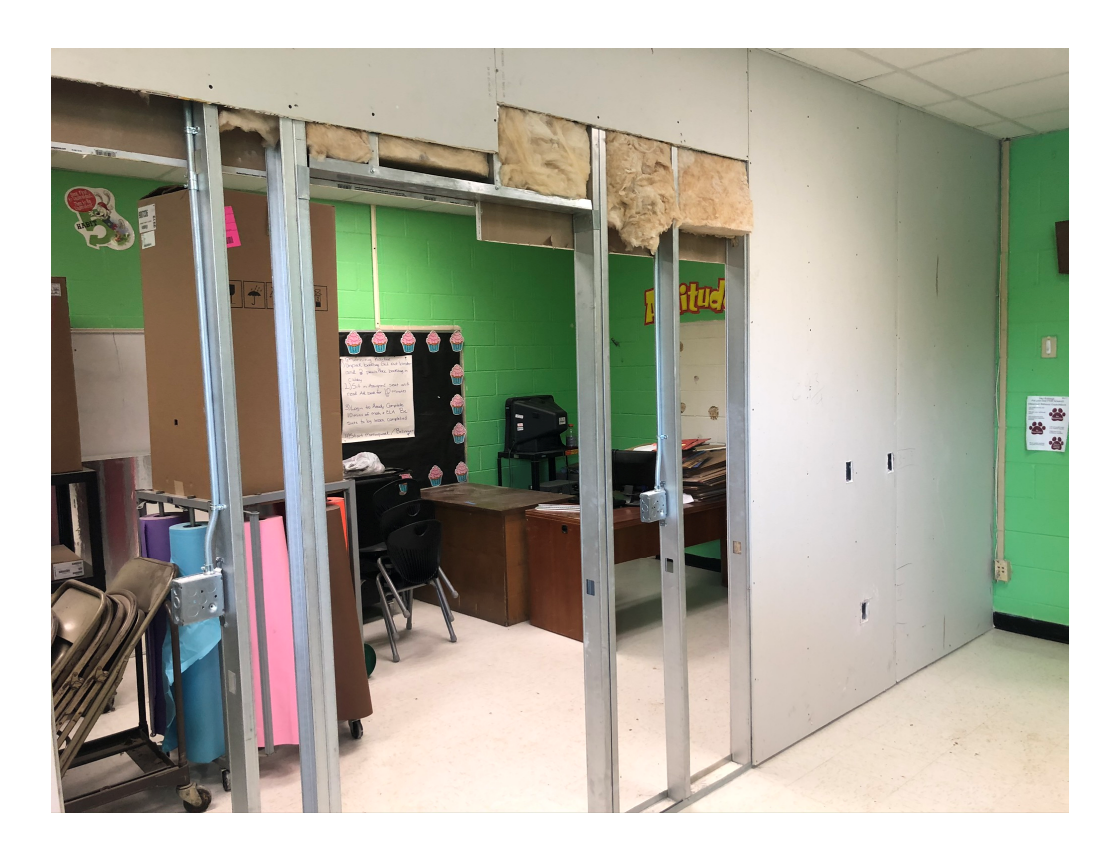
Figure 9 – New Wall at Room 153