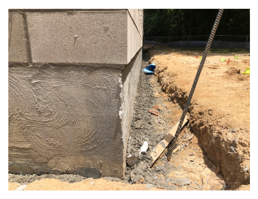
Figure 6 – CMU Wall Offset from Foundation (SDG: Acceptable?)