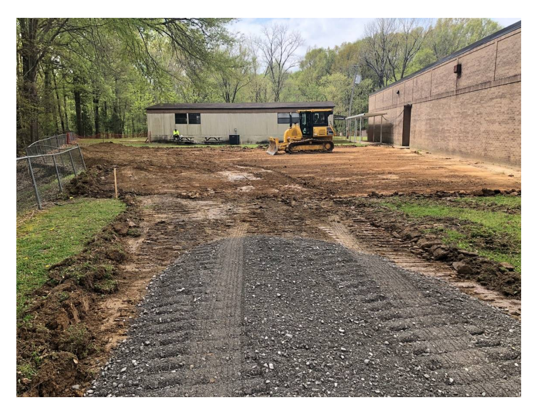
Figure 2 – Pad Prep for Addition