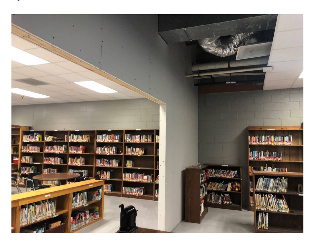
Figure 4 – Steam Lab Dividing Wall Progress