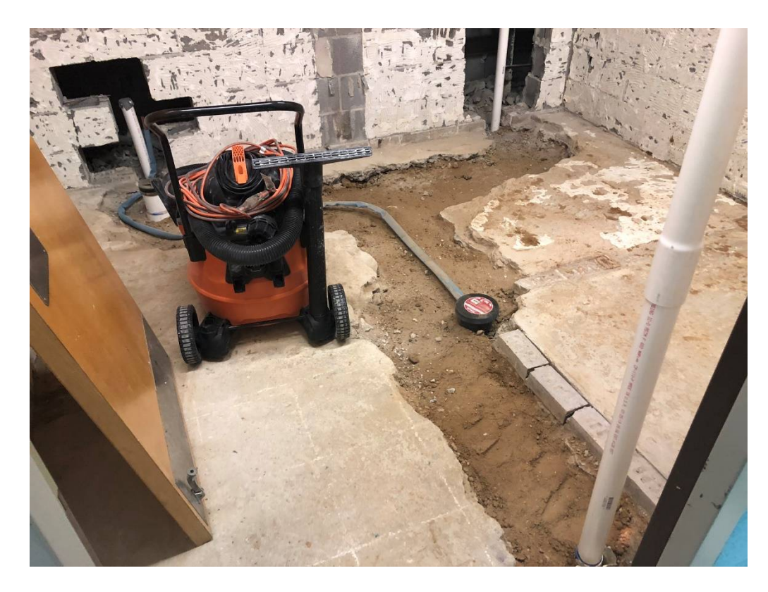
Figure 3 – ADA Bathroom