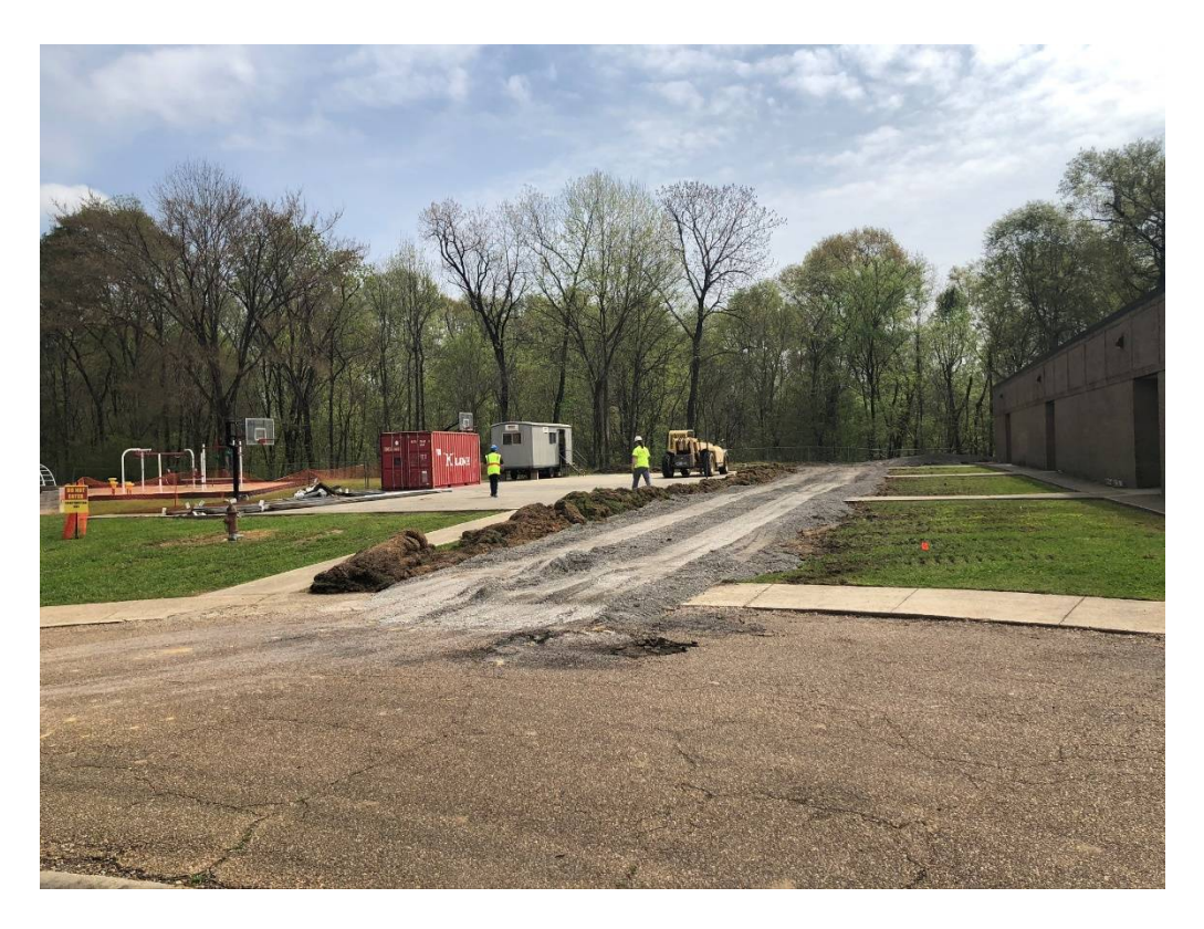
Figure 1 – Construction Drive for Addition Work