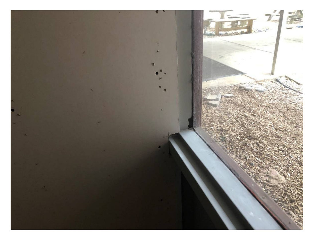
Figure 6 – Drywall Bead Need at Gypsum End