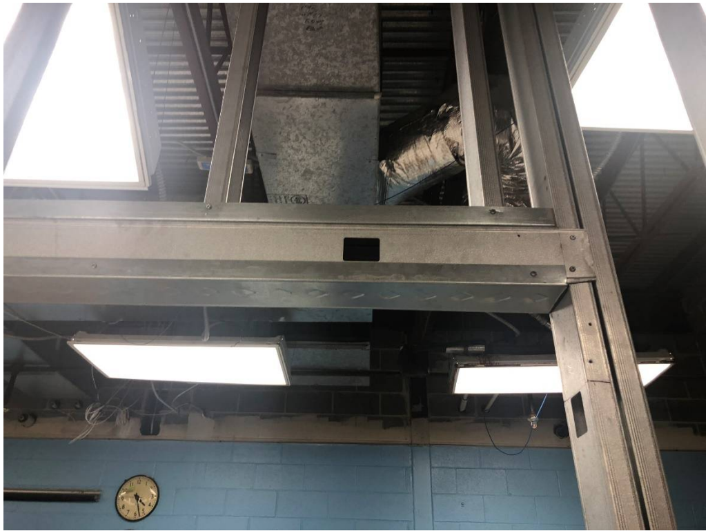
Figure 3 – Header at Framing