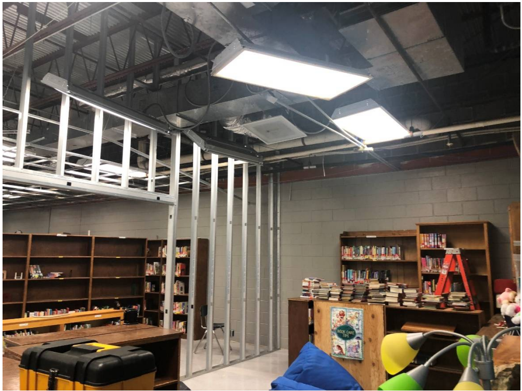
Figure 1 – Framed Wall Between Library and Steam Room