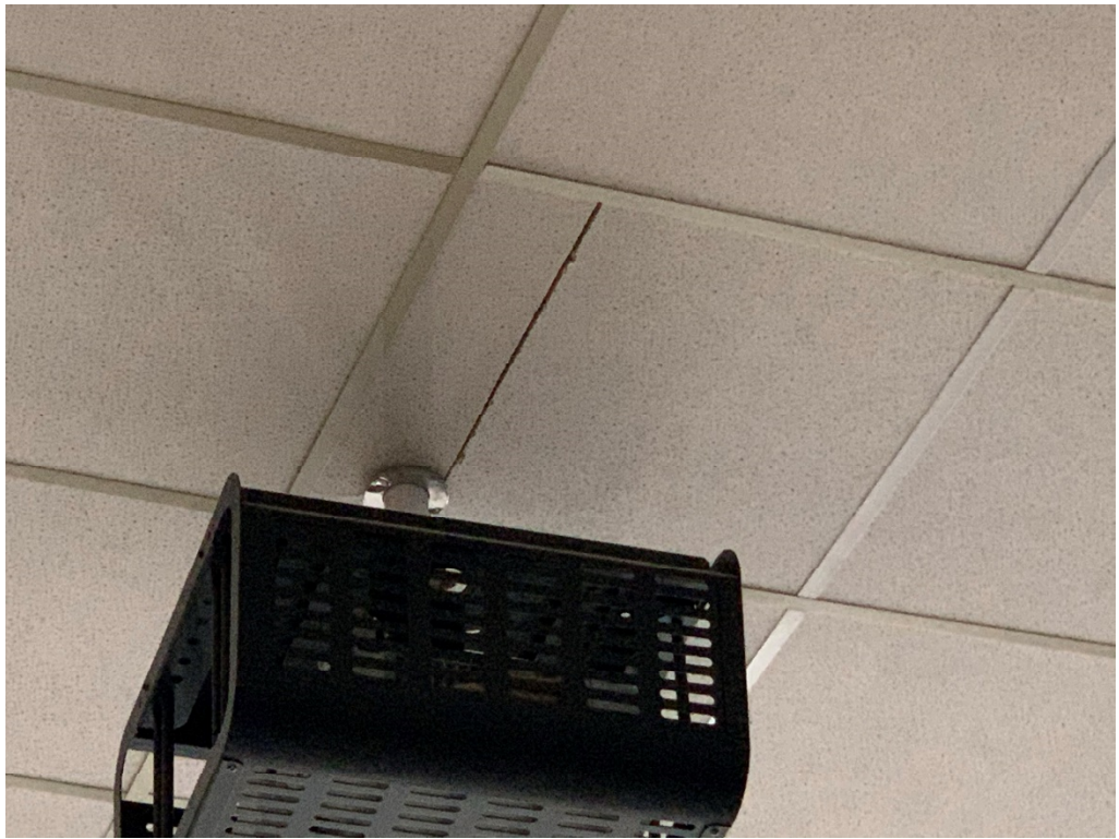
Figure 7 – Ceiling Grid at Auditorium needs a t bar here to cover cut lines