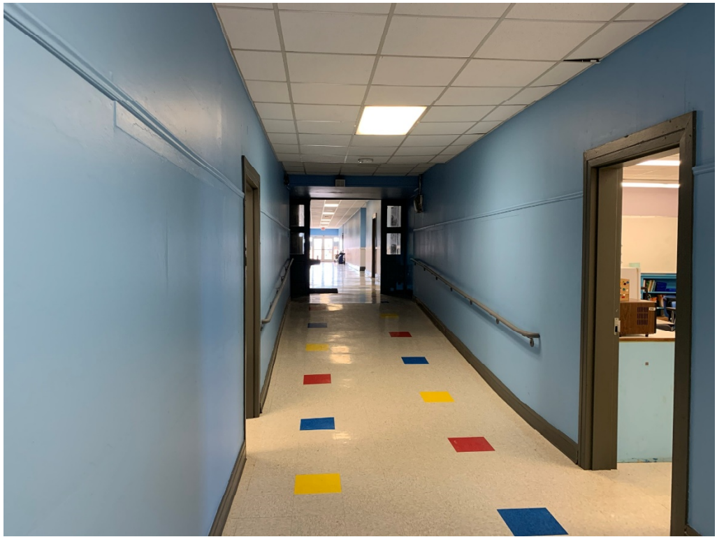
Figure 3 – Paint at Halls is nearing Completion