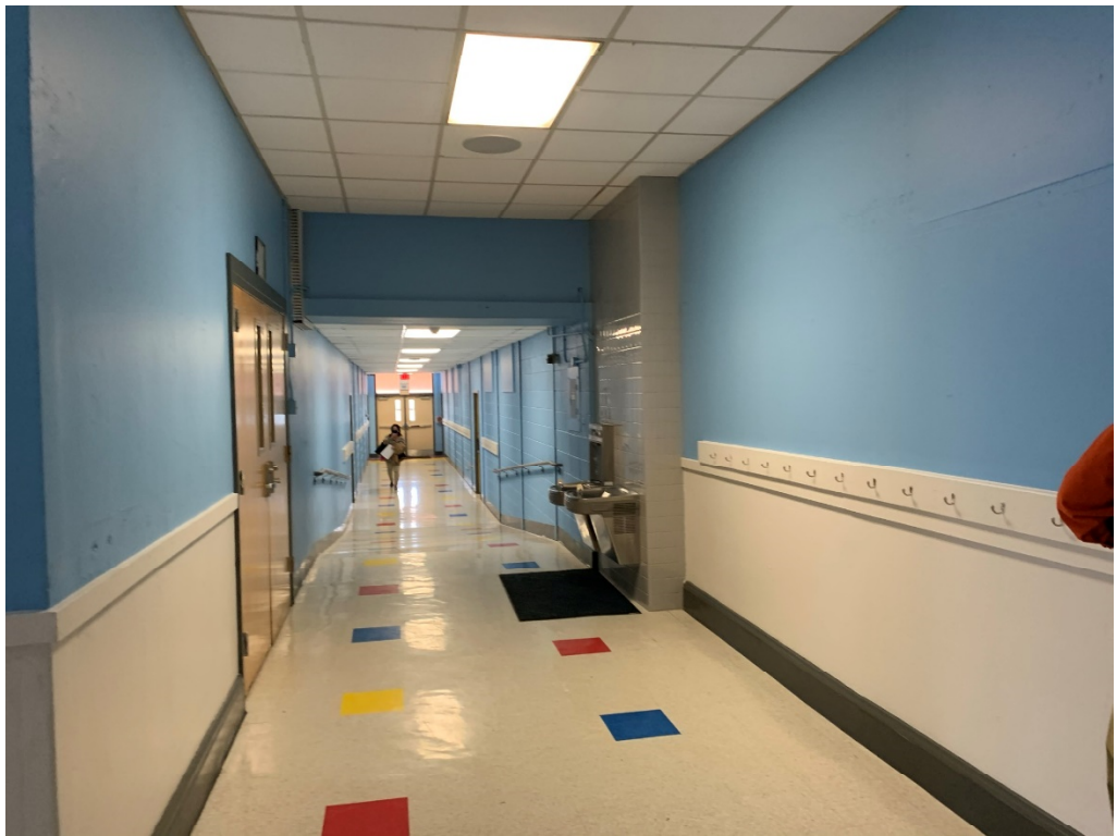
Figure 2 – Paint at Halls is nearing Completion