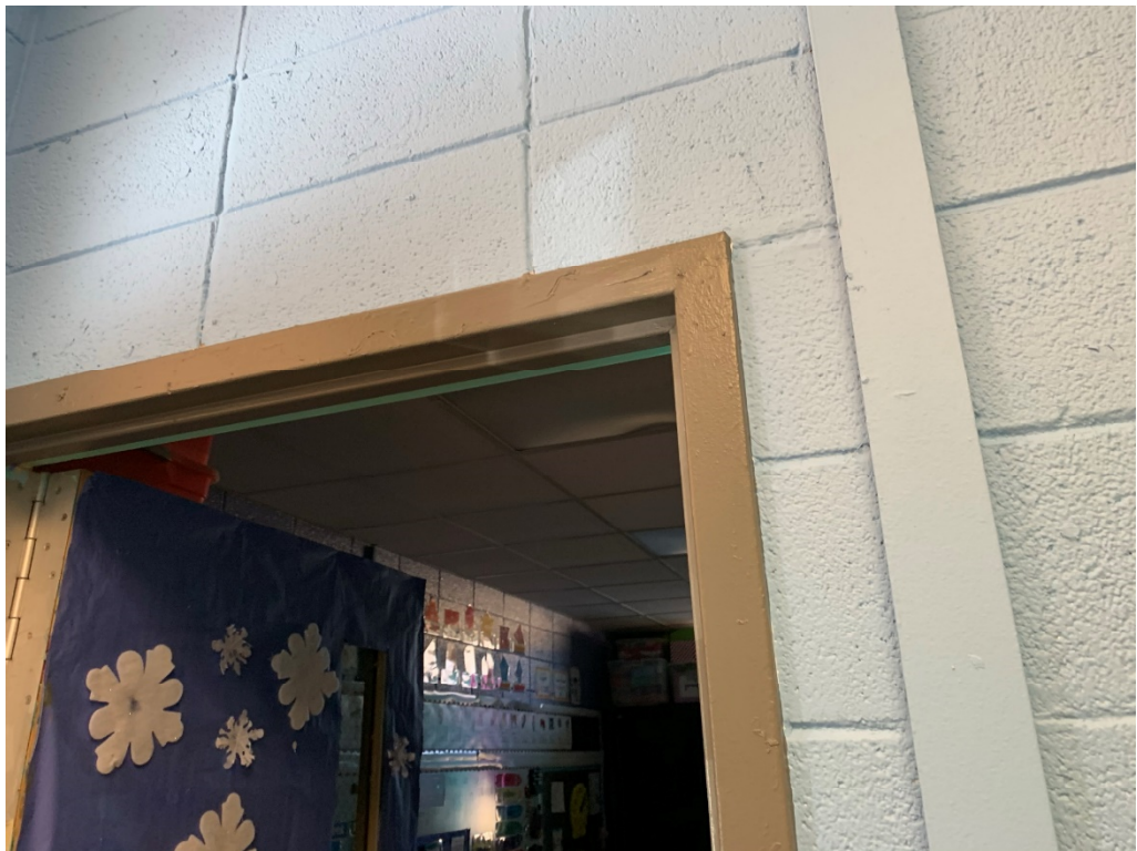
Figure 8 – Paint Ongoing