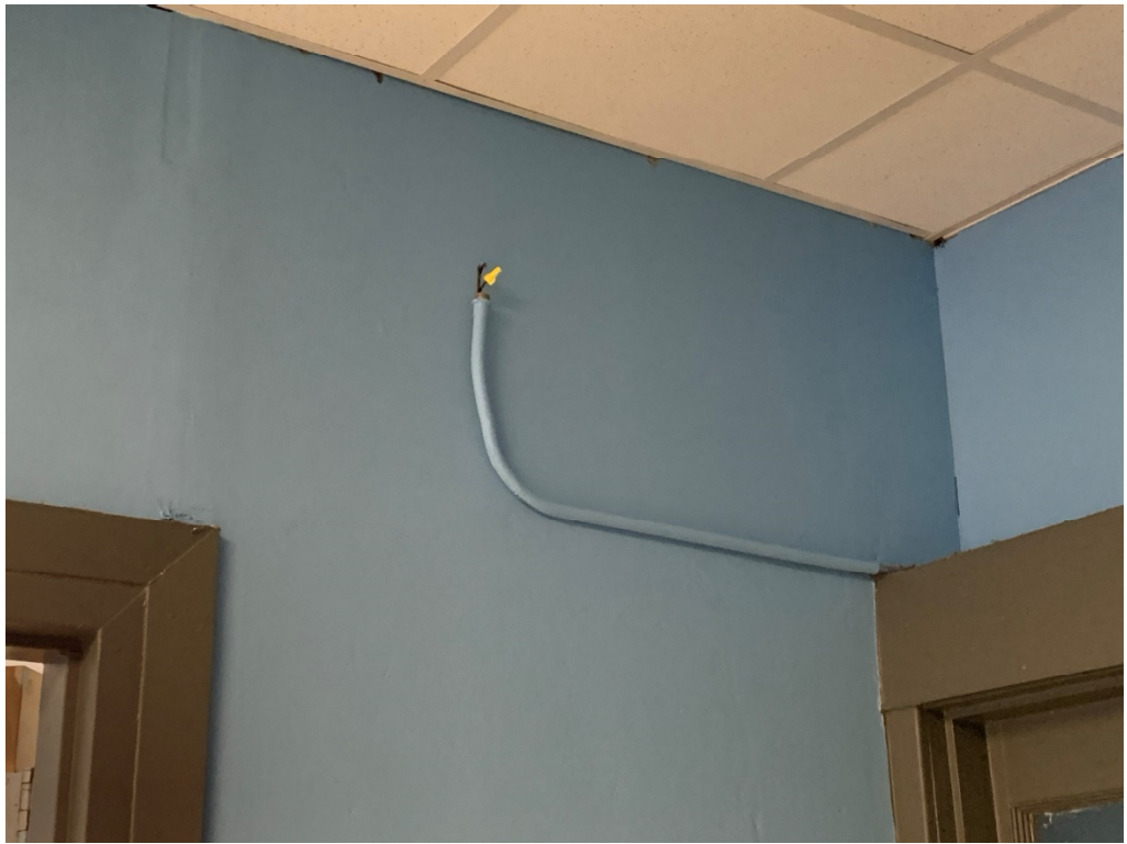
Figure 5 – Some Code Issues still present; wires should not be exposed