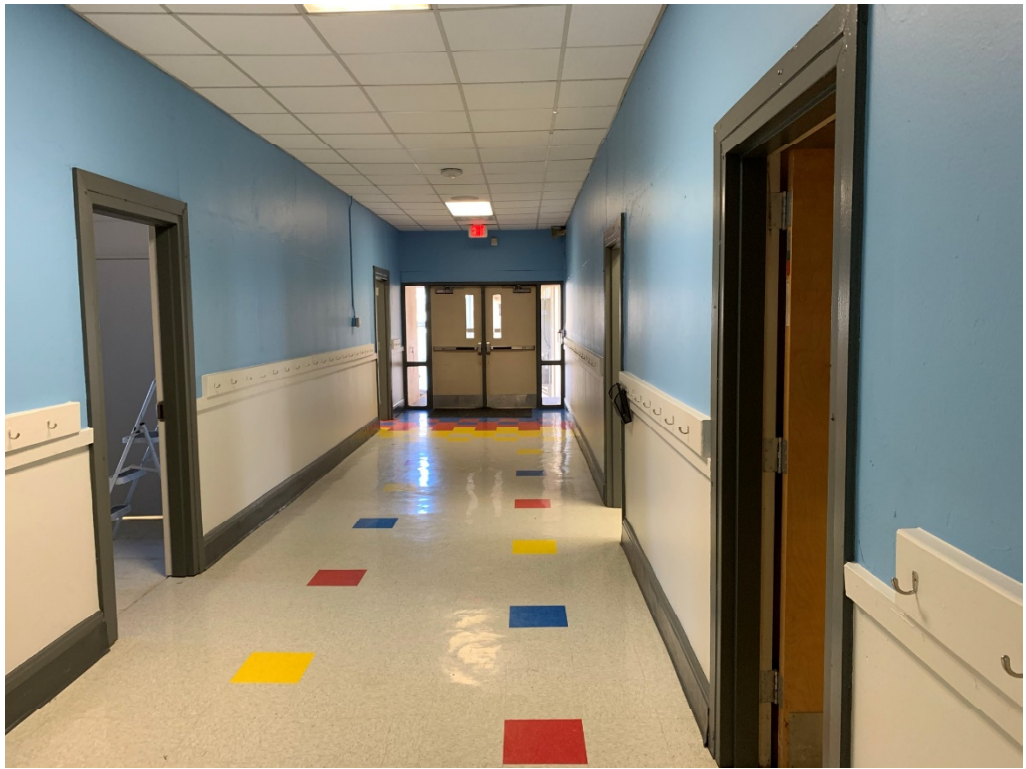
Figure 1 – Paint at Halls is nearing Completion