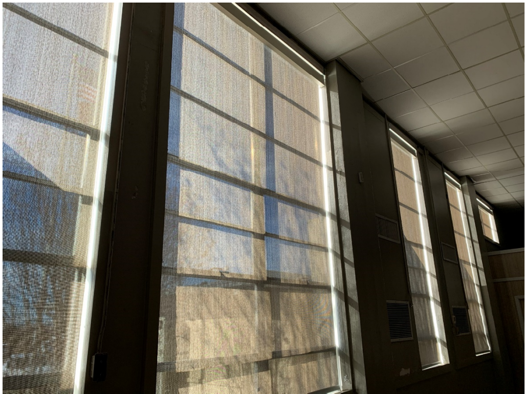
Figure 4 – Roller Shades Installed in Auditorium