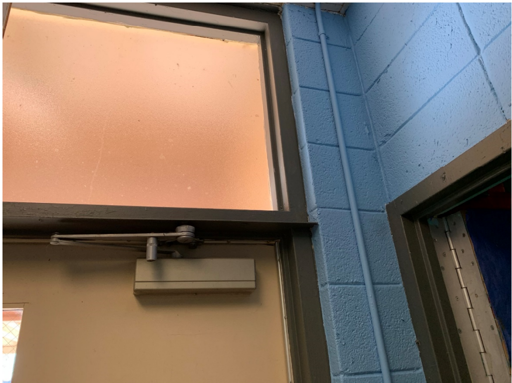
Figure 6 – Paint is nearing completion