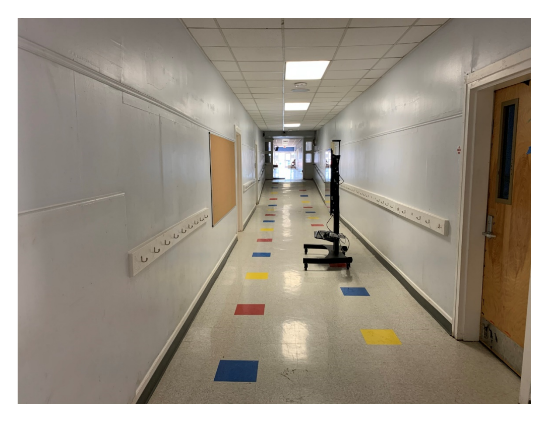
Figure 2 – Paint Prep at Halls