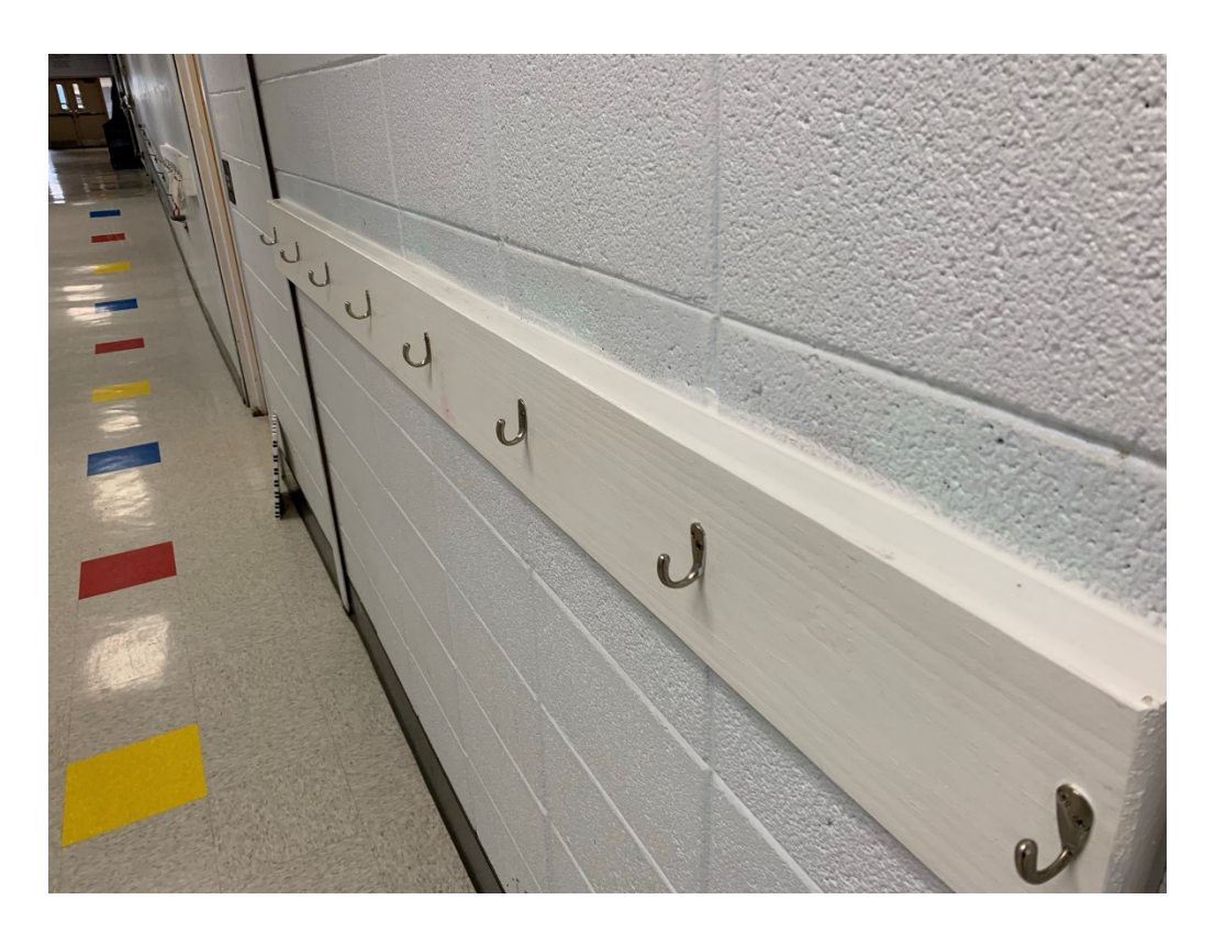
Figure 3 – Paint Prep at Halls