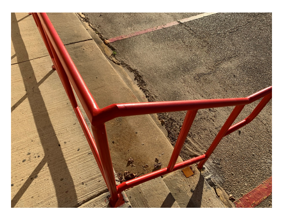
Figure 5 – Handrail paint is Ongoing