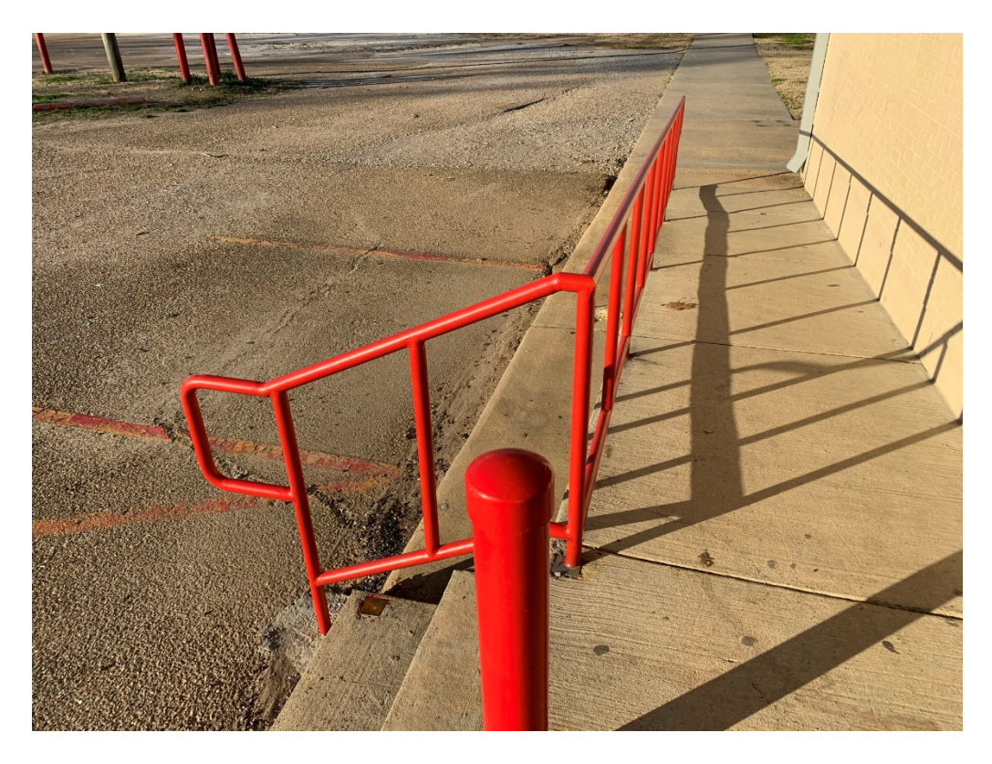
Figure 4 – Handrail paint is Ongoing