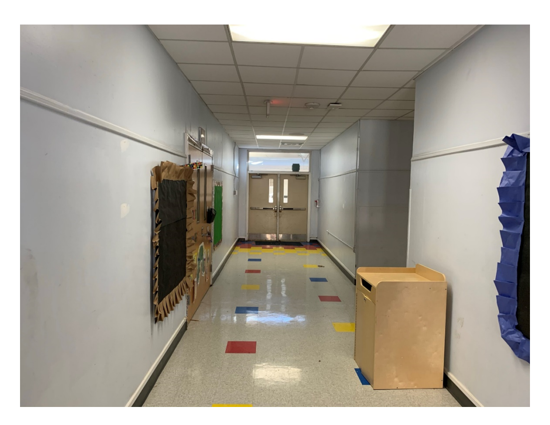
Figure 1 – Paint Prep at Halls