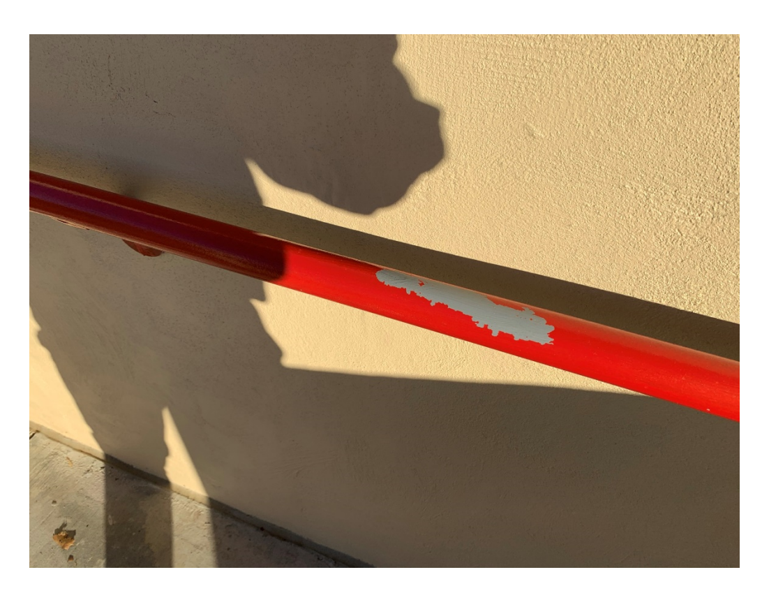
Figure 7 – Handrail paint is Ongoing