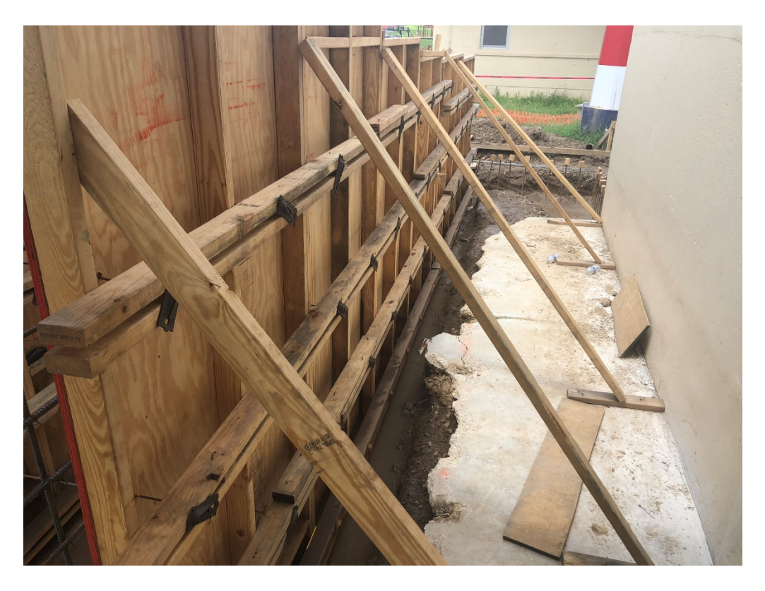
Figure 2 – Formwork Structure