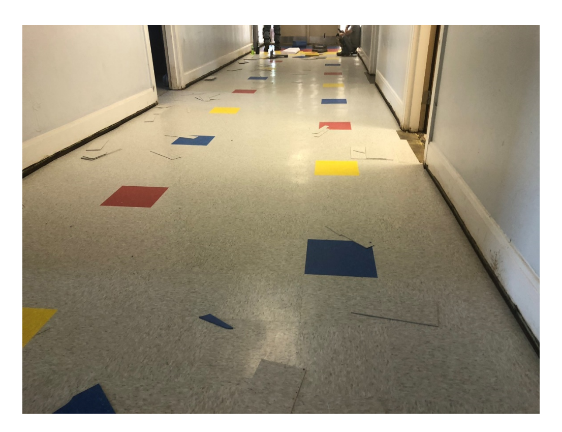
Figure 5 – VCT Flooring Installed