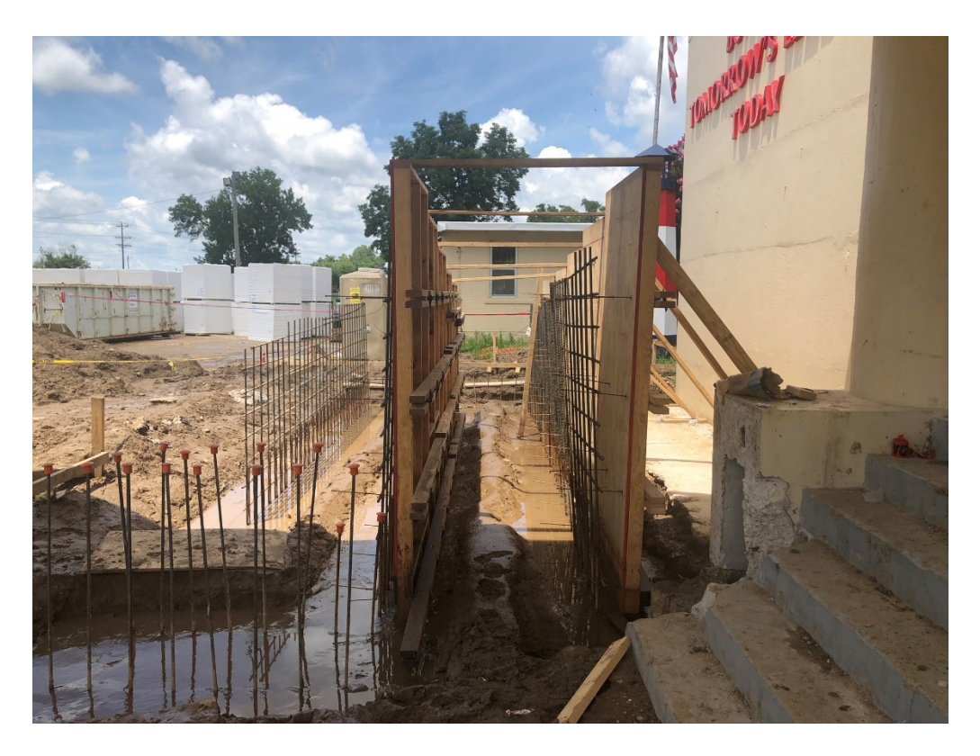
Figure 1 – Formwork Begun @ Ramp