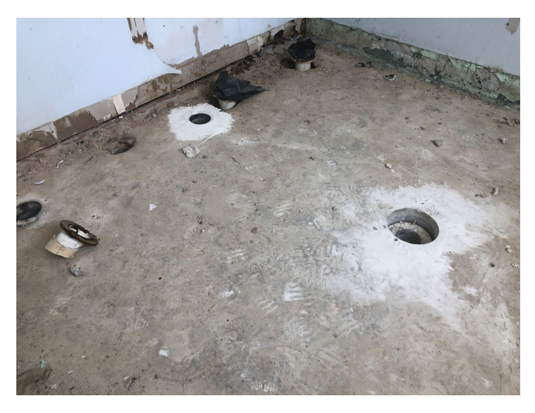
Figure 4 – Core drilling at Bathroom for new Drains