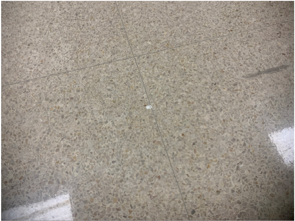
Figure 11 – Paint dripped down main hall below wax