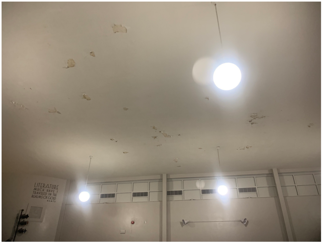
Figure 3 – Unfinished Ceiling