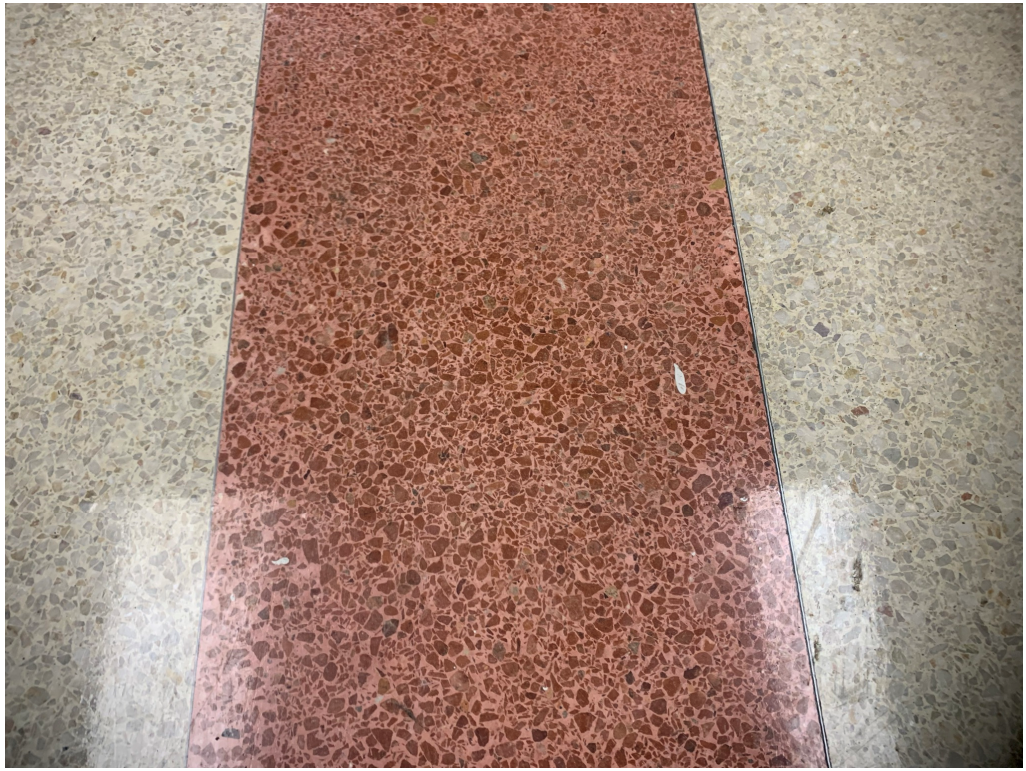
Figure 13 – Paint dripped down main hall below wax