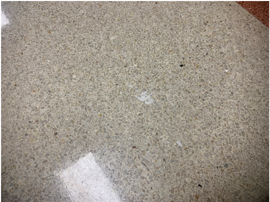
Figure 10 – Paint dripped down main hall below wax