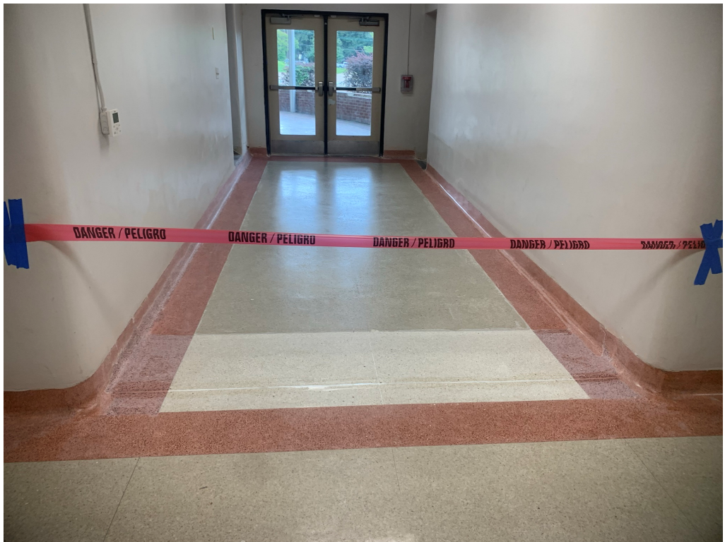
Figure 4 – Terrazzo repair is ongoing