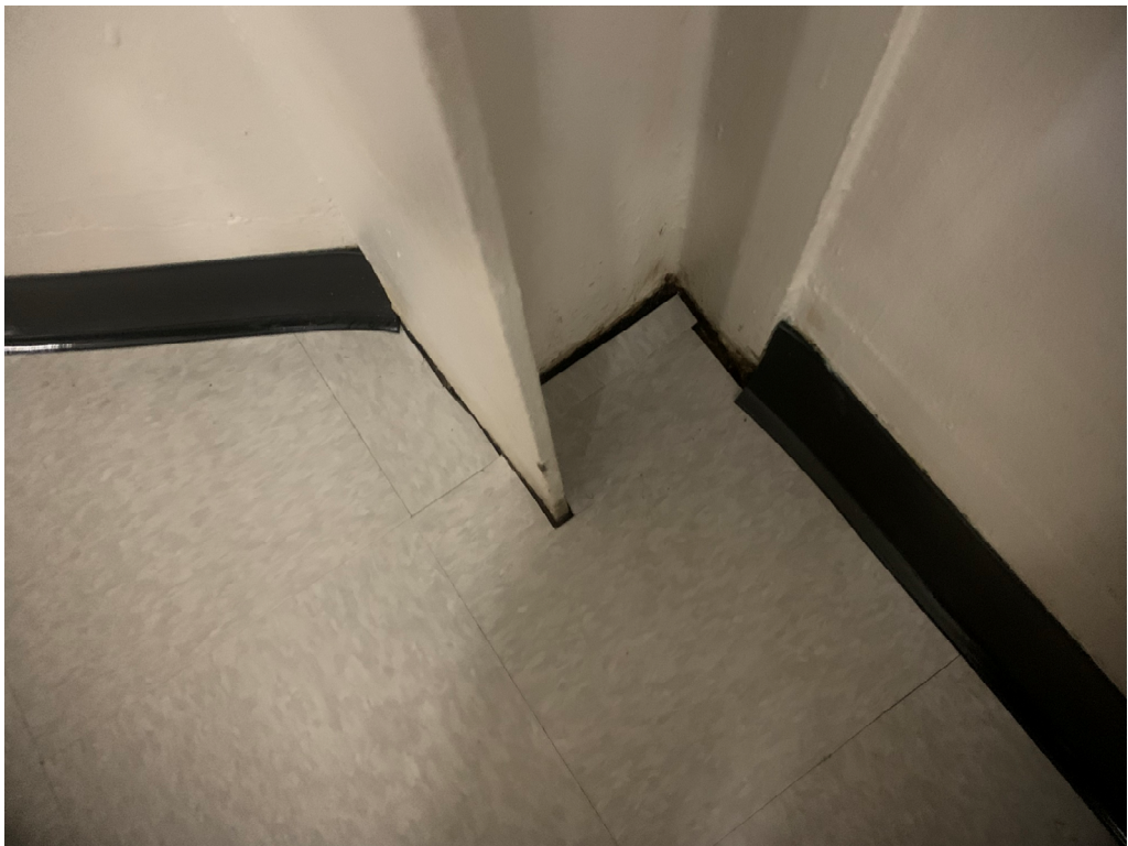
Figure 2 – Fill in around columns with similar color mastic for finished look