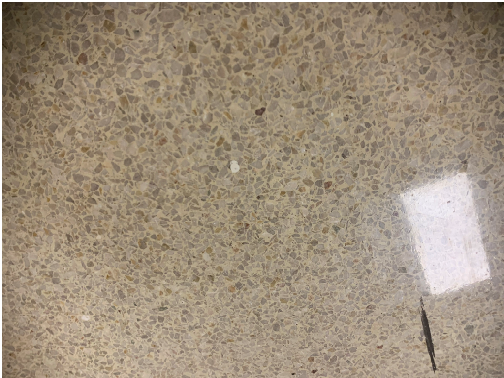
Figure 8 – Paint dripped down main hall below wax