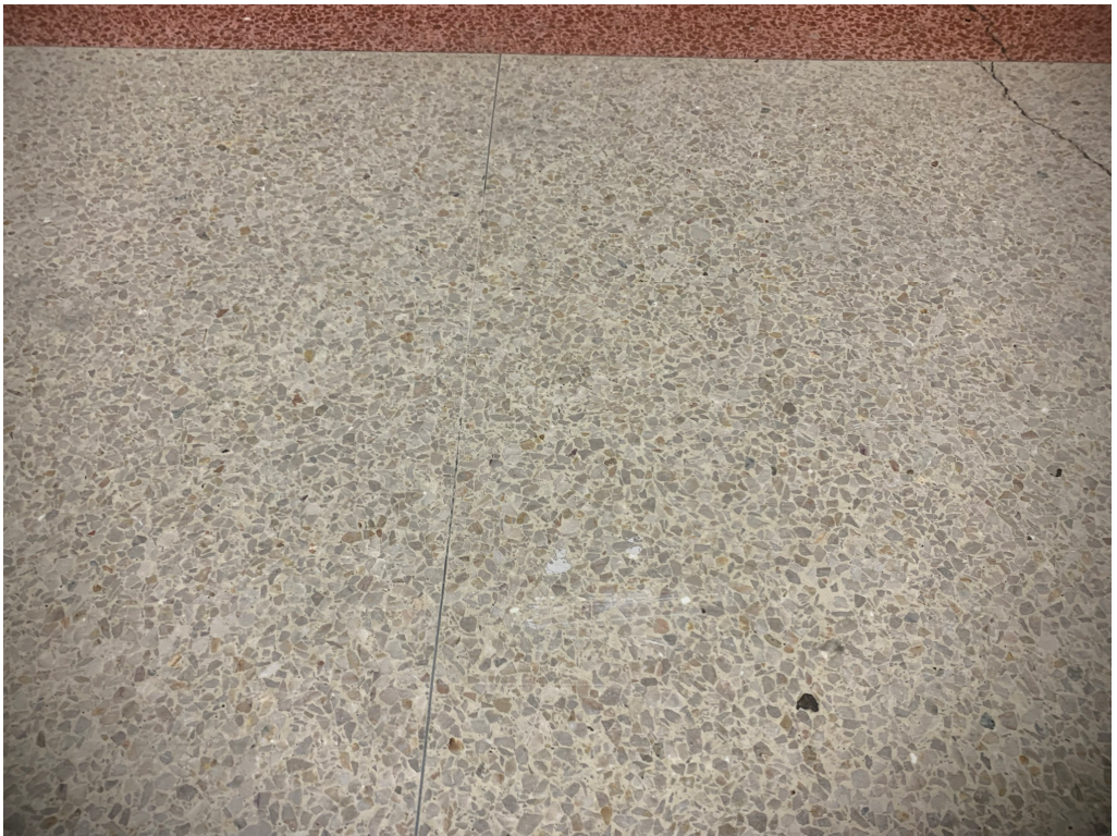
Figure 12 – Paint dripped down main hall below wax