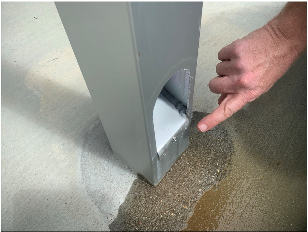
Figure 15 – Burrs at cut outs create a hazard for young children and should be rounded over