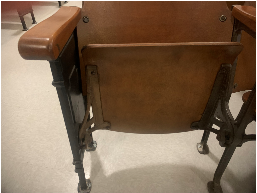
Figure 1 – End pieces at every chair are unfinished