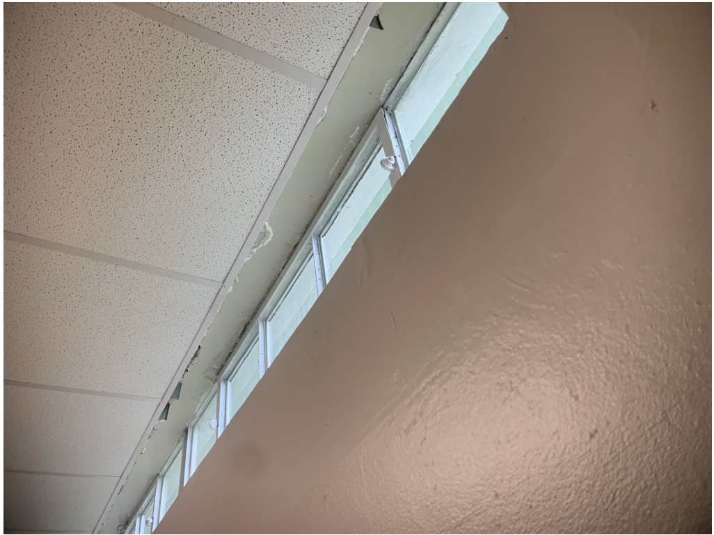
Figure 5 – Unfinished Ceiling