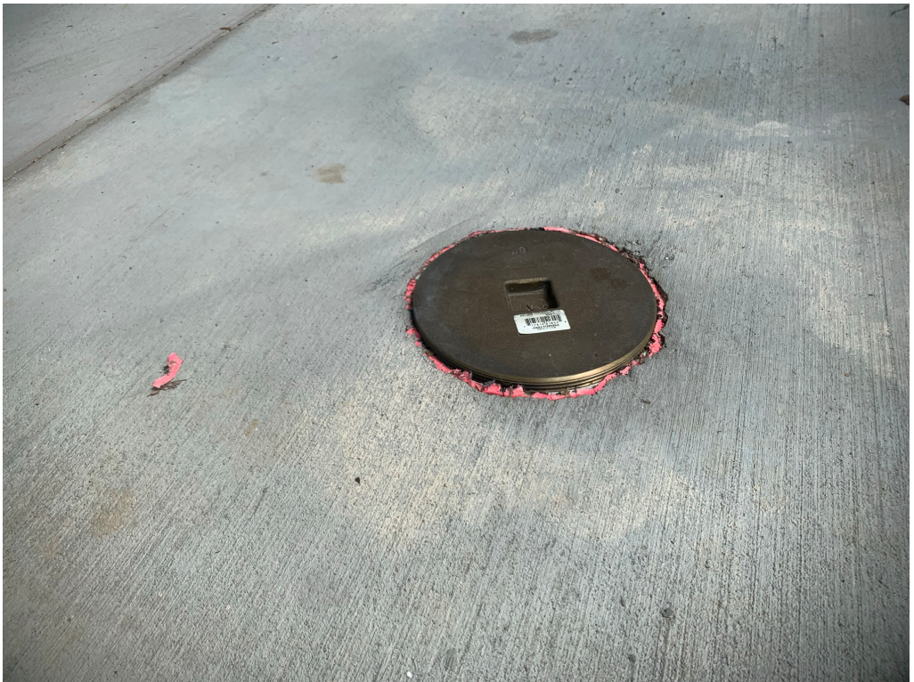
Figure 16 – Installation creates a trip hazard; reinstall flush with concrete