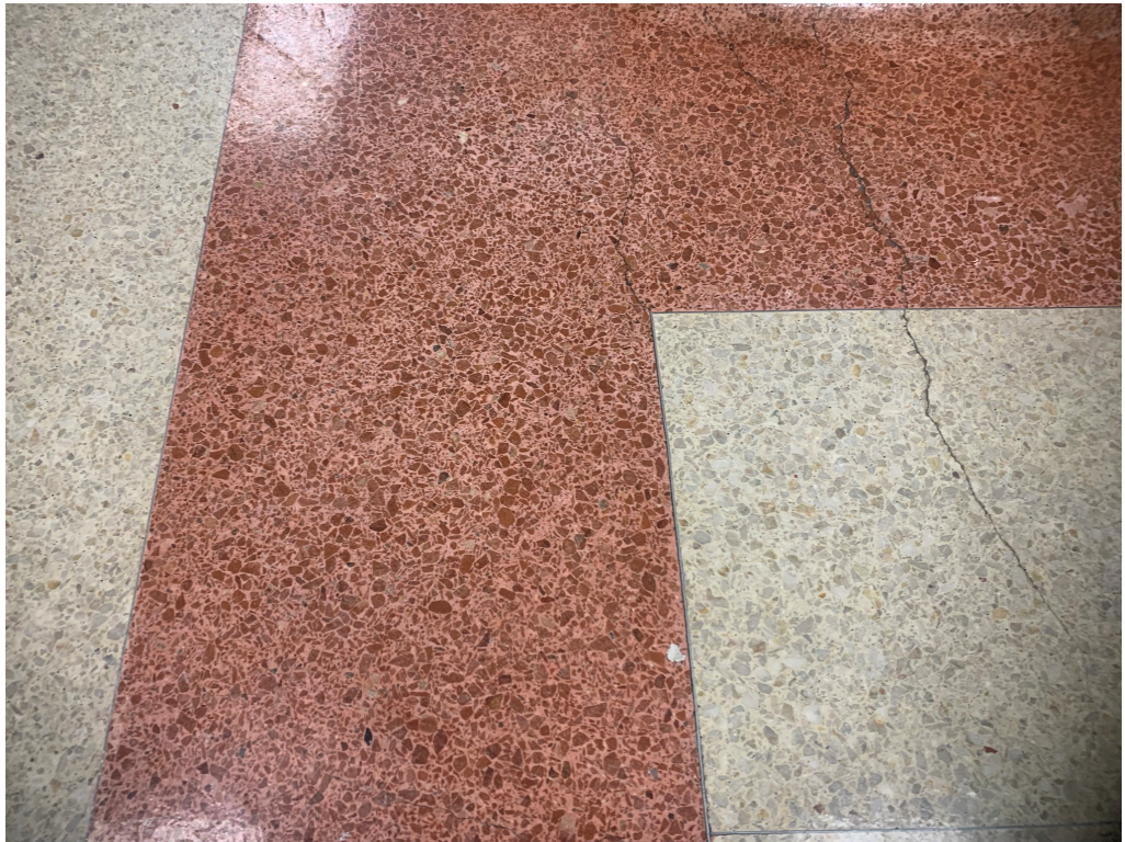
Figure 14 – Paint dripped down main hall below wax