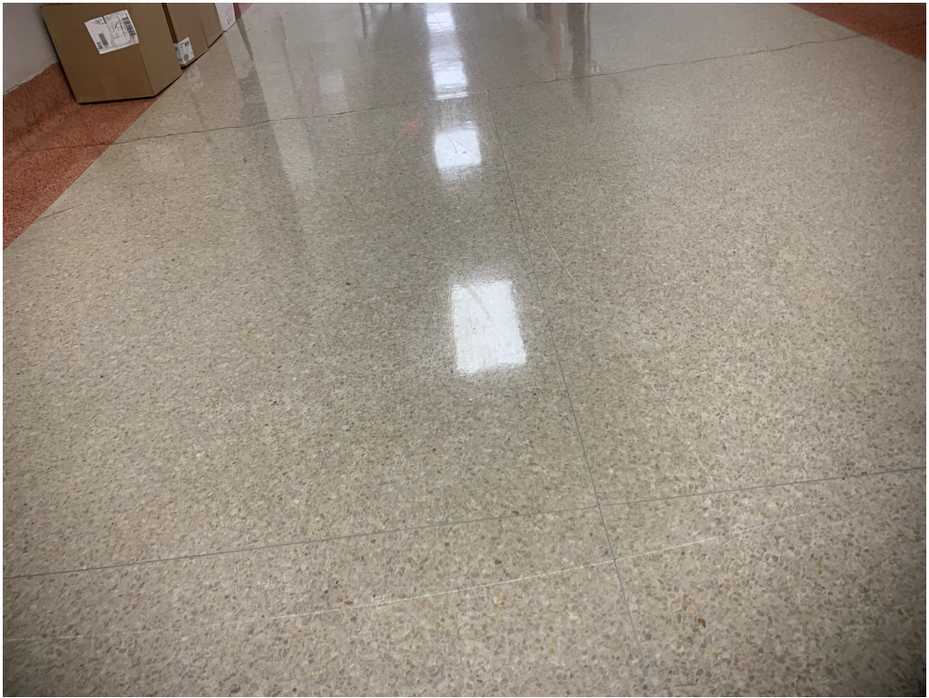
Figure 7 – Scarring below wax level from construction work needs to be buffed out