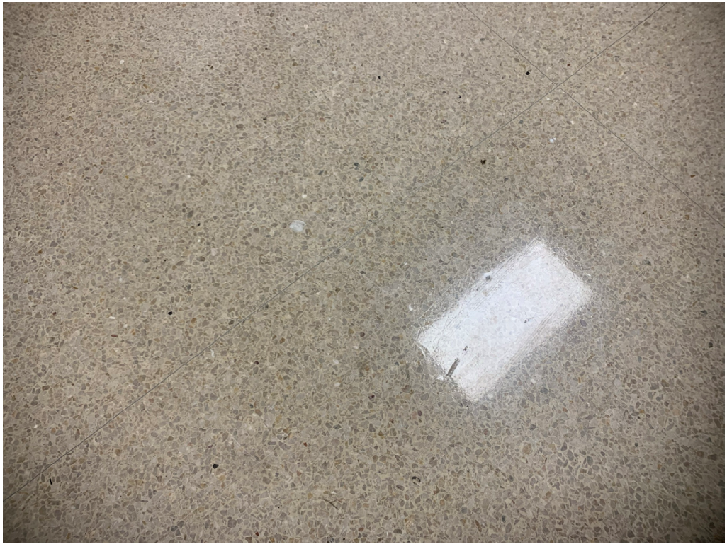
Figure 9 – Paint dripped down main hall below wax