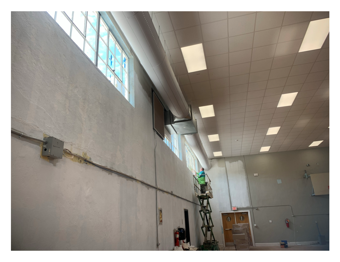
Figure 4 – Sock Duct installed at Playroom