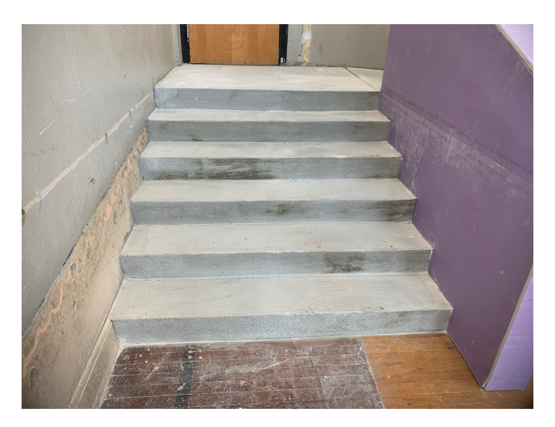
Figure 1 – Stairs at newly installed ADA ramp