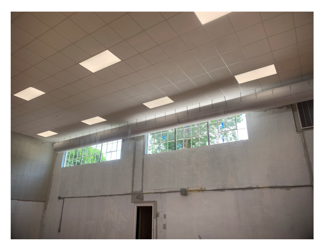
Figure 5 – Sock Duct installed at Playroom