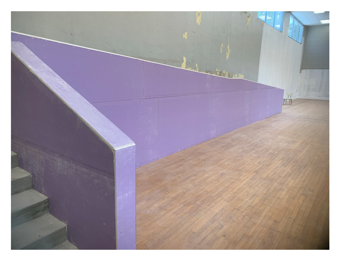
Figure 2 – Drywall installed at ADA ramp