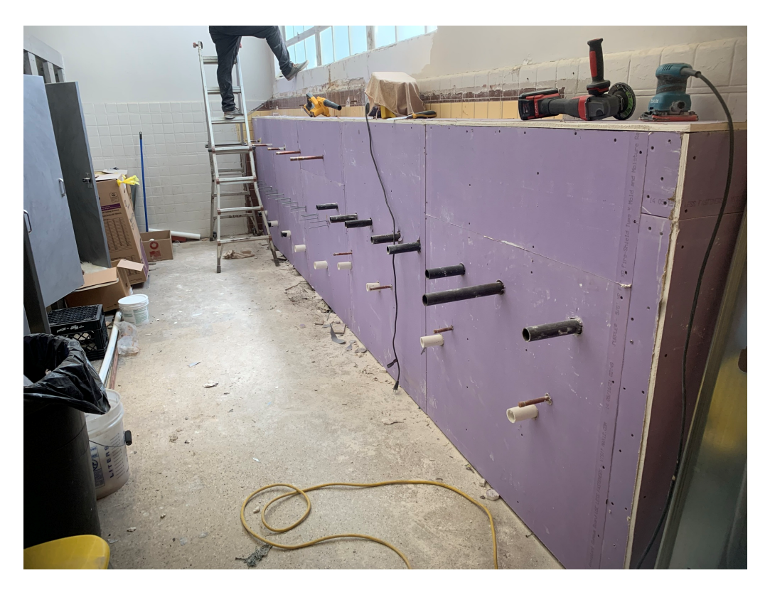
Figure 6 – Drywall Installed at Boys 30