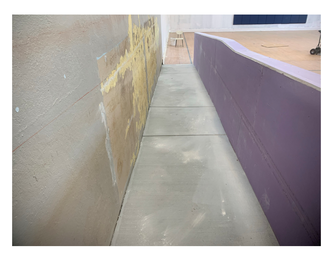
Figure 3 – ADA ramp installed at Playroom