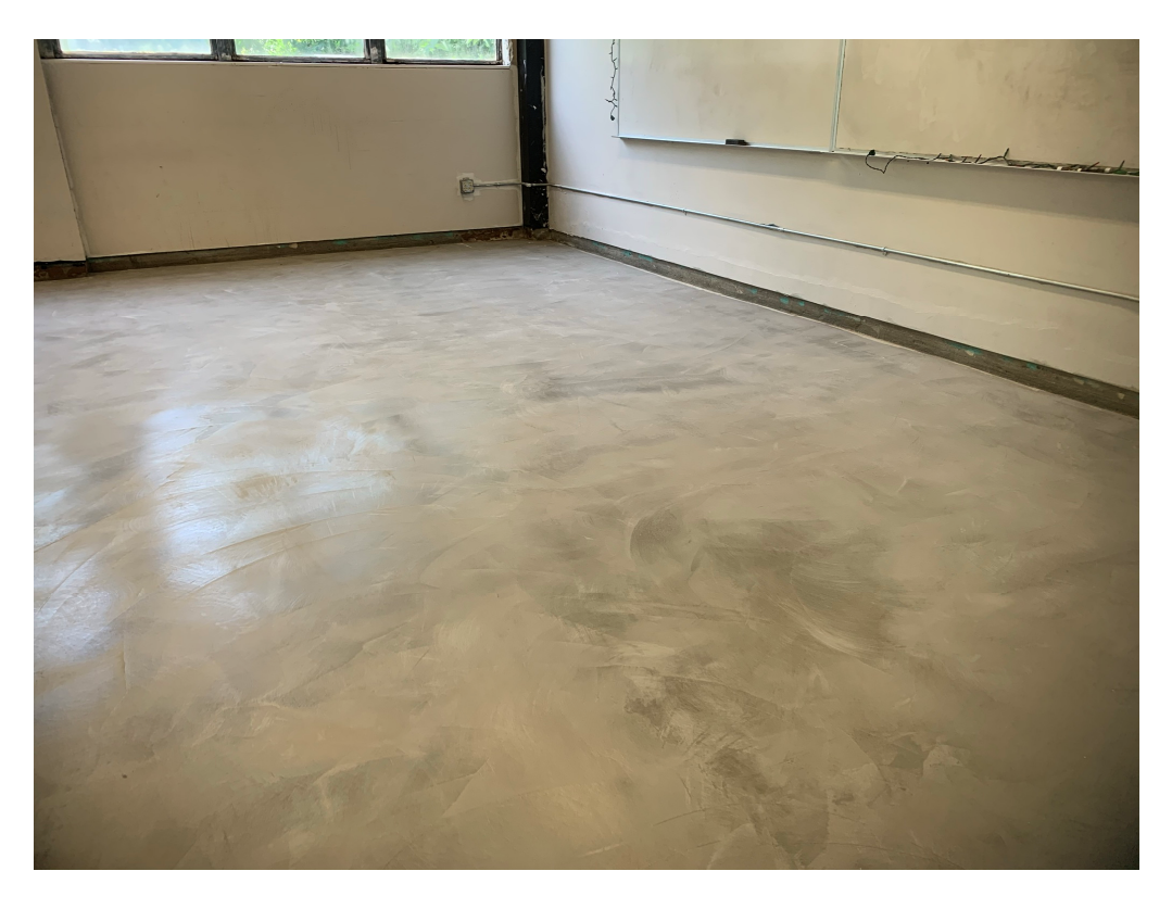
Figure 8 – Floor prep at classroom 24