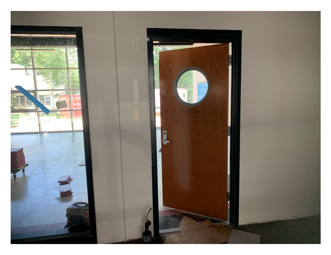
Figure 6 – Door Panels Installed