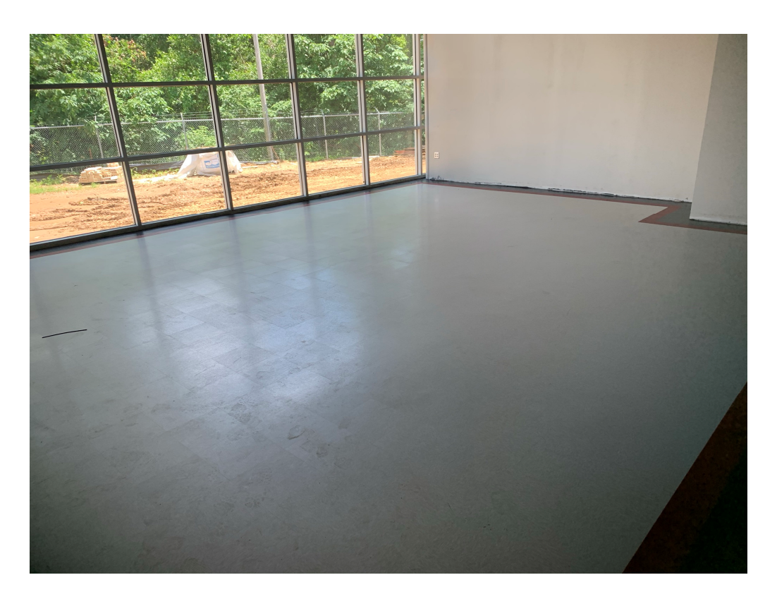
Figure 9 – New VCT Installed