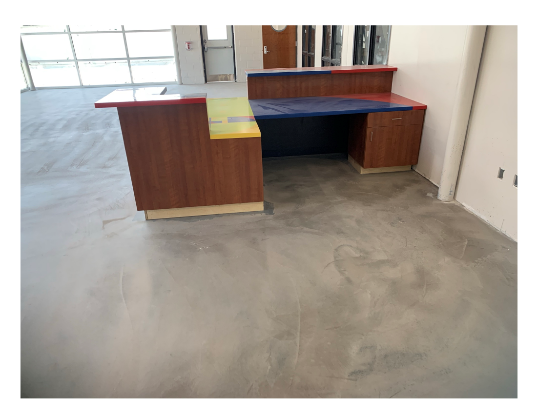
Figure 7 – Millwork Installed