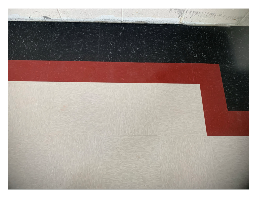
Figure 10 – New VCT Installed