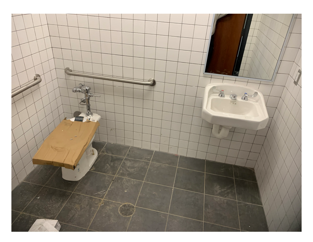
Figure 5 – ADA Bathroom Installed