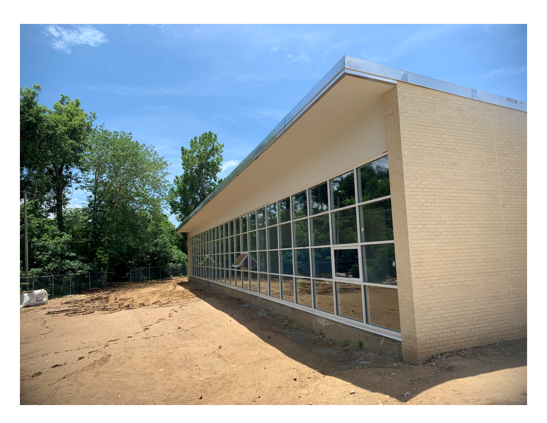
Figure 1 – Roof Trim Replaced to Match