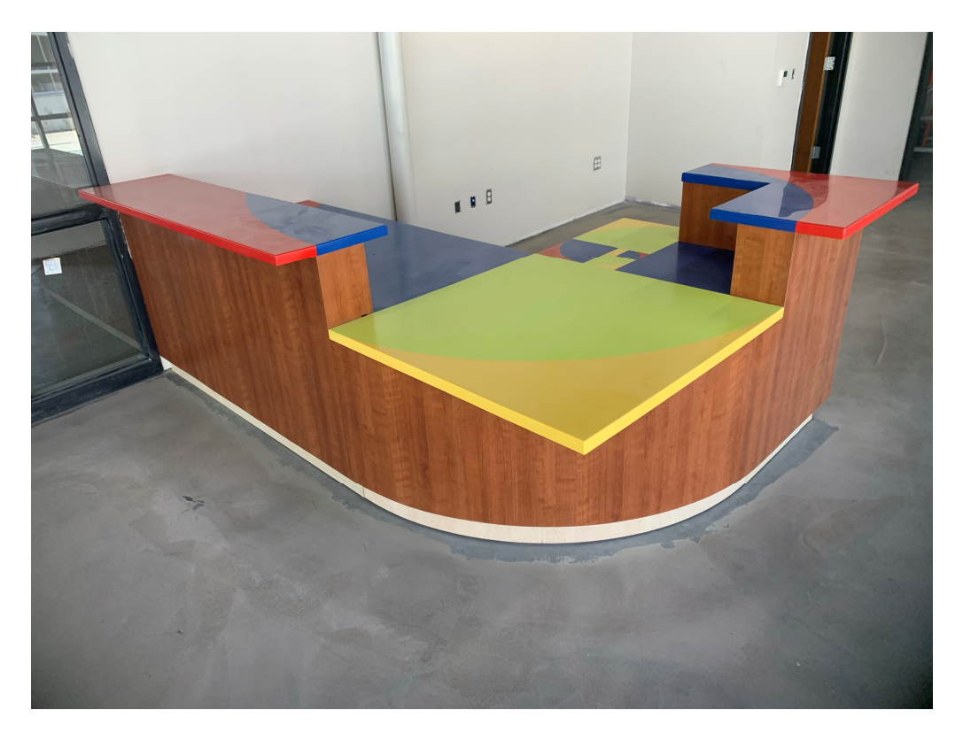
Figure 8 – Millwork Installed