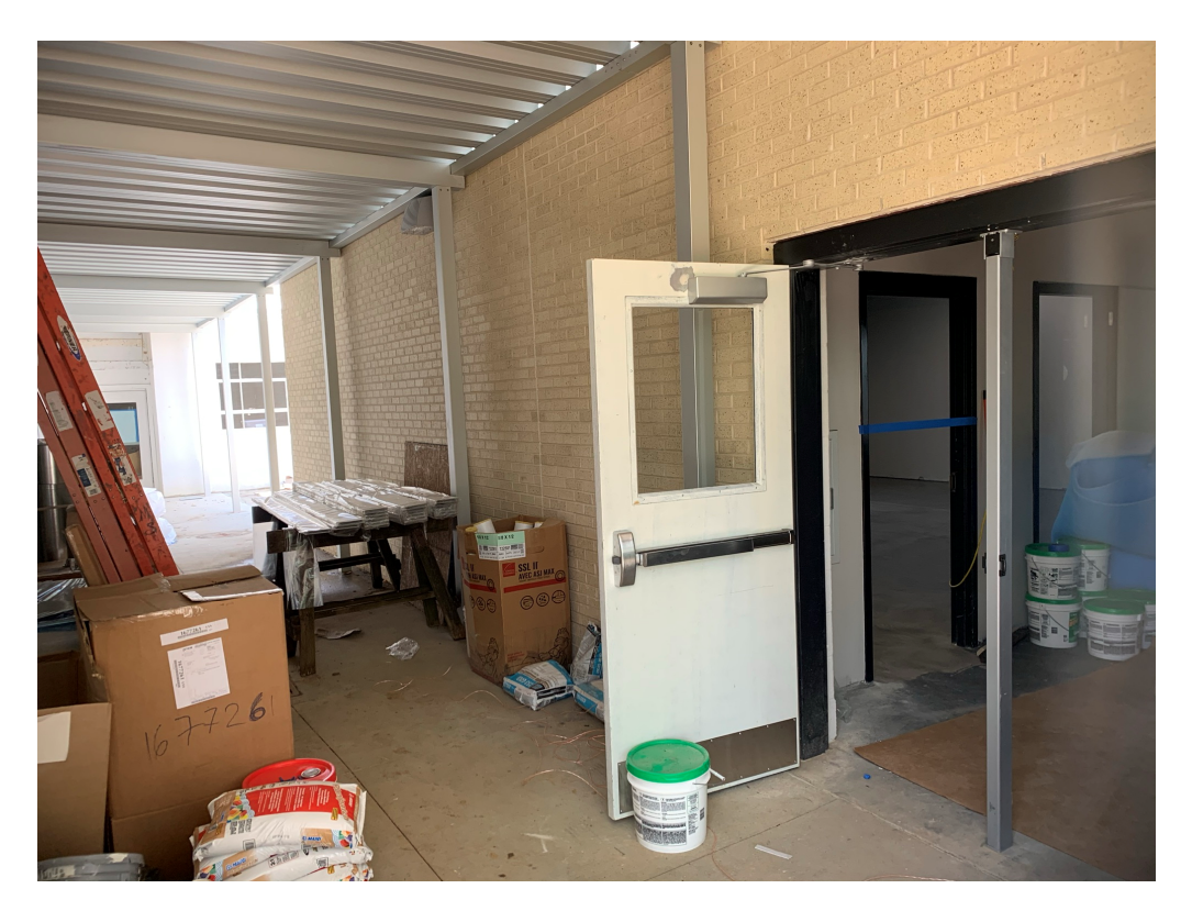
Figure 2 – Rear Exit Corridor; this area needs to be kept clean for egress from main building in case of an evacuation event.