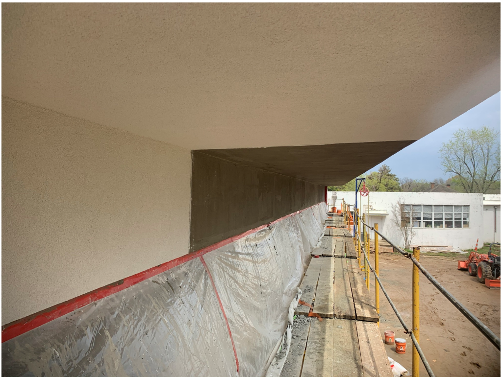
Figure 2 – Finished Stucco Mockup Section