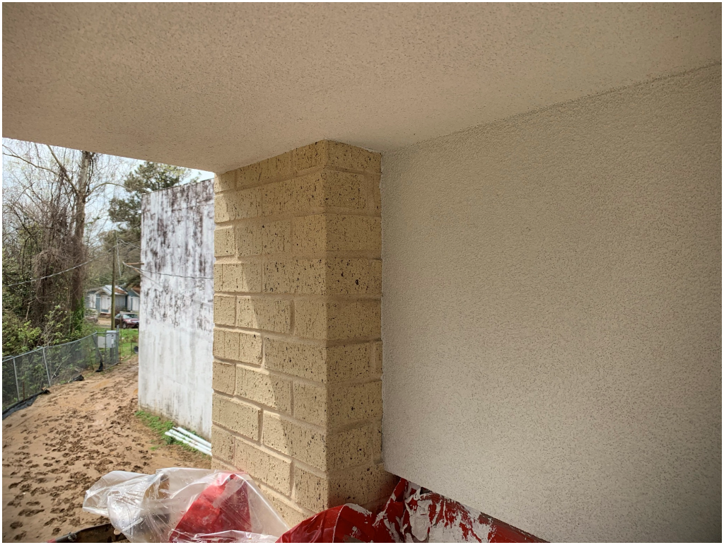
Figure 1 – Finished Stucco Mockup Section