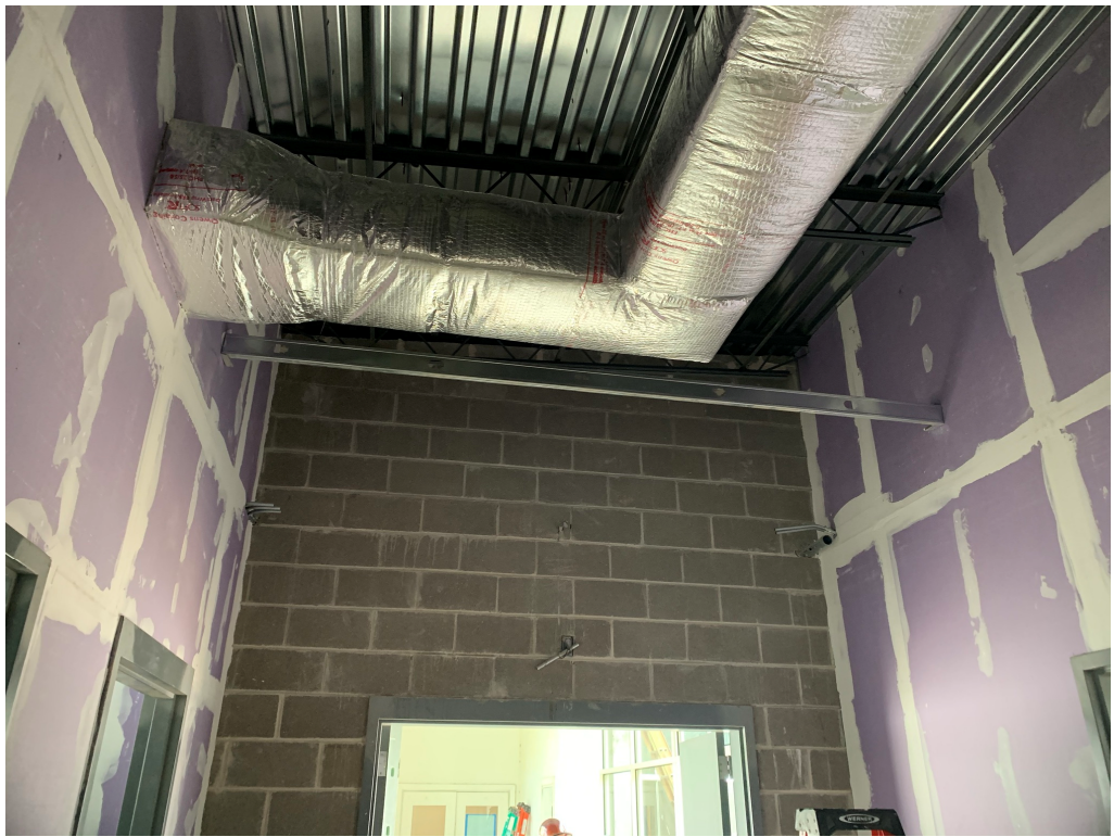
Figure 5 – Bracing Suggested by Contractor