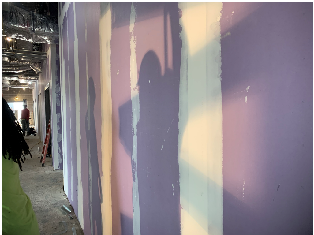
Figure 6 – Finish Work is Ongoing