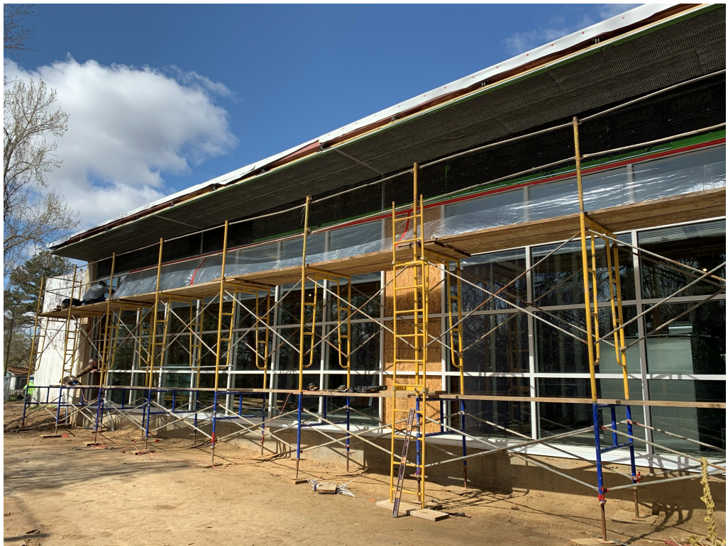
Figure 10 – Stucco Lathe Installed