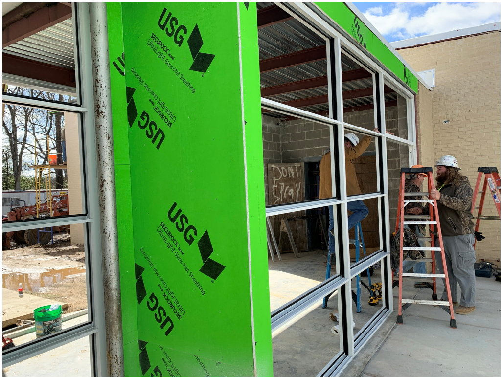
Figure 15 – Storefront at Connector Hall