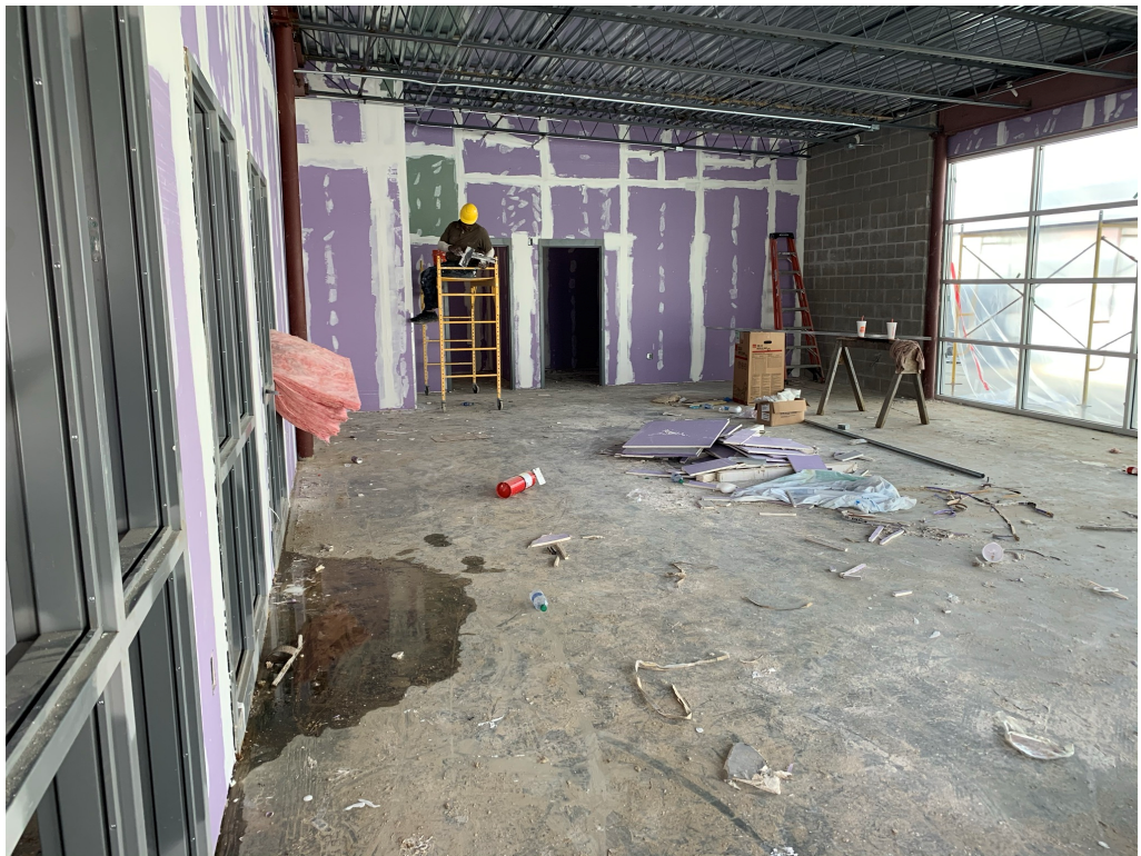
Figure 12 – Drywall Finishing in Progress