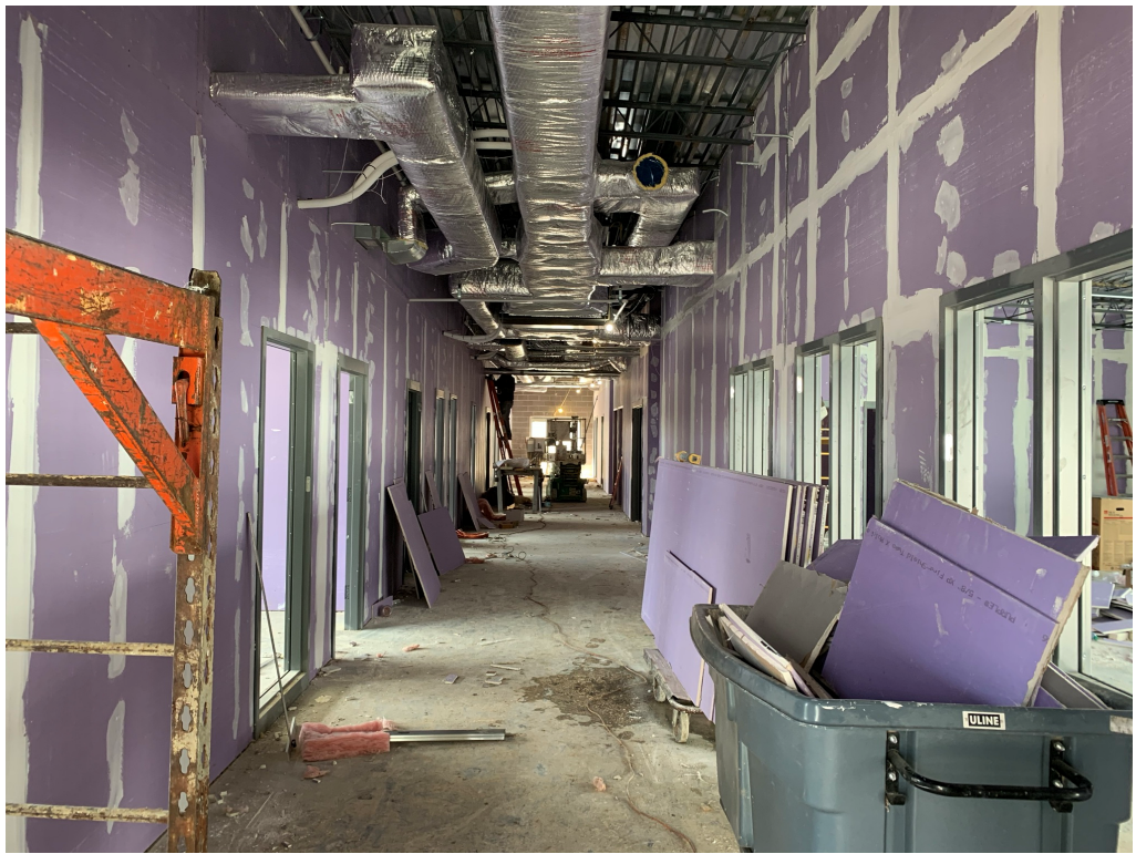
Figure 11 – Drywall Finishing in Progress