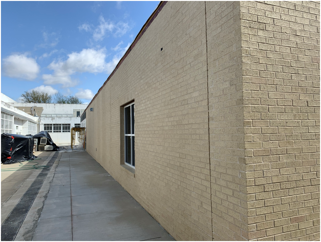
Figure 7 – Brick Washed