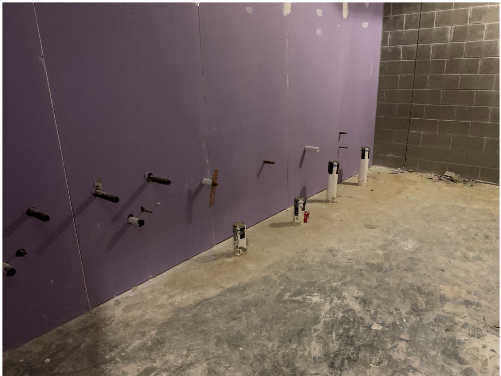
Figure 14 – Bathroom Drywall Installed