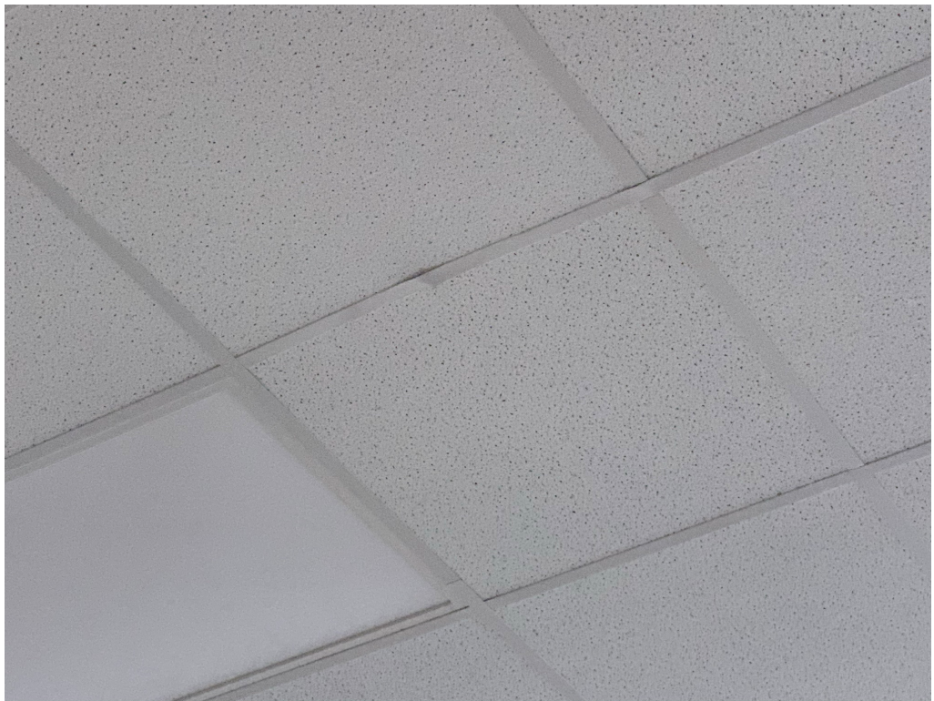
Figure 18 – Damaged Ceiling Grid IN cafeteria Requires Replacement