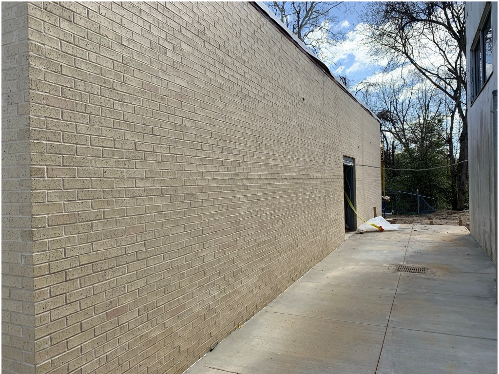
Figure 8 – Brick Washed