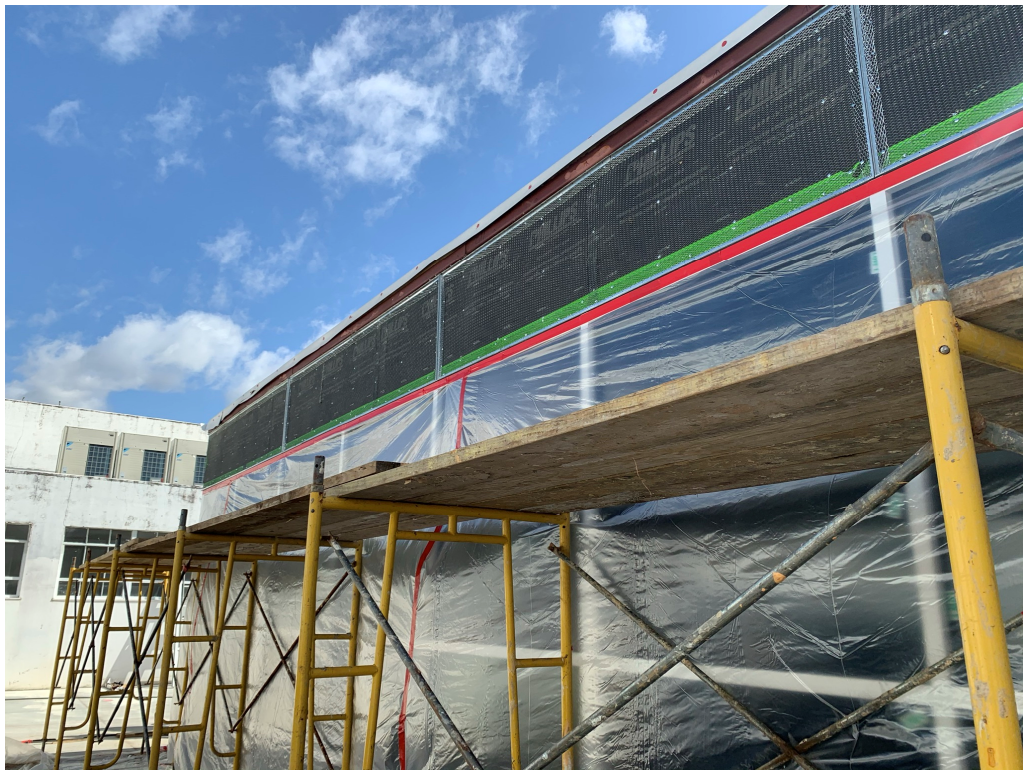
Figure 9 – Stucco Lathe Installed