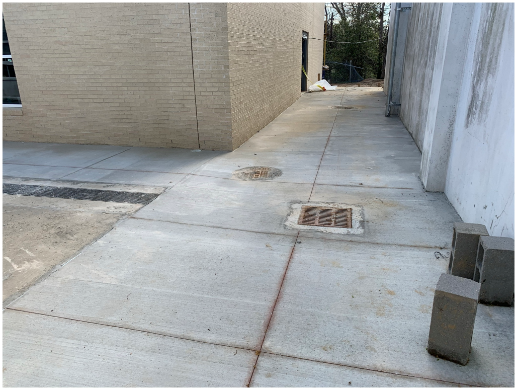
Figure 5 – Installed Concrete