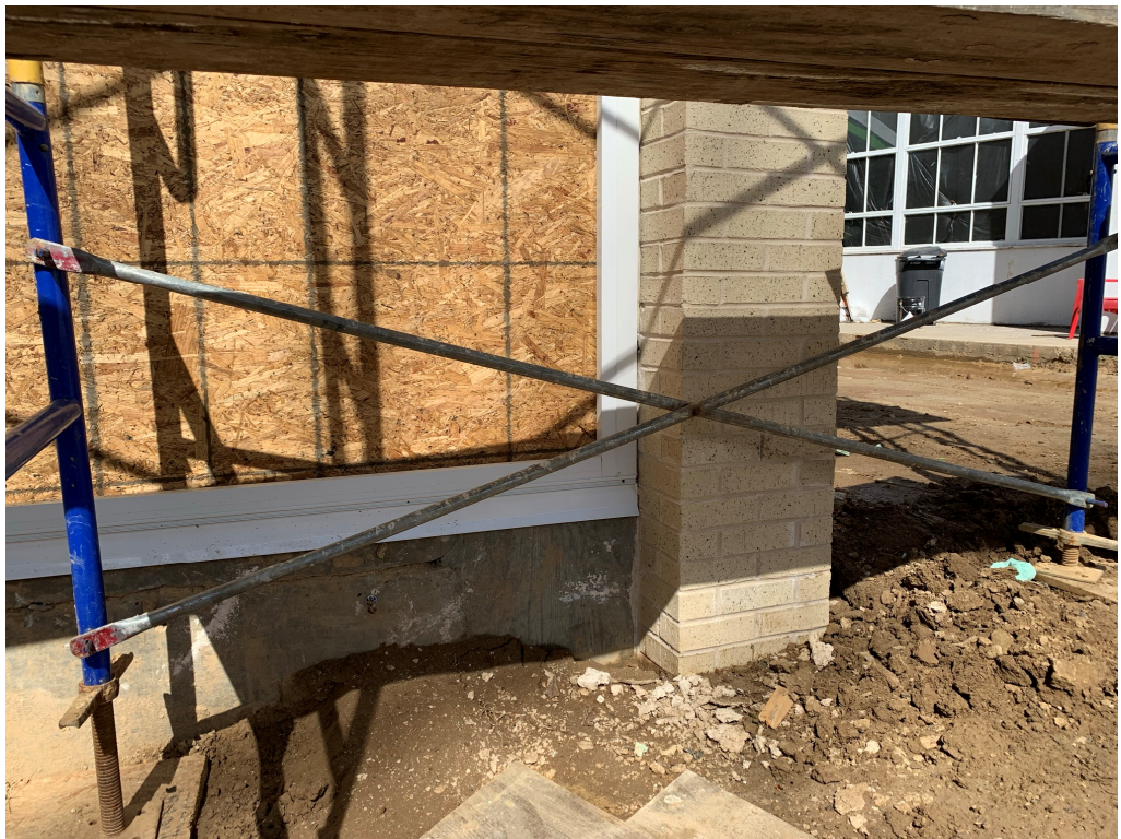
Figure 16 – Storefront at Brick Corner