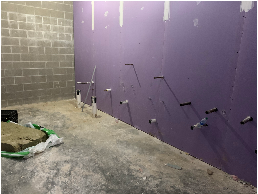
Figure 13 – Bathroom Drywall Installed