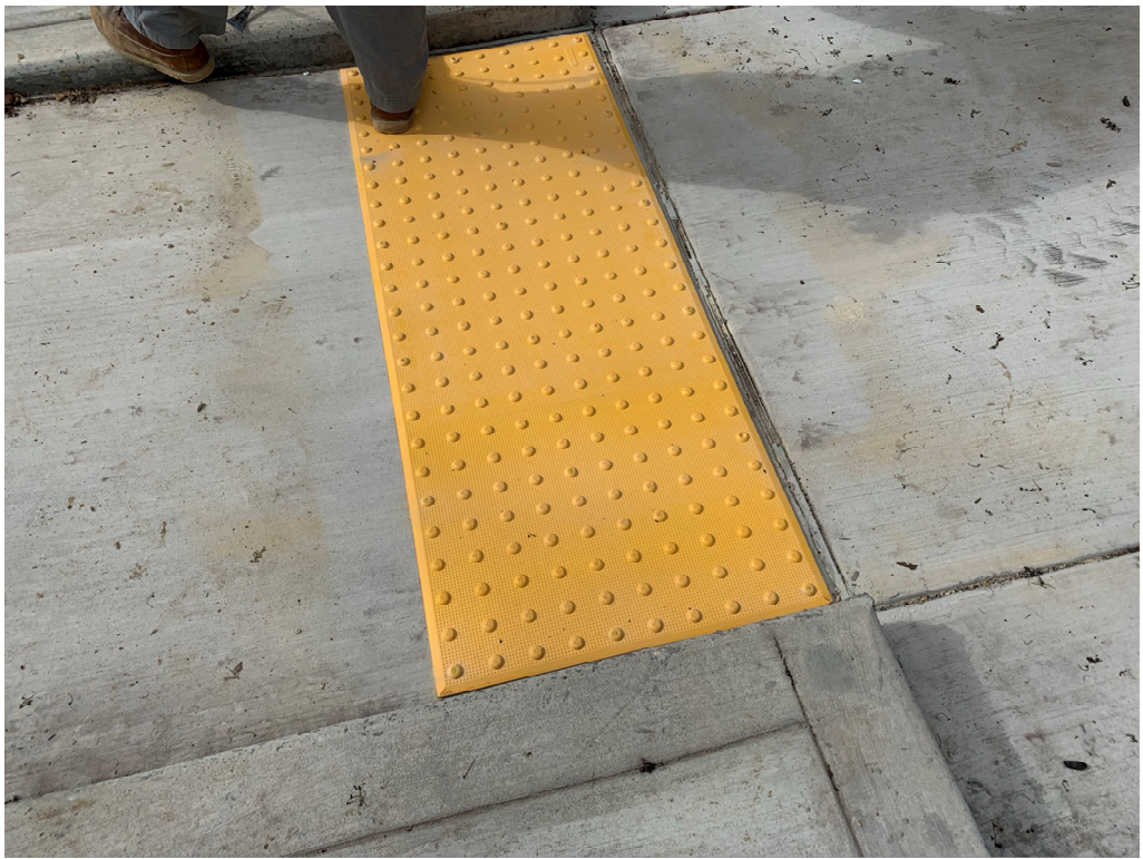
Figure 1 – Rumble Strip Installed at ADA Parking Pad