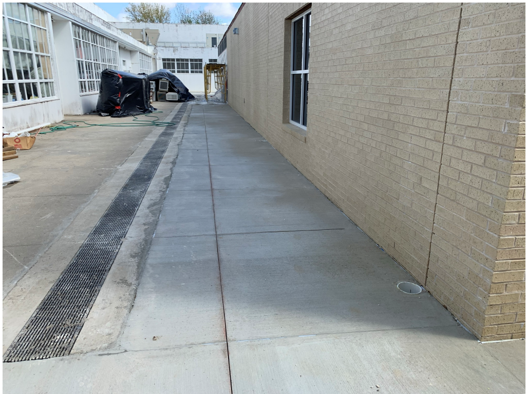
Figure 6 – Installed Concrete