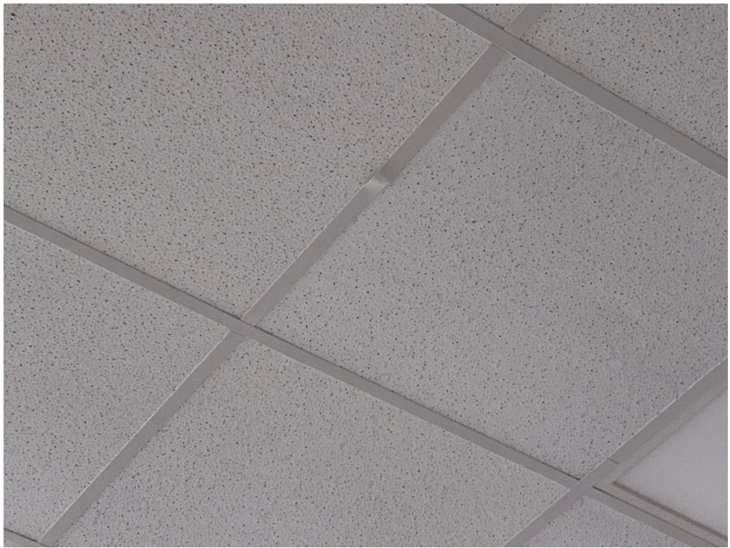
Figure 17 – Damaged Ceiling Grid IN cafeteria Requires Replacement