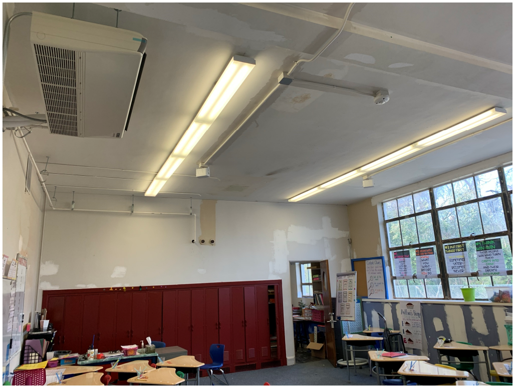
Figure 3 – HVAC Unit Removal at Classroom nearly complete