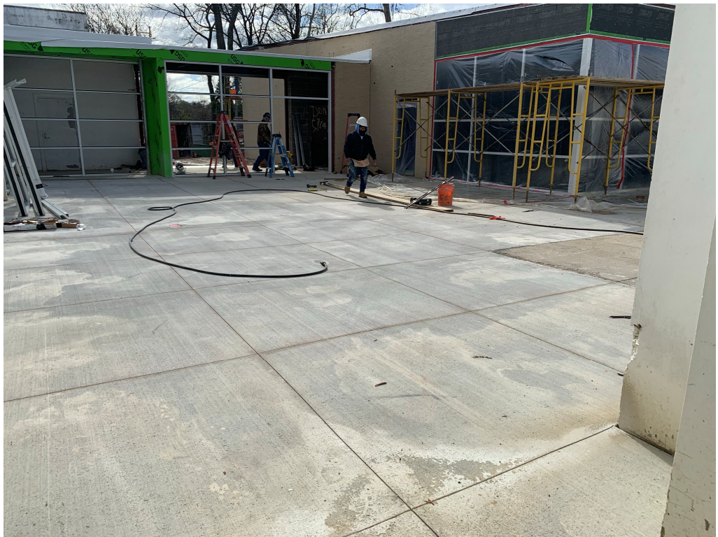
Figure 4 – Installed Concrete