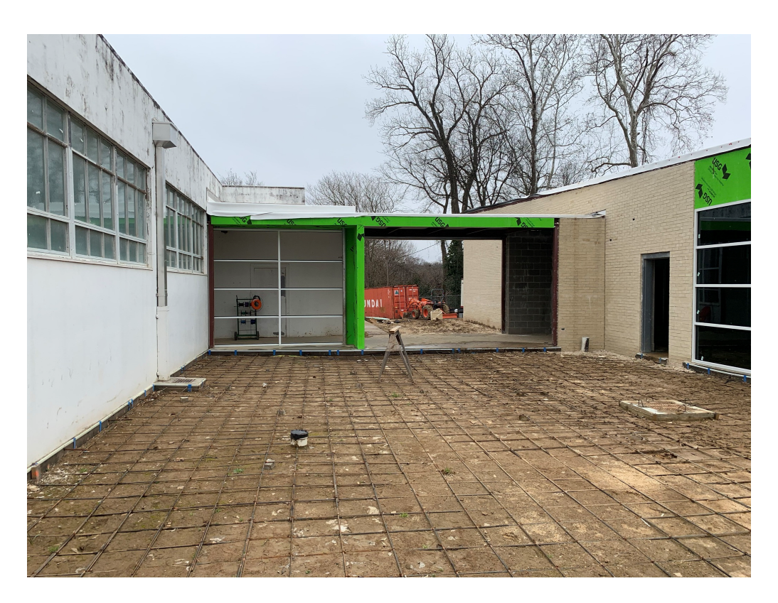
Figure 1 – Courtyard at New Addition