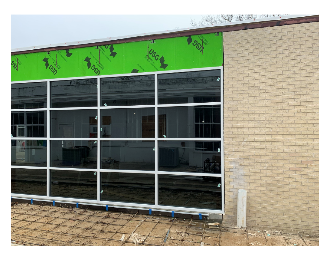
Figure 3 – New Storefront Installed