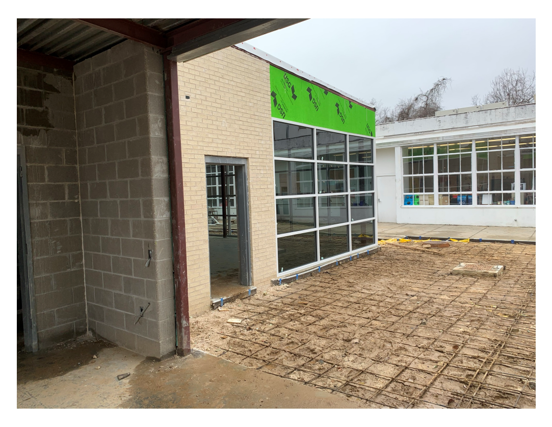
Figure 8 – New Storefront Installed