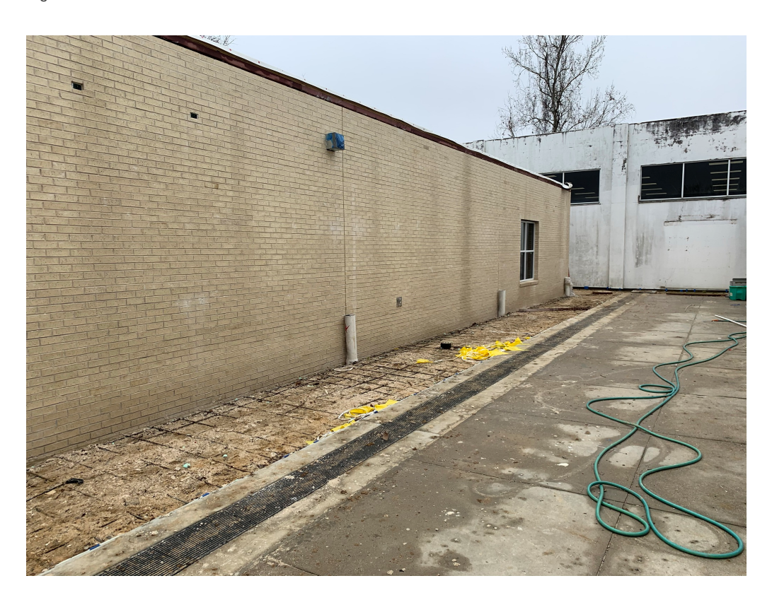
Figure 4 – NW Facade