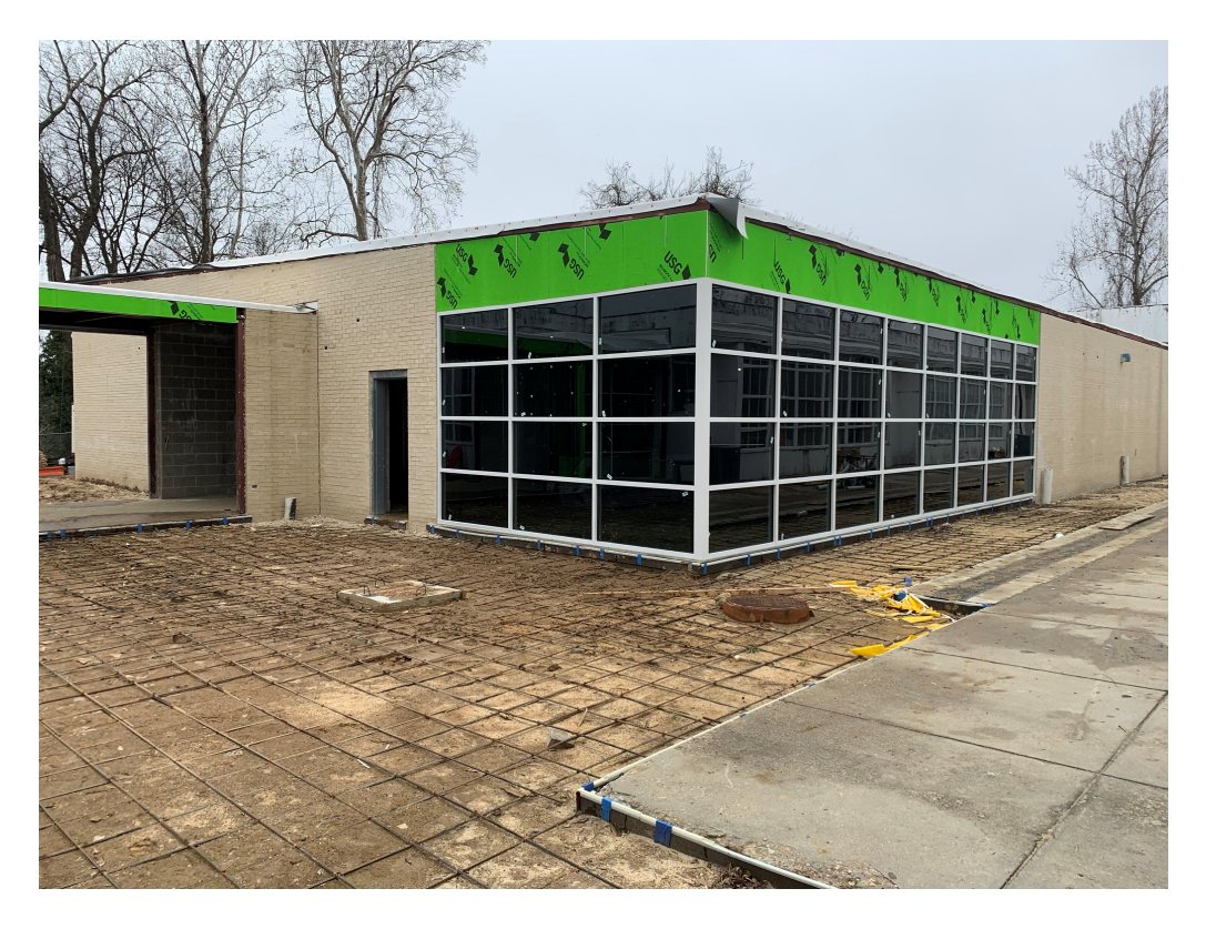
Figure 2 – New Storefront Installed