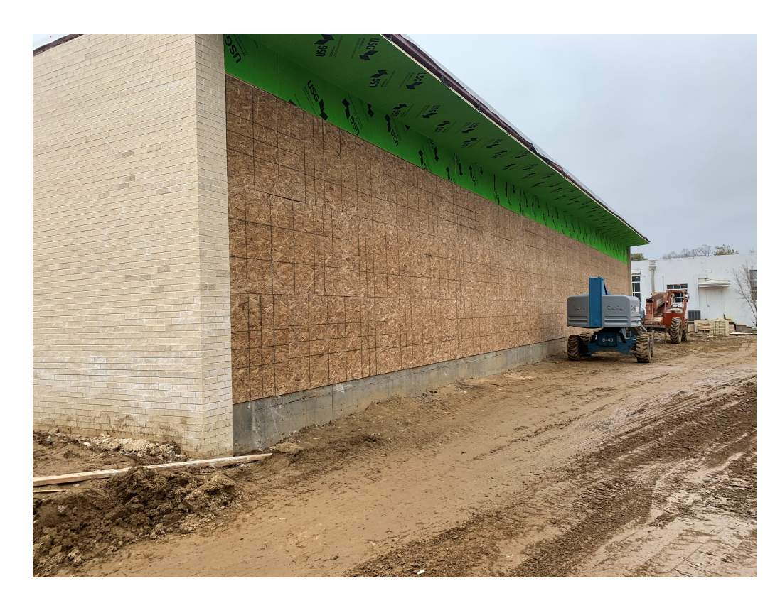
Figure 5 – SE Façade; temporary osb installed