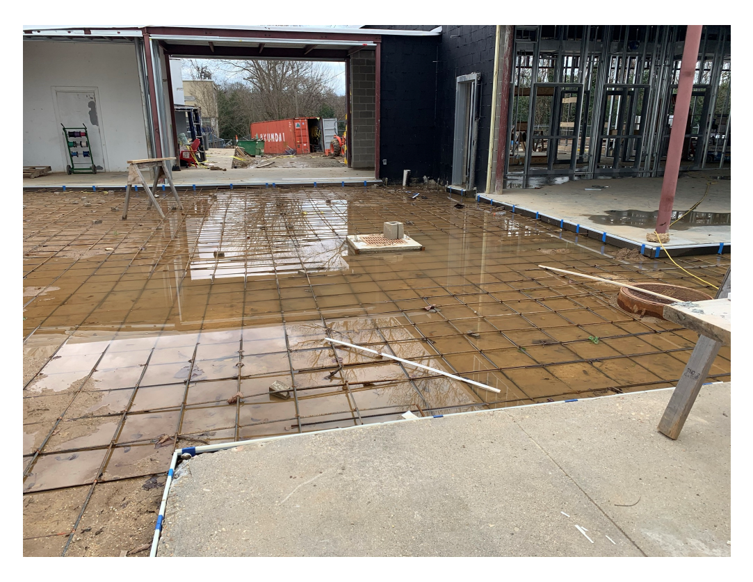
Figure 4 – Drainage Issues at Courtyard