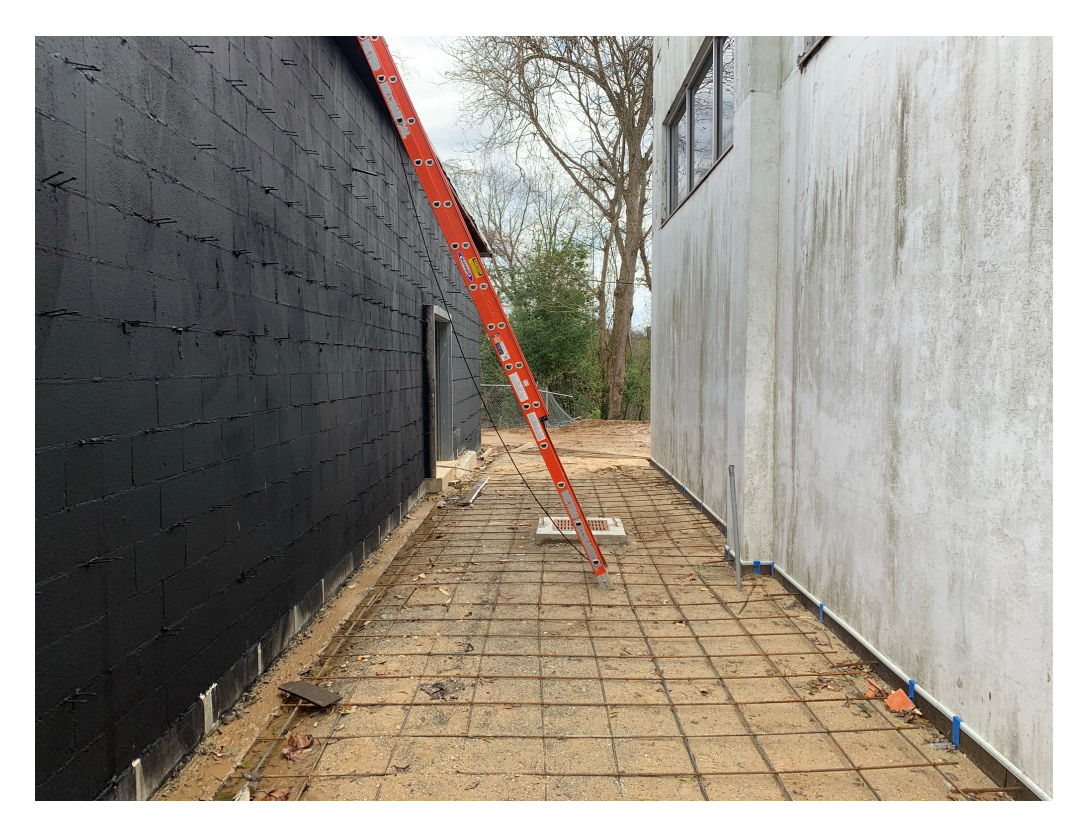
Figure 2 – Exterior Progress