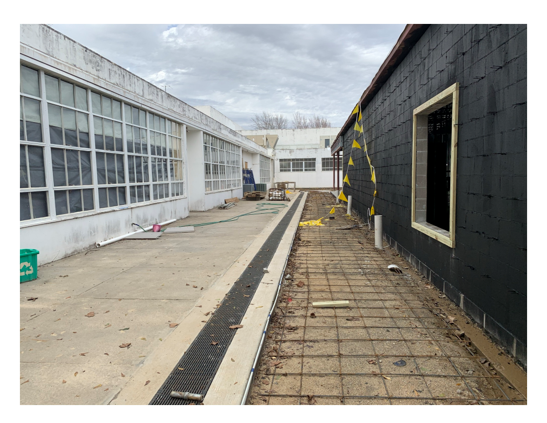
Figure 1 – Exterior Progress