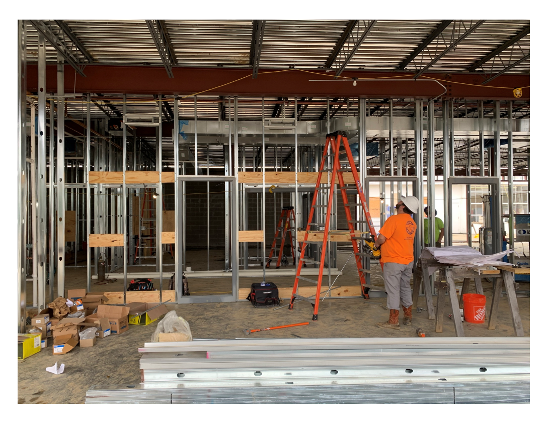
Figure 7 – Plywood Blocking Installed