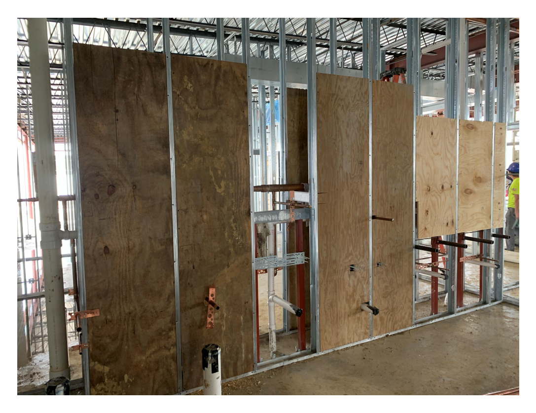
Figure 10 – Plywood Blocking Installed