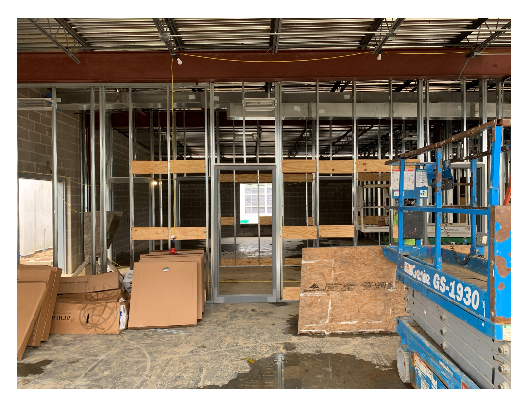
Figure 8 – Plywood Blocking Installed