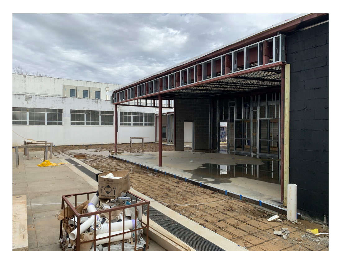
Figure 3 – Exterior Progress