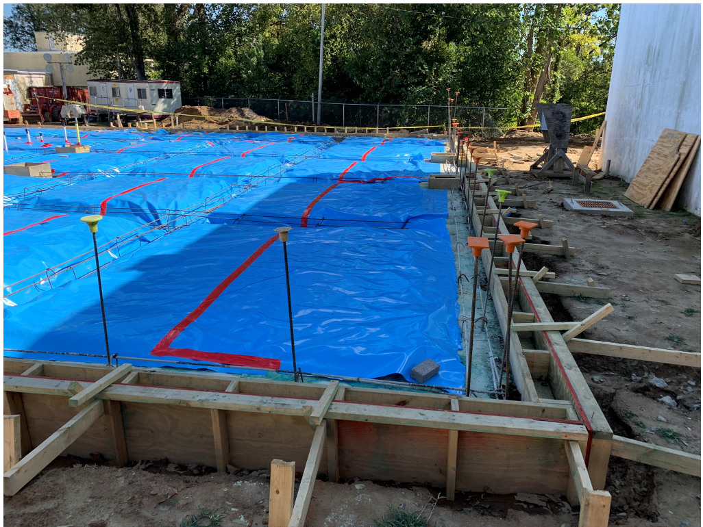
Figure 2 – Formed Up Footings