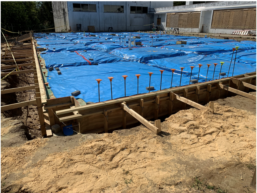
Figure 6 – Formed Up Footings