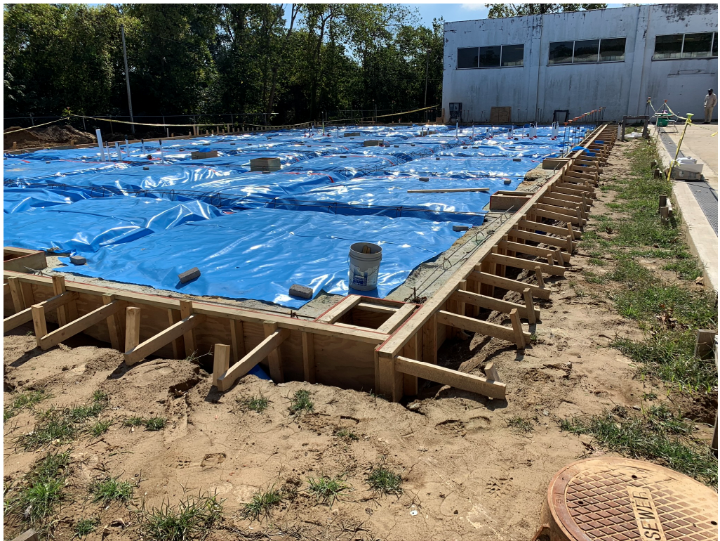
Figure 4 – Formed Up Footings