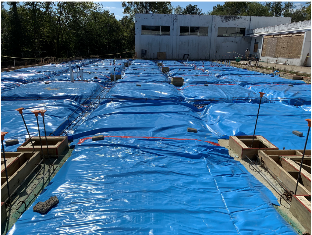
Figure 5 – Formed Up Footings