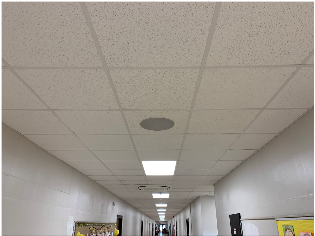
Figure 1 – Dirt Work at Slab