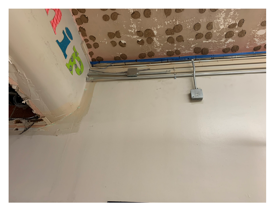
Figure 13 – Conduit Removed from Bulk Head Drop Down at main Hall; This junction box could be re-run above ceiling