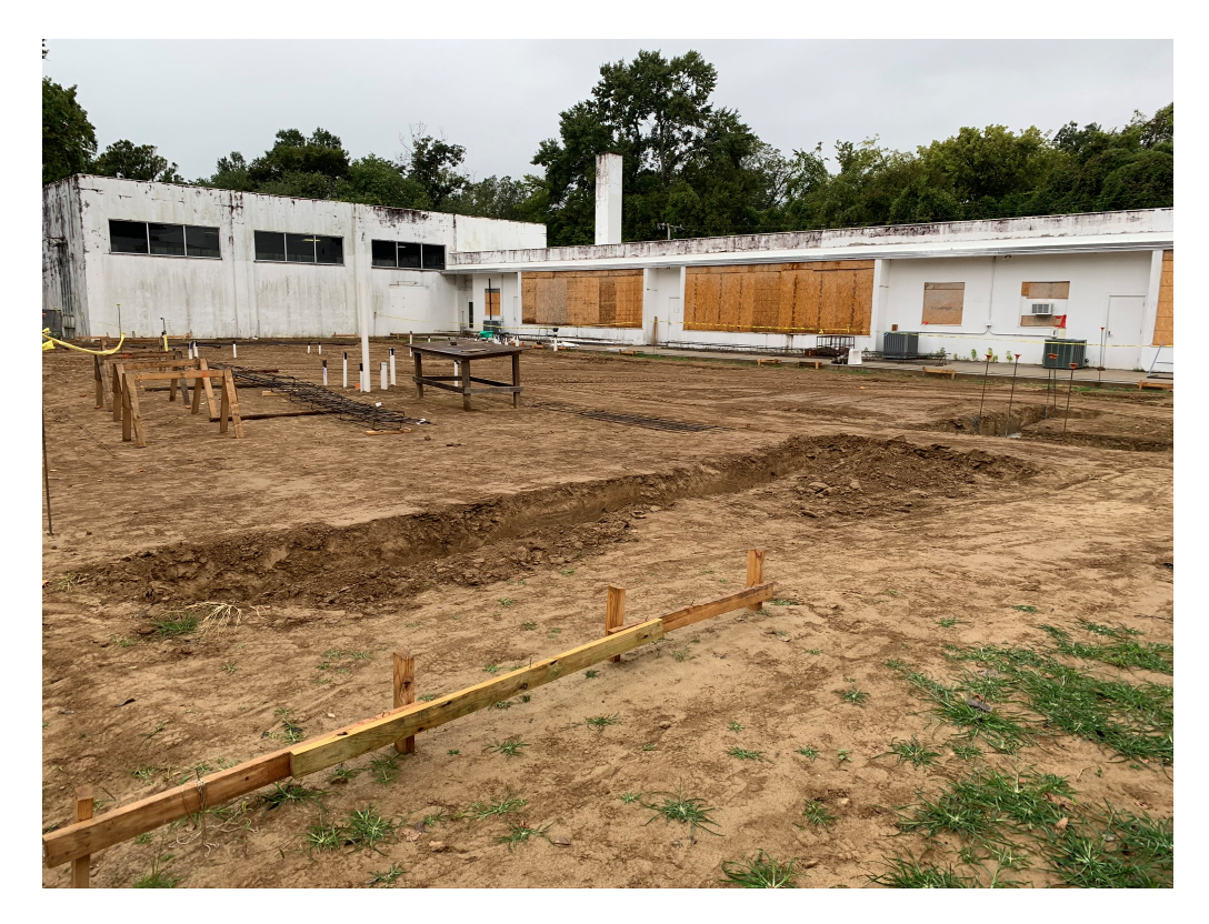
Figure 15 – Building Pad and Slab Layout