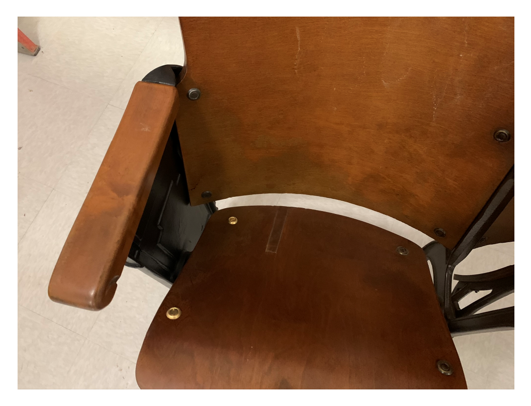
Figure 7 – Brass on New Fasteners Stand Out Brightly (should darken and dull over time)