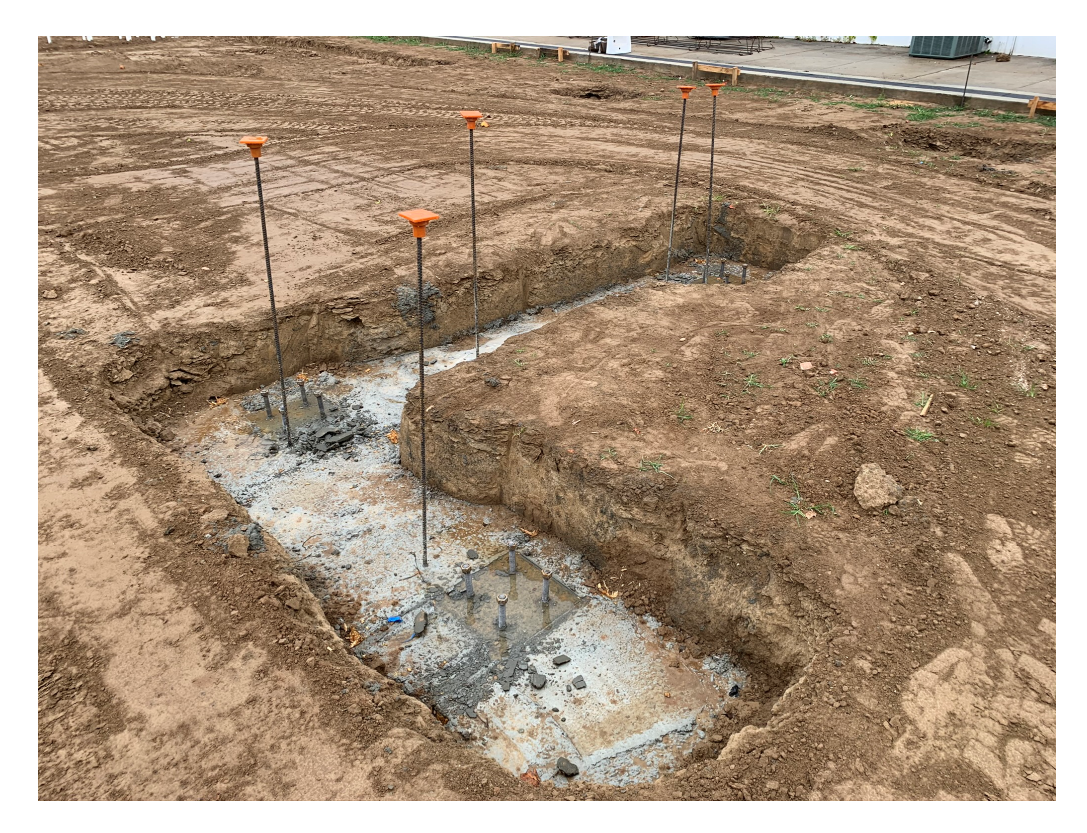
Figure 16 – Footing Concrete Installed