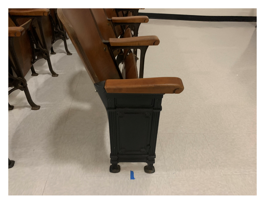
Figure 3 – Ends Painted Evenly