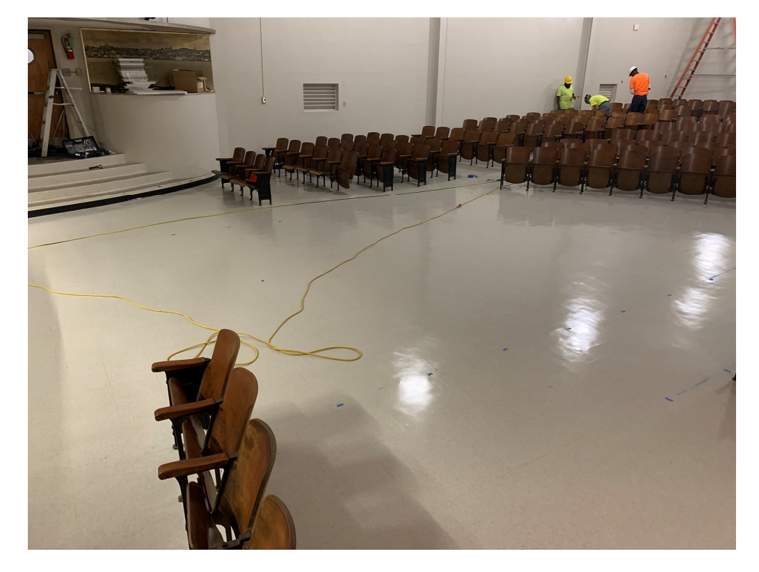
Figure 2 – Auditorium Seating Installation