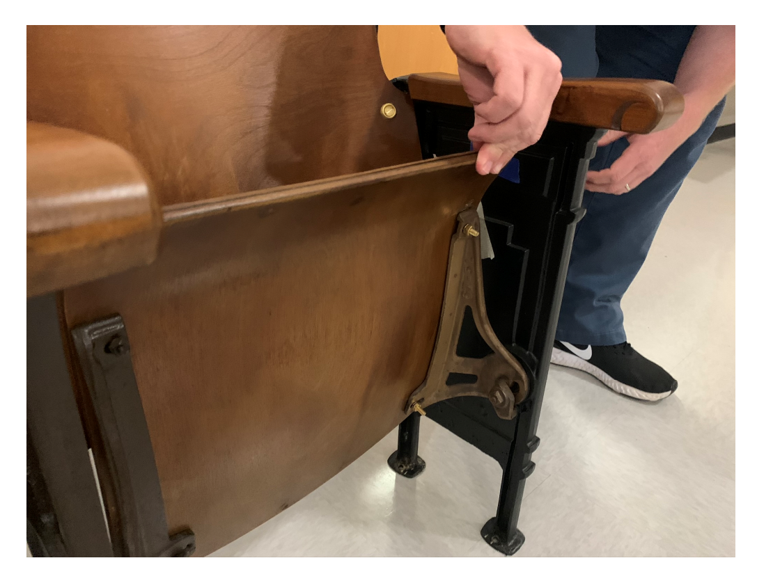
Figure 10 – End Hinge Brackets are Different Color than all others at every row