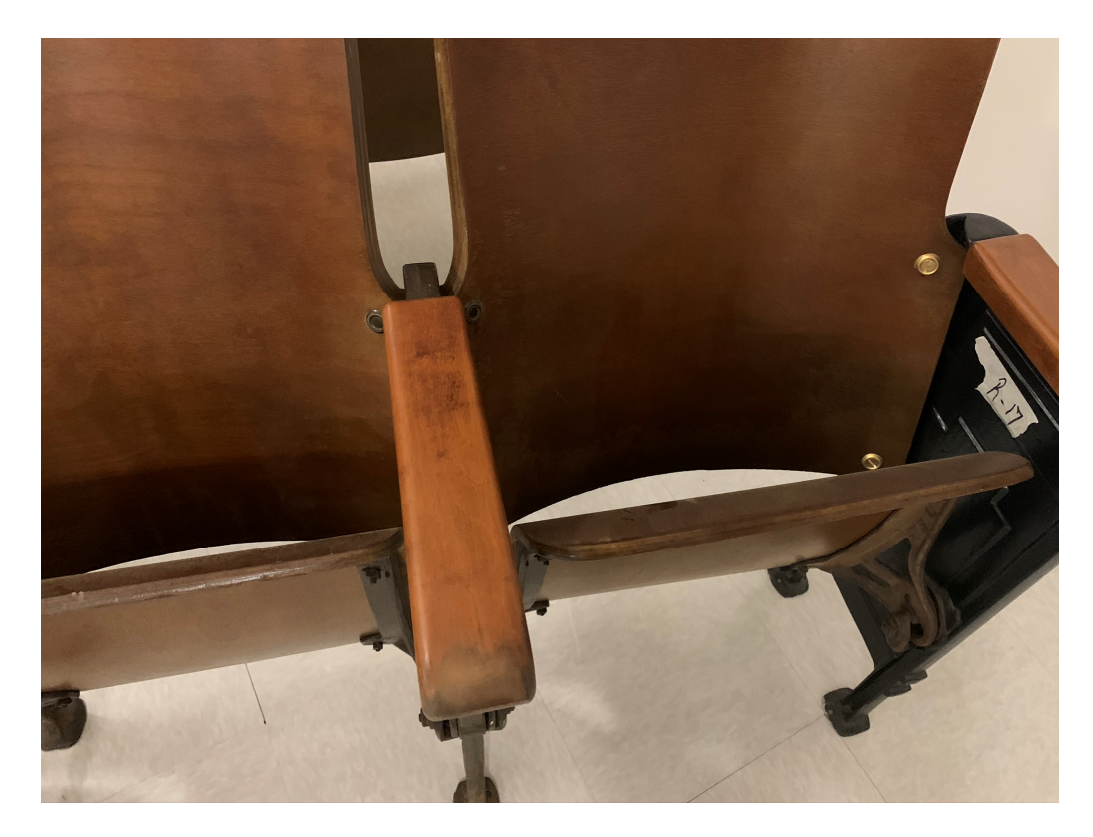
Figure 6 – Brass on New Fasteners Stand Out Brightly (should darken and dull over time)