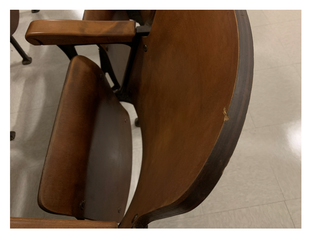
Figure 4 – Some Moving Damage Requires On-Site Repair