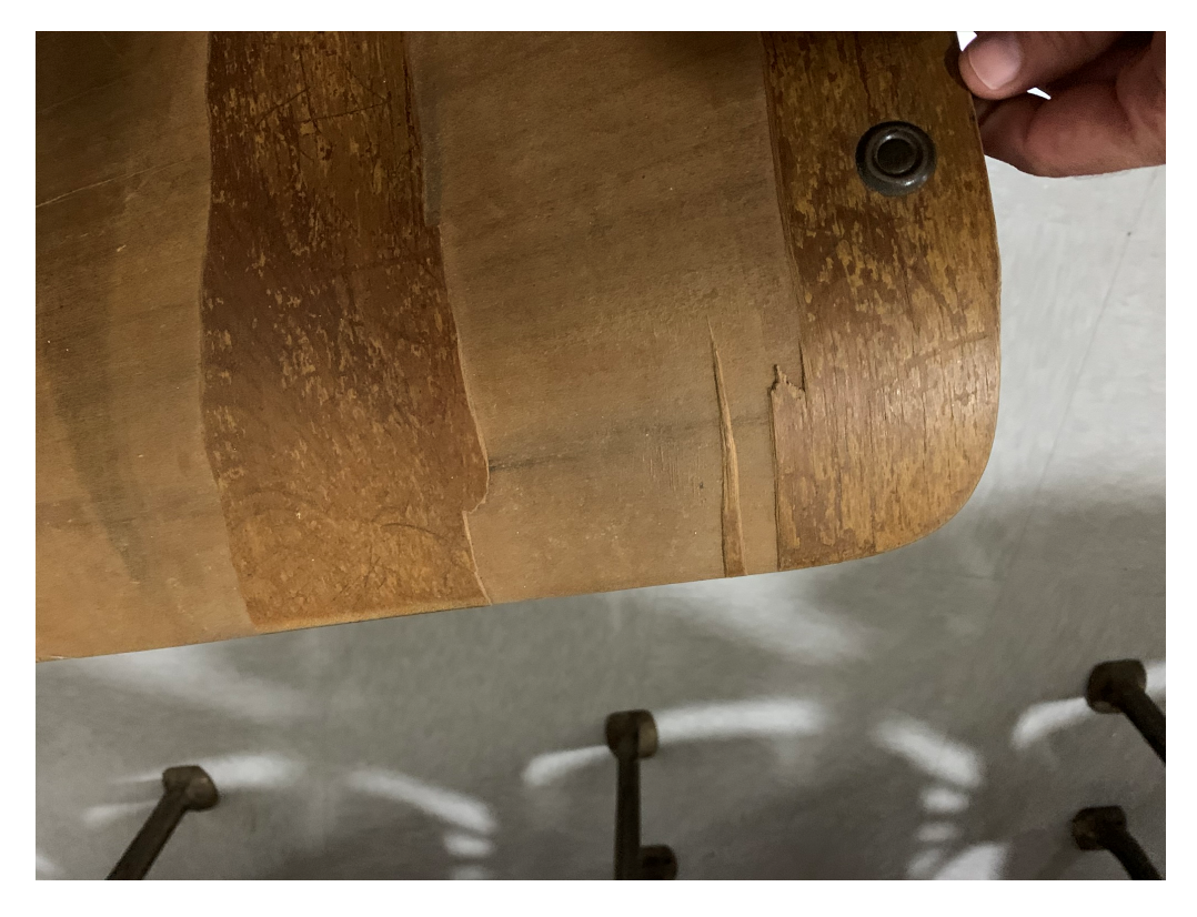
Figure 12 – Unfinished Seat to be replaced with Unused Rows