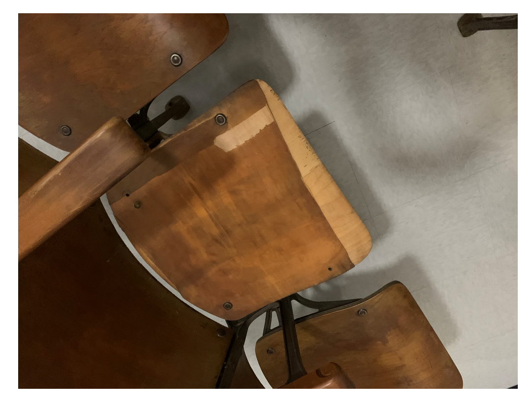
Figure 11 – Unfinished Seat to be replaced with Unused Rows