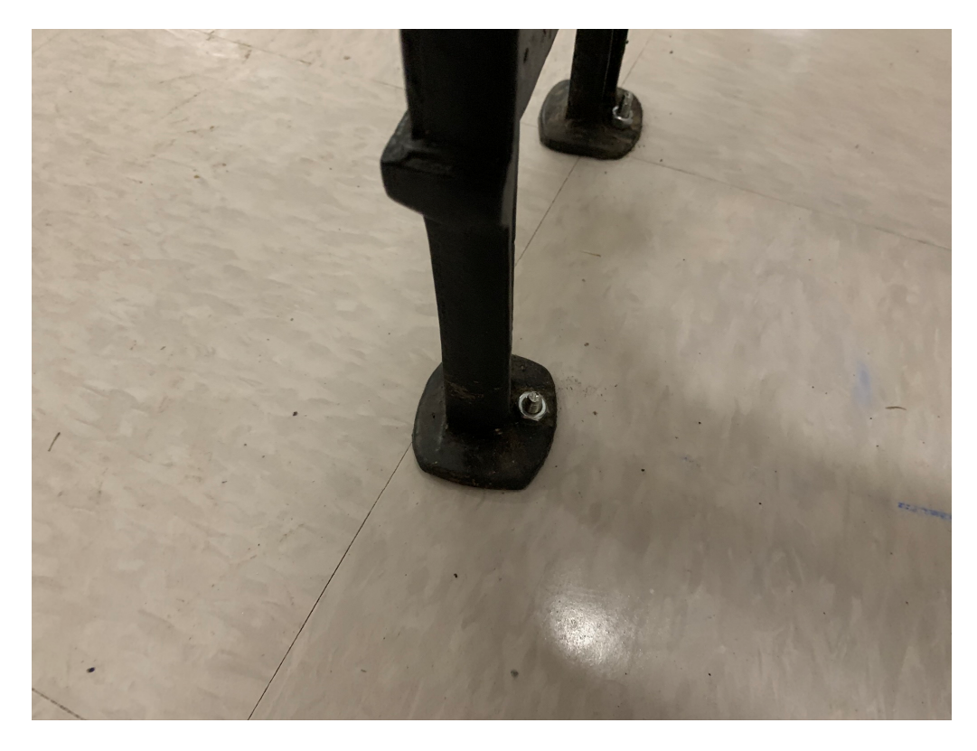
Figure 8 – Concrete Anchors Require some Black Touchup Paint so that they do not stick out