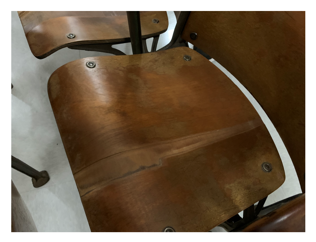
Figure 9 – Example of Refinished Seat