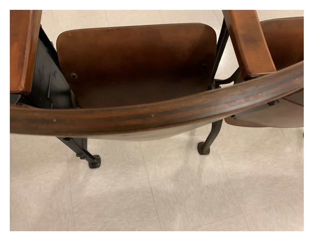
Figure 5 – Some Delamination needs to be Re-Adhered