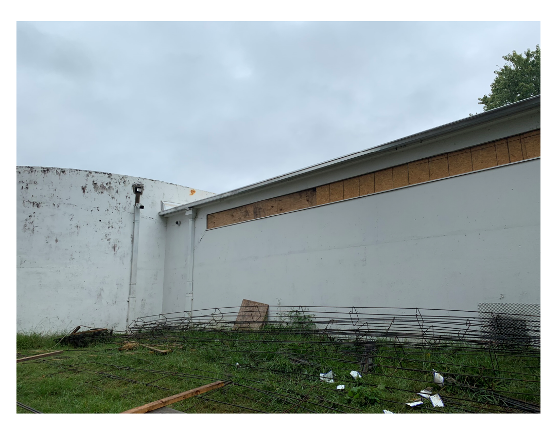
Figure 14 – New Gutter at Roof