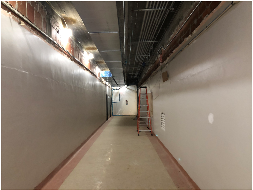
Figure 5 – Service Work in Corridor 115 Ongoing