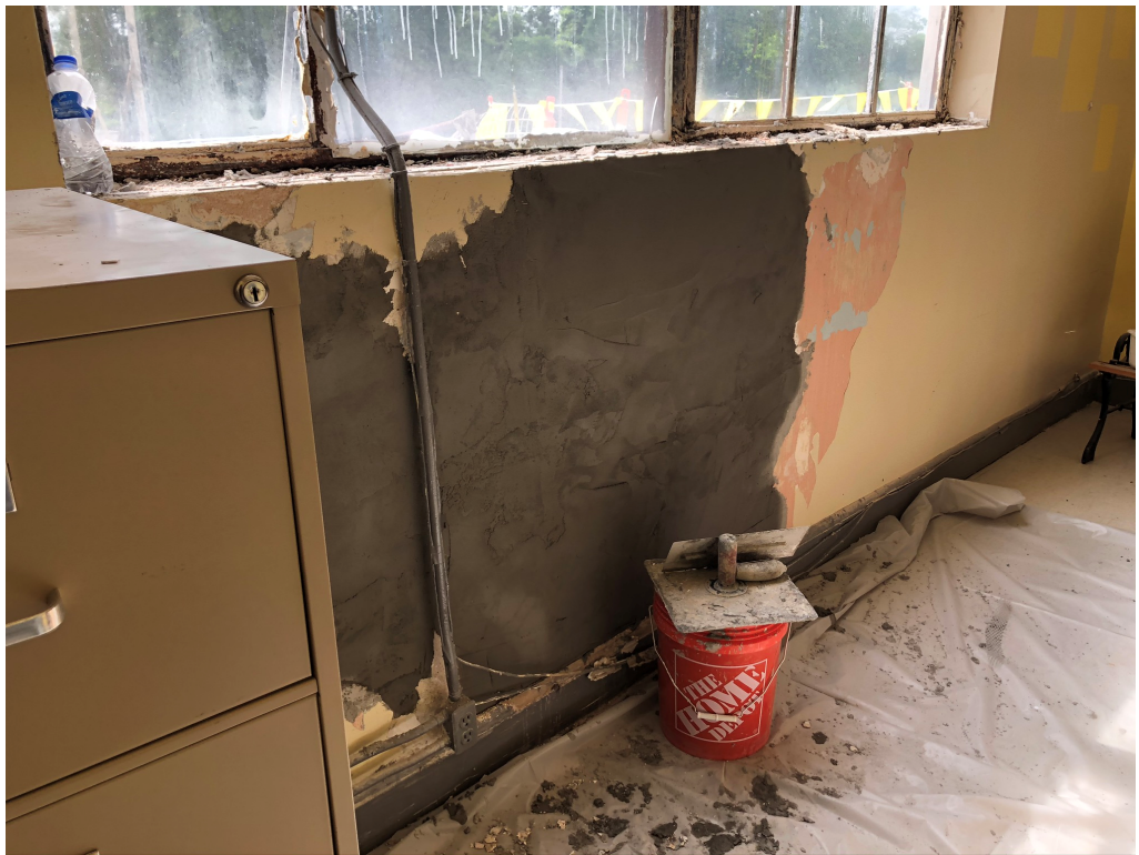
Figure 2 – Plaster Repair at Upper Floor