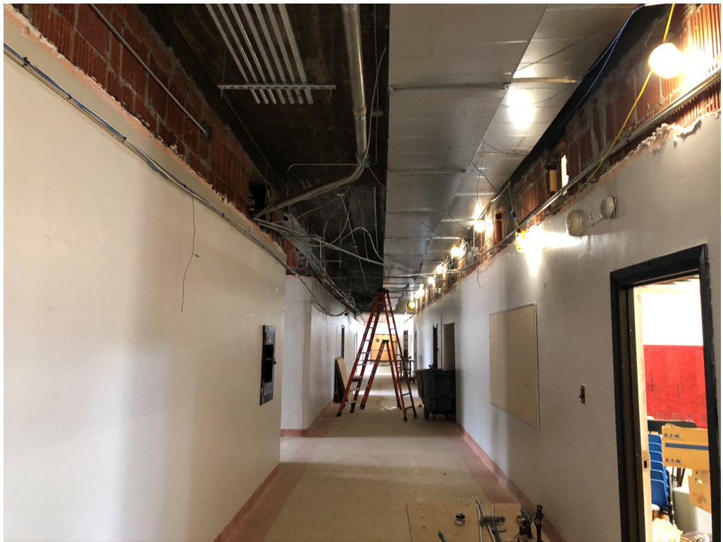
Figure 6 – Service Work in Corridor 115 Ongoing