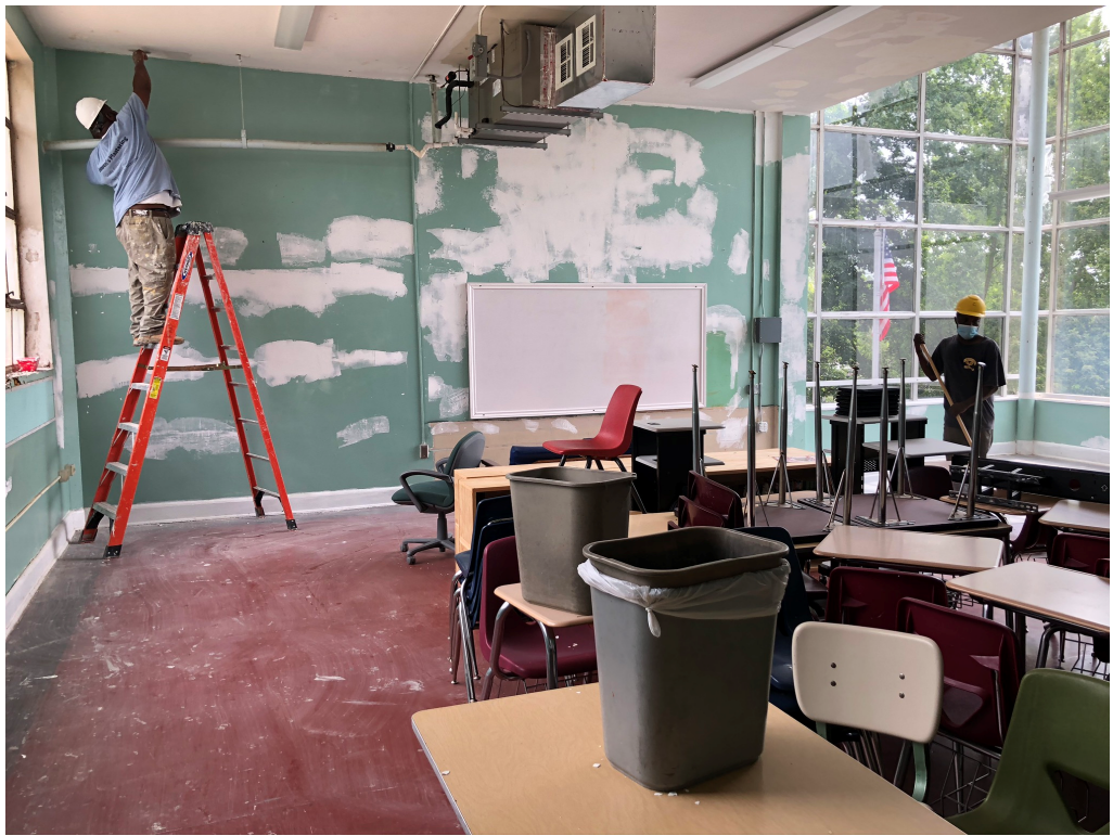
Figure 3 – Paint Prep at Upper Floor