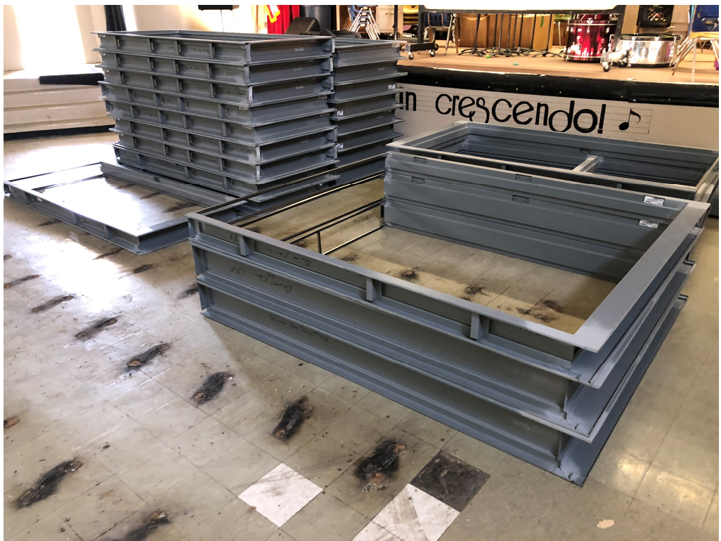
Figure 4 – Door Jambs Staged On Site