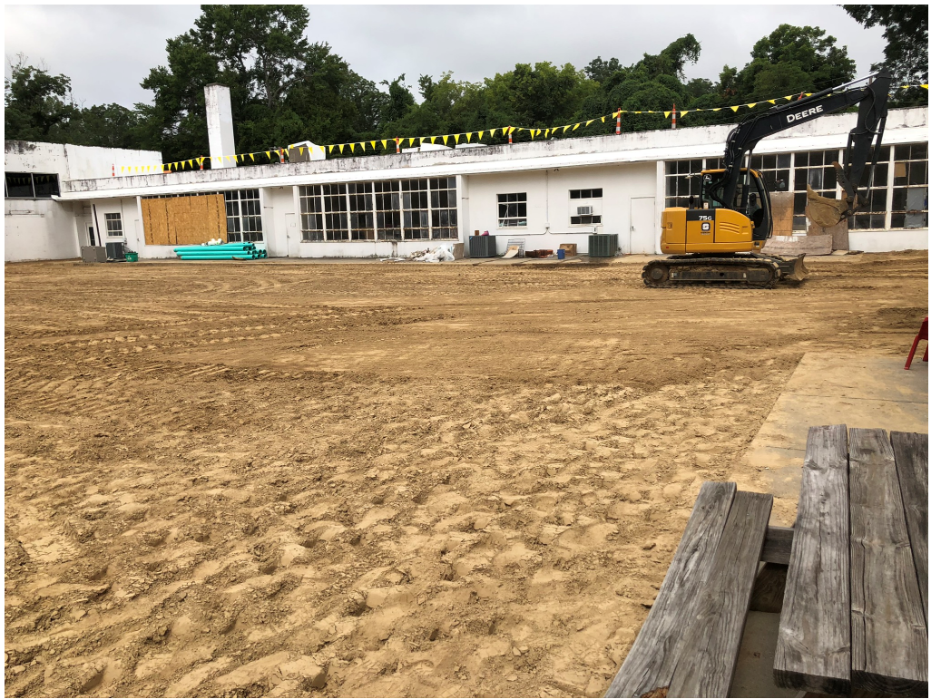
Figure 7 – Pad Development Nearing Completion