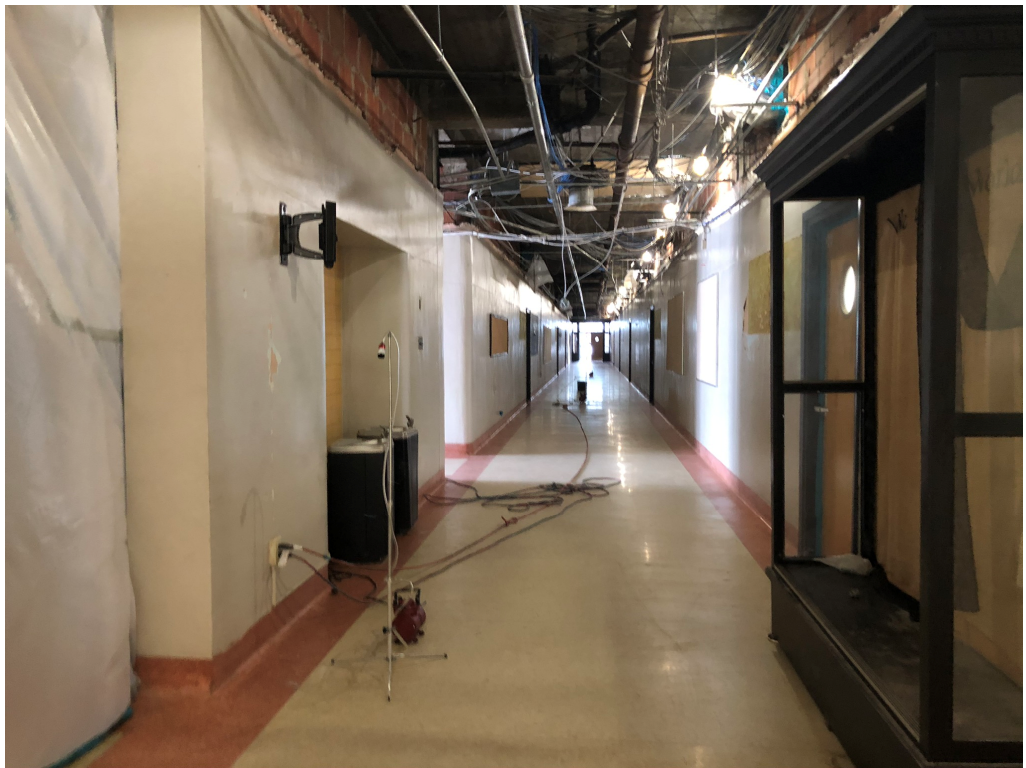
Figure 8 – Corridor 100 Progress