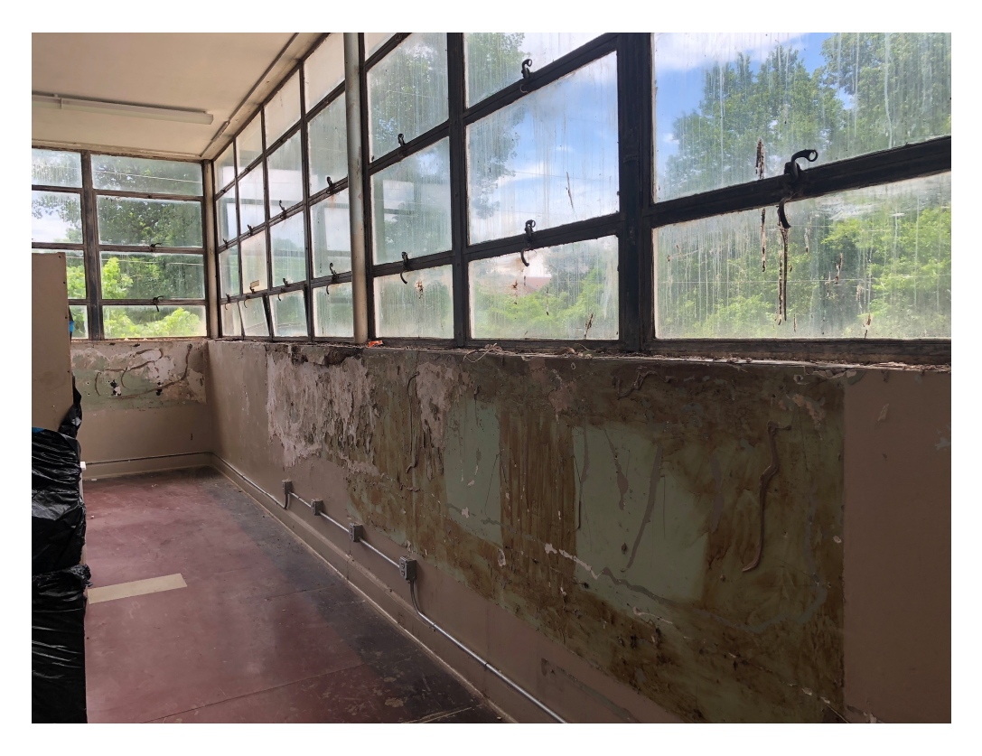
Figure 2 – Window Sill at Library 43