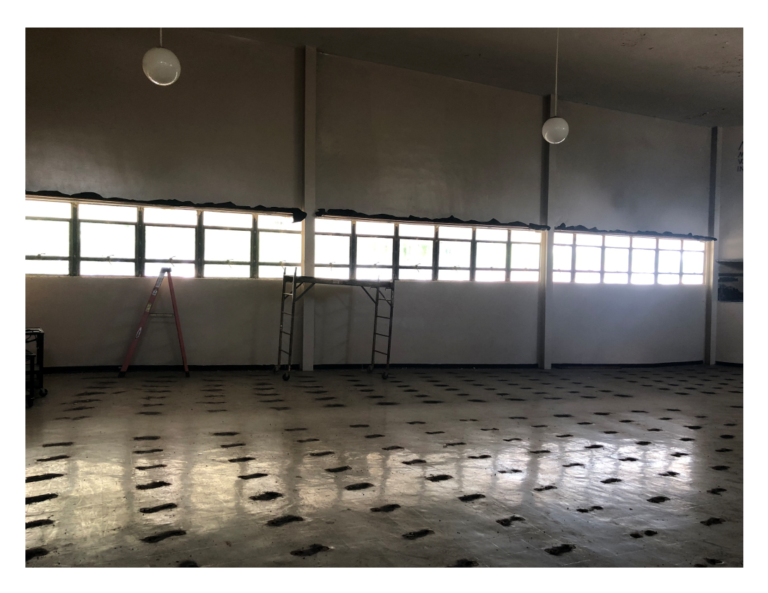
Figure 3 – Window Rehabilitation in Auditorium