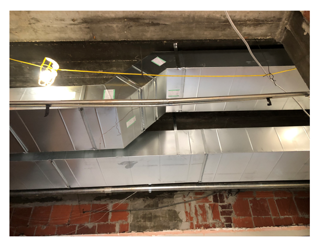
Figure 6 – New Ducting in Passage 116