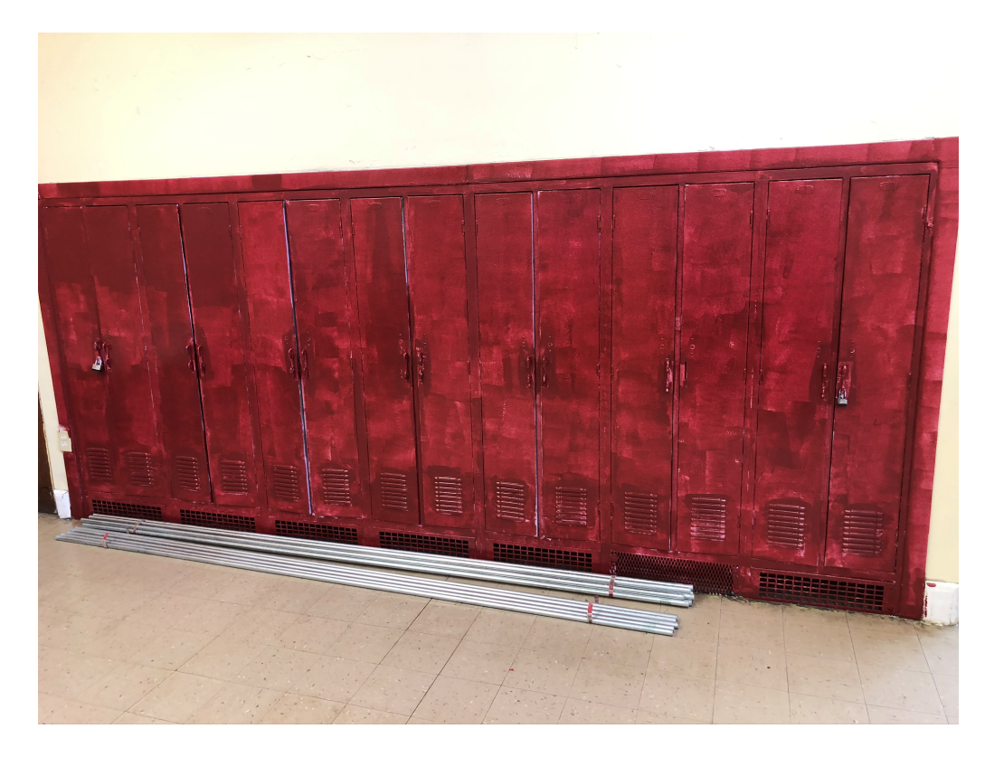
Figure 8 – Primed Lockers