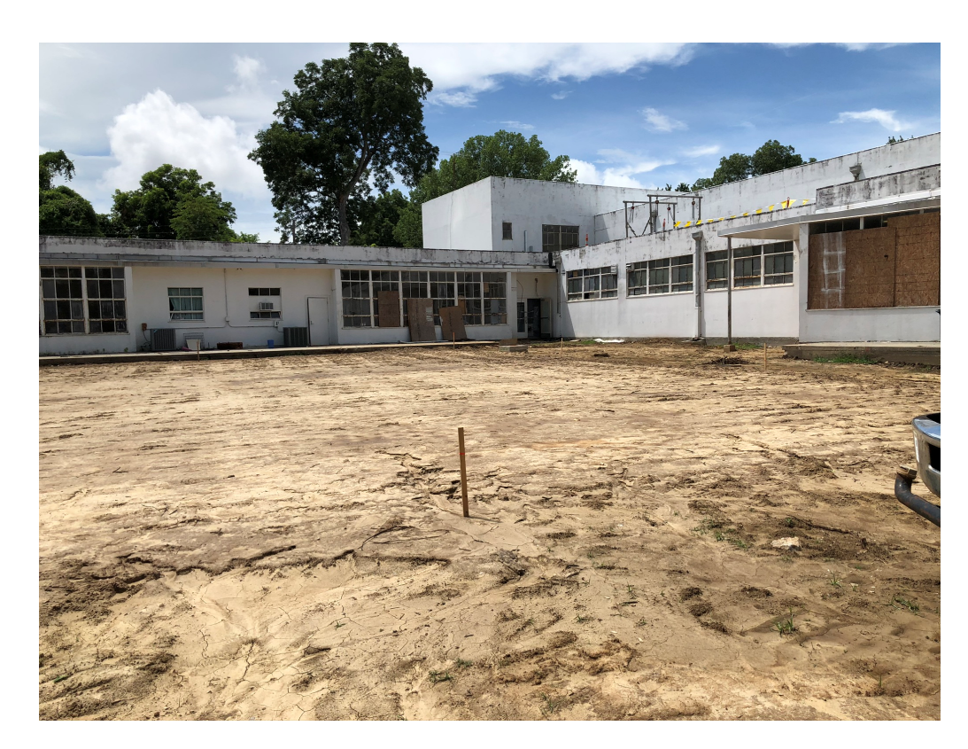
Figure 7 – Pad in Rear Yard