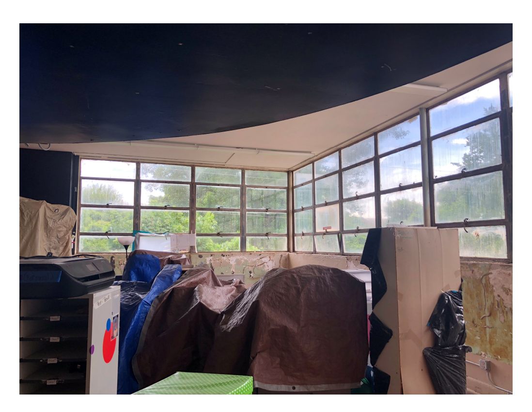
Figure 1 – Library 43 Window Uncovered