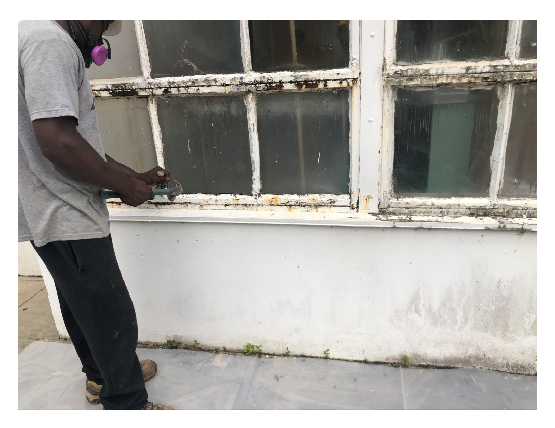
Figure 7 – Window Glazing Removal