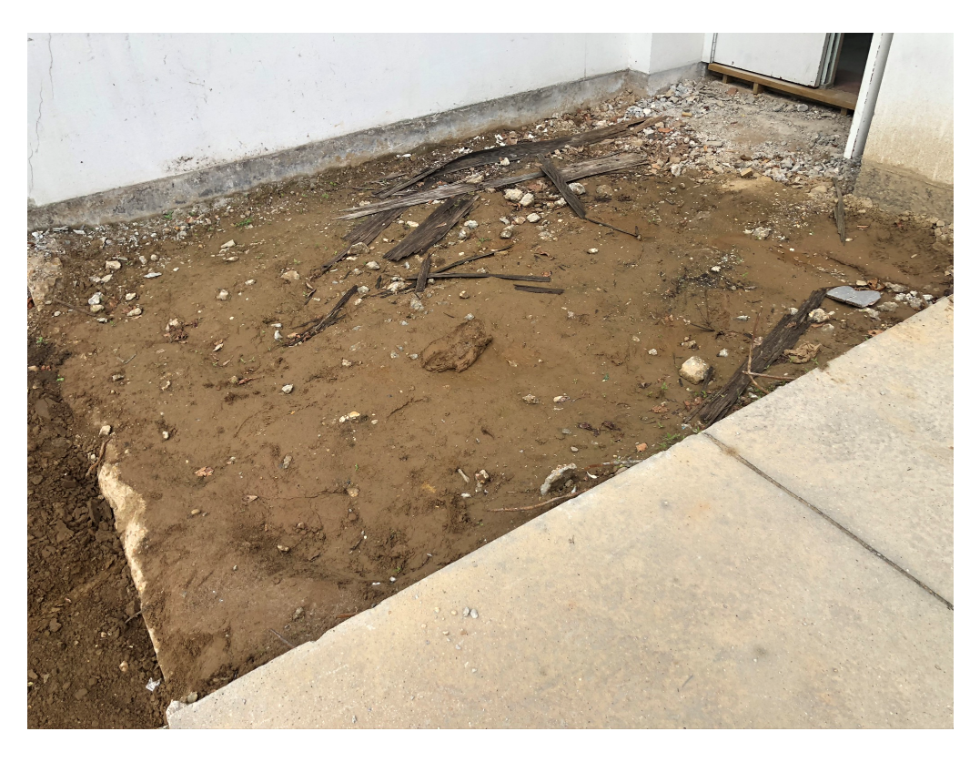
Figure 10 – Demoed Concrete in South Corner of Rear Yard