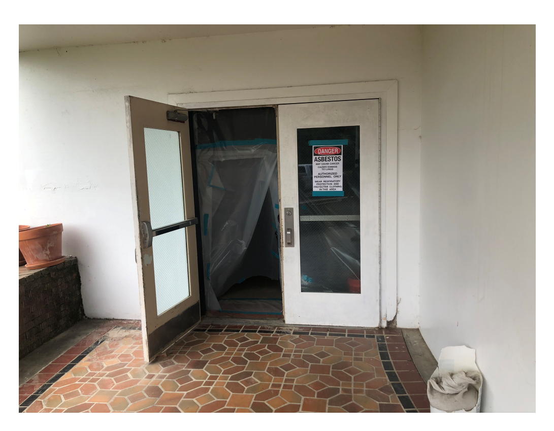
Figure 1 – Asbestos Protection Installed with Signage