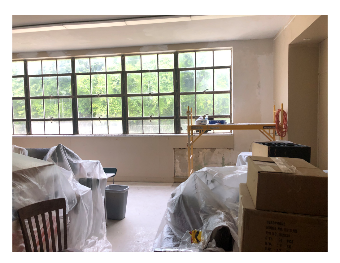
Figure 9 – Paint and Prep Ongoing