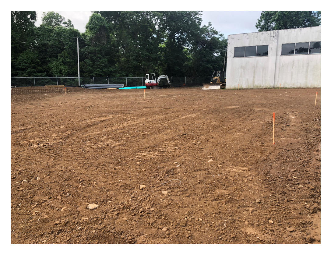
Figure 6 – Grading Stakes Set