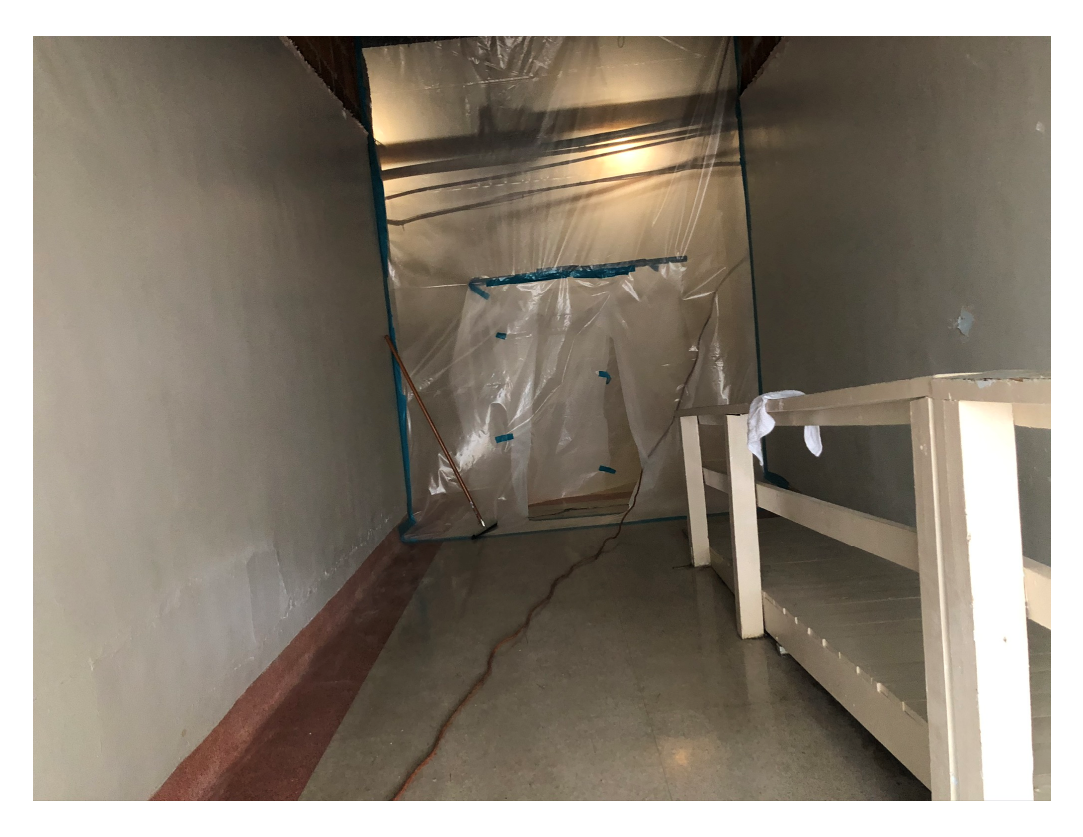
Figure 2 – Secondary Asbestos Plastic Protection