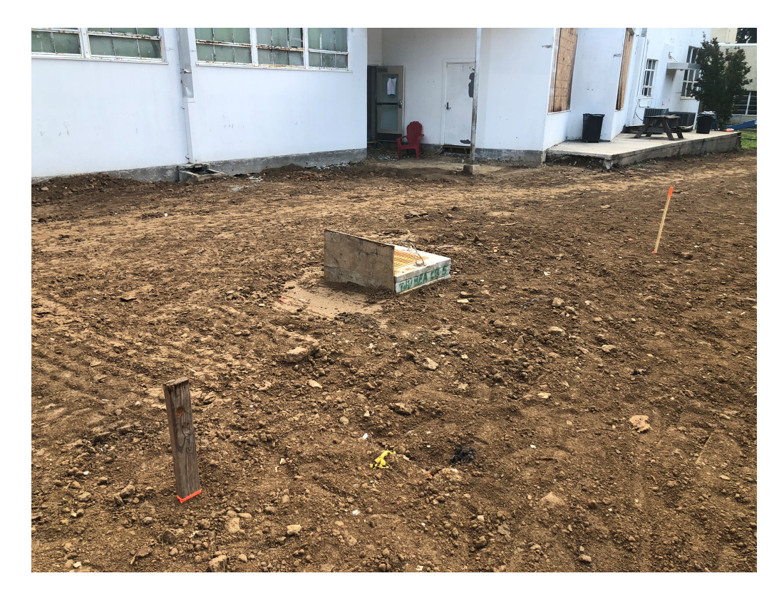
Figure 5 – Inlet Installed with Storm Drainage