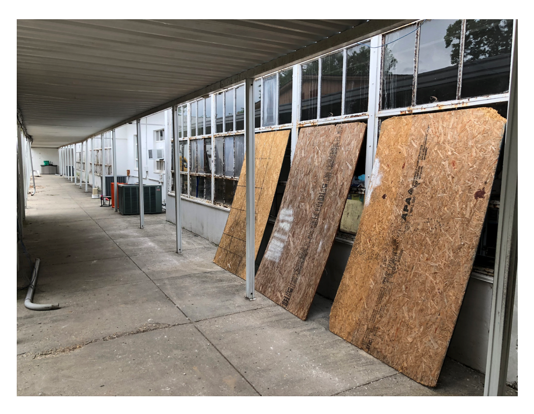
Figure 5 – Some Protection in place for windows