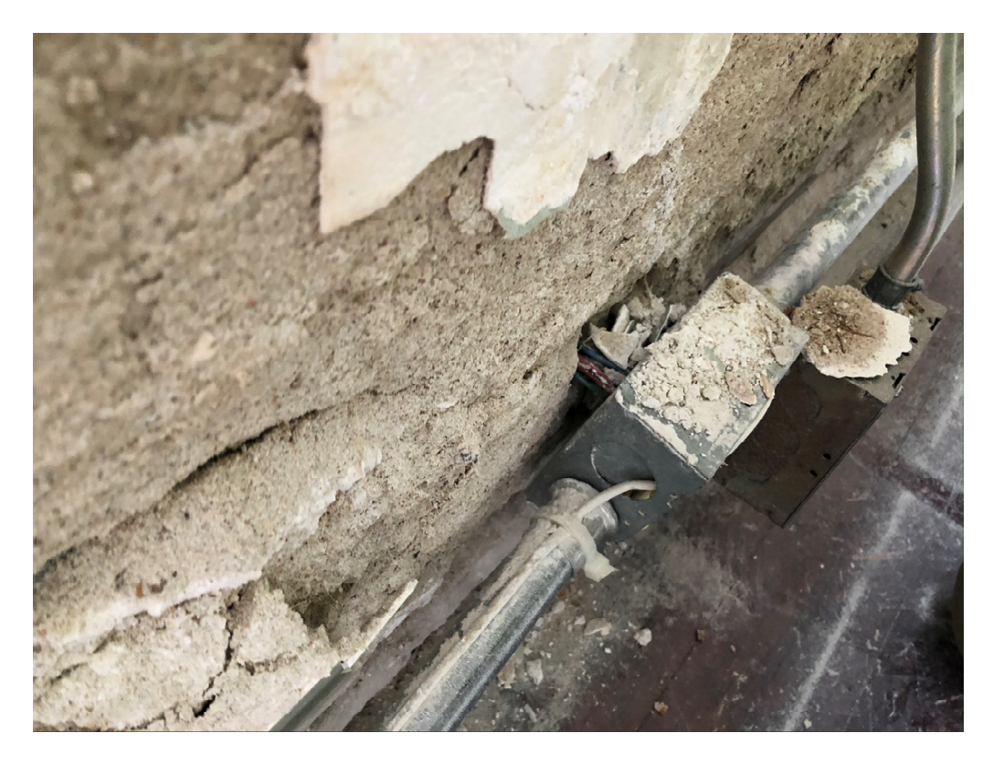
Figure 6 – Wire through wall is not in conduit