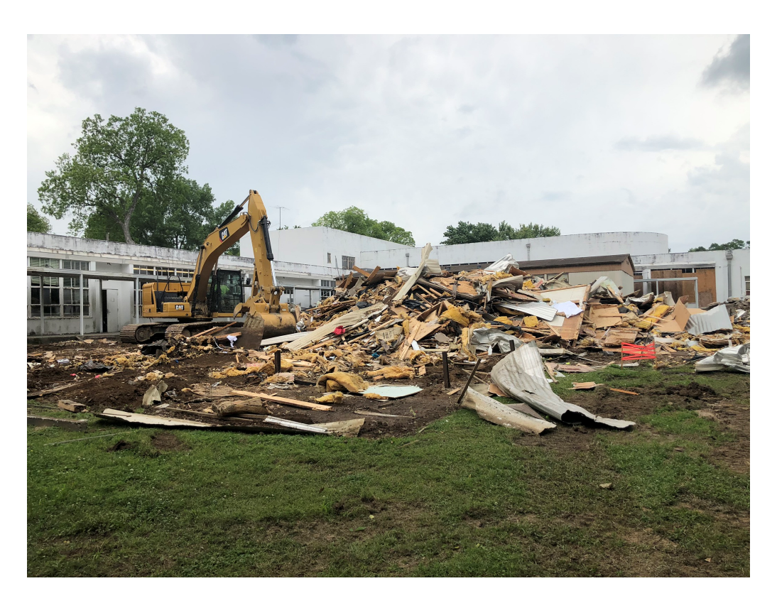
Figure 1 – Demo Work at Trailers