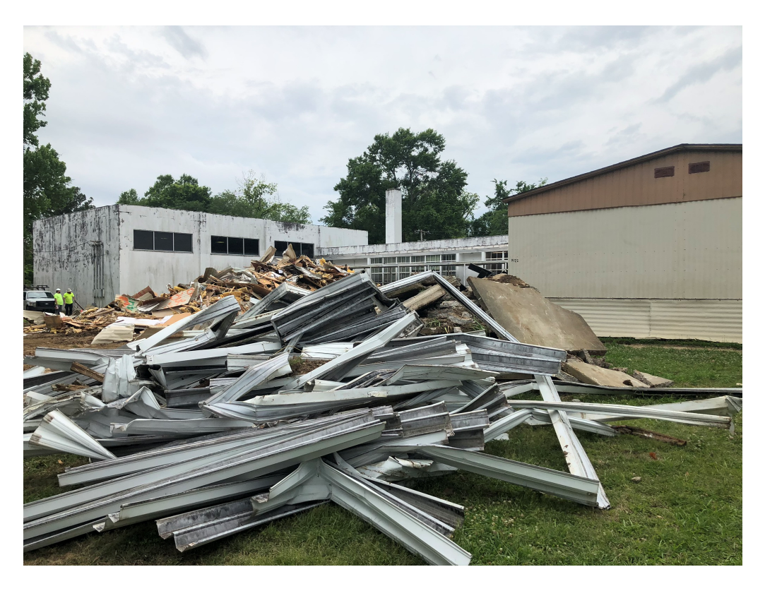
Figure 2 – Demo Work at Trailers