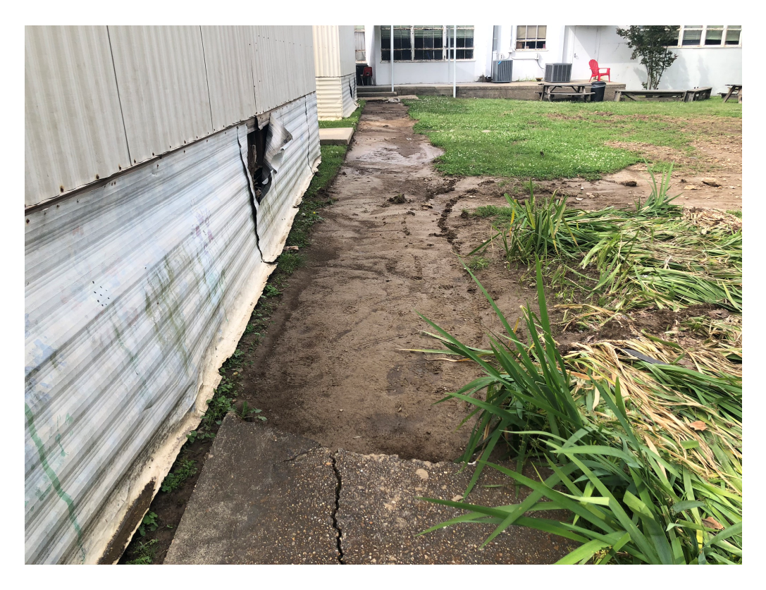
Figure 2 – Demo at Concrete Walk