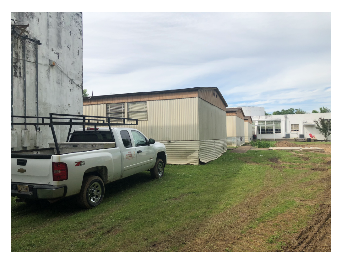
Figure 1 – Job Site