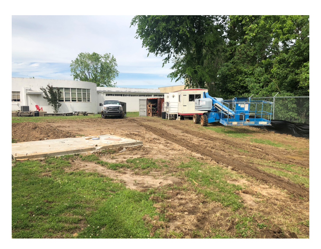
Figure 3 – Site Trailer