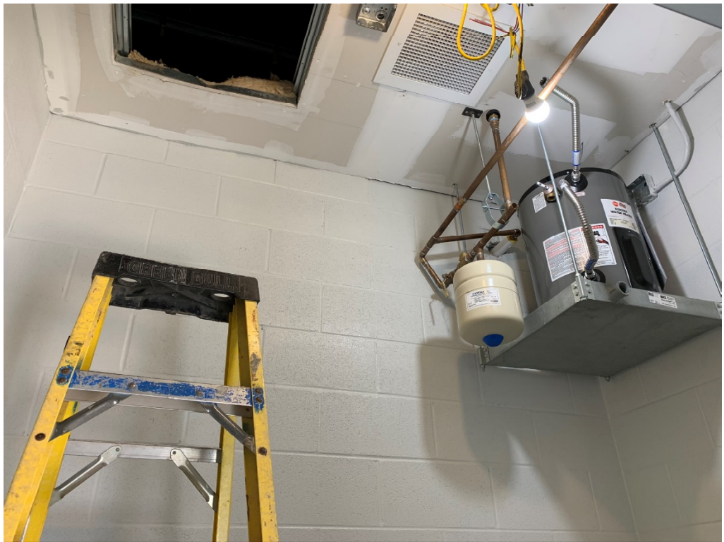
Figure 8 – Storage Room