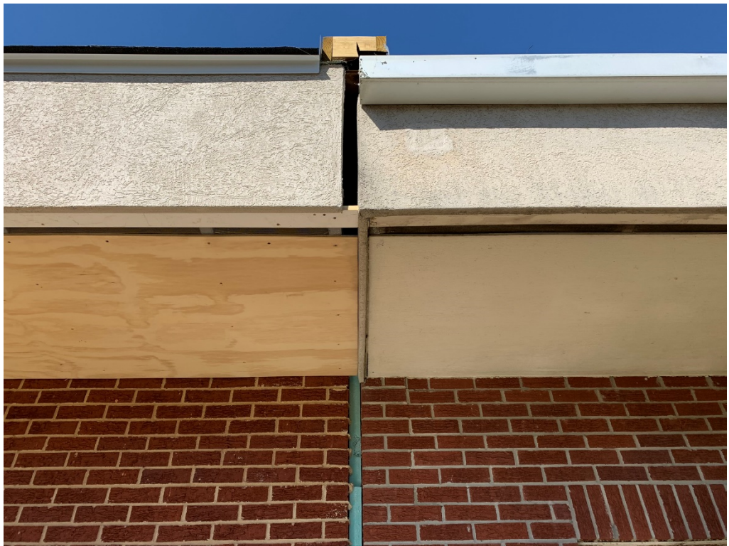
Figure 4 – How Will Joint Be Finished?