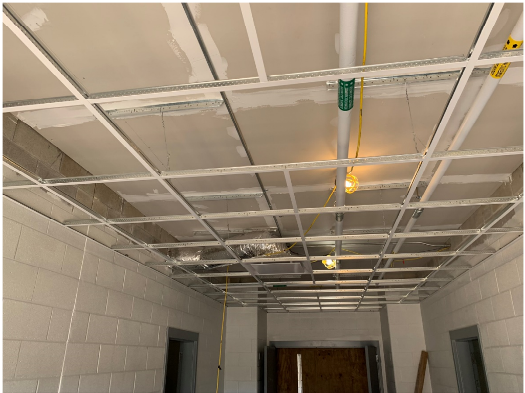
Figure 6 – Grid Installed at Addition