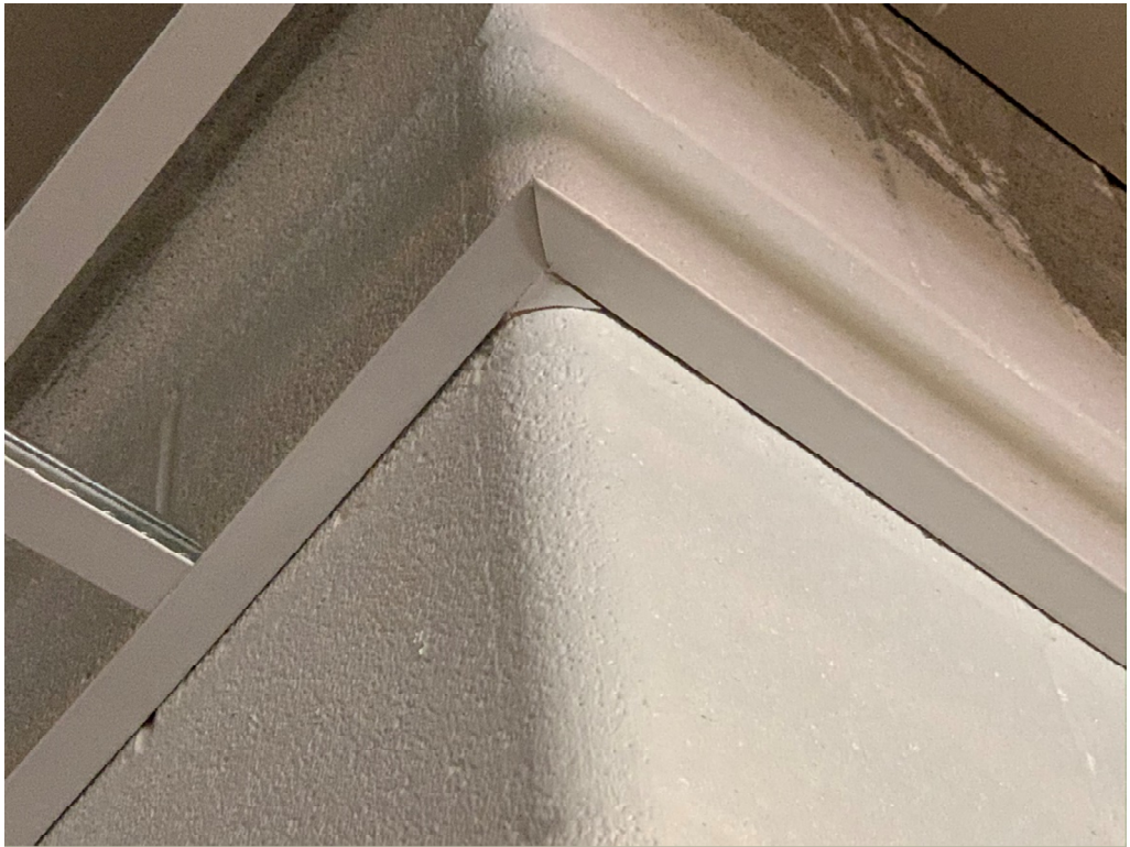
Figure 11 – Grid Corners in Room 101