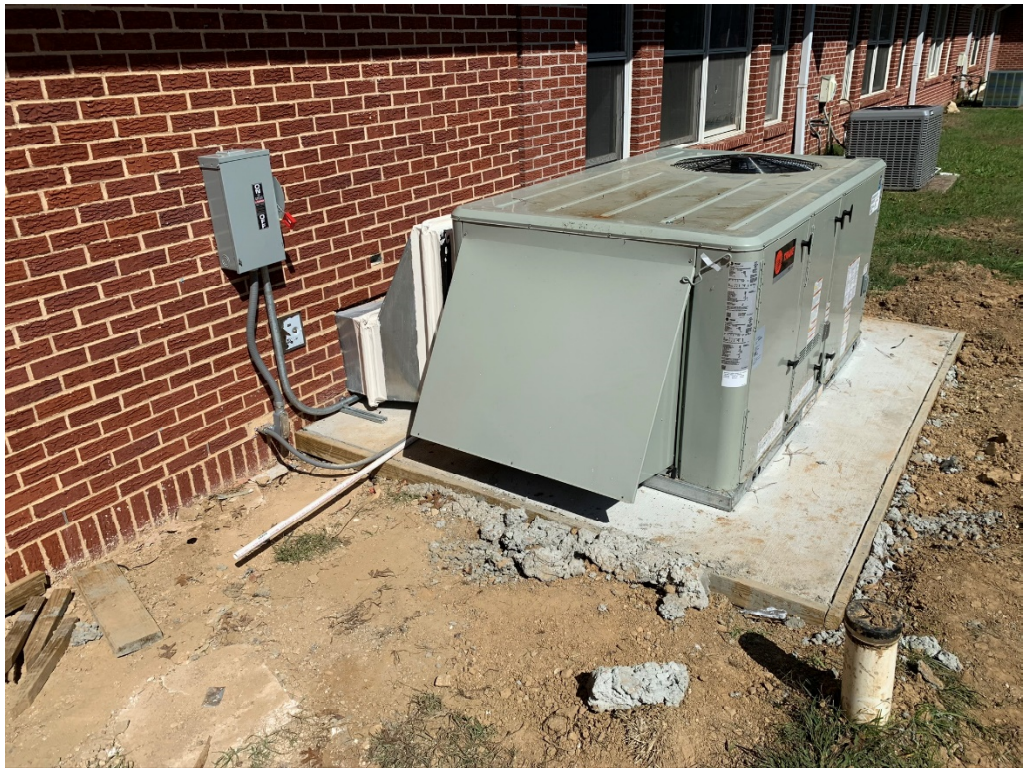
Figure 3 – Mechanical Equipment Installed