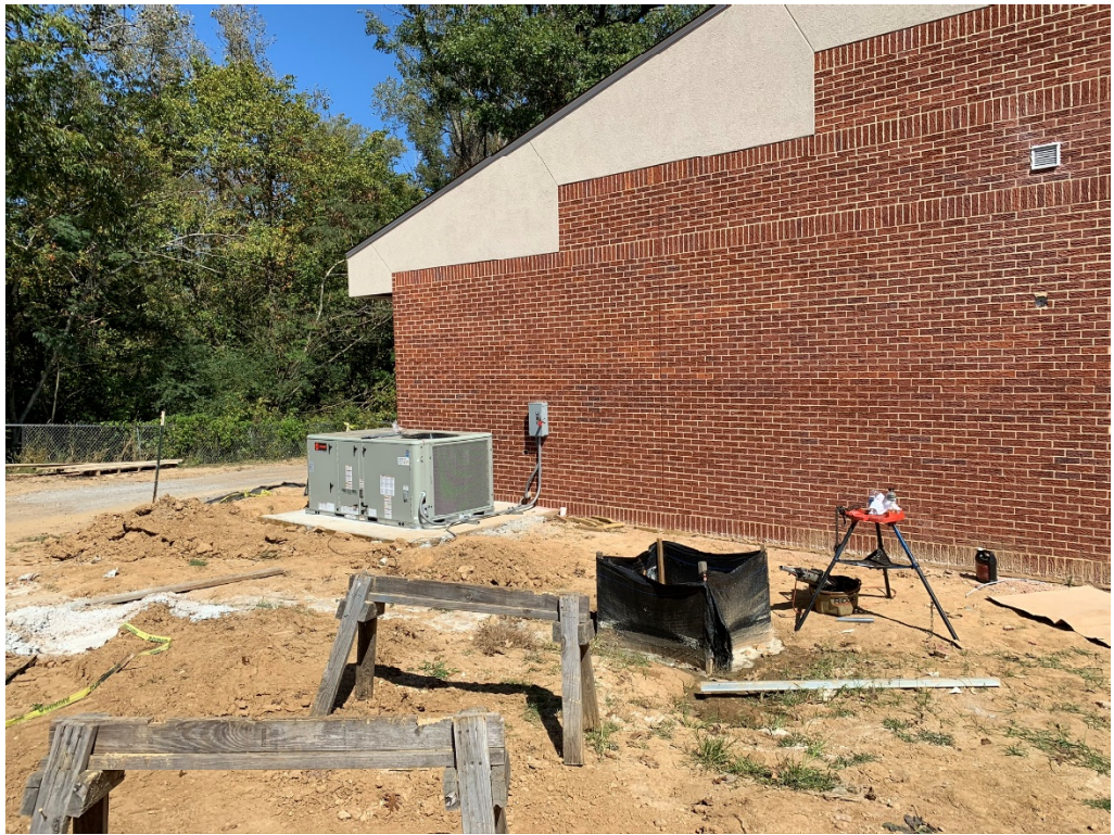
Figure 1 – Mech Equipment Installed