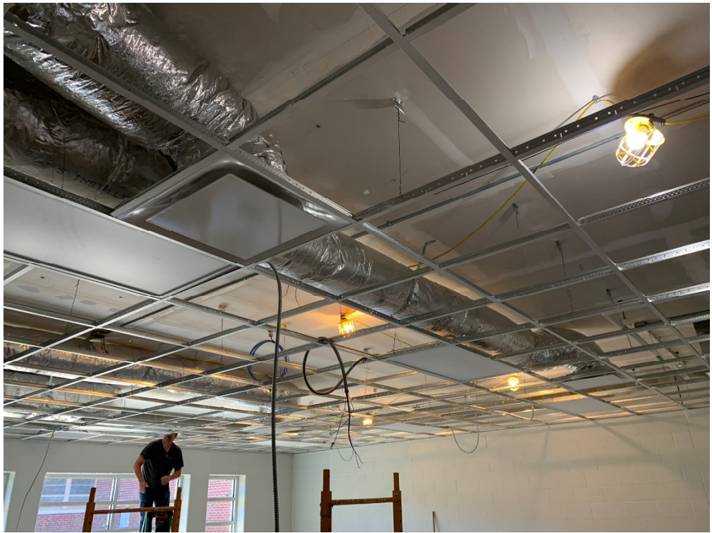
Figure 9 – Grid Installed at Class