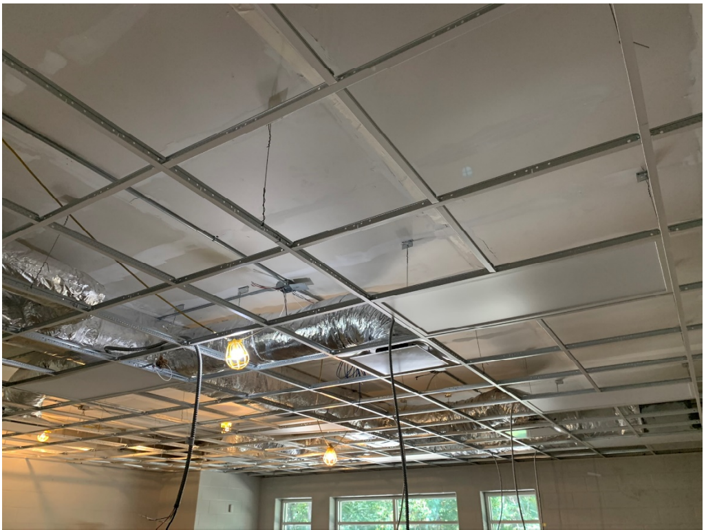
Figure 12 – Grid Installed at Class