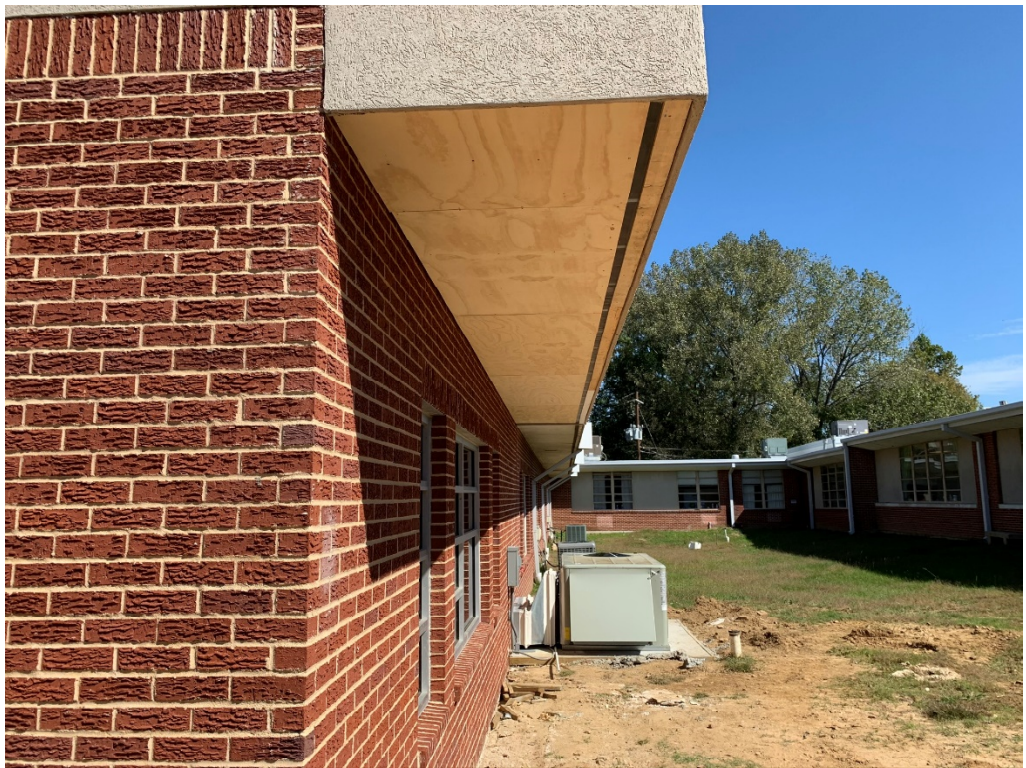
Figure 2 – Soffit Plywood Installed