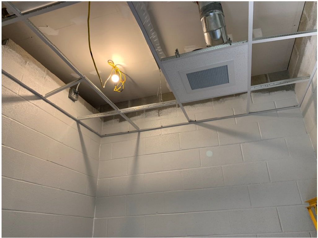
Figure 7 – Grid at Storage Room