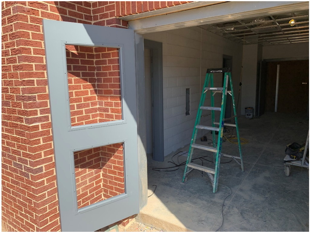
Figure 5 – Exit Doors Installed