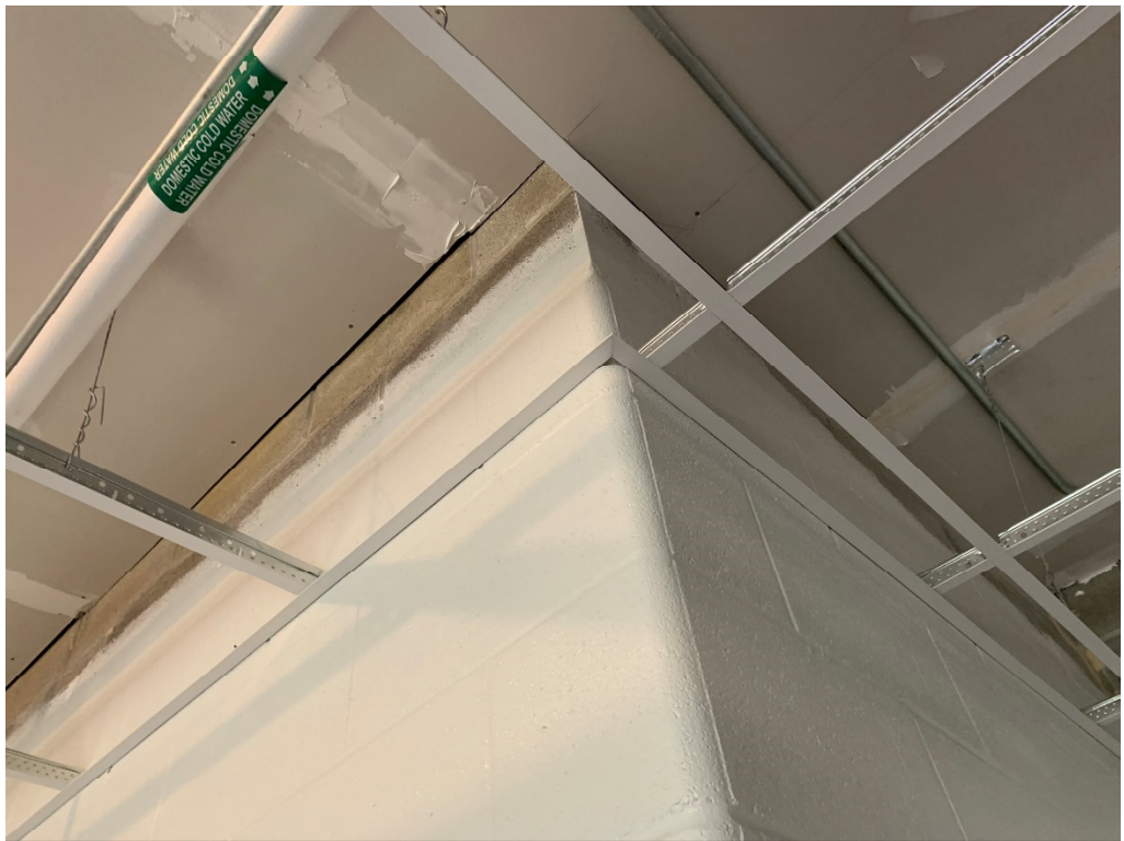
Figure 10 – Copy Detail from Grid Corners in Room 101 @ Room 102