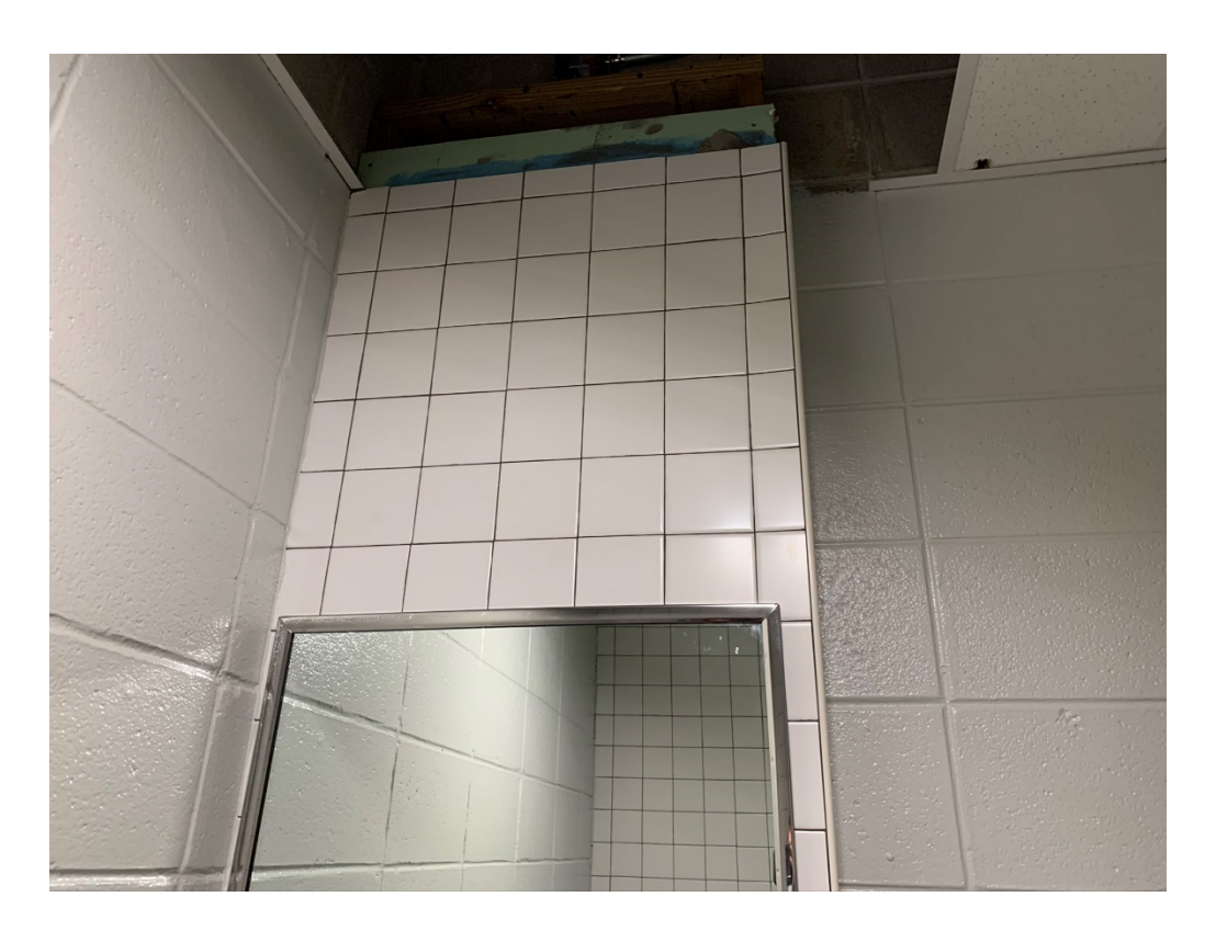
Figure 9 – Staff Toilet Ceiling Work Appears Ongoing