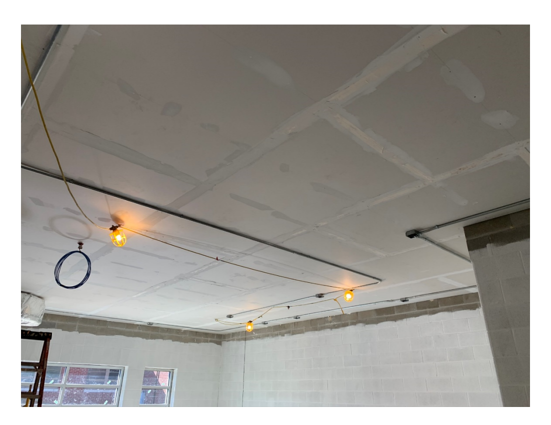
Figure 11 – Services Work at Hard Ceiling is Ongoing