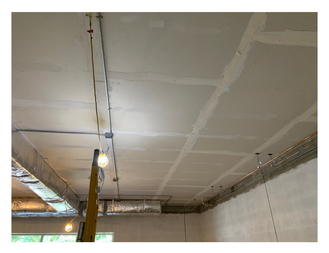
Figure 13 – Services Work at Hard Ceiling is Ongoing