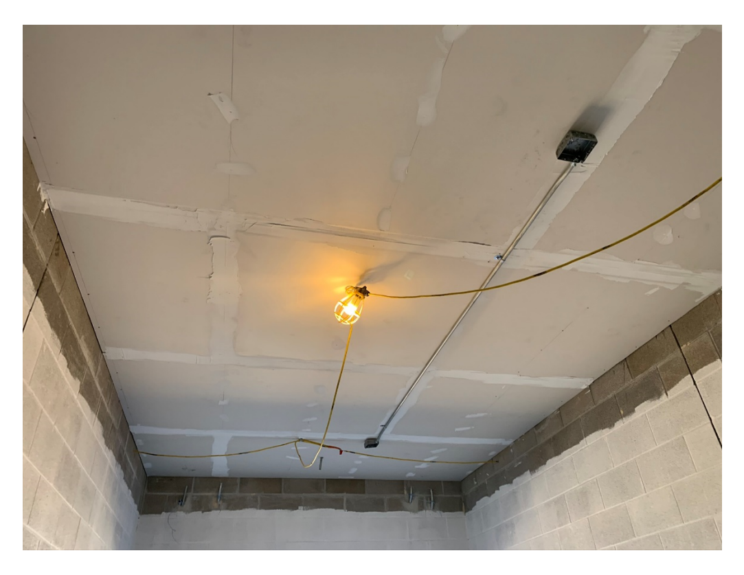
Figure 12 – Services Work at Hard Ceiling is Ongoing