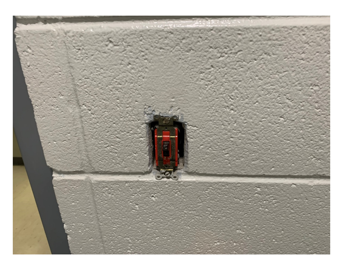
Figure 7 – Several Electrical Code Violations need to be Remedied ASAP