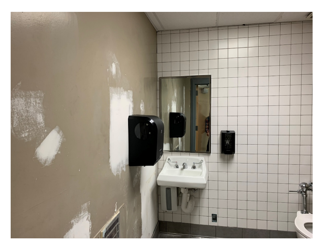
Figure 1 – Teacher Bathroom in South Hall