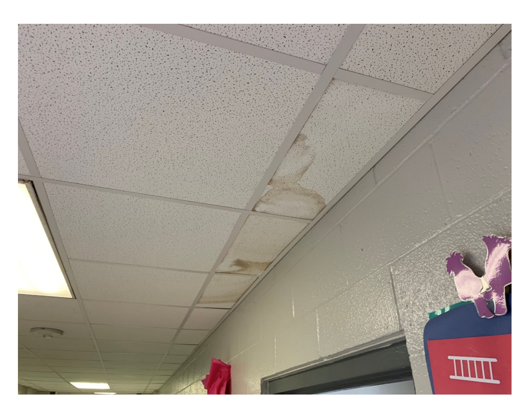
Figure 5 – A New Leak at ceiling Tile Near Class Near Auditorium