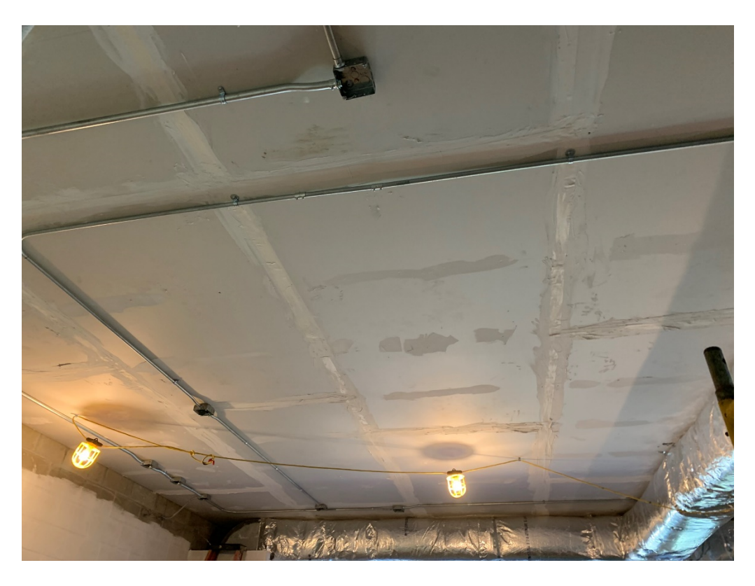
Figure 14 – Services Work at Hard Ceiling is Ongoing