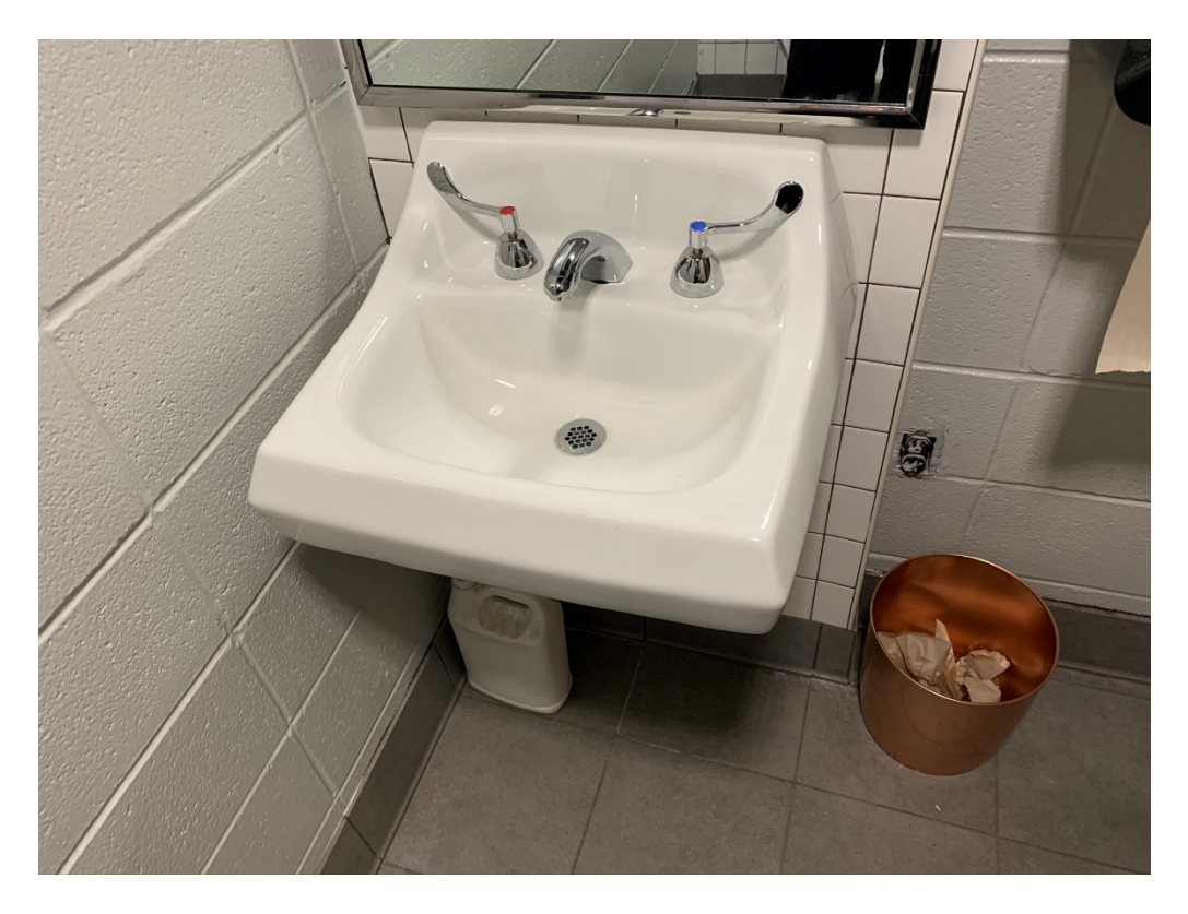
Figure 8 – Several Electrical Code Violations need to be Remedied ASAP