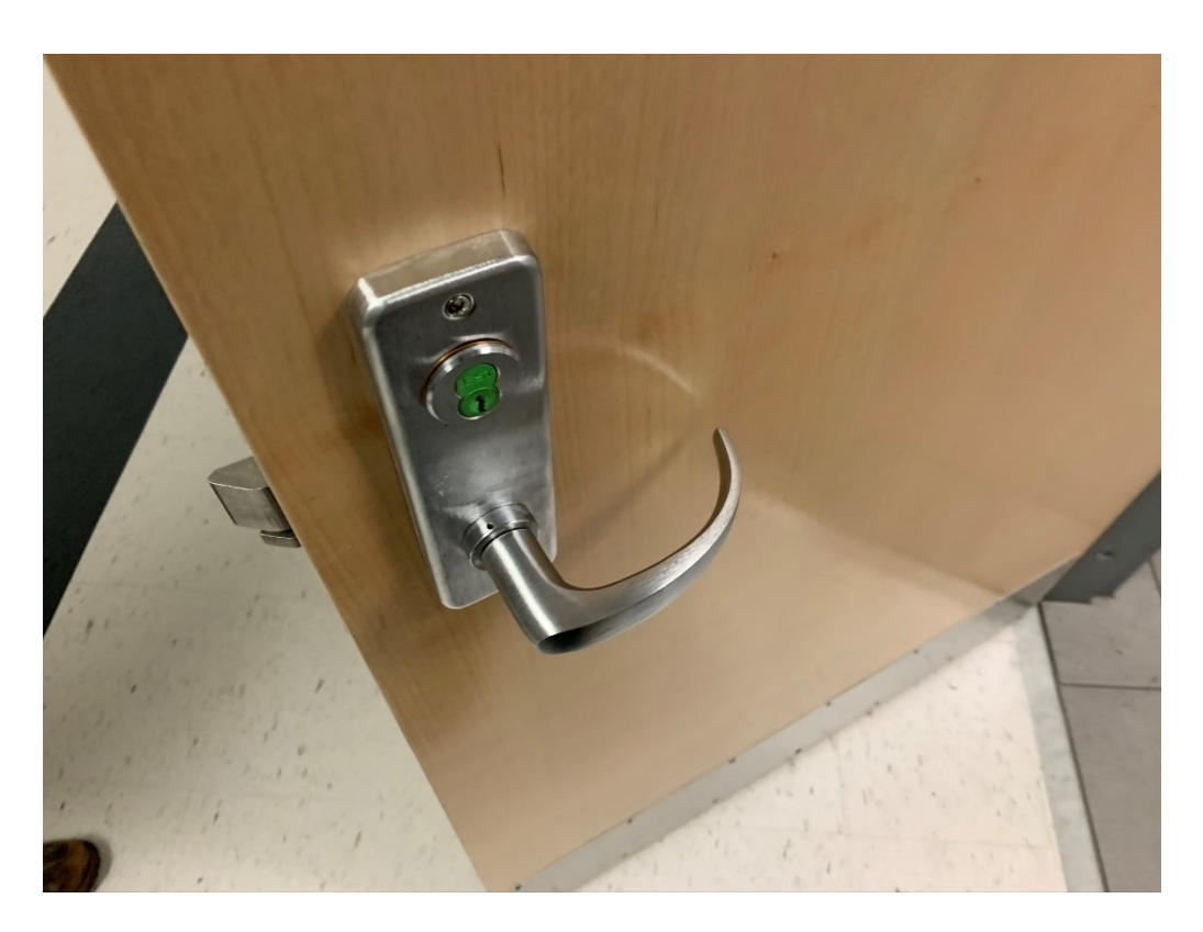
Figure 3 – Hardware at Teacher Bathroom in South Hall