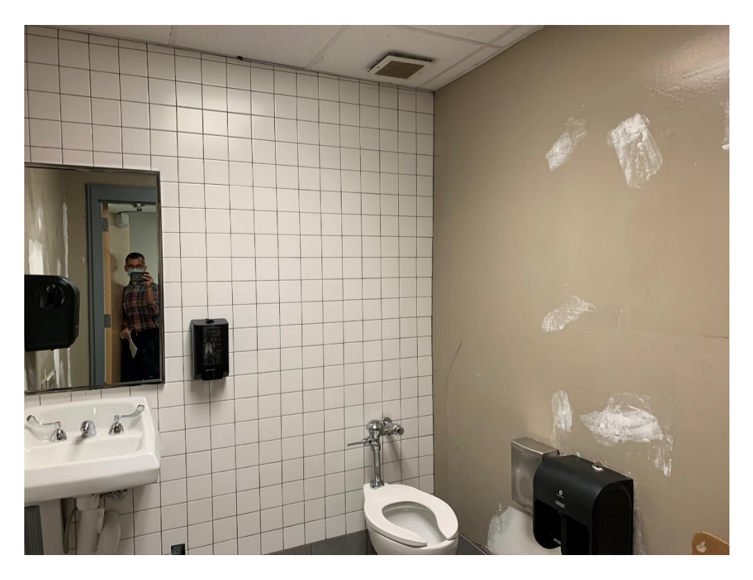
Figure 2 – Teacher Bathroom in South Hall