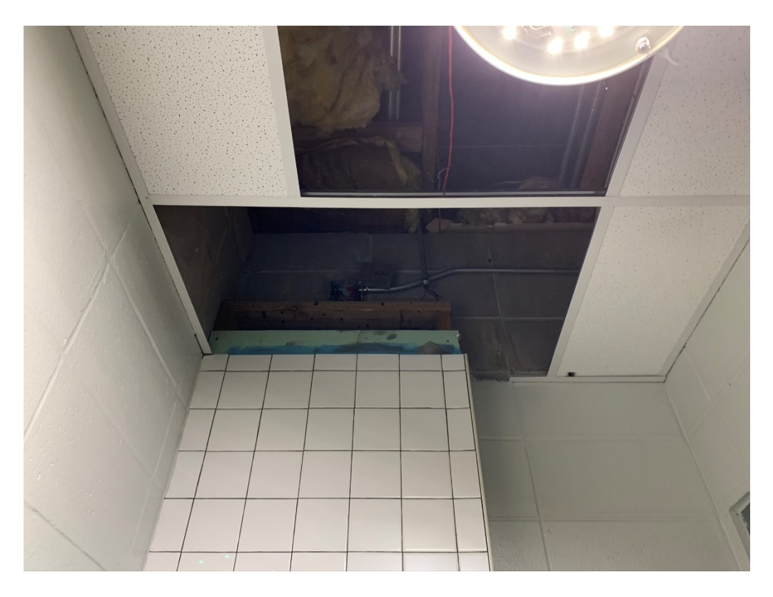
Figure 10 – Staff Toilet Ceiling Work Appears Ongoing