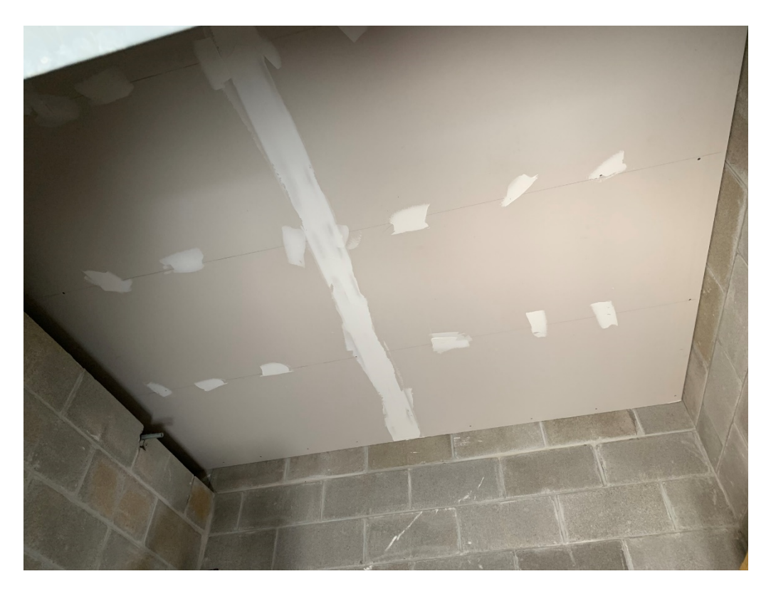
Figure 6 – Hard Ceiling Installed and Level 1 Finish Applied