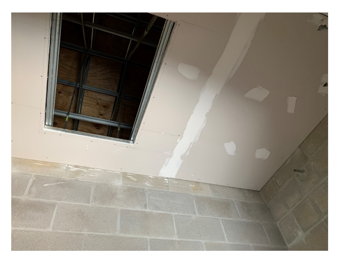
Figure 7 – Hard Ceiling Installed and Level 1 Finish Applied