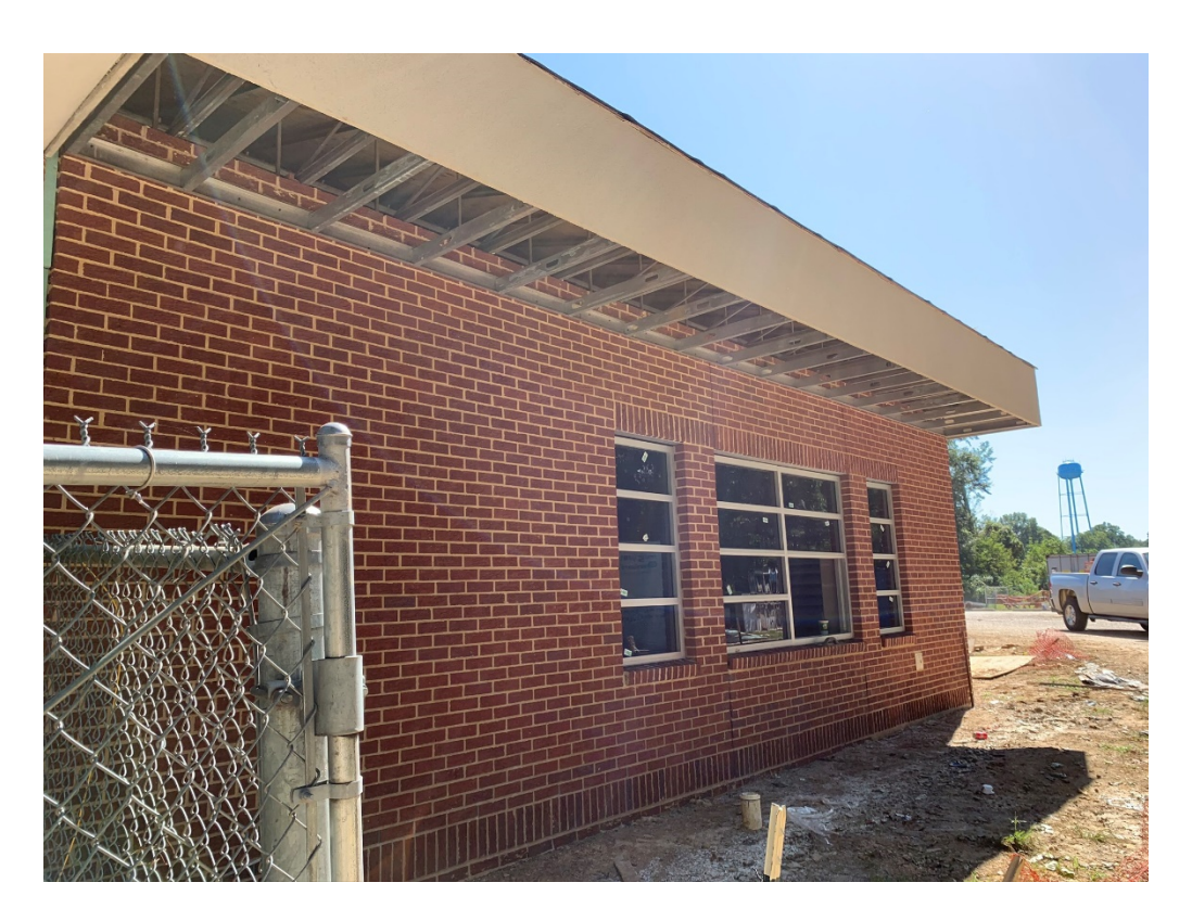
Figure 1 – Exterior Work Ongoing