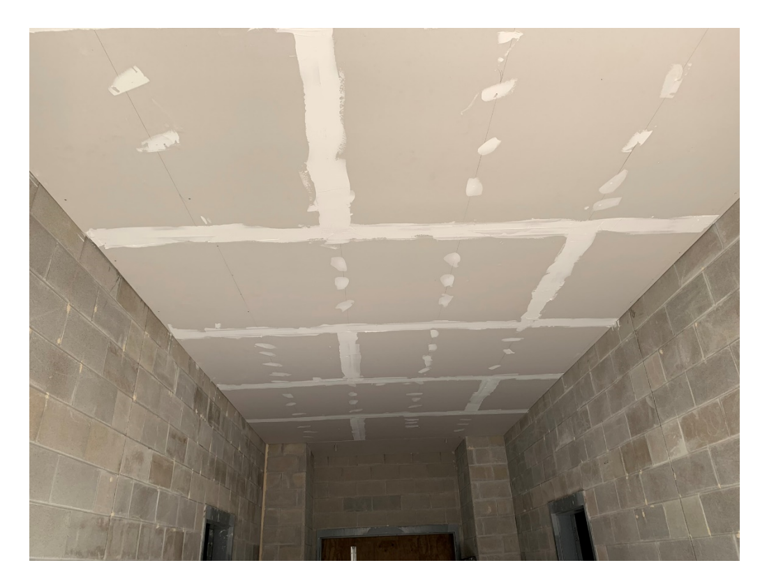
Figure 5 – Hard Ceiling Installed and Level 1 Finish Applied