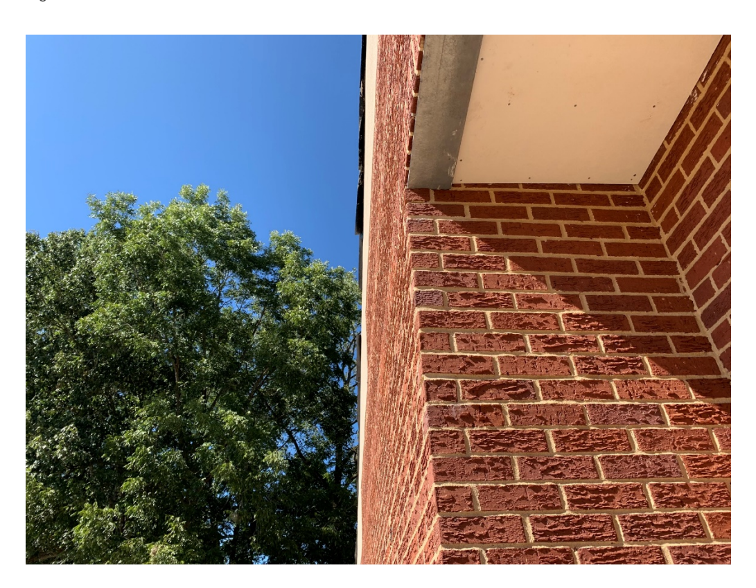
Figure 4 – Exterior Finish