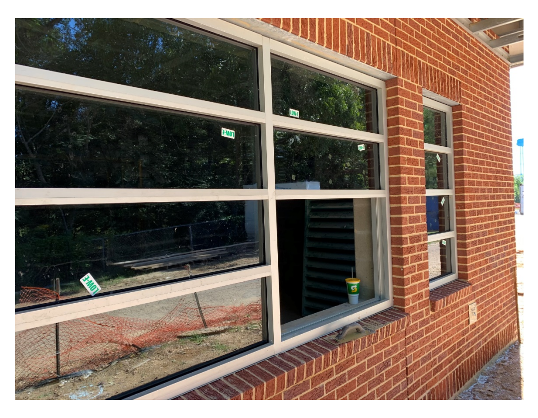
Figure 2 – Glazing in Place; awaiting egress panel