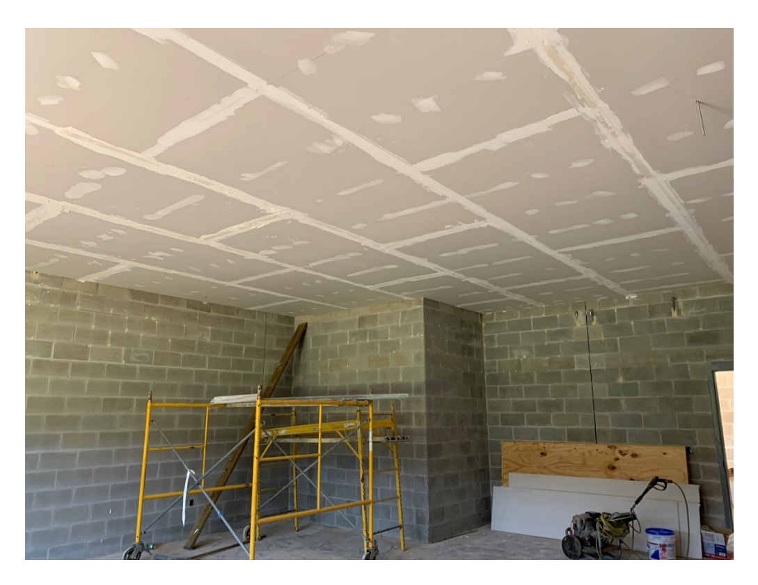
Figure 11 – Hard Ceiling Installed and Level 1 Finish Applied