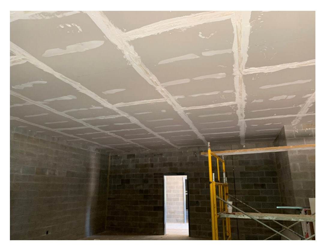
Figure 8 – Hard Ceiling Installed and Level 1 Finish Applied