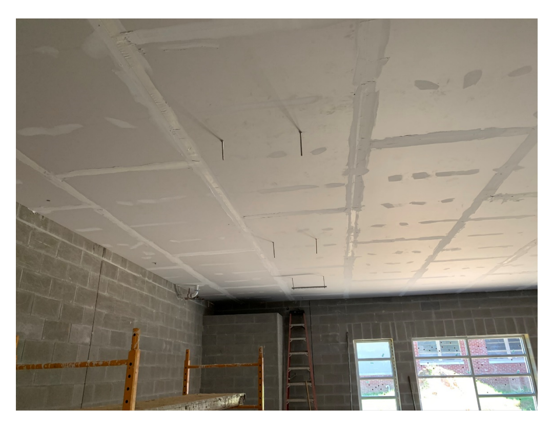
Figure 10 – Hard Ceiling Installed and Level 1 Finish Applied