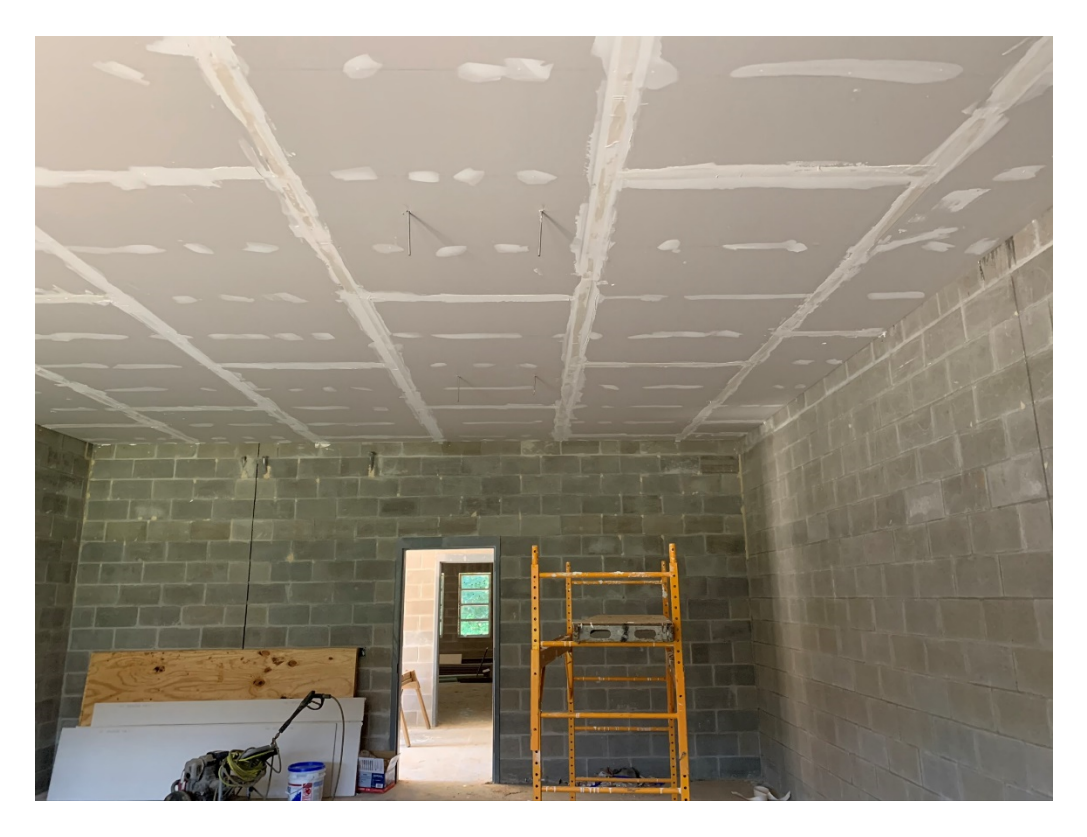
Figure 12 – Hard Ceiling Installed and Level 1 Finish Applied