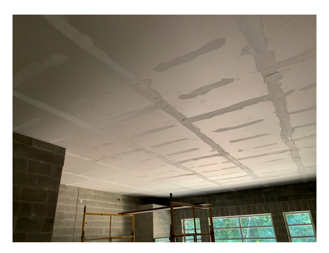
Figure 9 – Hard Ceiling Installed and Level 1 Finish Applied