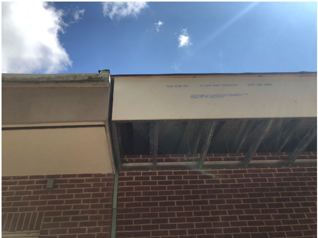
Figure 2 – Soffit Framing and Sheathing is Complete