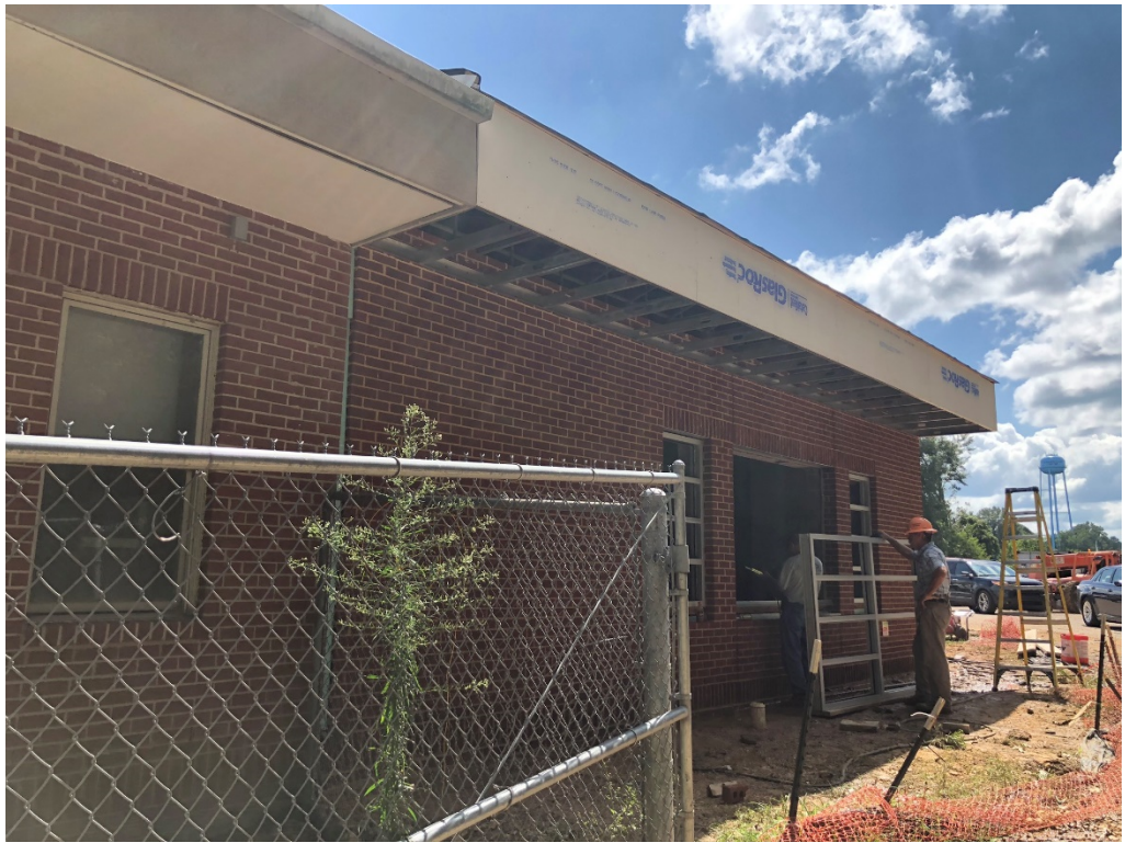
Figure 1 – Soffit Framing and Sheathing is Complete