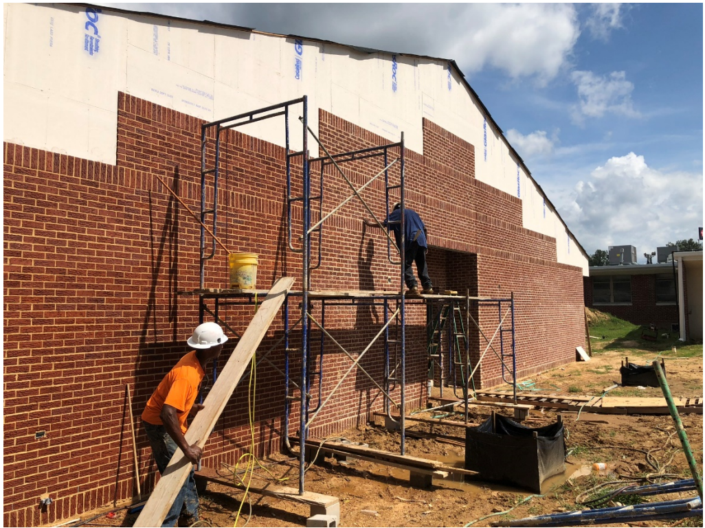
Figure 7 – Workers Setting Scaffold for Exterior Finish Work