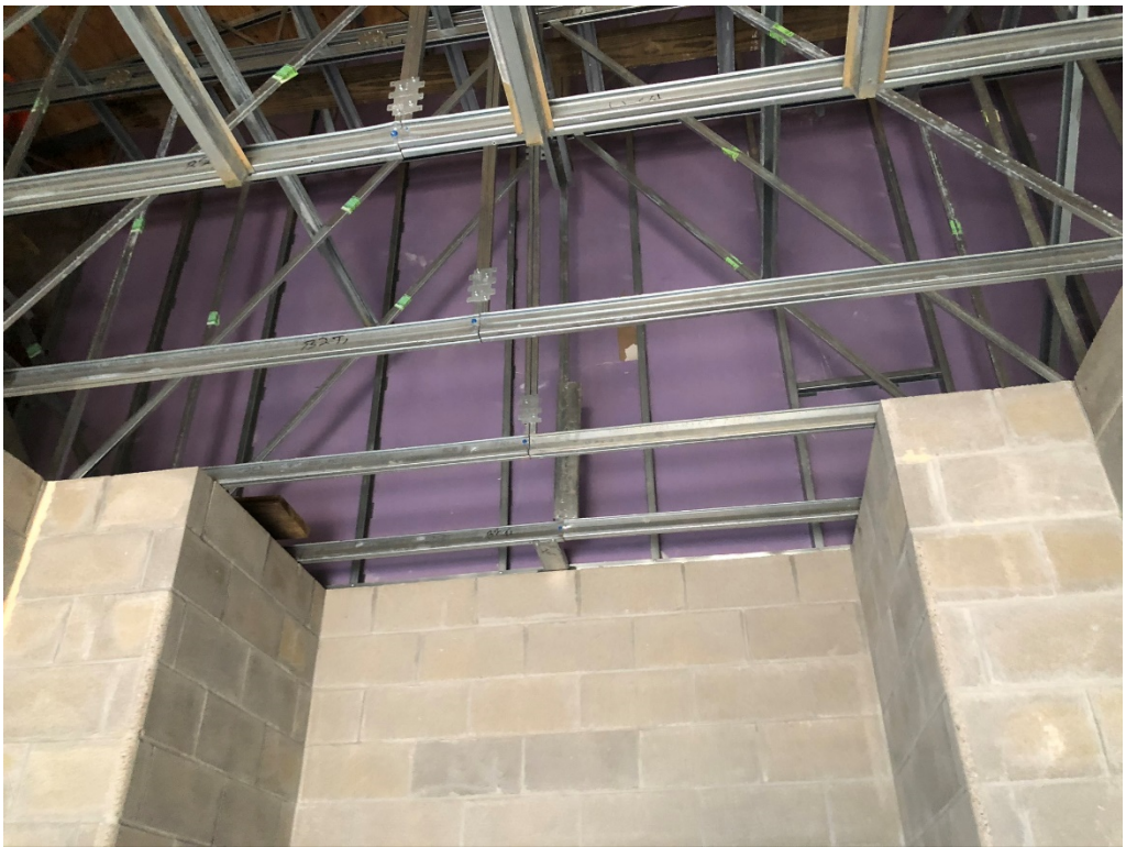
Figure 12 – Interior Firewall Installed