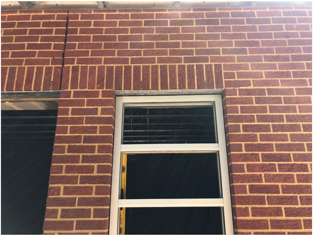
Figure 5 – Storefront Window Installed