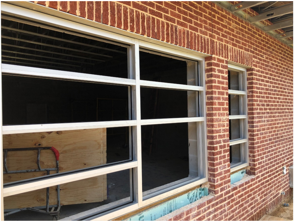
Figure 9 – Storefront Installed