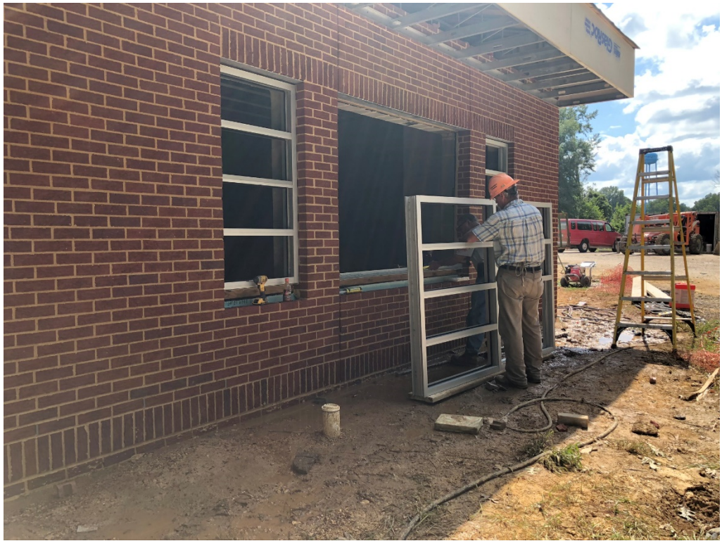
Figure 3 – Storefront Install Ongoing