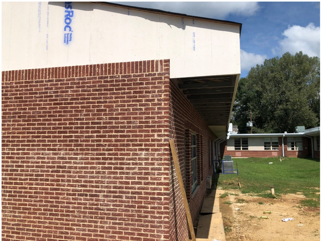
Figure 8 – Soffit Framing and Sheathing Installed