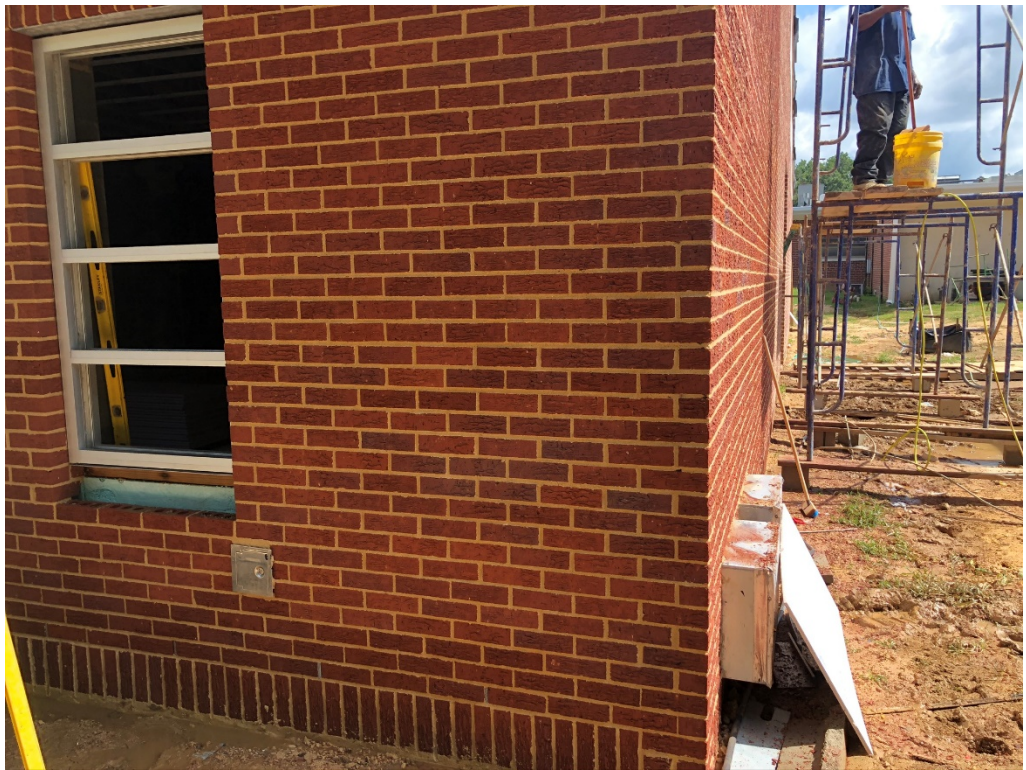
Figure 4 – Most Windows are Complete