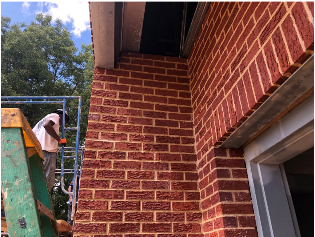
Figure 10 – Brick Work at Entry Setback