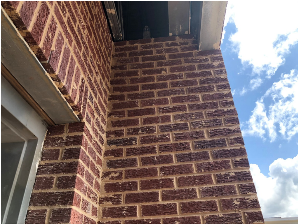
Figure 11 – Brick Work at Entry Setback