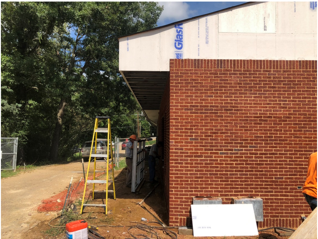
Figure 6 – Soffit Work