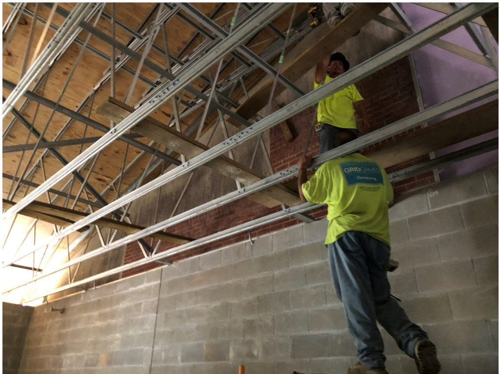
Figure 14 – Interior Firewall Installation