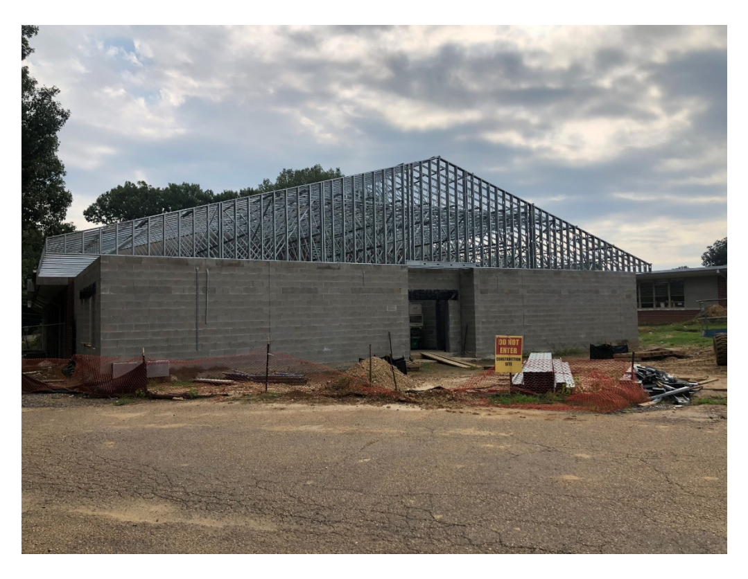
Figure 1 – Metal Trusses Complete and Ready for Decking