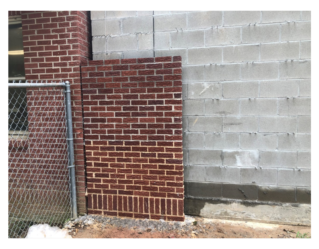
Figure 2 – Masonry Sample Wall