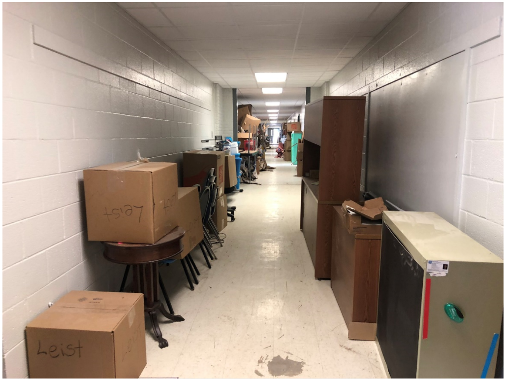
Figure 5 – South Corridor