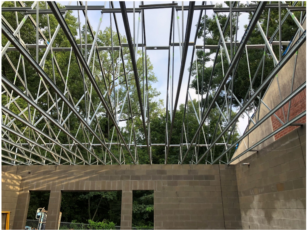
Figure 3 – Truss Install