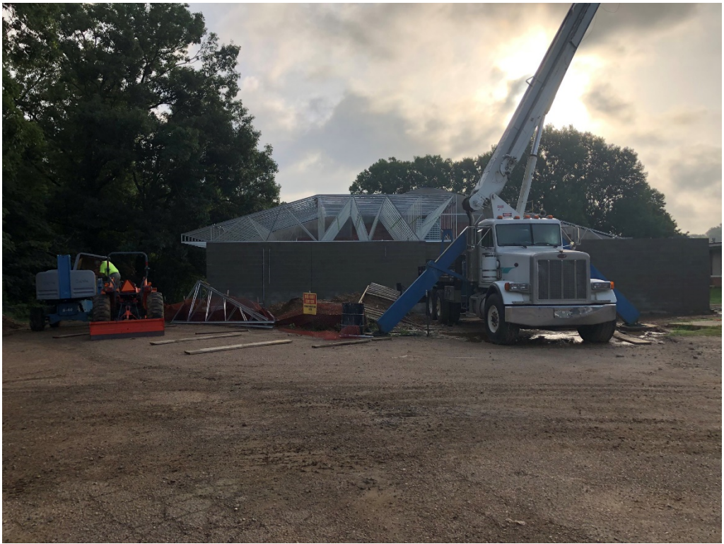
Figure 1 – Truss Install