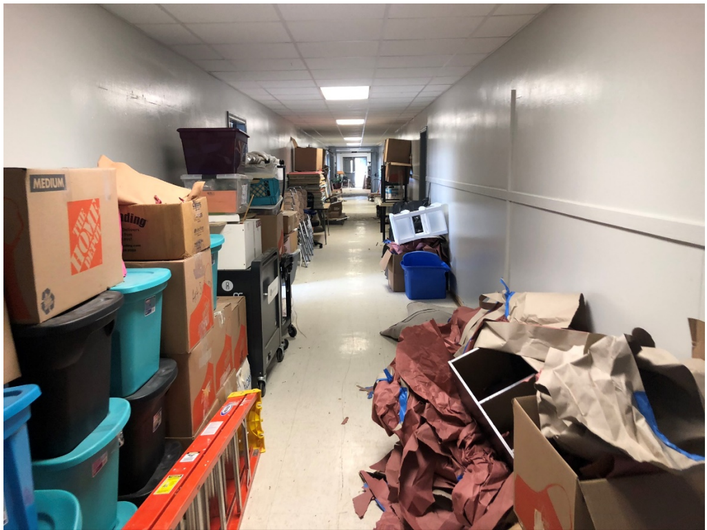
Figure 6 – South Corridor