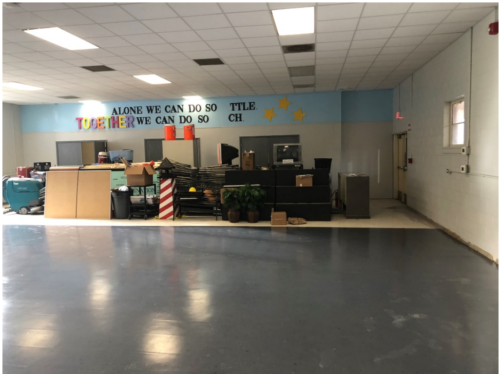
Figure 4 – Partially Completed Floors at Auditorium