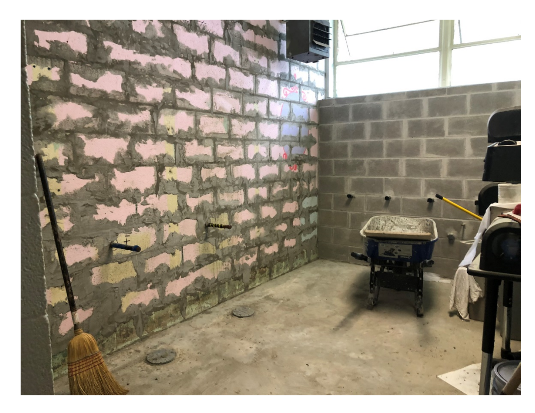
Figure 5 – Wall Patch In Progress at Existing CMU