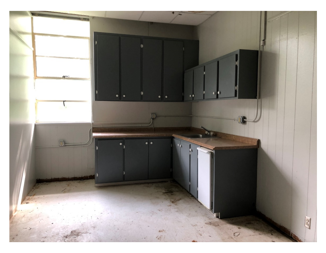
Figure 6 – Cabs Painted; paint, overall, is ongoing