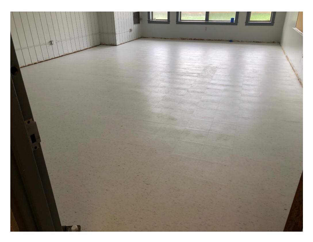
Figure 7 – VCT Install at North hall Classrooms is ongoing