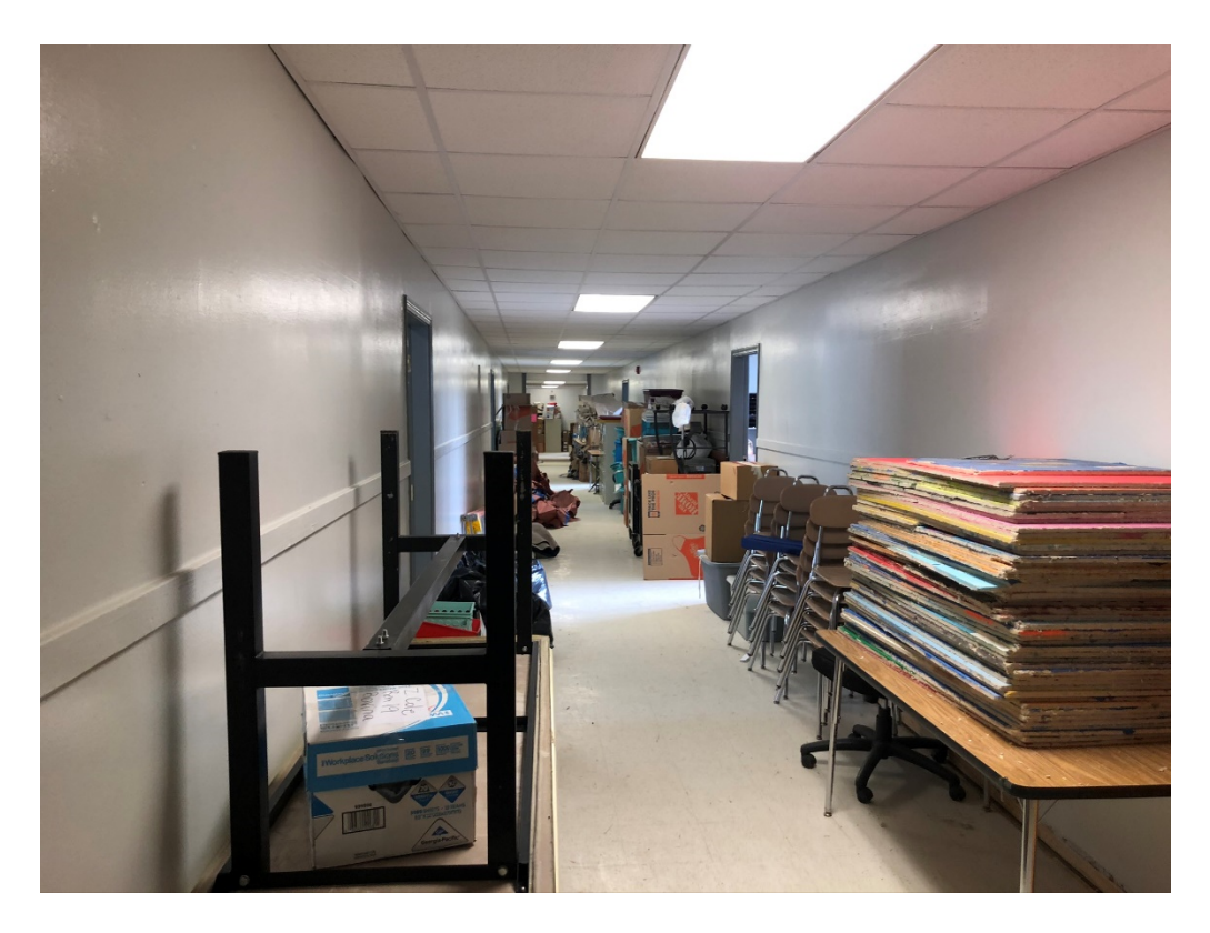
Figure 3 – After Contractor cleared hall, teachers moved items back into hall when swapping rooms; This could impede progress soon if not cleared for VCT install at Hallway