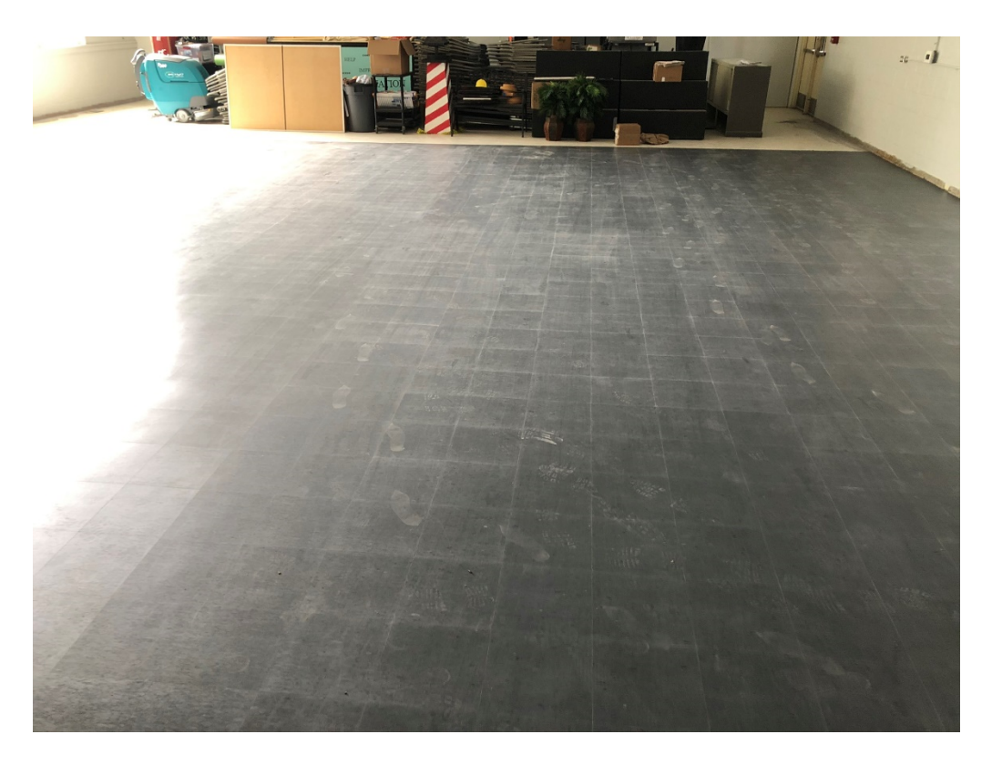
Figure 1 – VCT Tile Installation at Auditorium