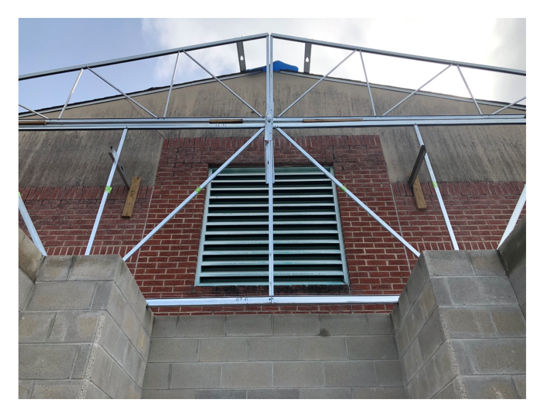
Figure 8 – Truss set at Addition