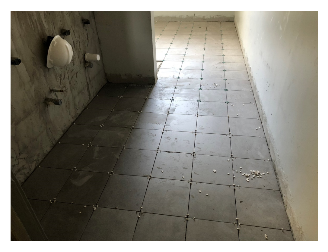
Figure 2 – Tile Work in progress at Bathrooms