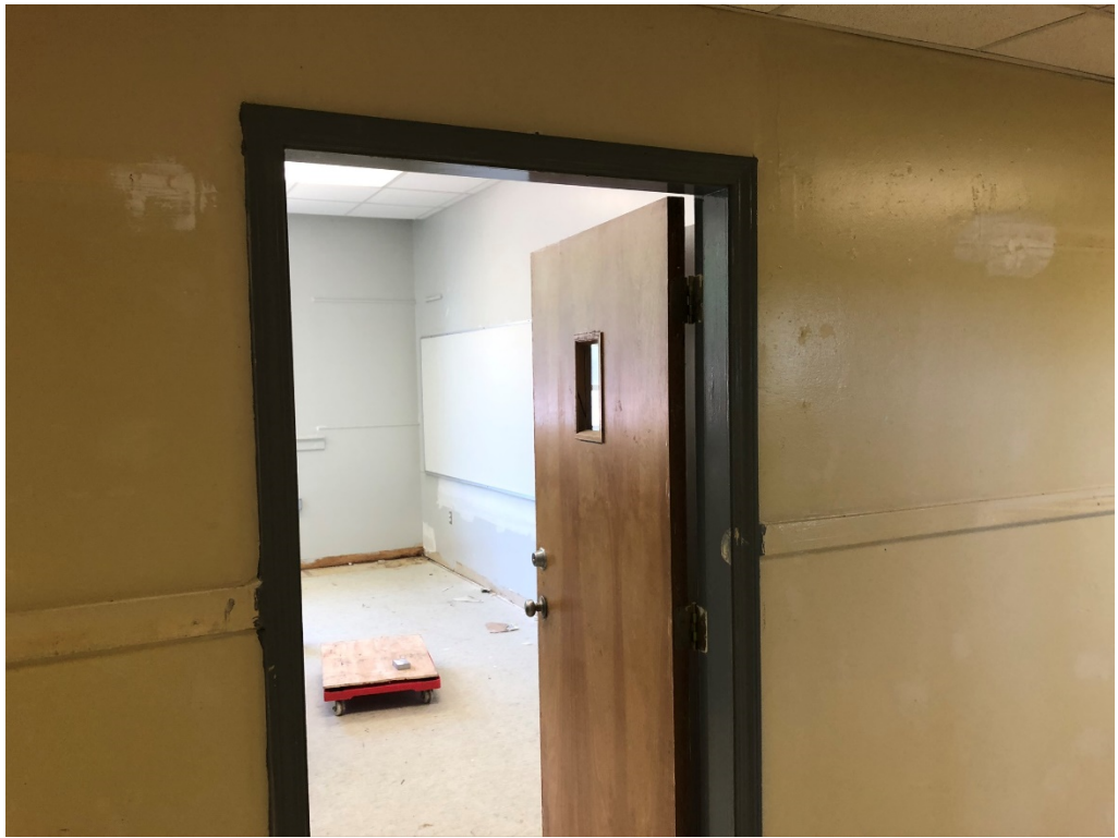
Figure 11 – Some trim paint has been applied