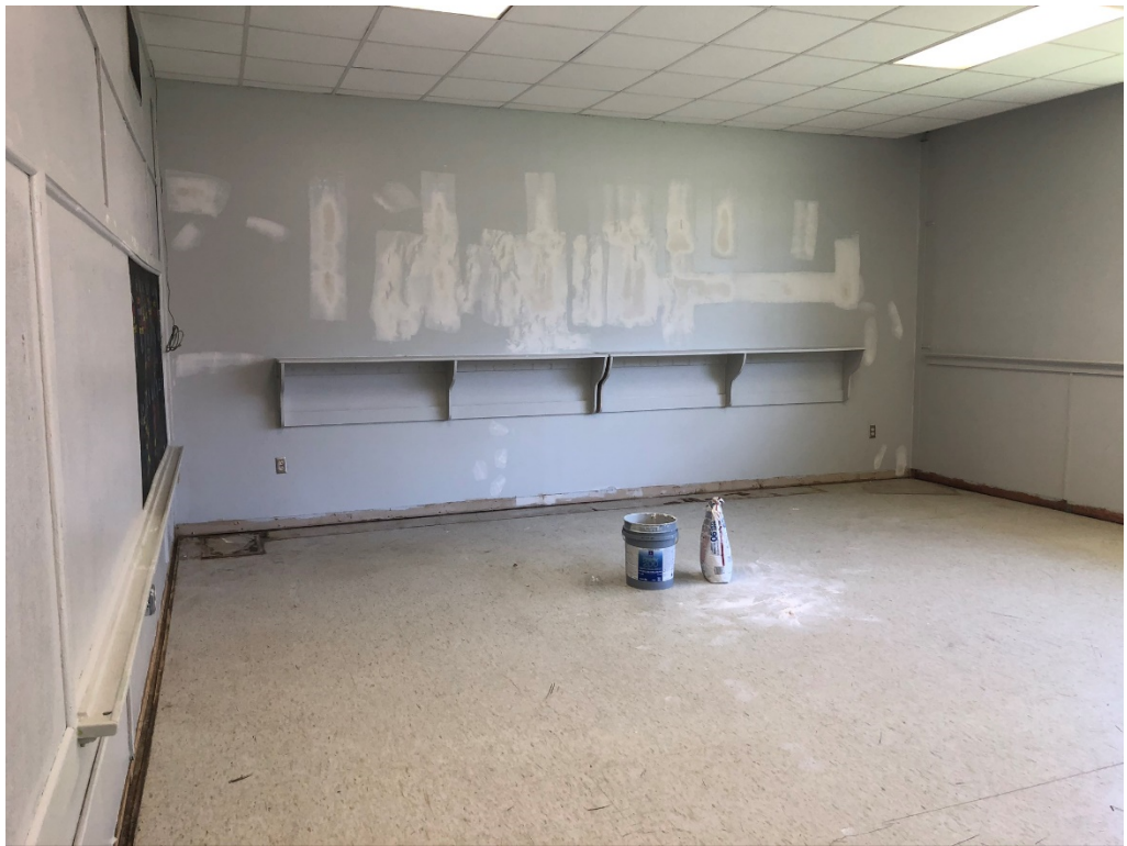
Figure 8 – Paint Prep