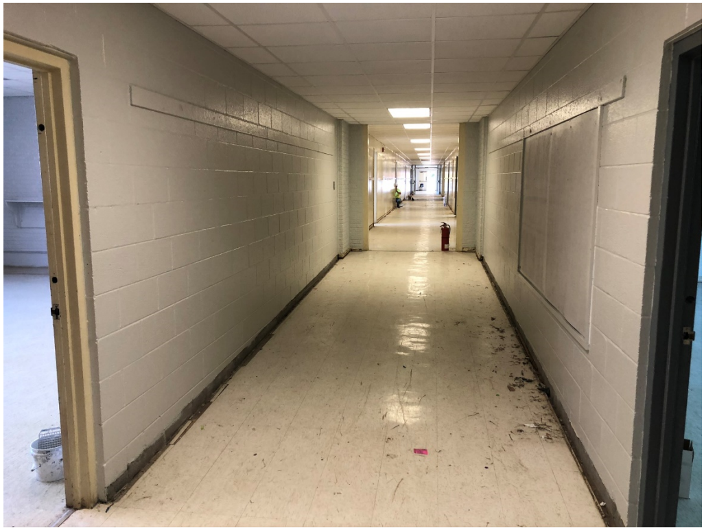
Figure 5 – Painting is ongoing in south hall