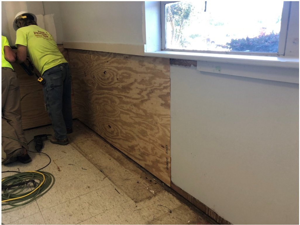
Figure 7 – Carpentry Repair at Termite Damaged Areas