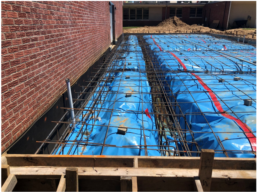
Figure 15 – Formed and Reinforced (NE Corner Looking S)