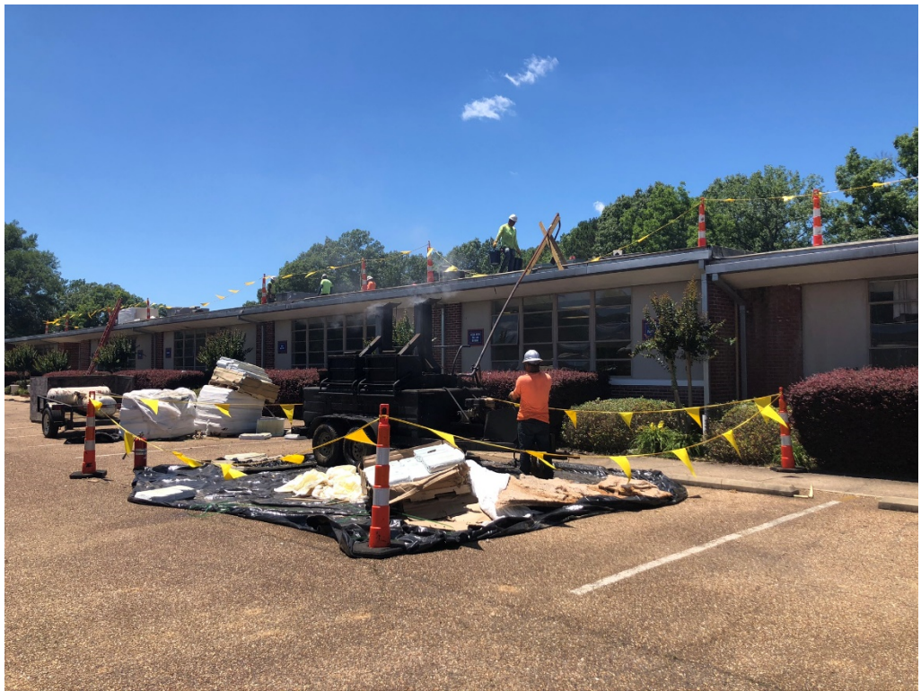
Figure 2 – Roofing Work