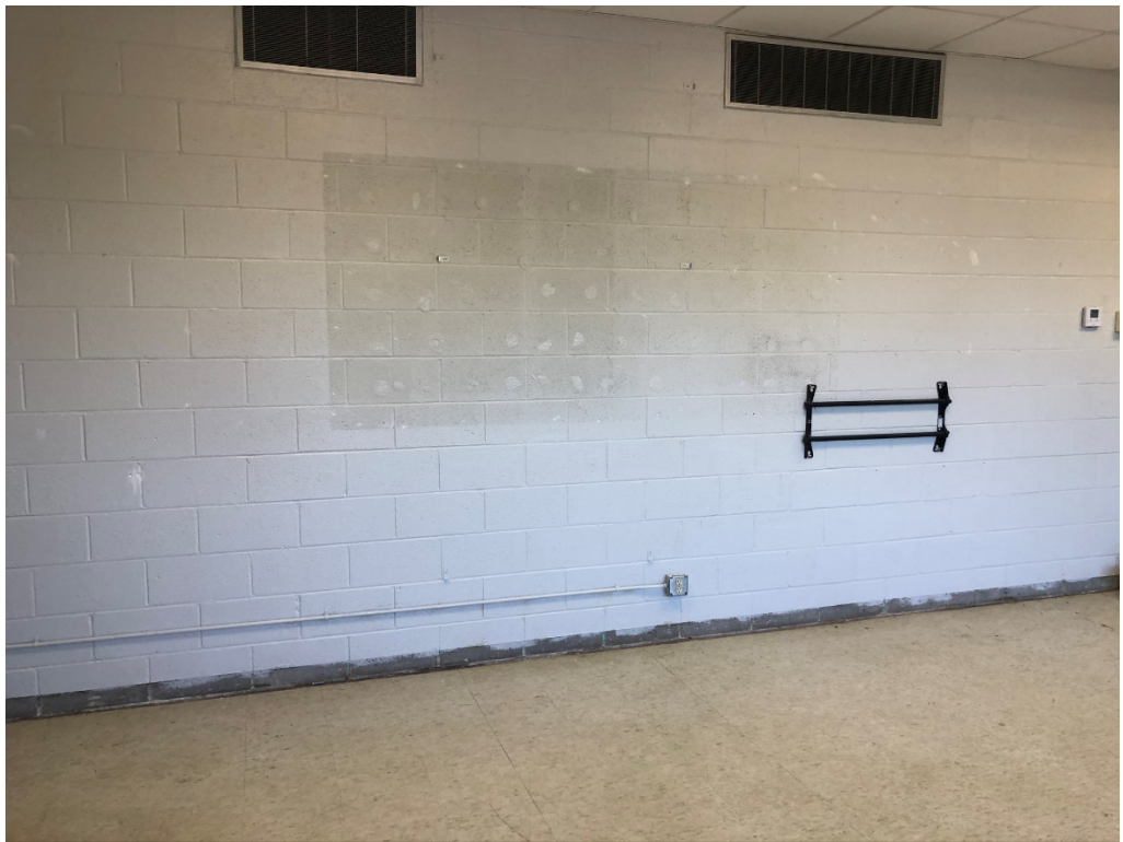
Figure 6 – Paint Prep at Walls