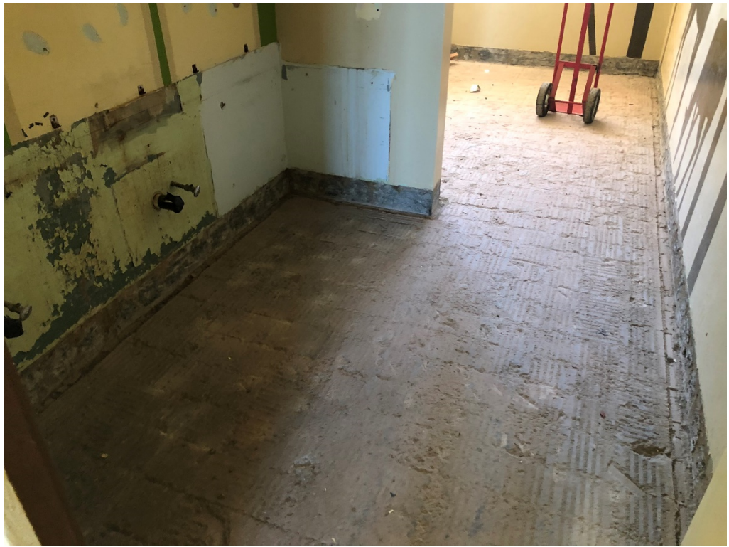
Figure 9 – Floor Demo is Complete