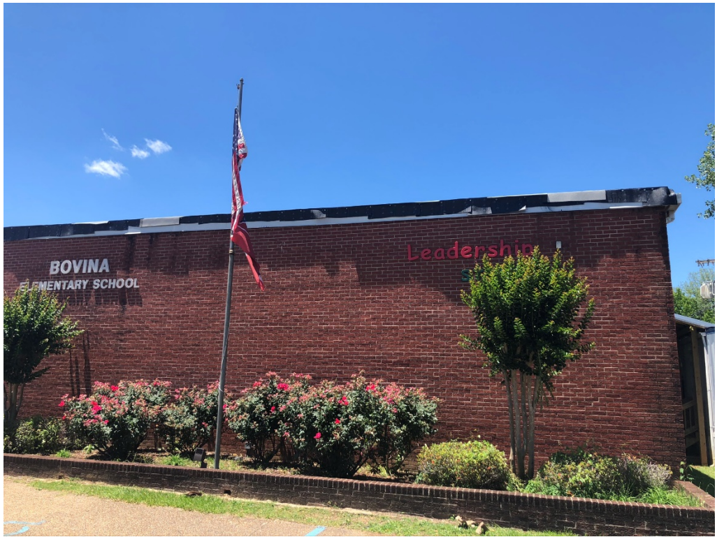
Figure 1 – Roofing Material @ Roof Edge