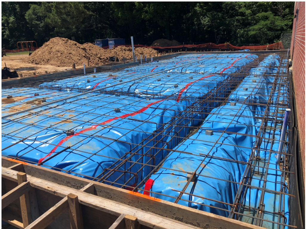
Figure 16 – Formed and Reinforced (SE Corner Looking NW)