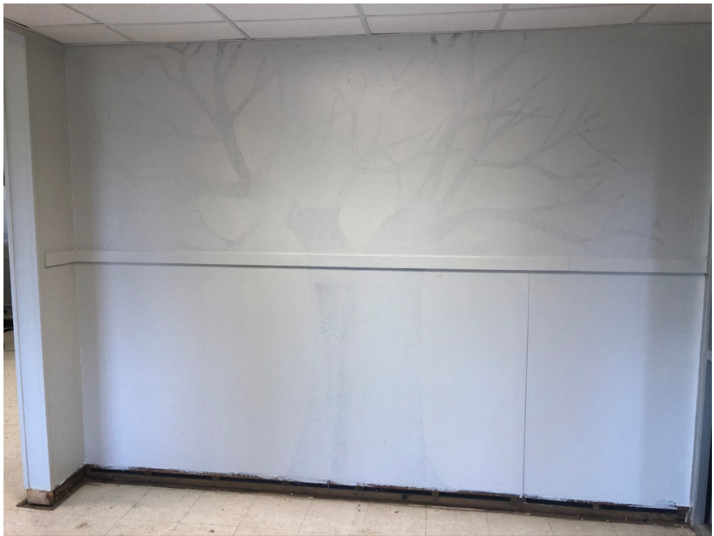
Figure 10 – Paint is ongoing