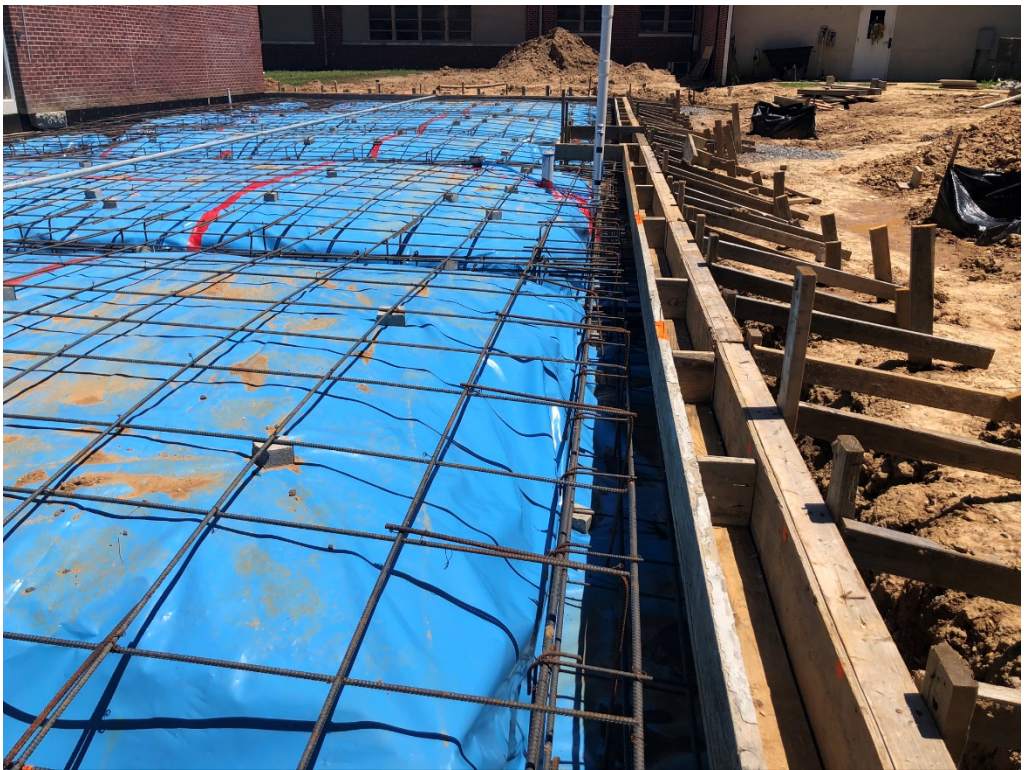
Figure 14 – Trench