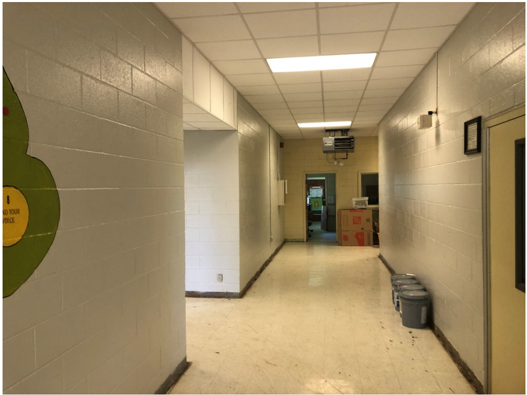
Figure 3 – Painting has begun and is ongoing; some areas are near completion such as here