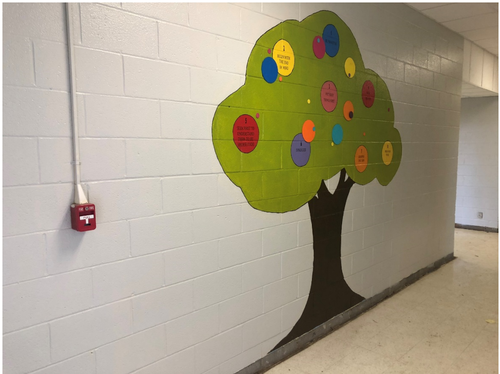
Figure 4 – Tree Preserved by Contractor