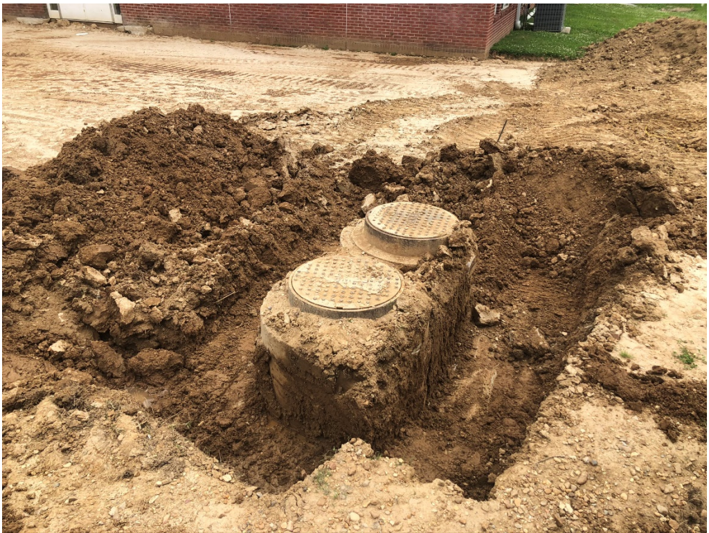
Figure 2 – Grease Trap Requires Move for Foundation Work to Continue