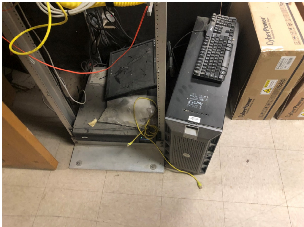
Figure 8 – This computer is running; in order to floor and paint this closet, it will require removal or protection by school staff to keep from damage