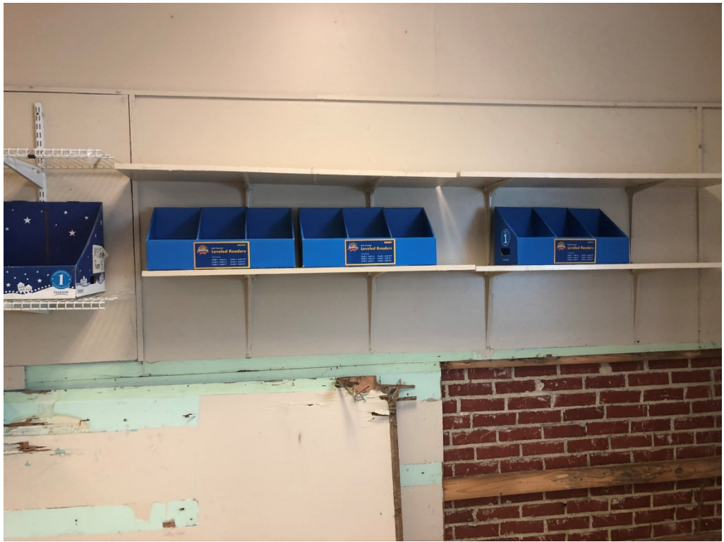
Figure 5 – Need Direction on Painting Shelving... these on right are painted