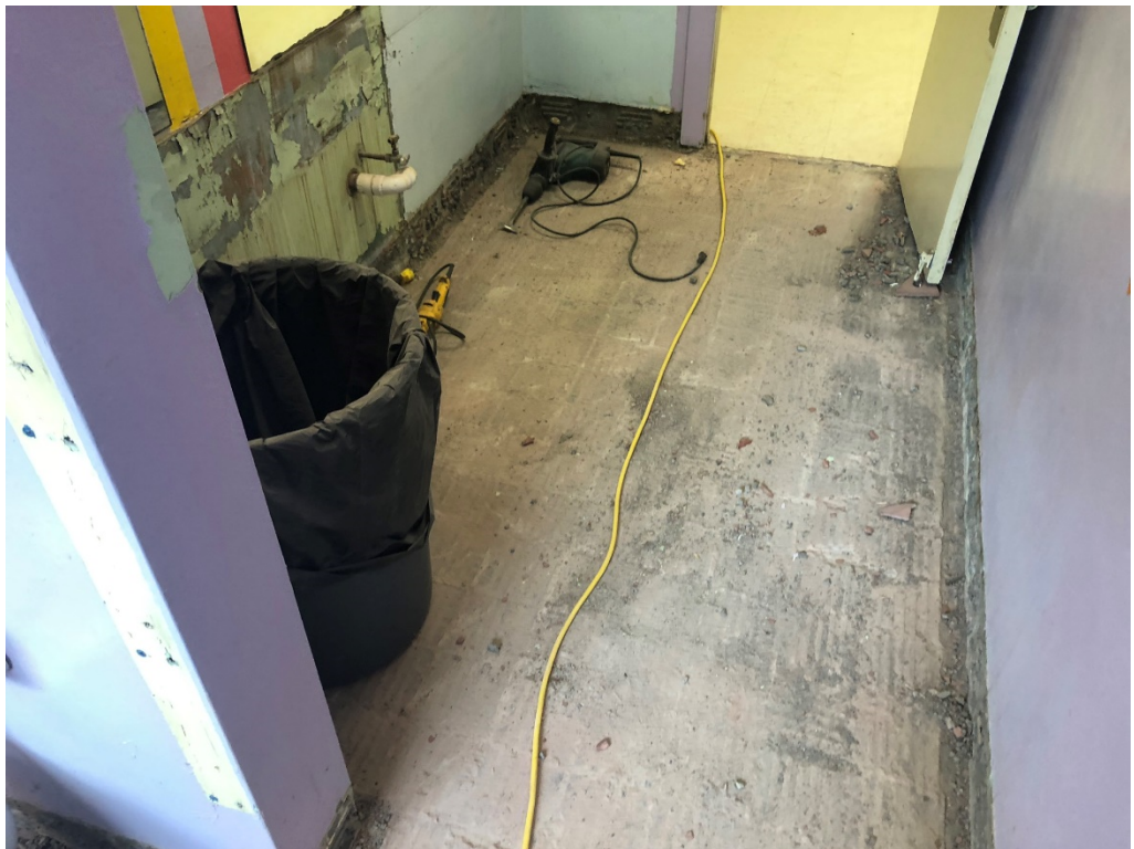
Figure 4 – Interior Demo of Bathroom Flooring