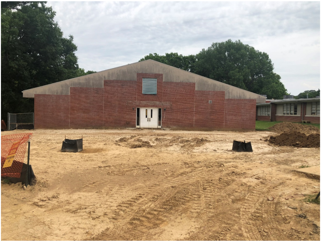
Figure 1 – North Addition Dirt Work