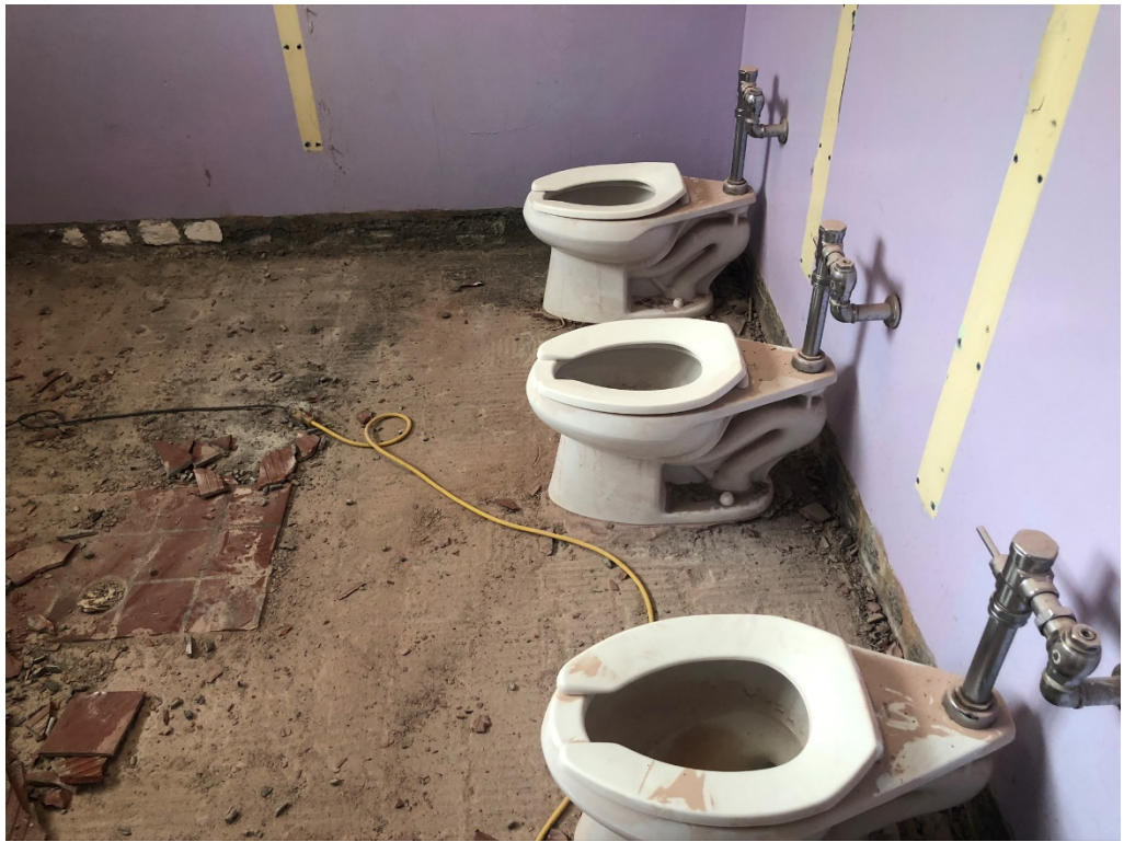
Figure 3 – Interior Demo of Bathroom Flooring