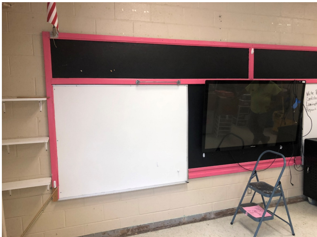
Figure 10 – Contractor needs direction on paint of trim around blackboards such as this