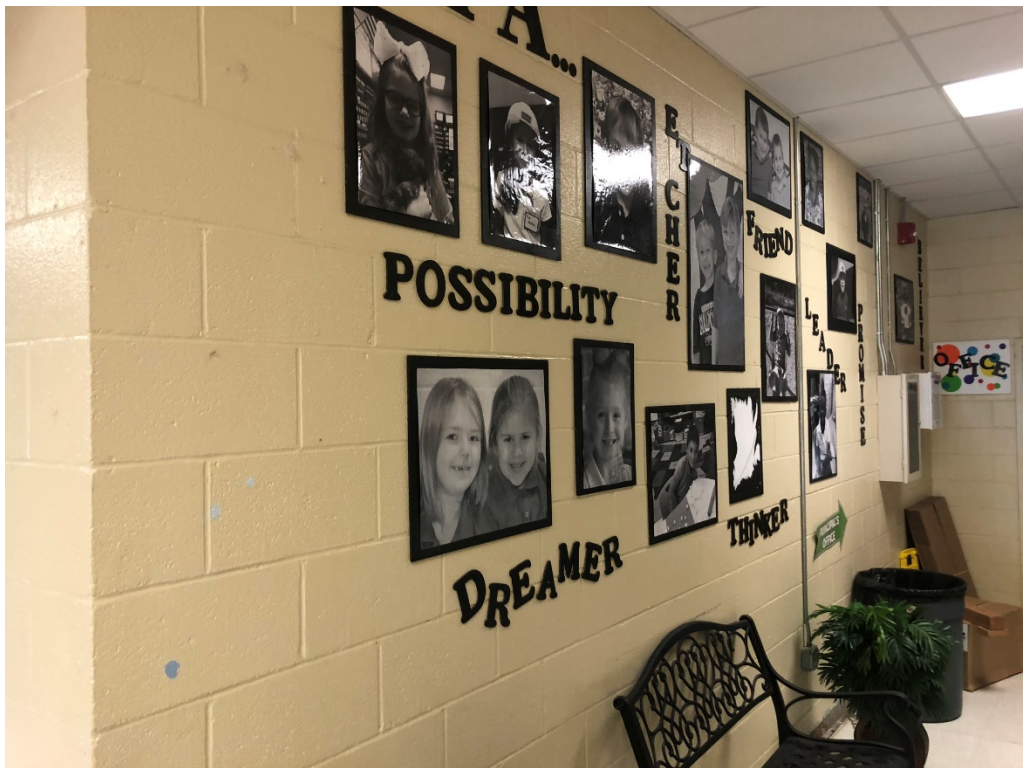
Figure 7 – Items such as these are Glued to walls and will more than likely be damaged when removed; if teachers want to keep, they'll need to remove ASAP