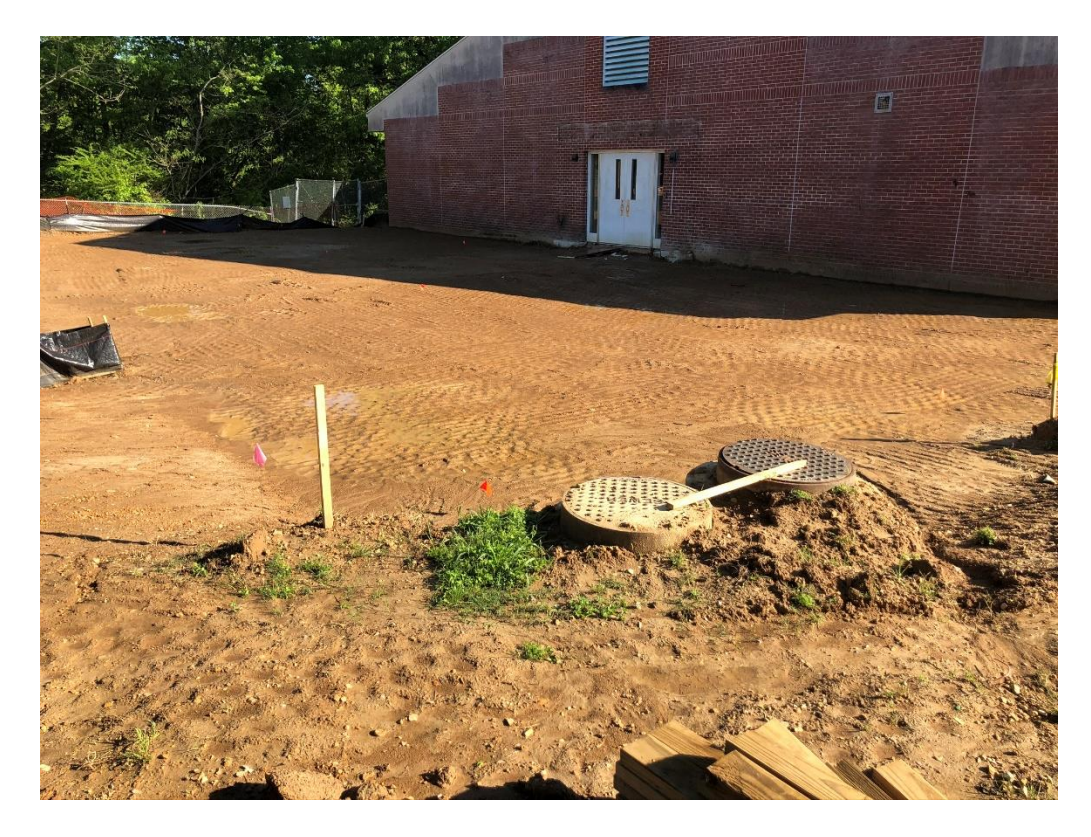
Figure 4 – Building pad Appears at grade