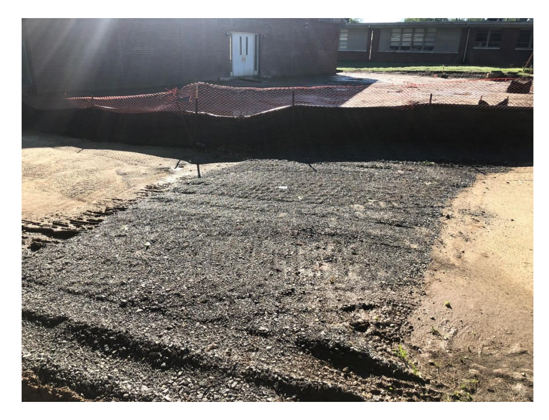
Figure 2 – Drainage Compacted and base installed