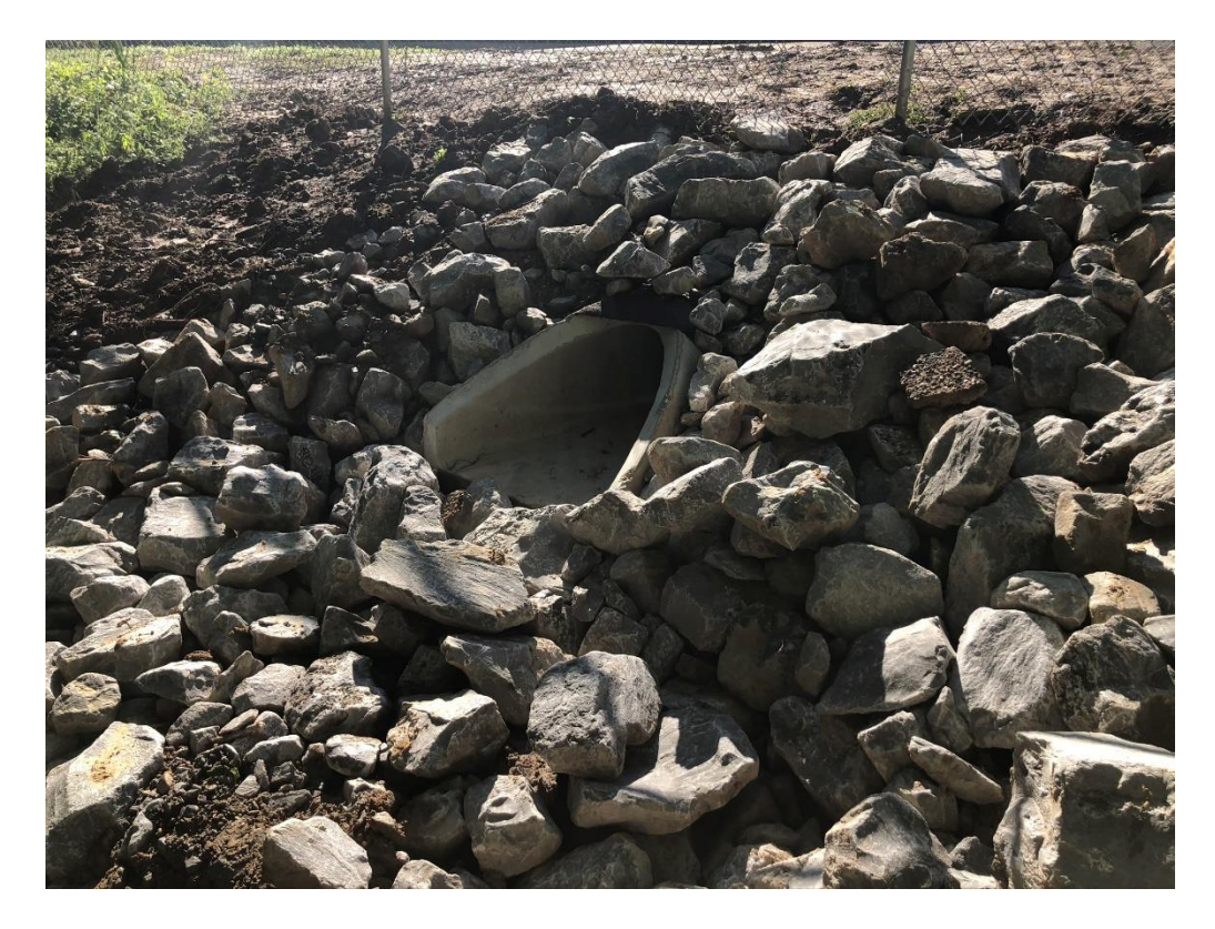
Figure 3 – Rip Rap and discharge complete