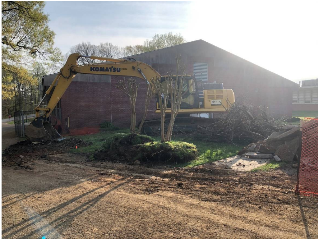
Figure 1 – Excavation Work at Addition