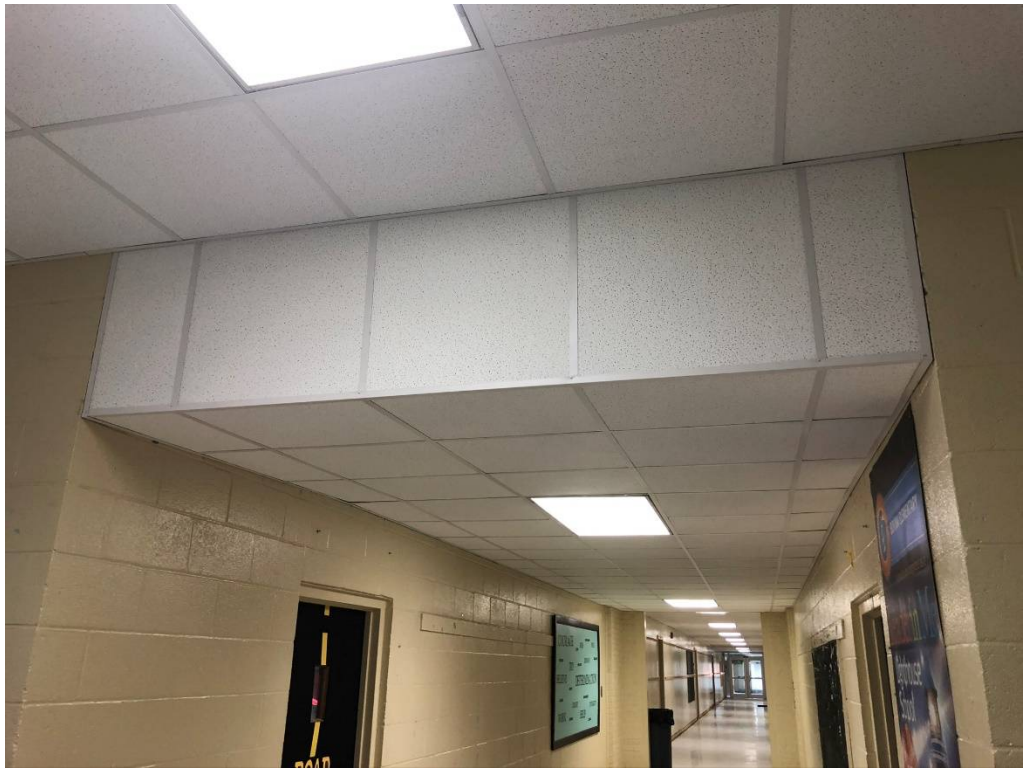
Figure 3 – Ceiling Tile Complete in Main Hall