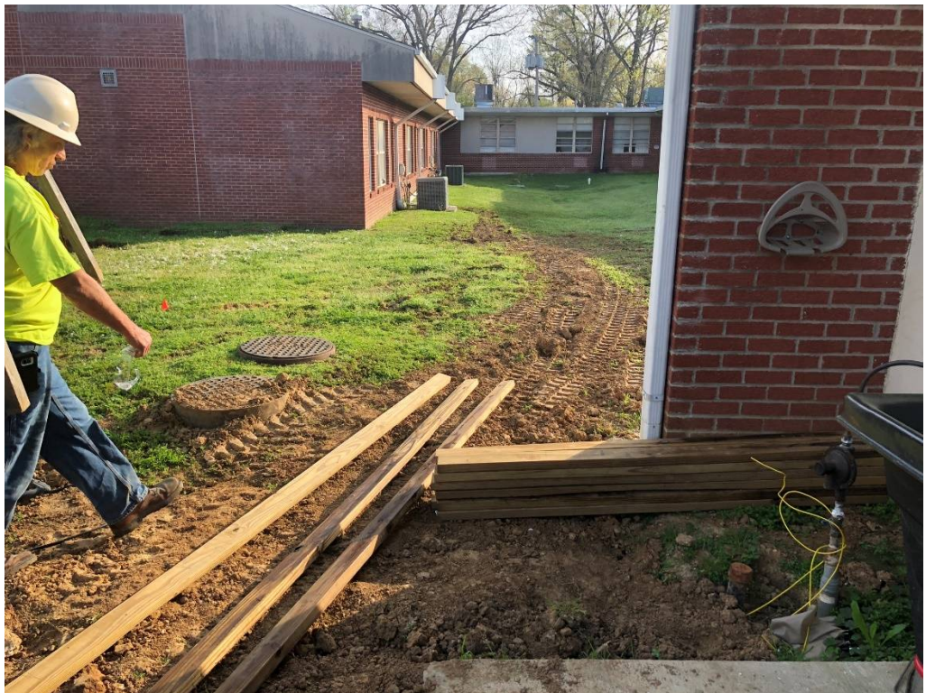
Figure 2 – Gas Pipe Relocated and Excavation Covered