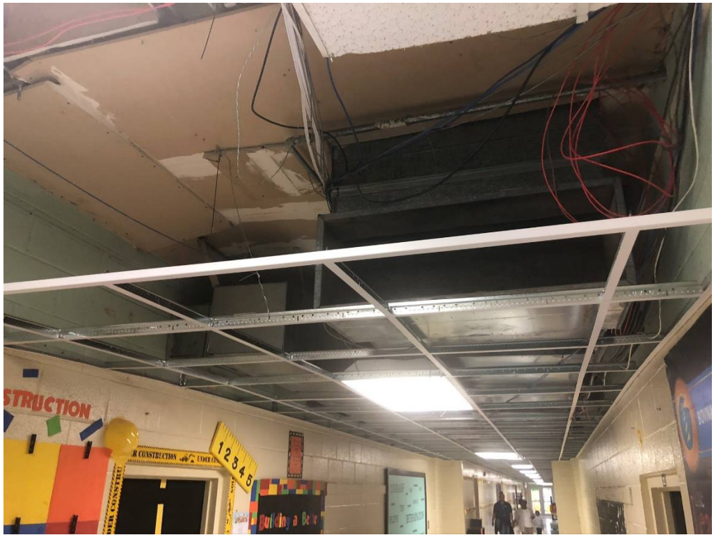
Figure 1 – South Hall Ceiling Grid Installed