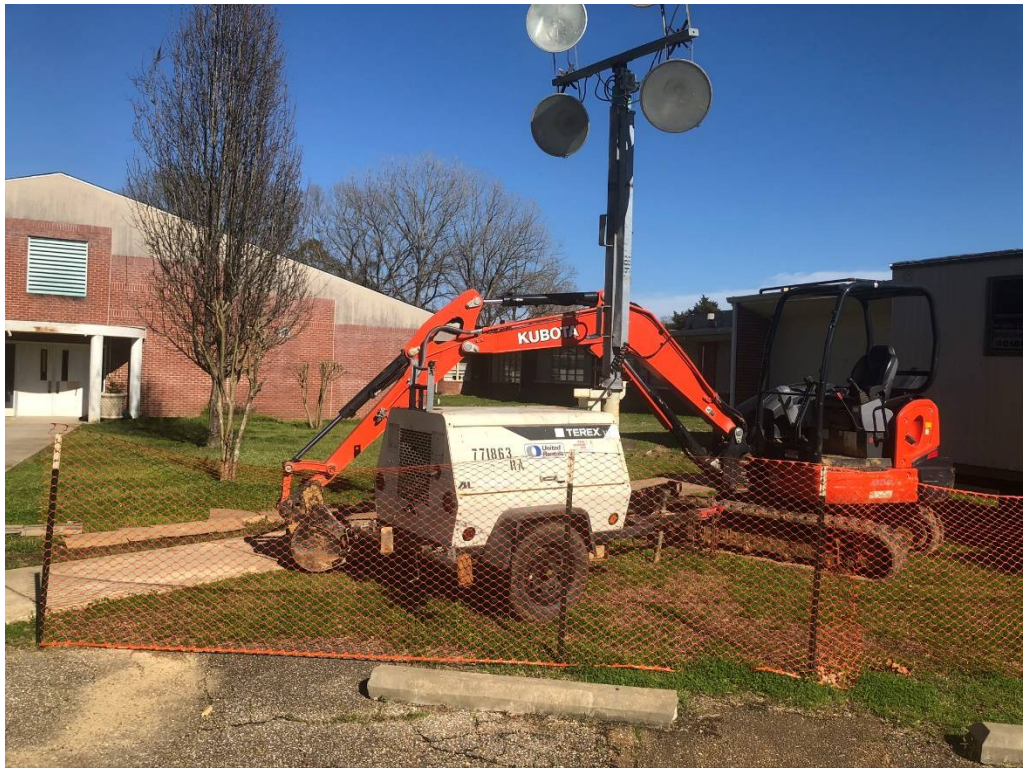
Figure 5 – Equipment Ready