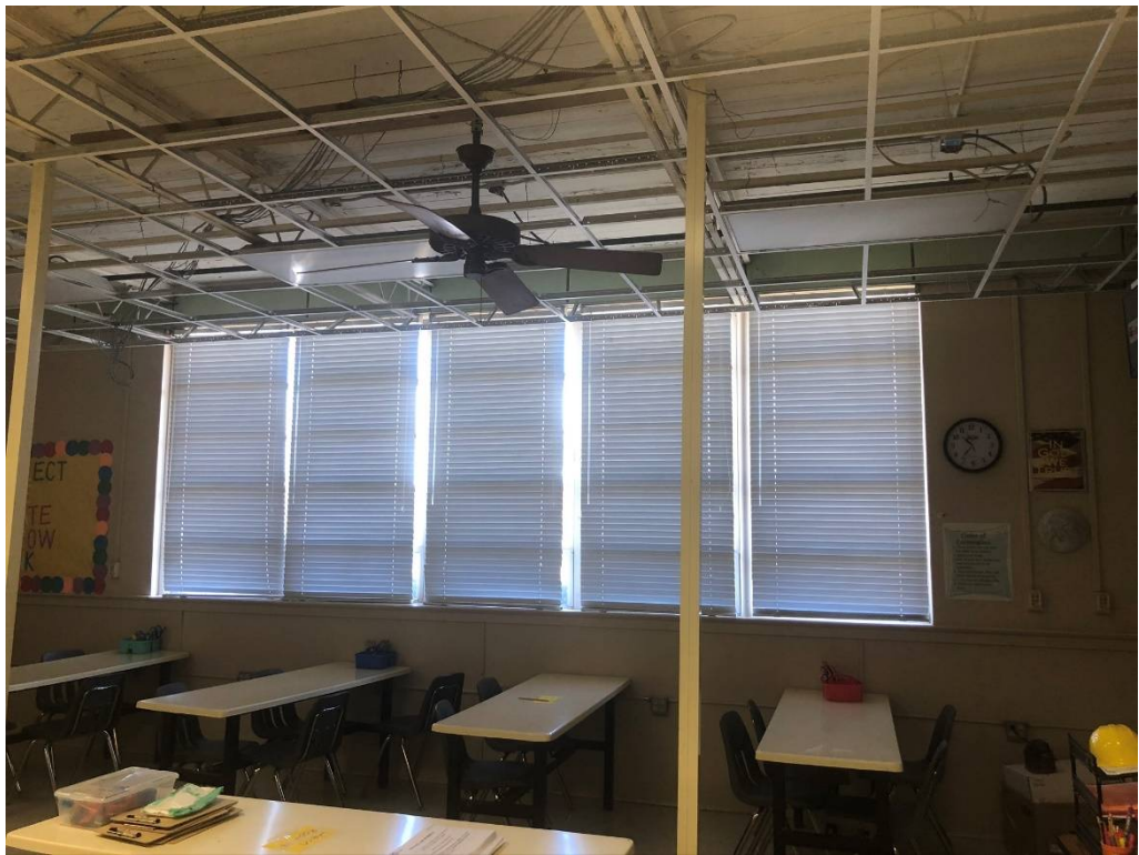
Figure 4 – Ensure that these Raceways are Plumb