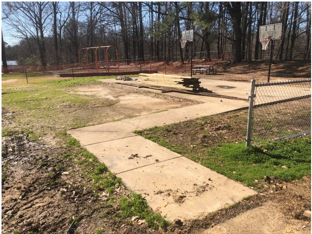
Figure 6 – Formwork and Rebar on Site