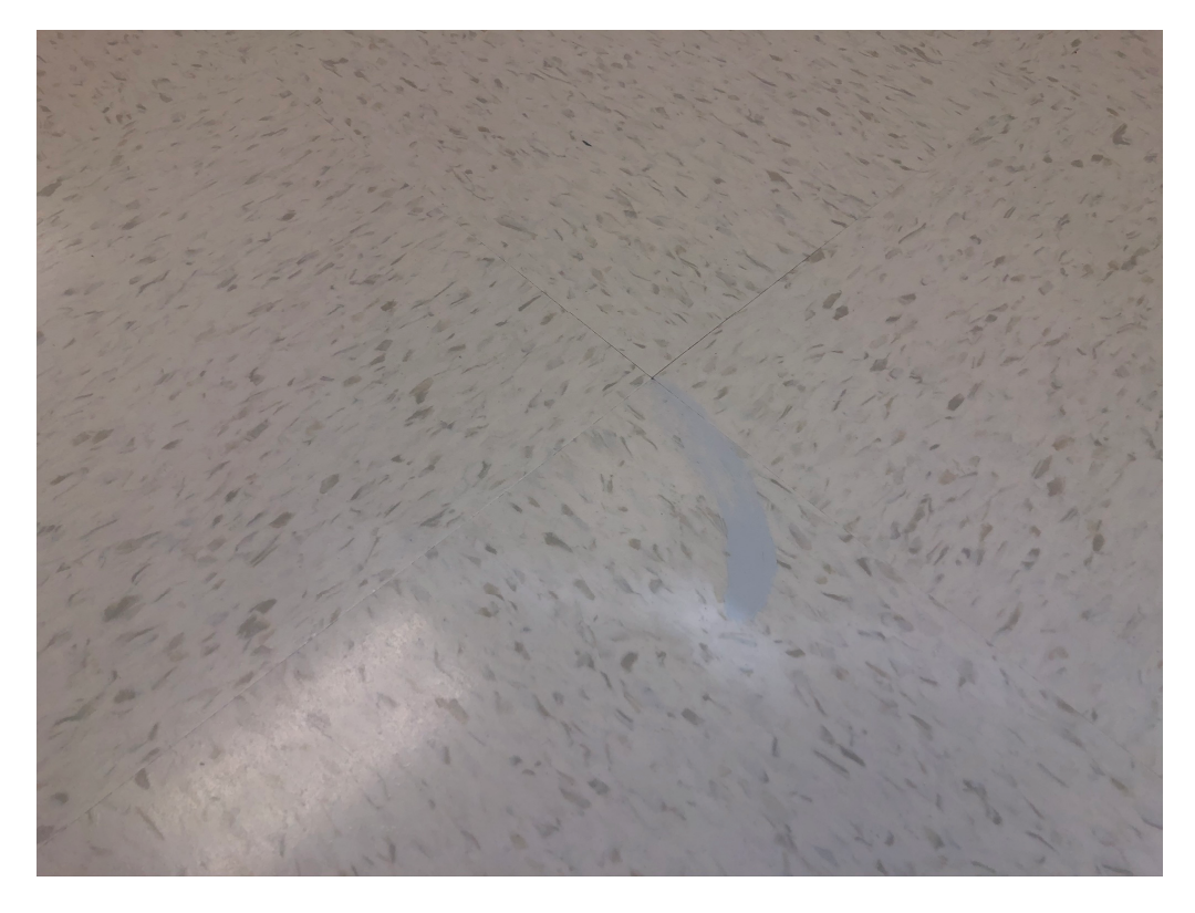
Figure 8 – Paint Under Floor Wax