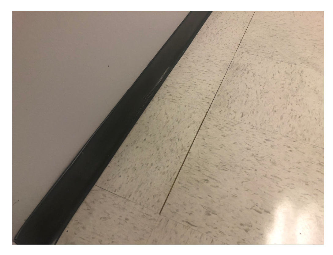
Figure 14 – Gaps Between TIles