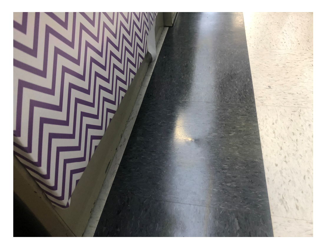
Figure 15 – Debris Under Tile