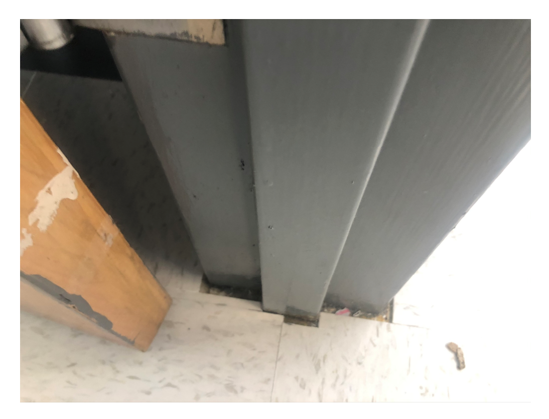
Figure 7 – Poorly notched Tile at Jambs