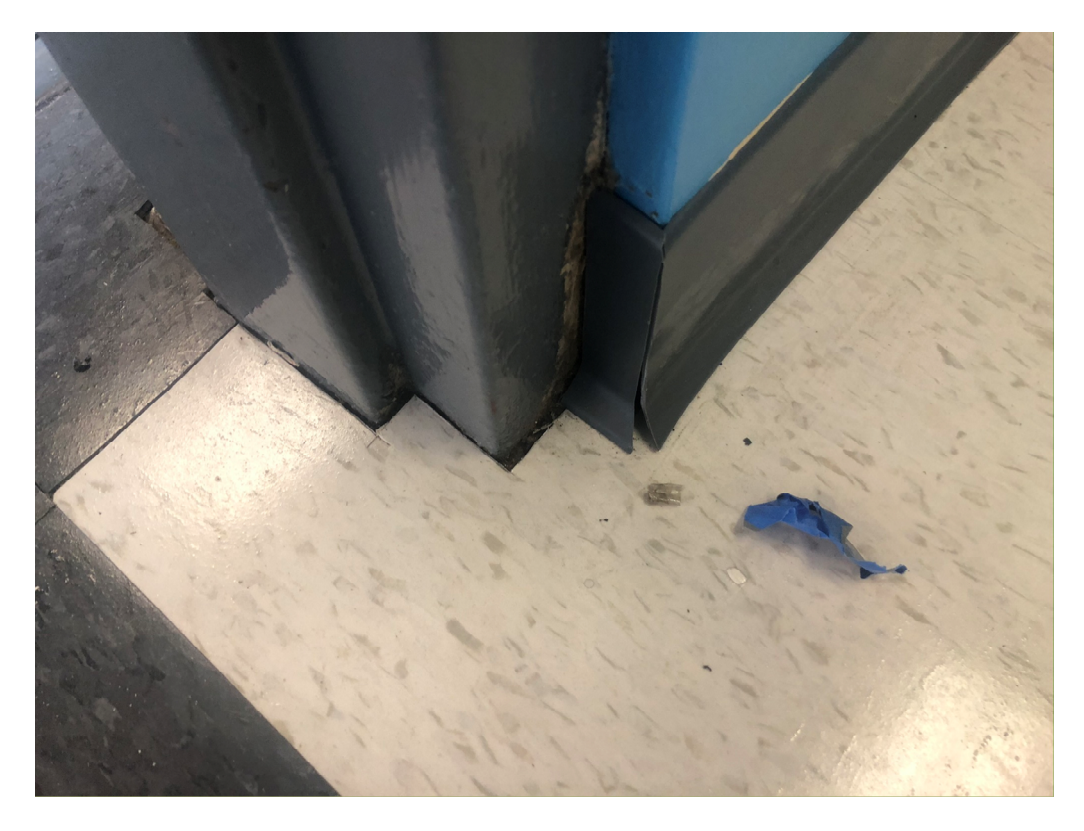
Figure 2 – Rubber Base Corner does not meet up