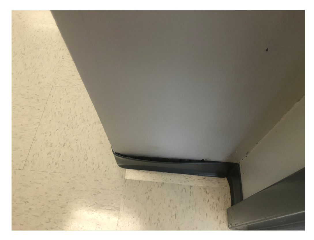
Figure 11 – Rubber Base Lacking adhesion