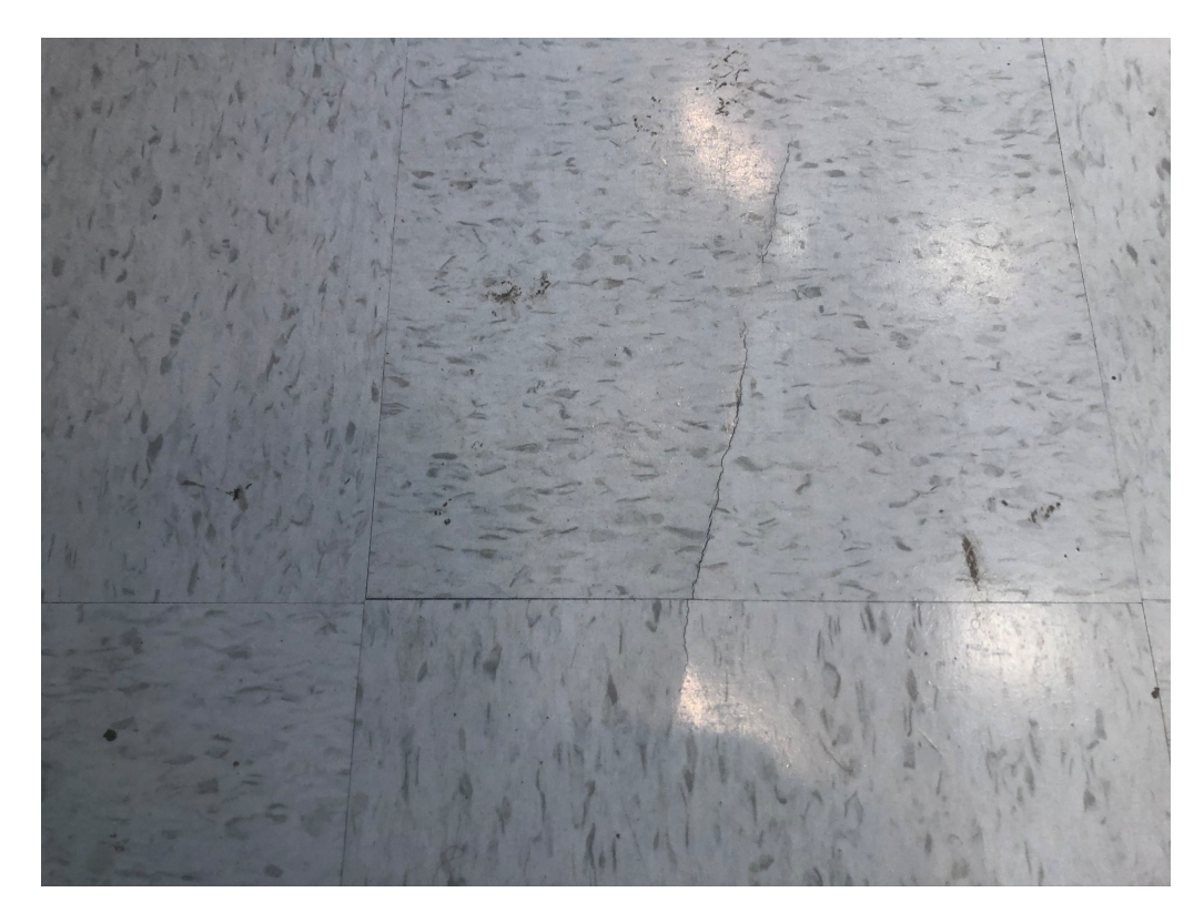
Figure 9 – Cracked Tile due to debris and/or lacked of floor prep