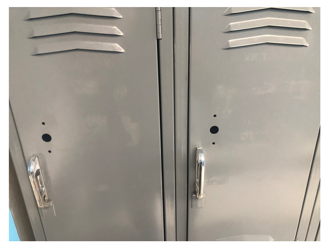
Figure 4 – Some Locker Finishes are uneven