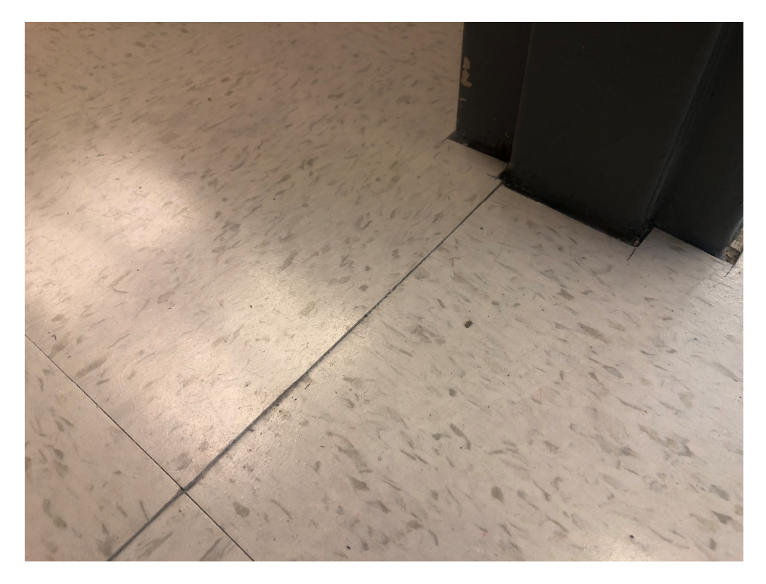
Figure 13 – Floor Tiles Mainly Around Thresholds and Floor Perimeters Not Flush