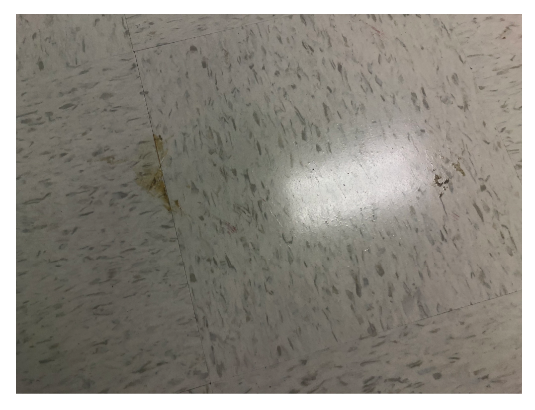
Figure 12 – Glue at Tile