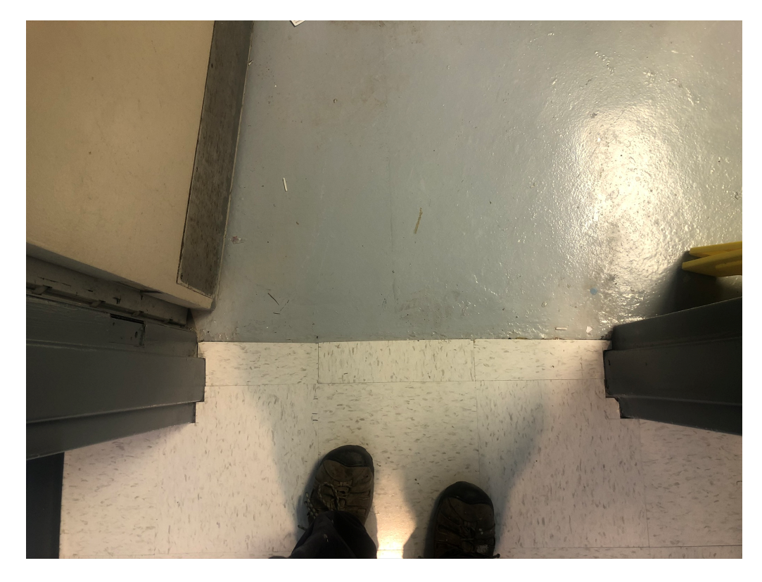
Figure 10 – Rubber Threshold Required at Unfinished VCT Edges in Doorways