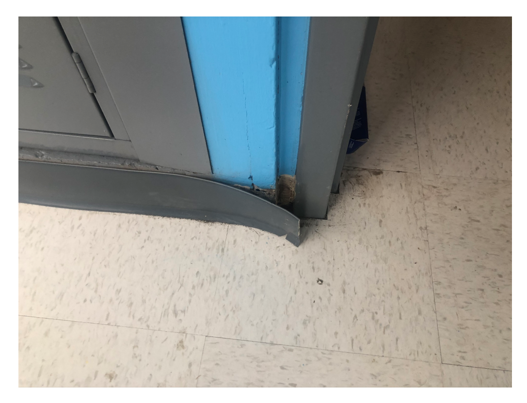
Figure 5 – Northwest Classroom in Building 100