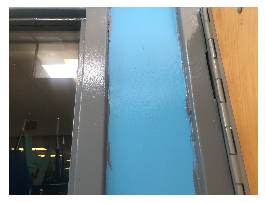
Figure 16 – Some Paint Touchups Required at Jambs and Walls