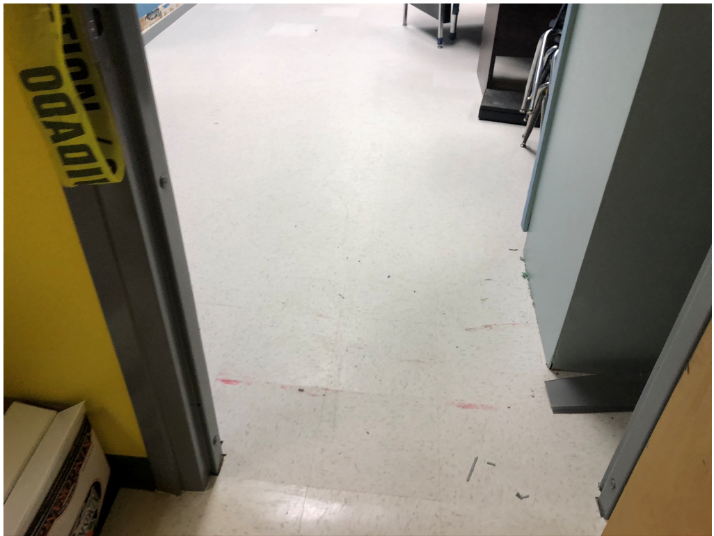
Figure 8 – Classroom 207 New Floor