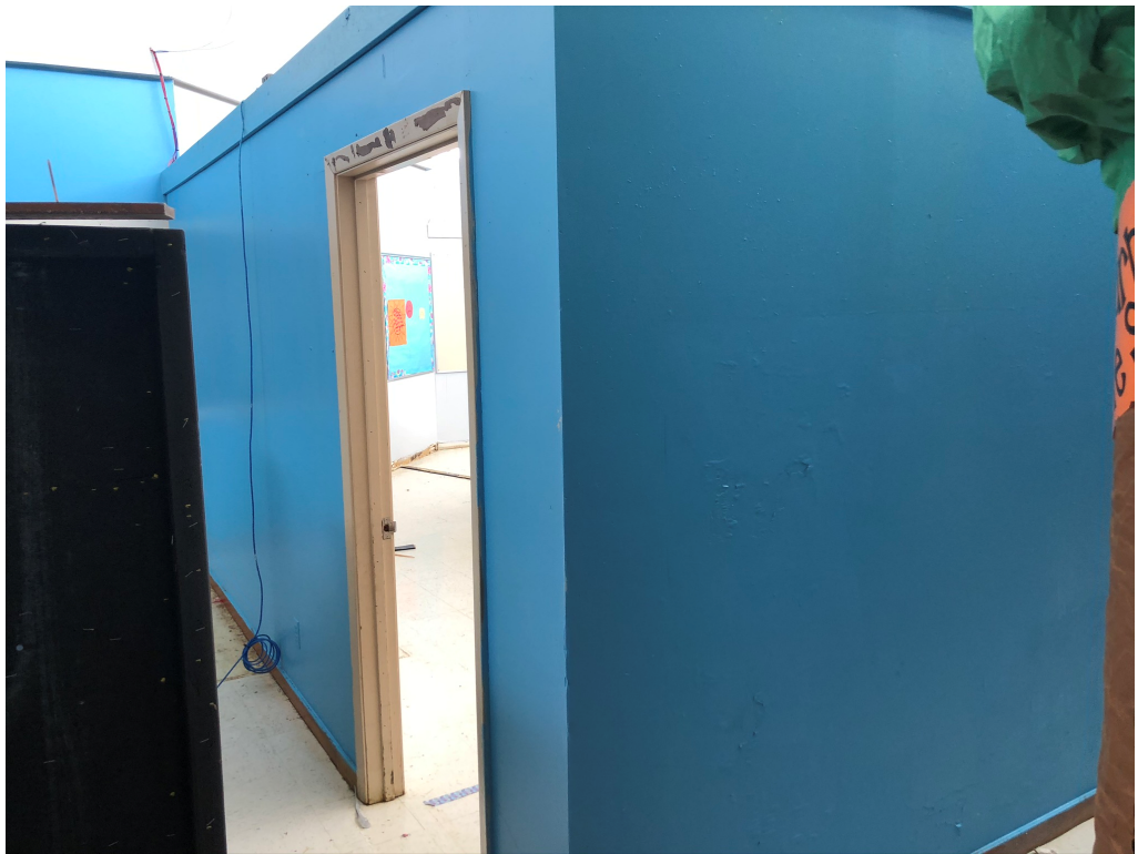
Figure 4 – Building 100: Prep still Required in Some Areas that are Painted