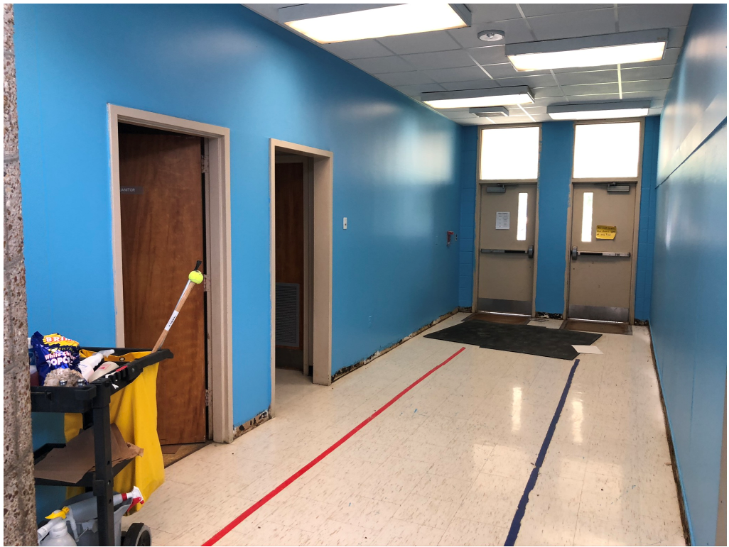
Figure 5 – Building 100 Vestibule