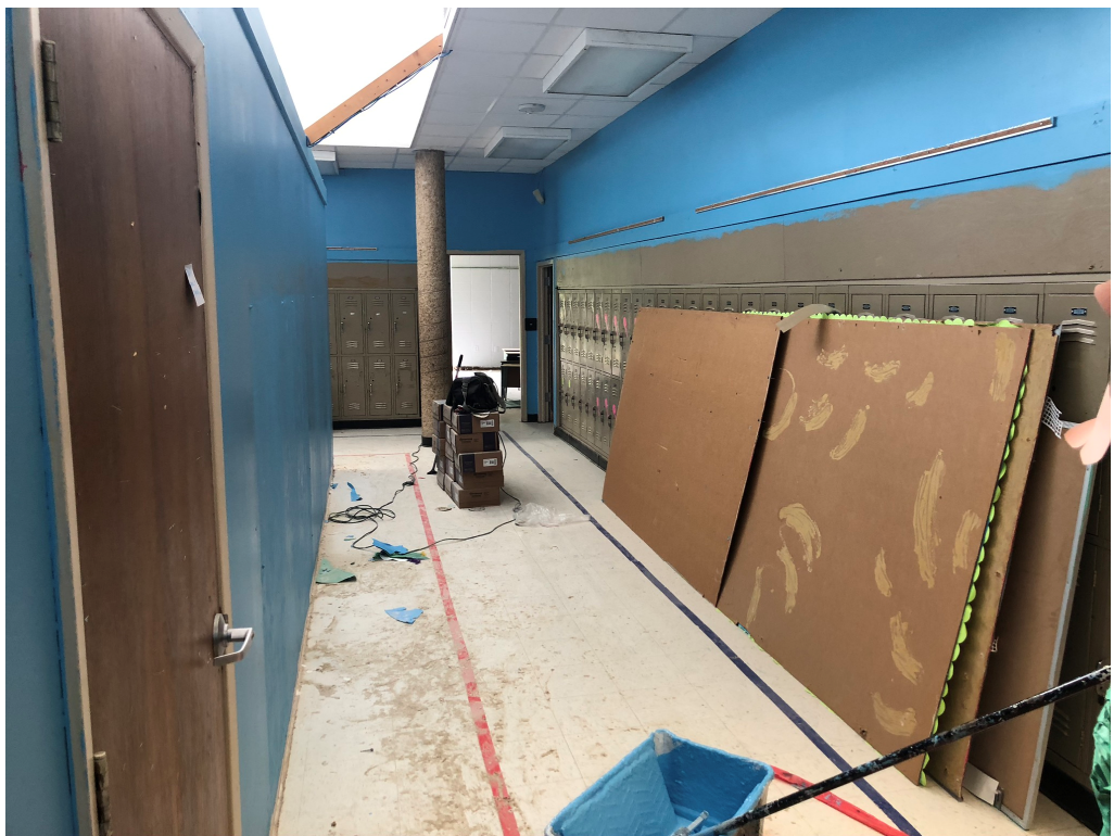
Figure 2 – Building 100 Painting is about Halfway Complete