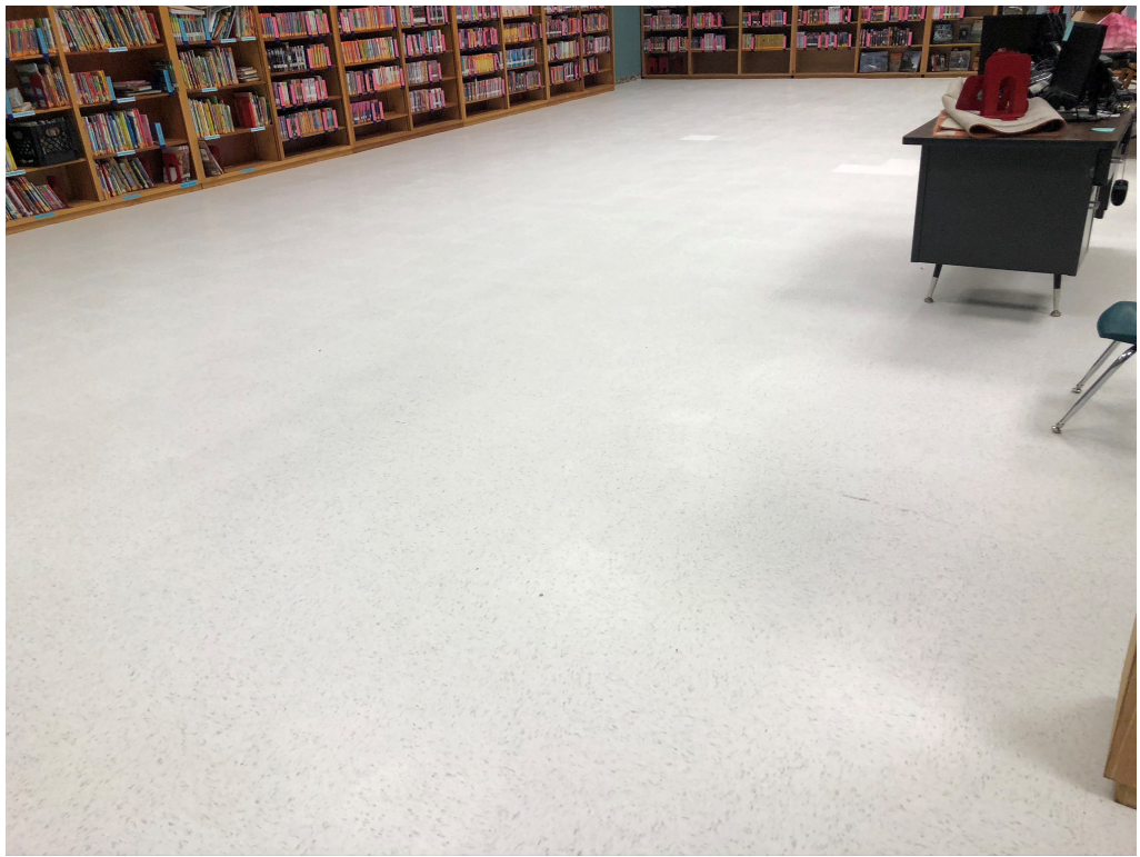
Figure 7 – Library Floor Installed