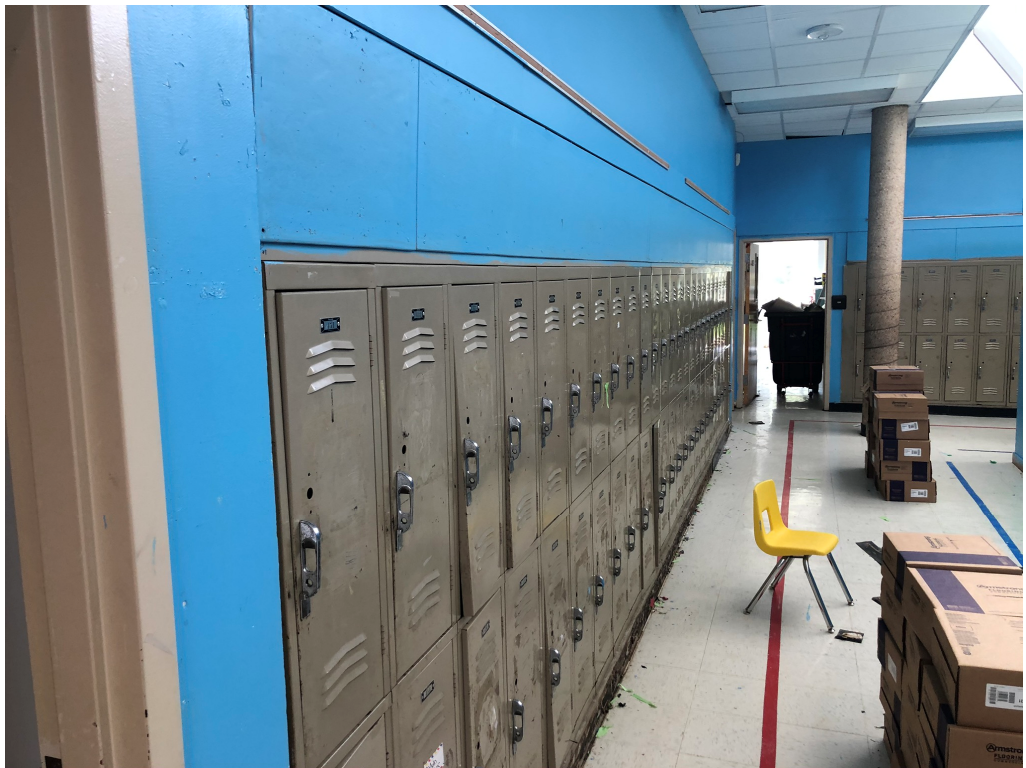
Figure 6 – Corridor at Building 100