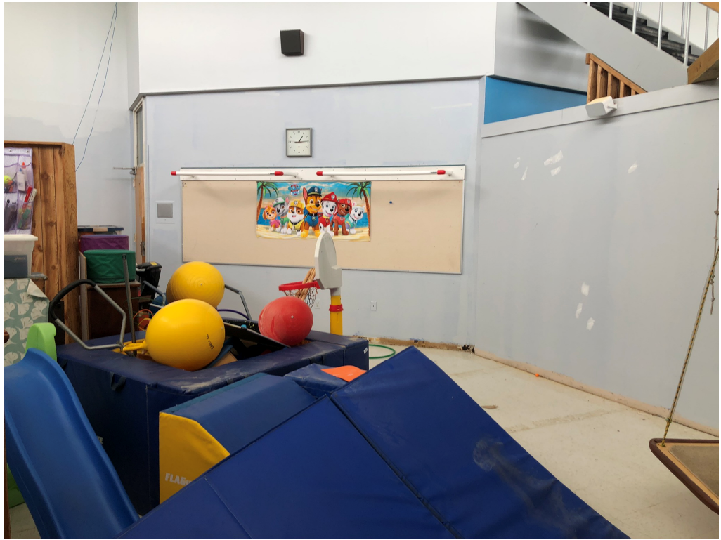
Figure 3 – Building 100