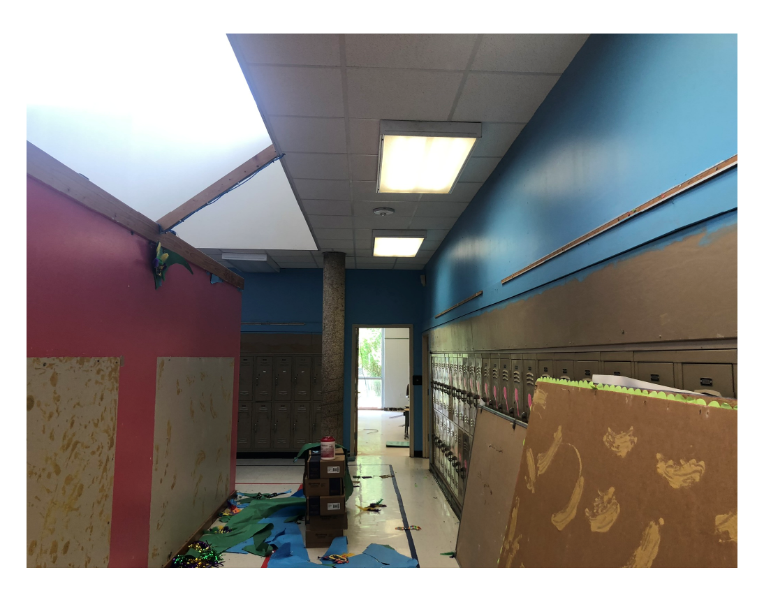
Figure 7 – Paint work is Ongoing in 100 Wing