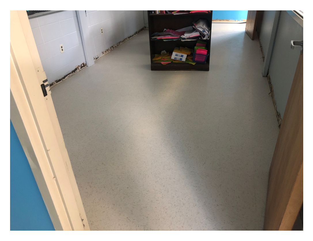
Figure 2 – Flooring Installation at 300 Wing is Ongoing