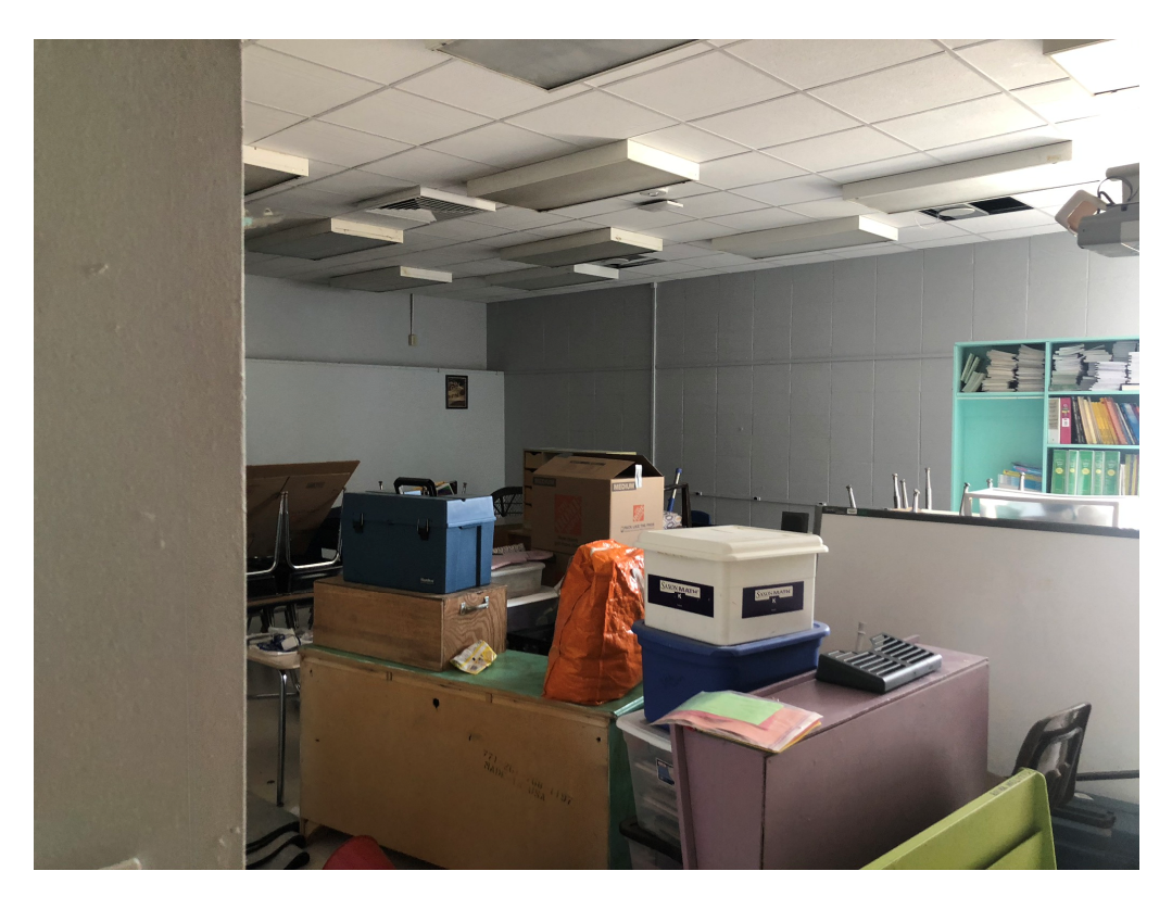
Figure 10 – Painters Working Around School Property