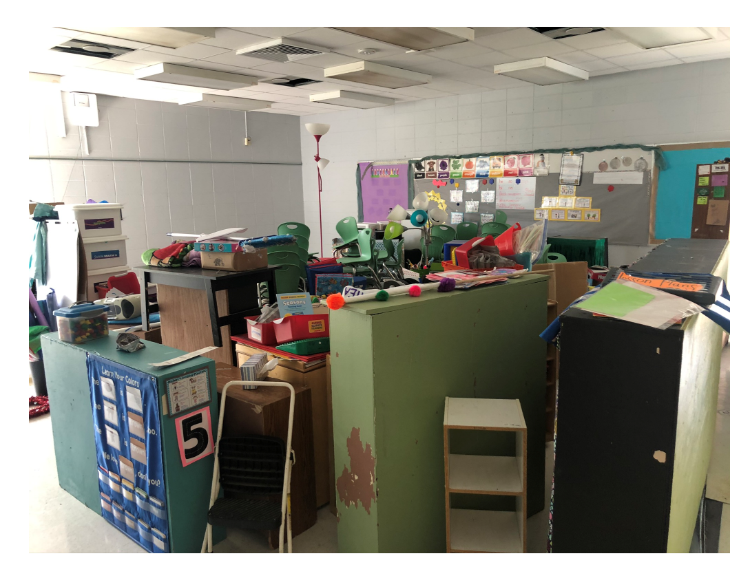
Figure 9 – Painters Working Around School Property