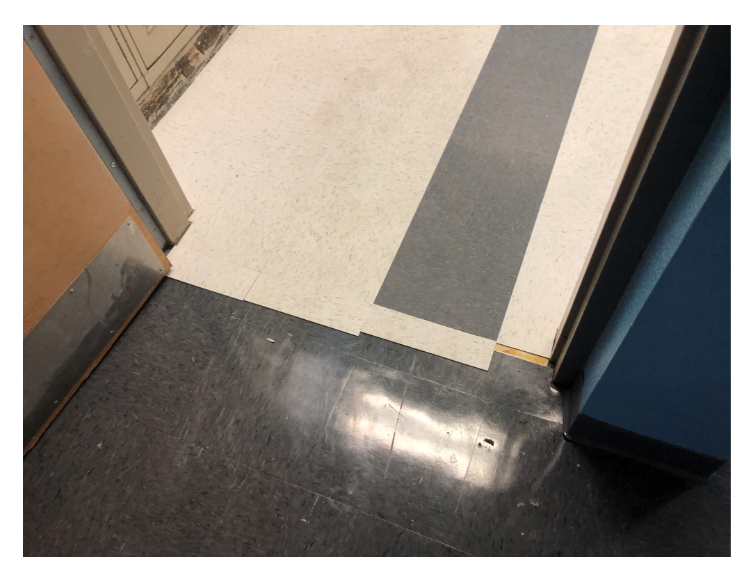
Figure 6 – Threshold @ Main Entrance Lobby and 300 Wing; These should meet Flush