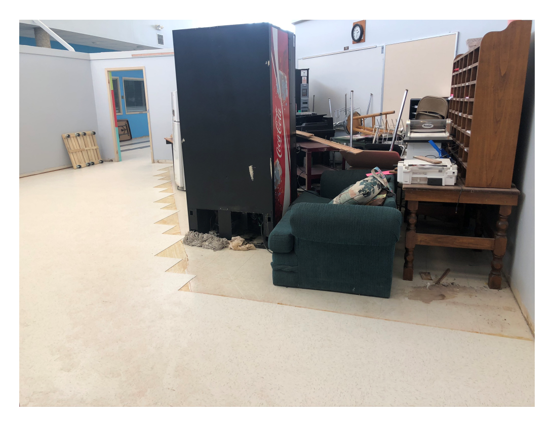
Figure 5 – Contractor Making an Effort to work around School Property