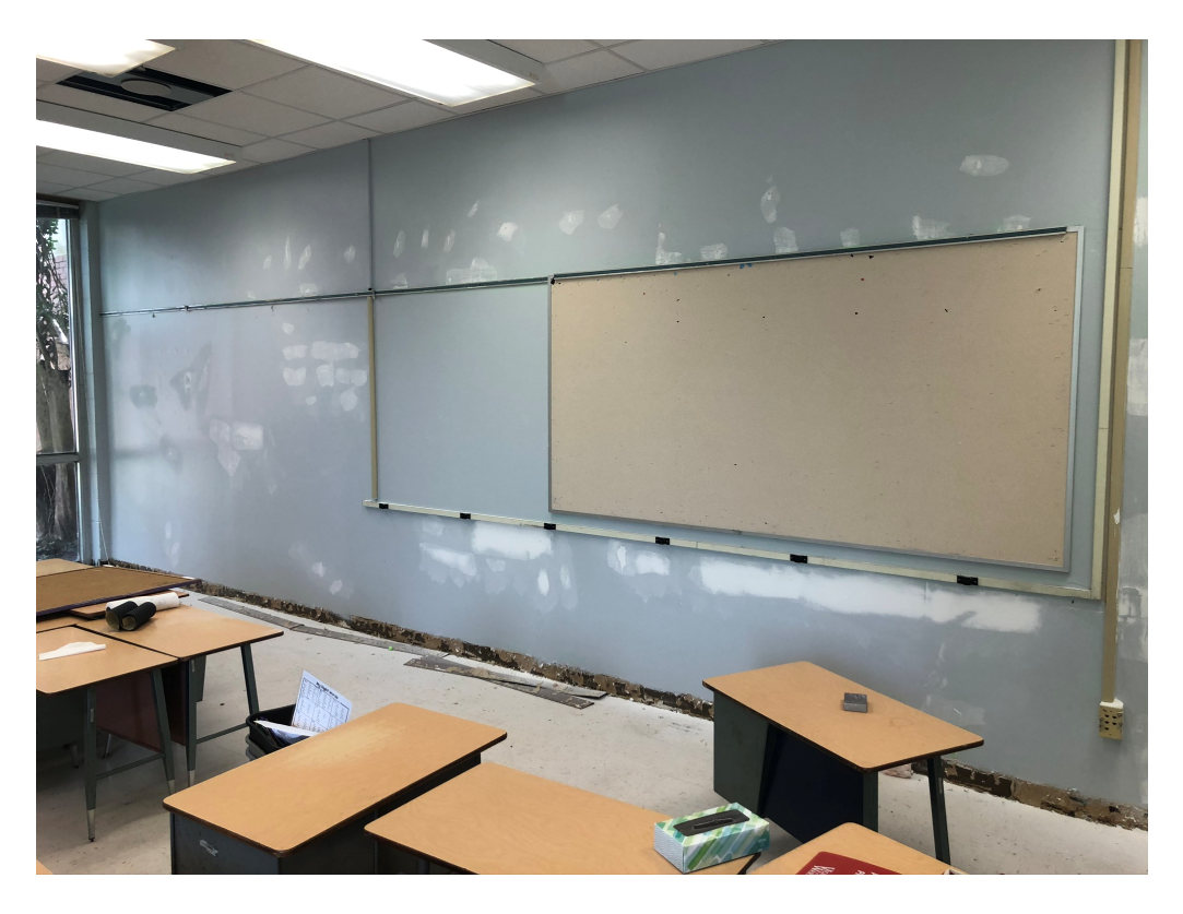
Figure 8 – Prep @ Classrooms in 100 Wing