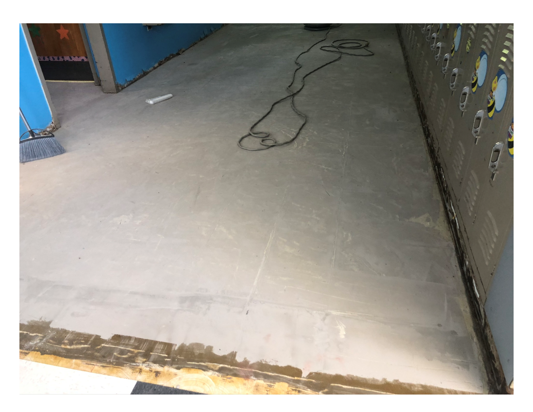
Figure 3 – Prep at Entry Vestibules in 300 Building