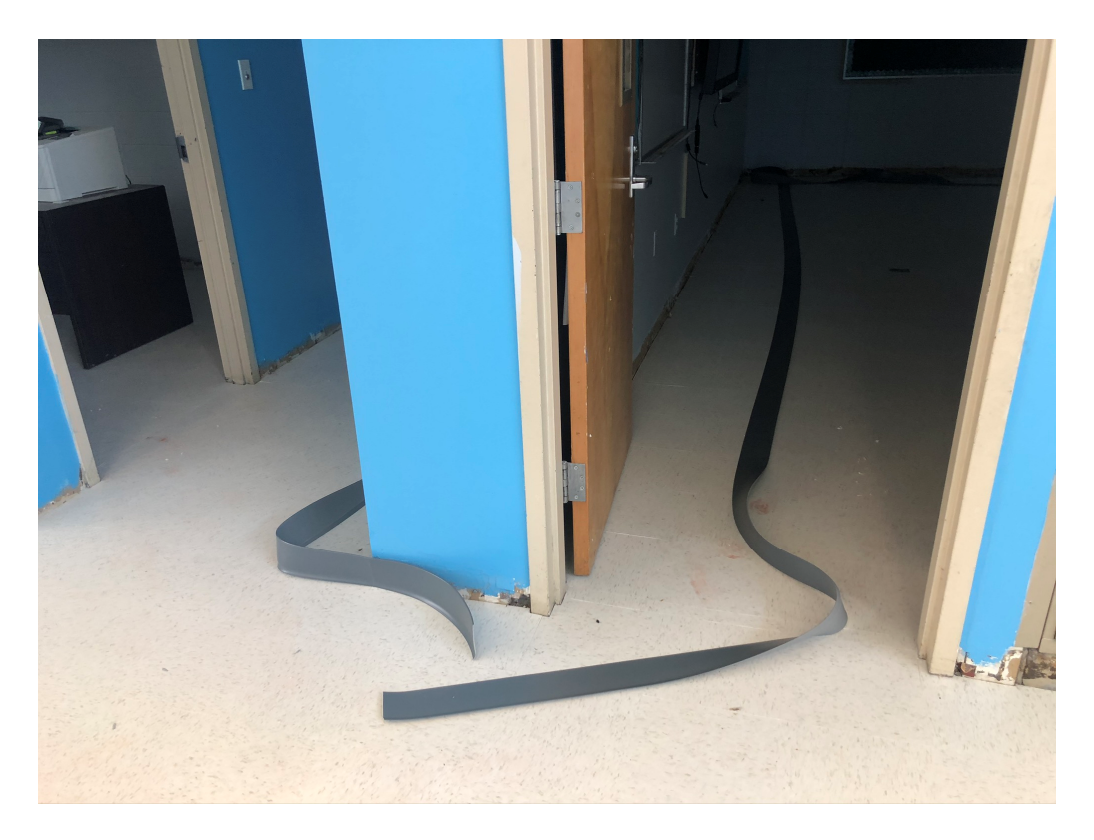
Figure 1 – Base Installation Ongoing in 300 Building