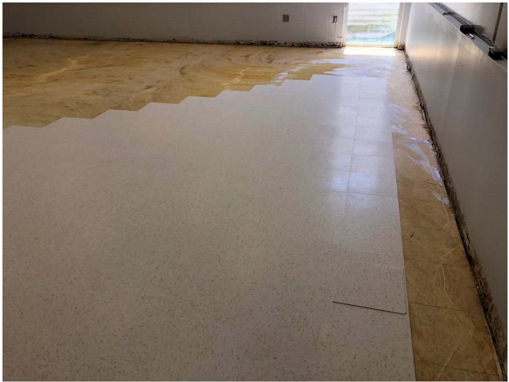
Figure 5 – VCT Flooring Install is Ongoing at the 300 Wing