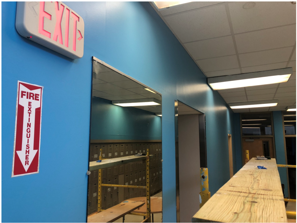
Figure 3 – Painting in the 300 Wing is Ongoing