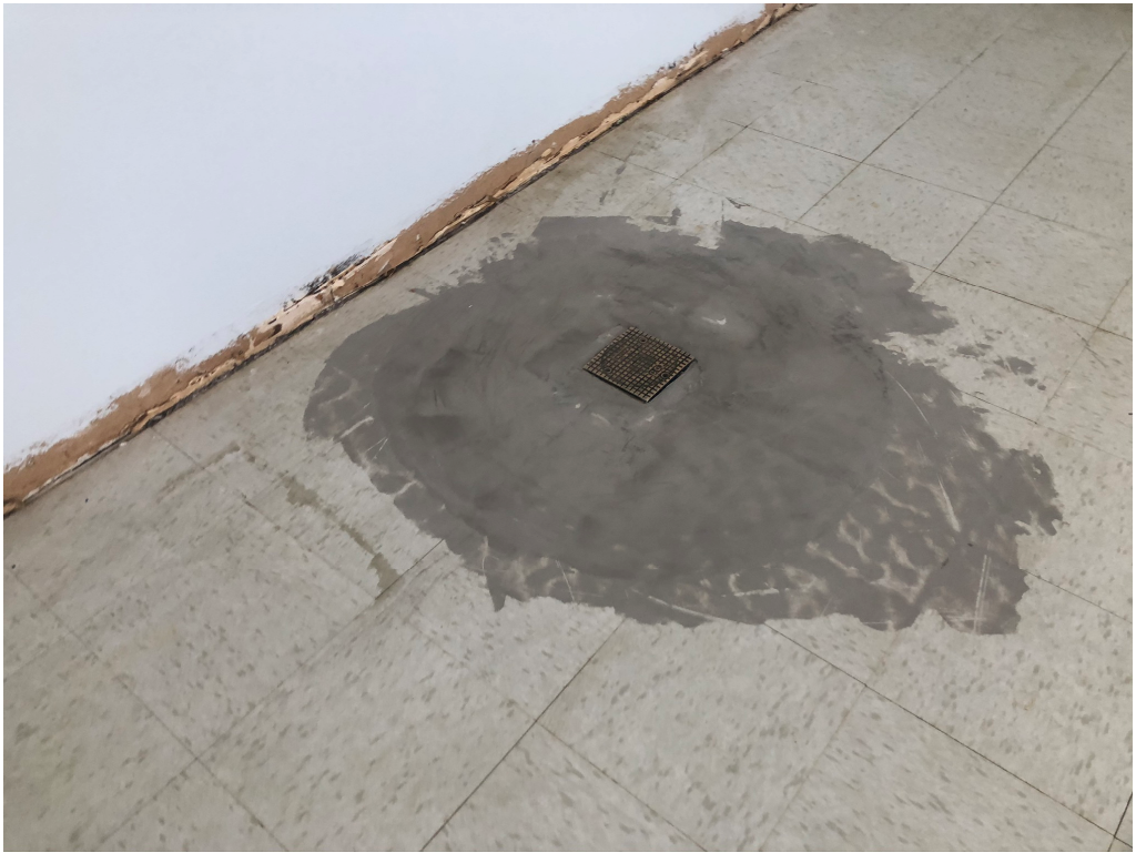
Figure 9 – Floor Prep Noted