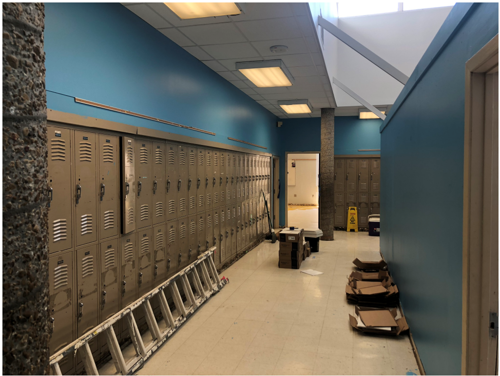
Figure 1 – Painting in the 300 Wing is Ongoing