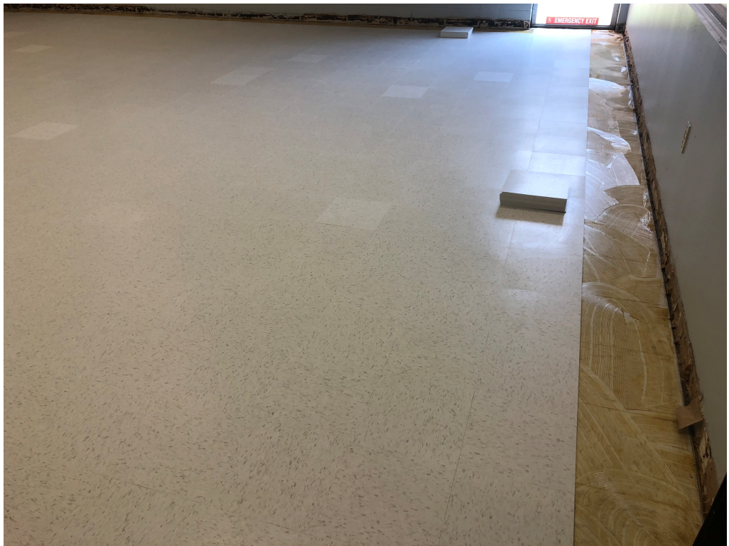
Figure 6 – Off-Colored Tiles Should be Culled