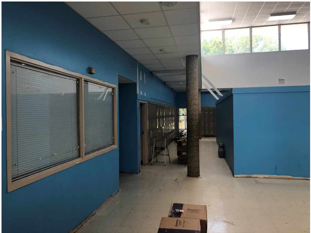
Figure 8 – Paint is Ongoing in 300 Wing