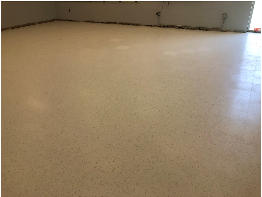
Figure 10 – Off-Colored Tiles Should be Culled