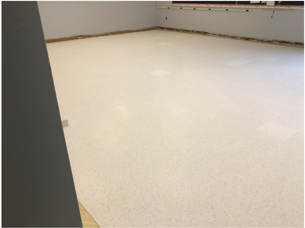
Figure 7 – Off-Colored Tiles Should be Culled