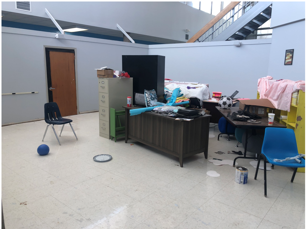
Figure 4 – Painting in the 300 Wing is Ongoing