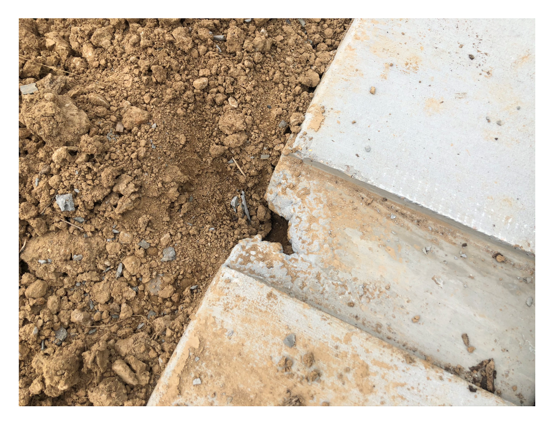
Figure 7 – Can we fill this recess with a Cementitious material and repair this void?