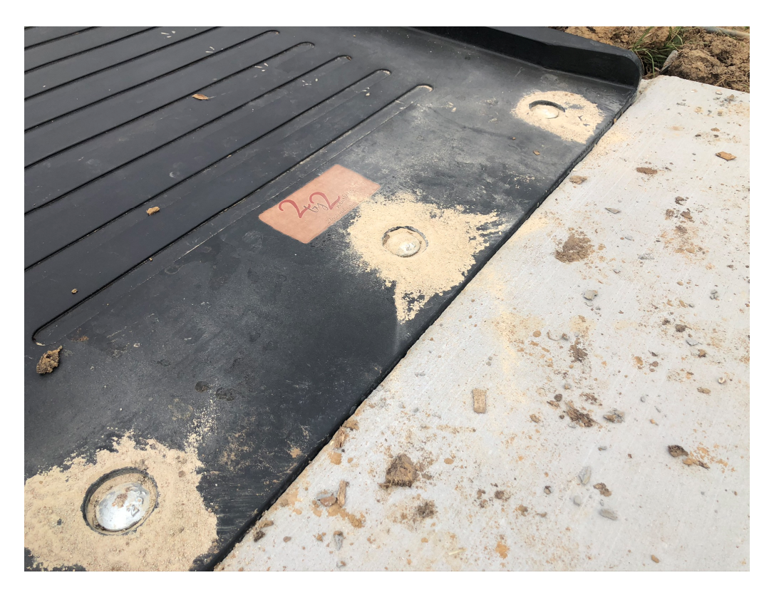
Figure 6 – Ramps Secured