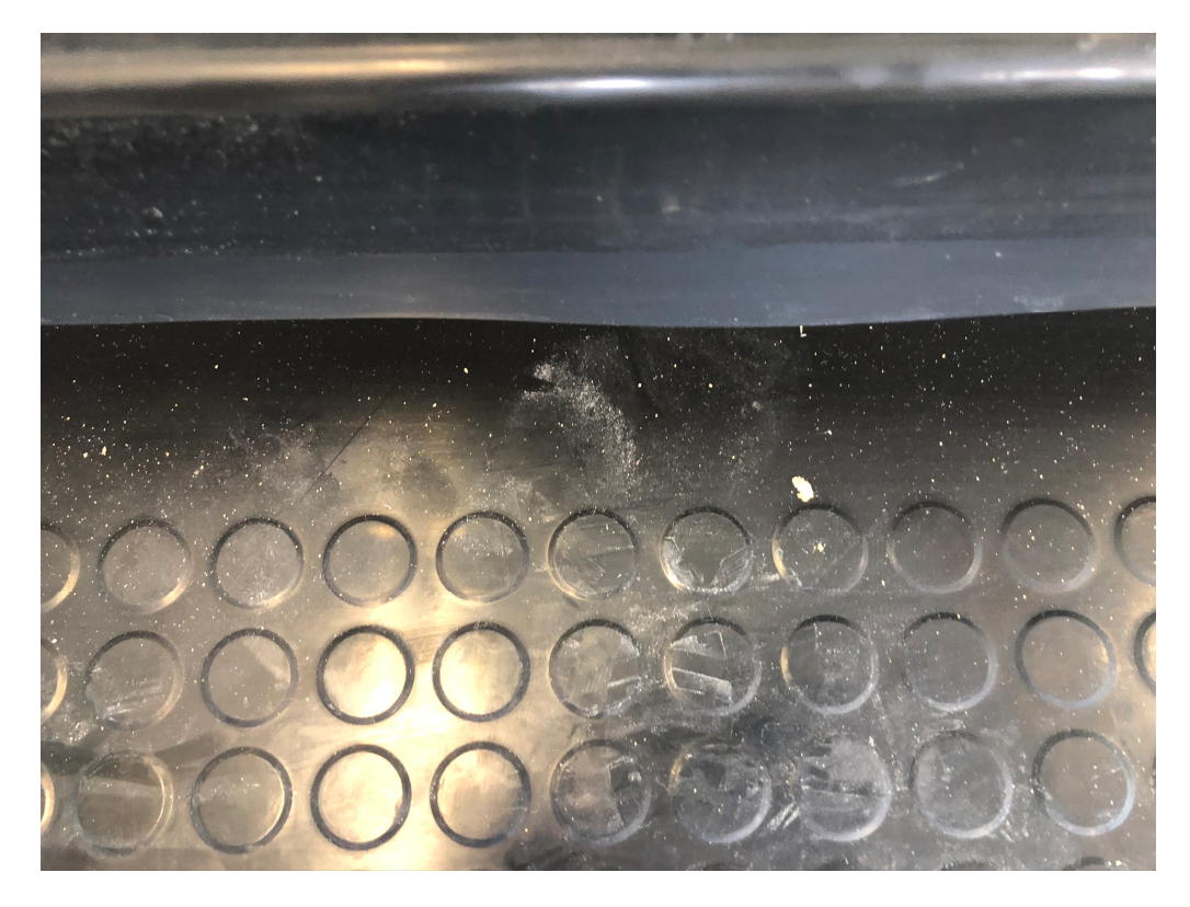
Figure 1 – Rubber Face is Not fully adhered to Step and appears wavy