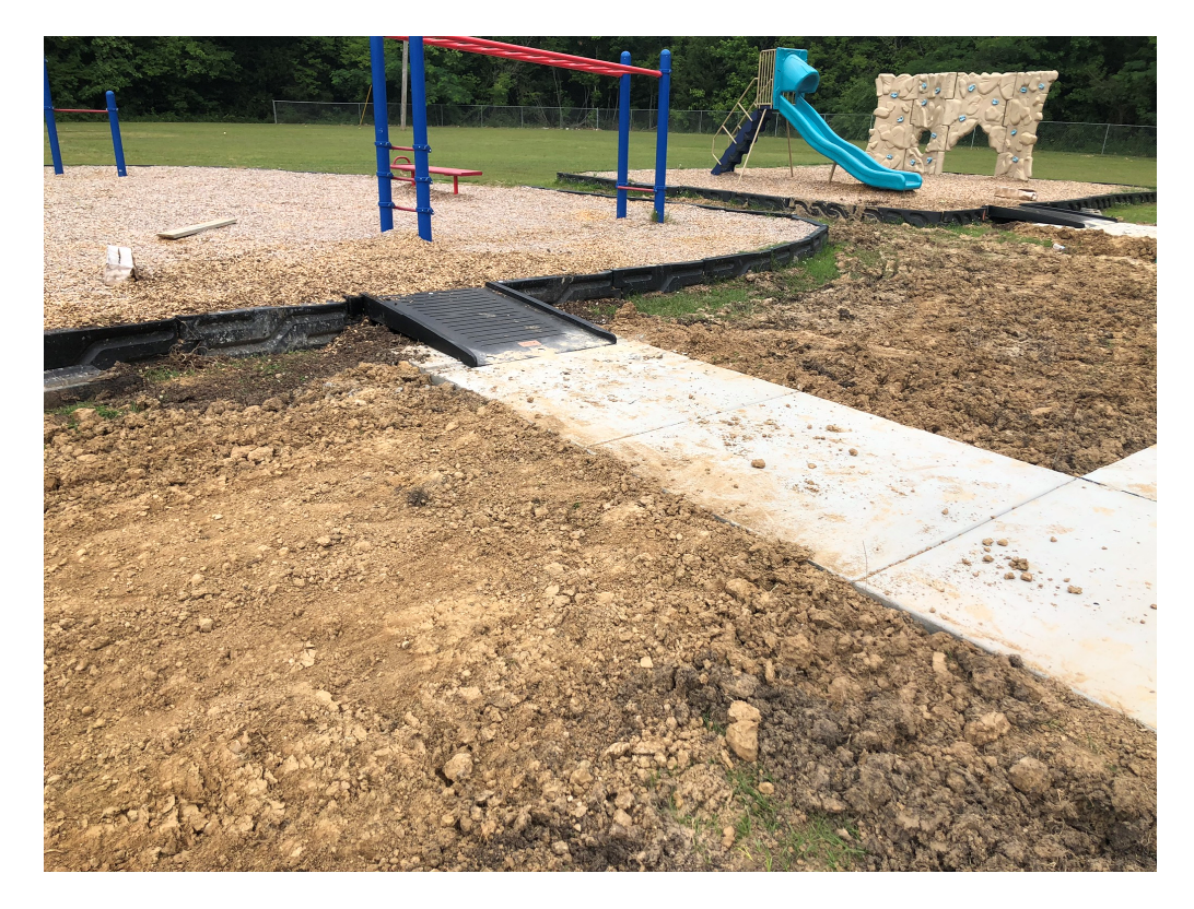
Figure 5 – Ramps installed