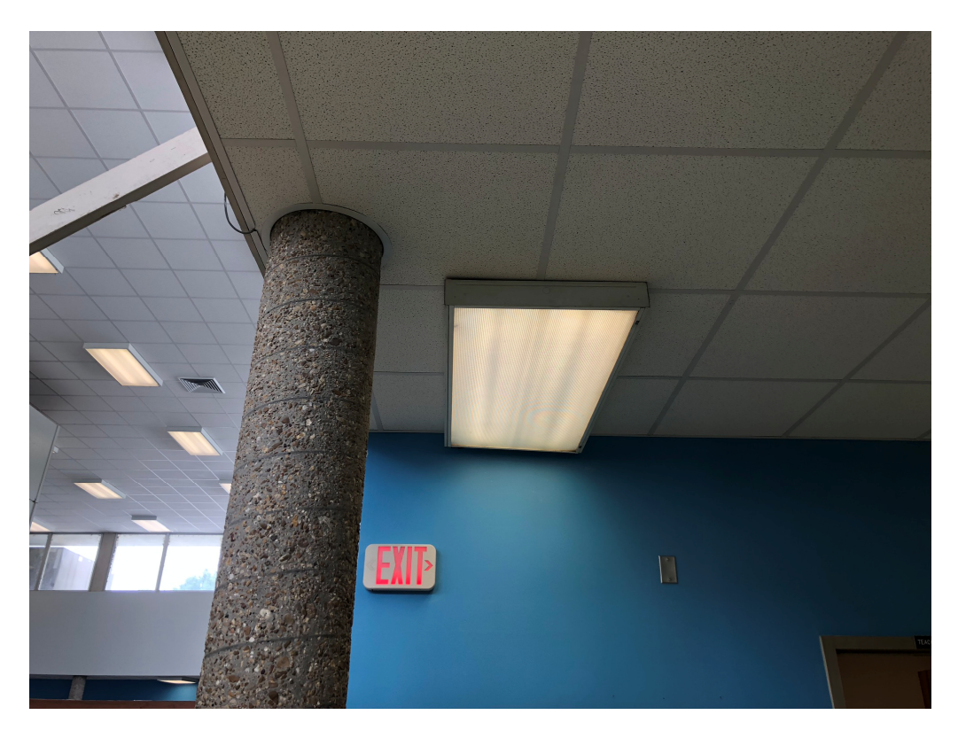
Figure 4 – This light in Building 3 has a gap on 2 corners and is not flush with ceiling