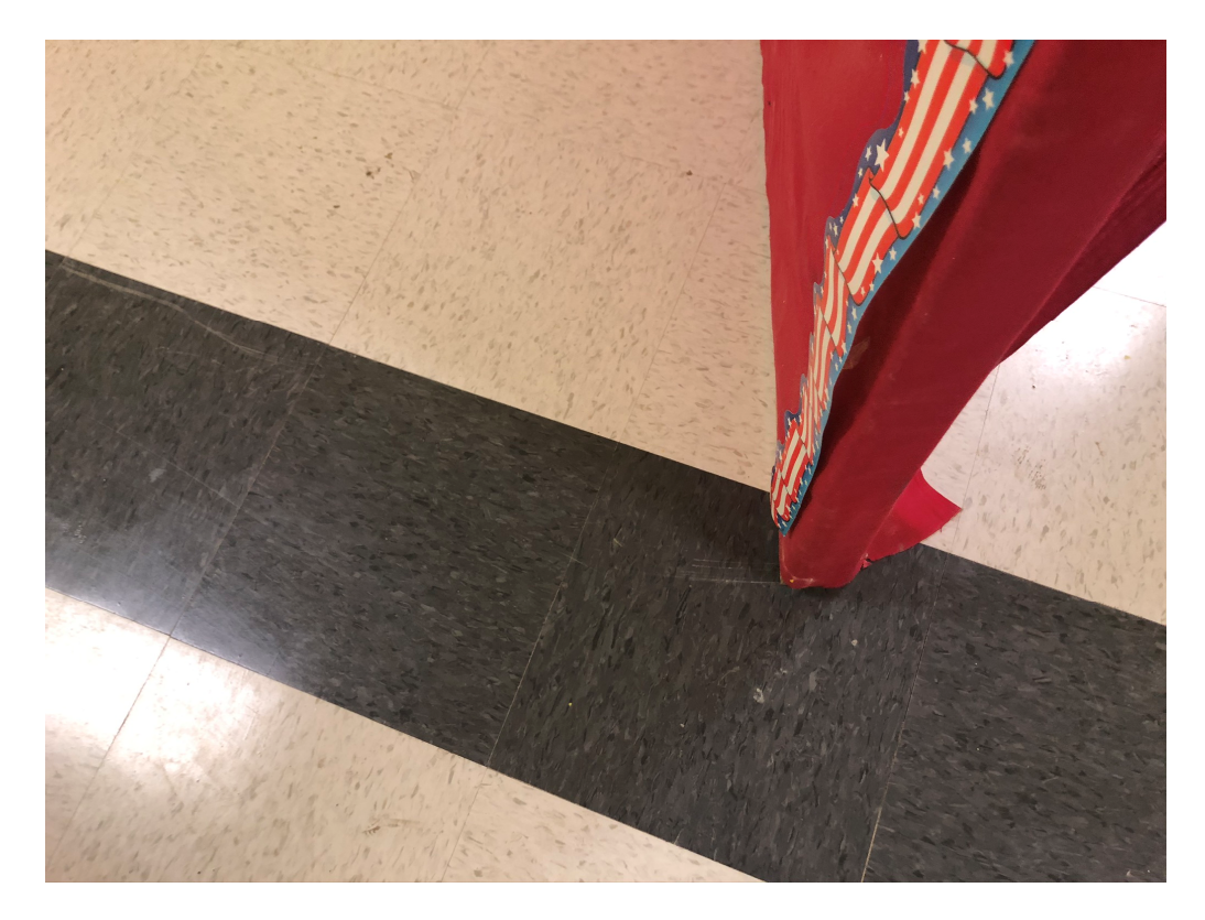
Figure 2 – Door dragging in hall needs undercut