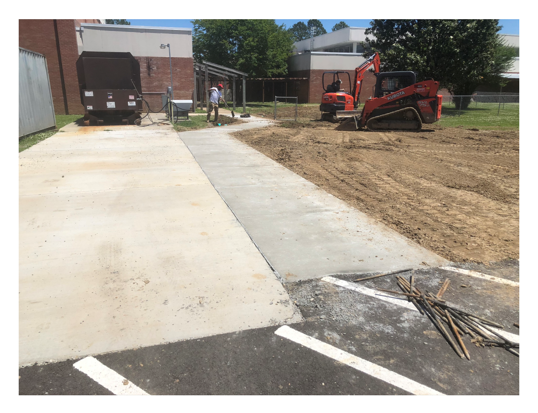
Figure 5 – New Concrete at Dumpster to Building 1