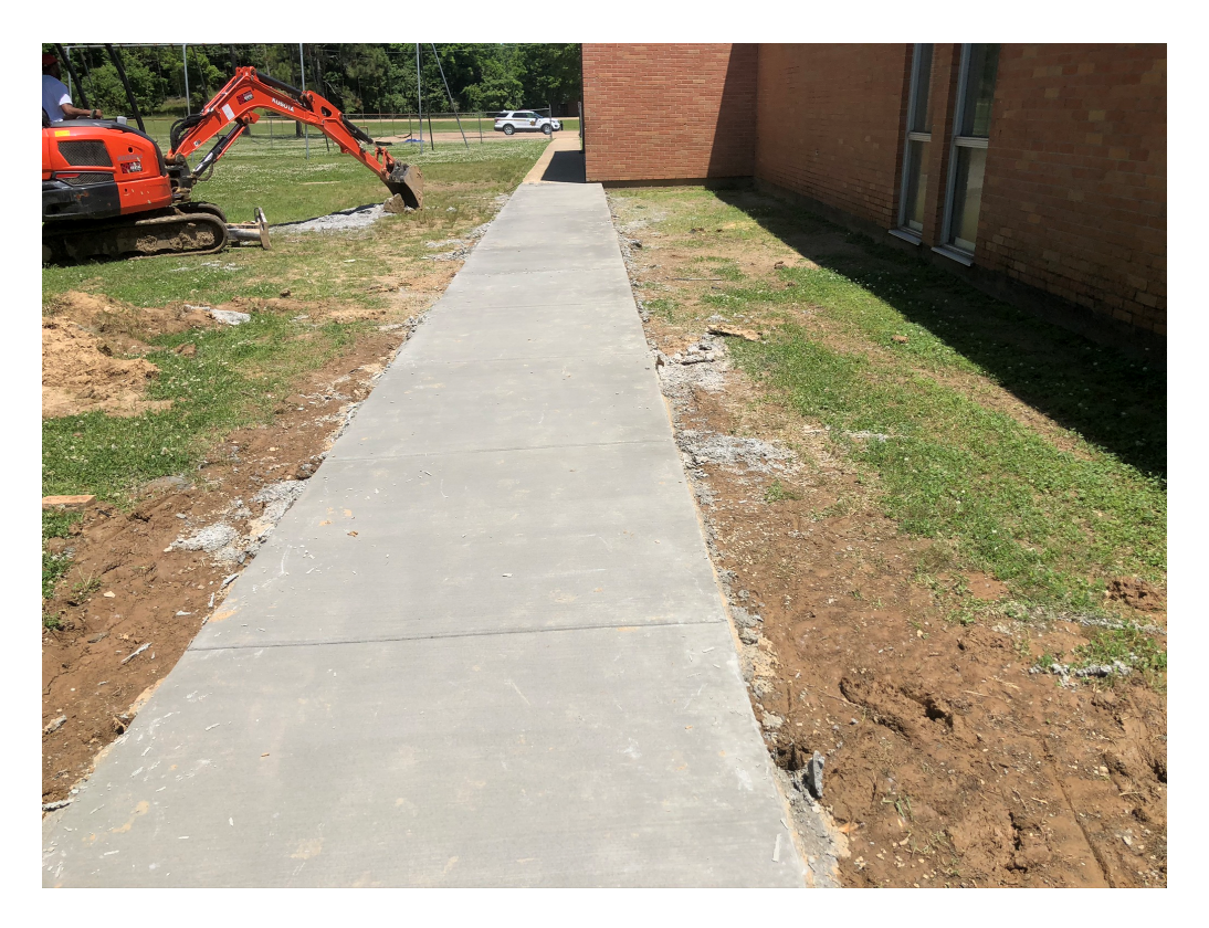
Figure 7 – New Concrete at Building 3 West End