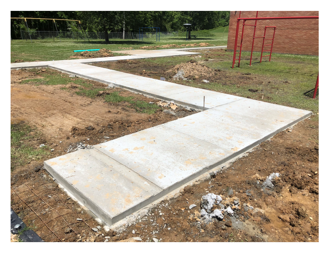
Figure 8 – New Walk Configured for Intersection of plastic ramp to be installed