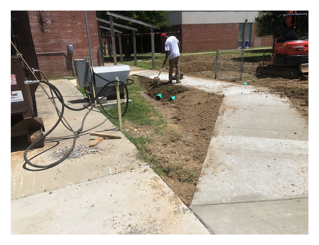
Figure 6 – Drain Pipe Installed Here