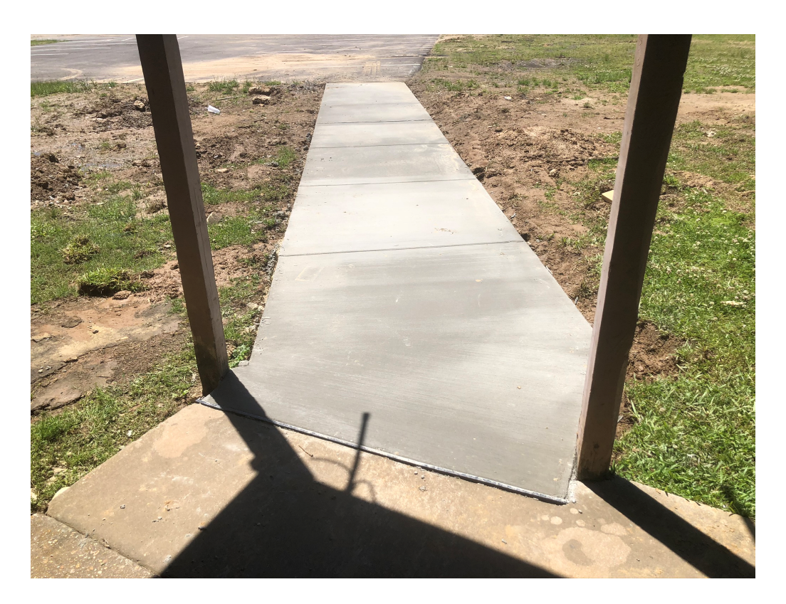
Figure 3 – New Concrete walk to parking from building 3