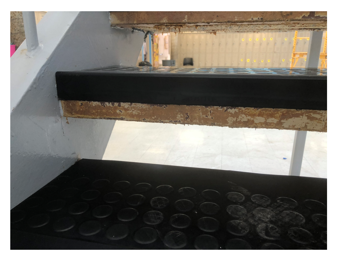
Figure 2 – Paint Required at lower section of tread as well as underneath and back side