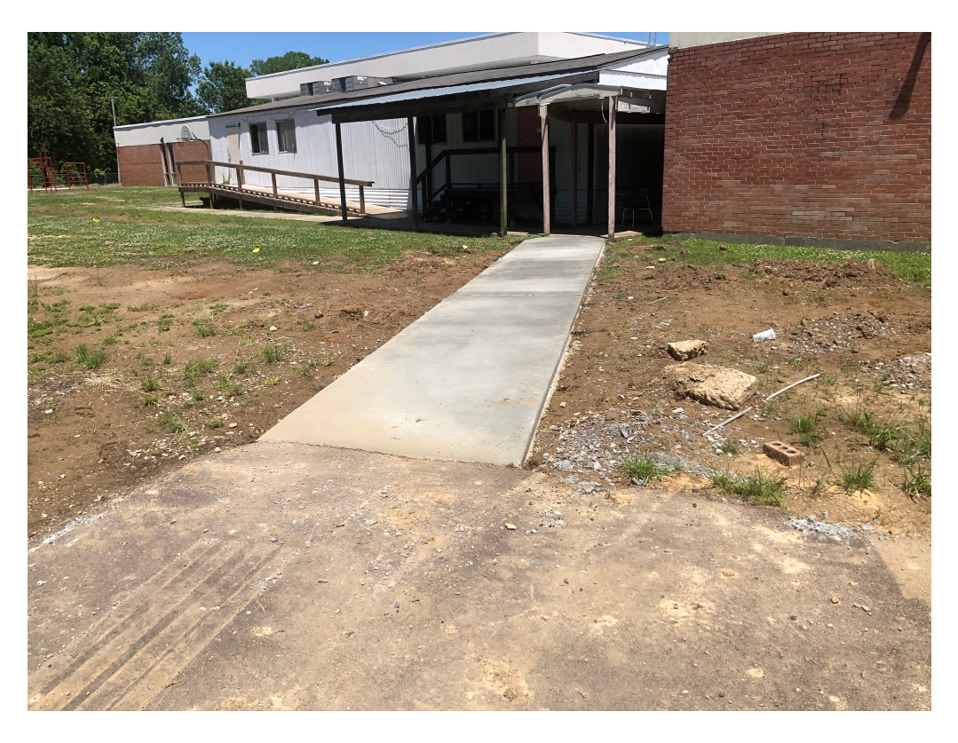
Figure 4 – New Walk