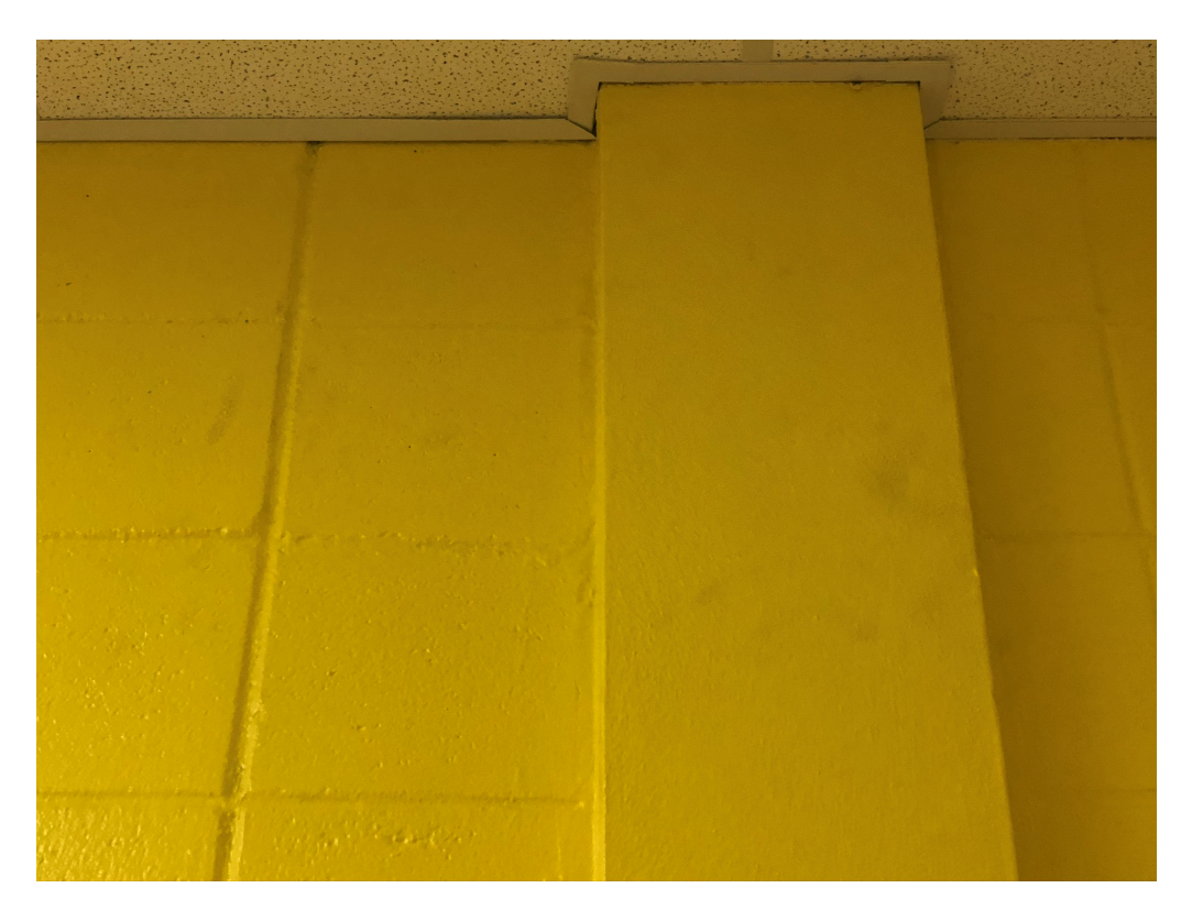
Figure 2 – Dirt Hand Marks (most likely from ceiling install)