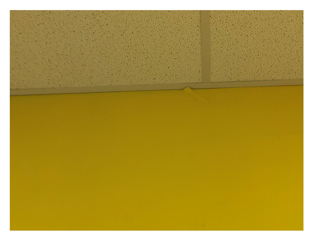
Figure 1 – Some Tape Left; Also Coverage to left of tape not complete