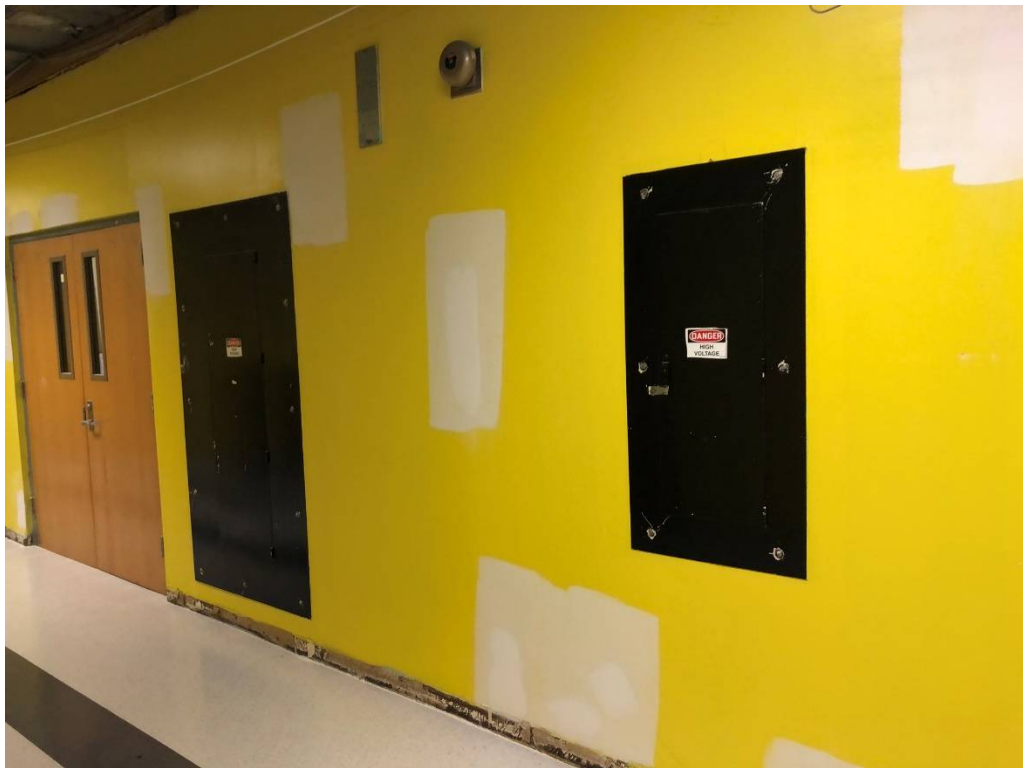
Figure 4 – Are these panels to be painted?