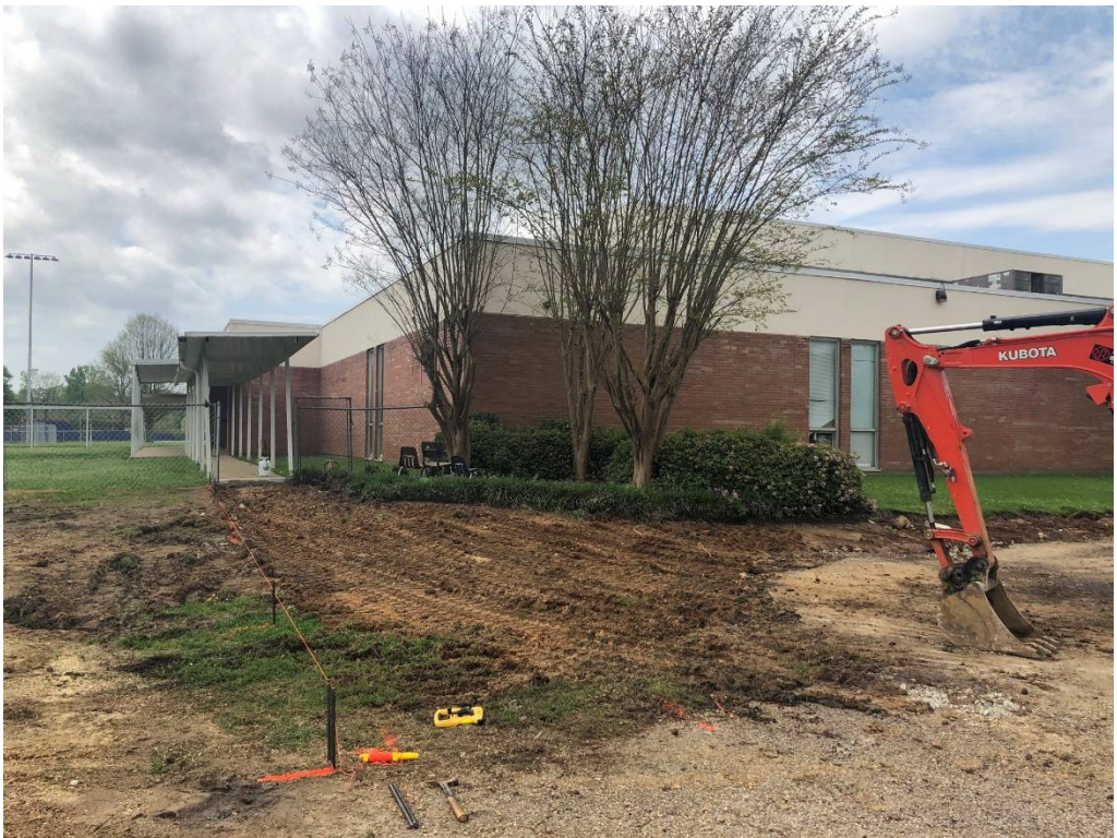
Figure 6 – Concrete & Awning Demolition