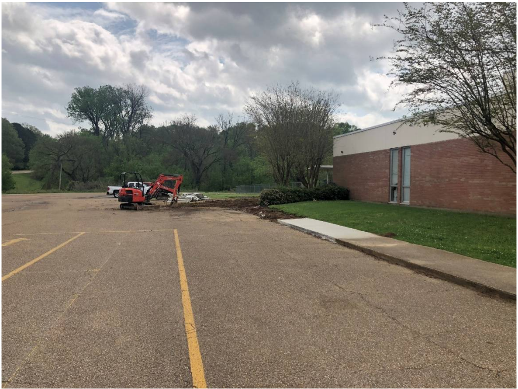
Figure 5 – Concrete & Awning Demolition