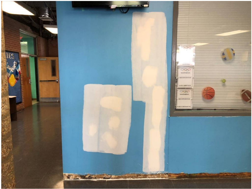
Figure 1 – Prime Patches at Wall Repairs