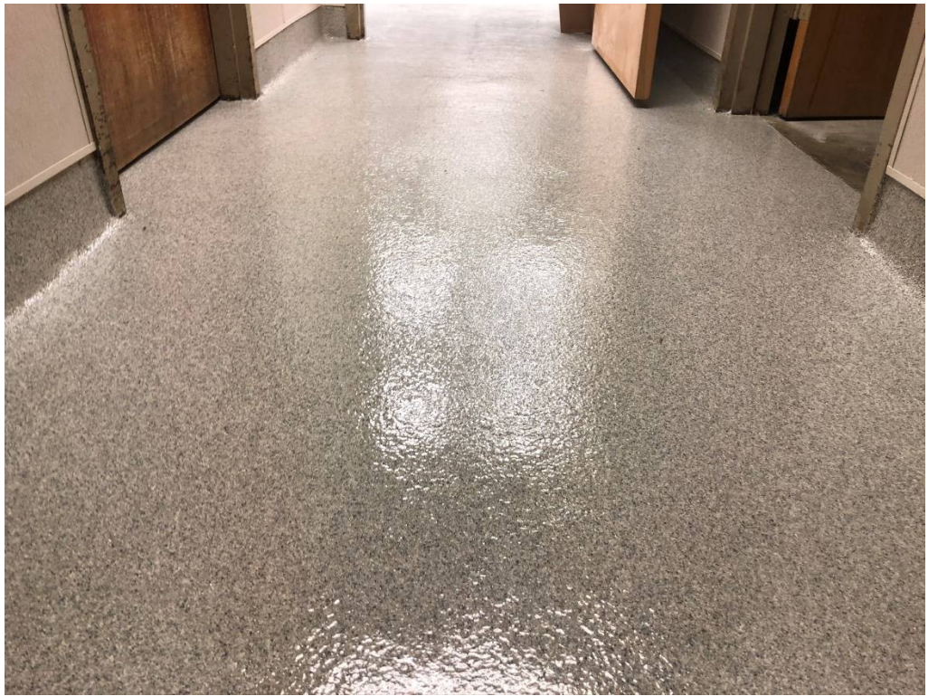
Figure 1 – Vestibule @ Building 3