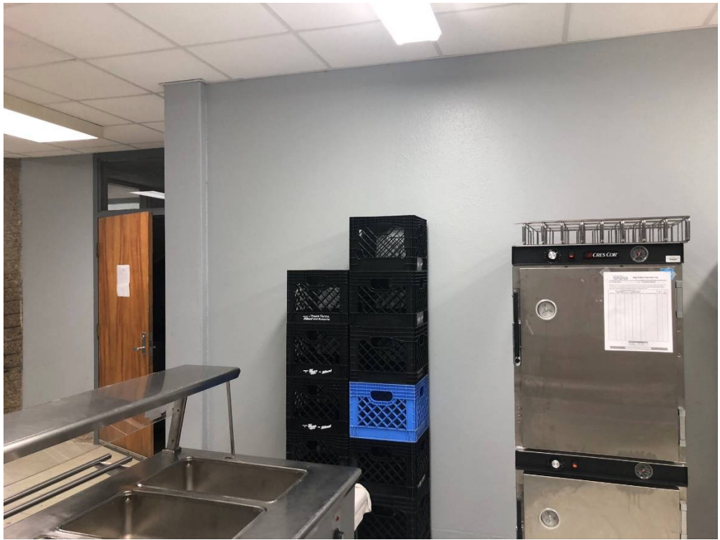
Figure 5 – Painted Serving Walls