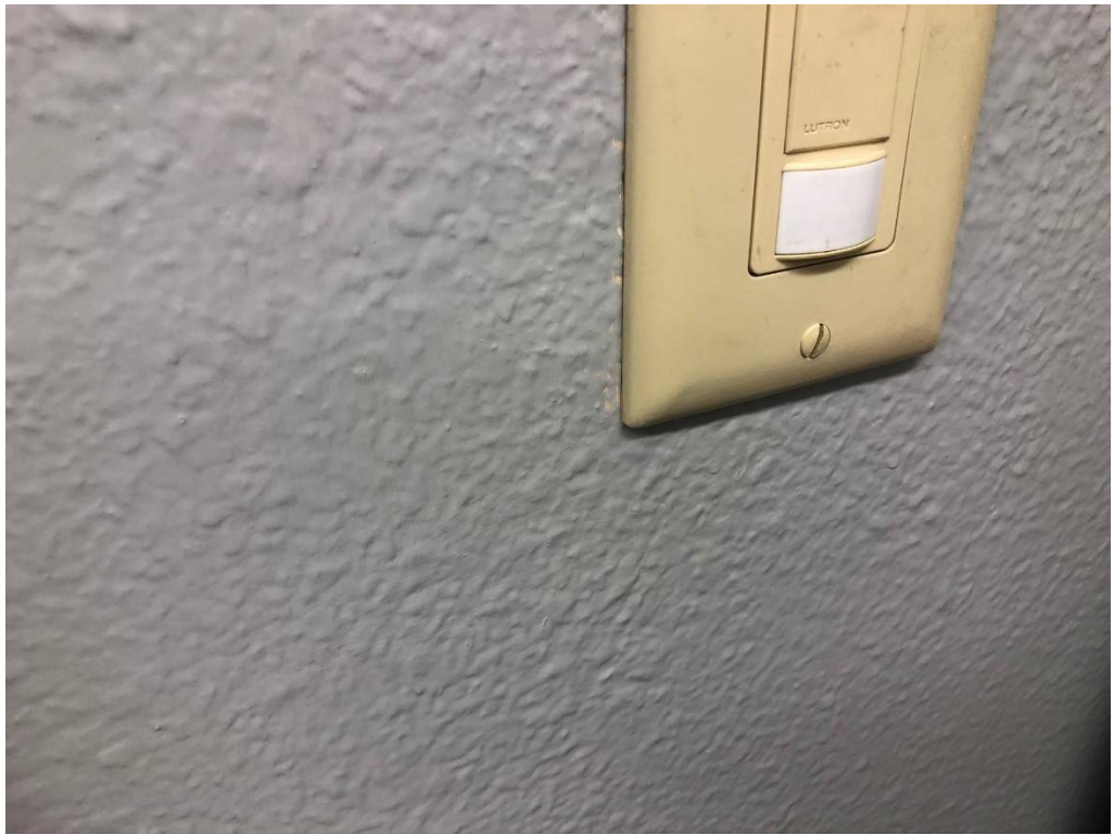
Figure 7 – Minor Touch up around Receptacle Building 3 Serving Room