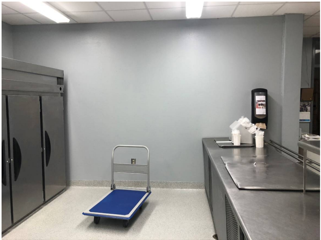
Figure 6 – Painted Serving Walls