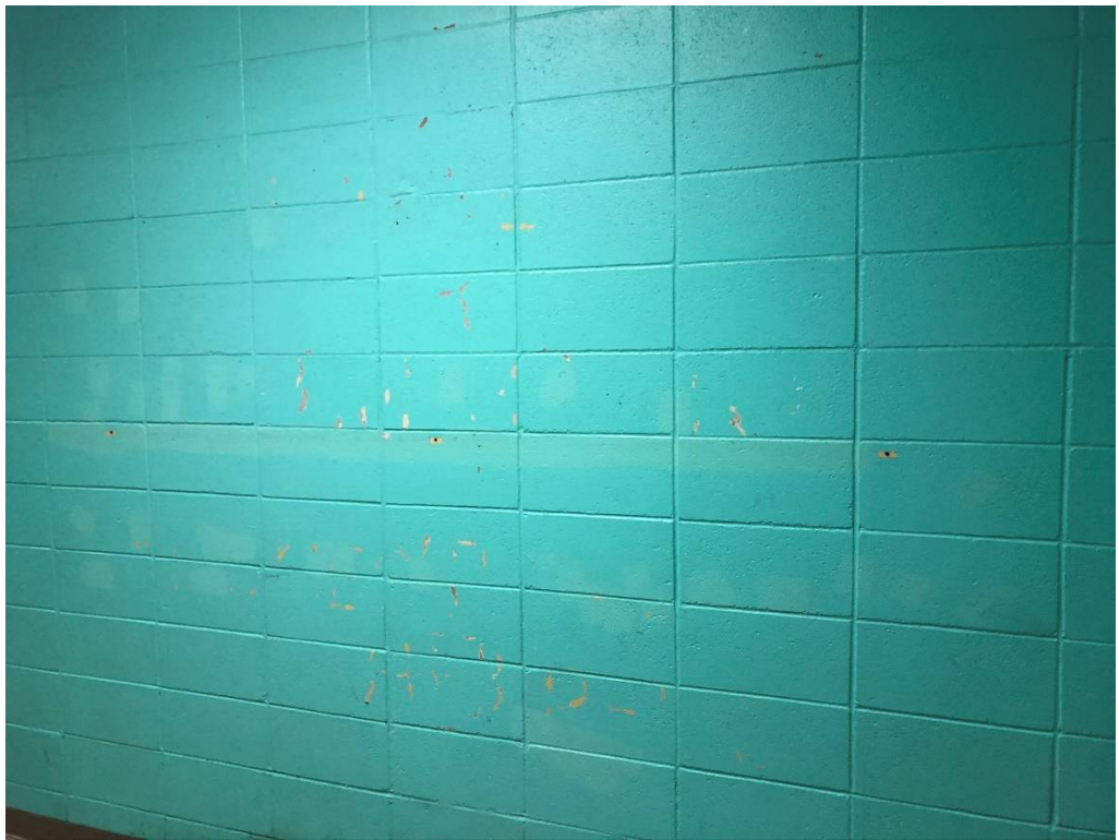
Figure 10 – Most Wall Hangings have Been Removed