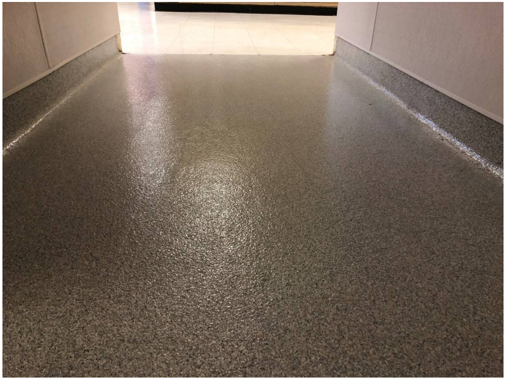
Figure 3 – Vestibule @ Building 3