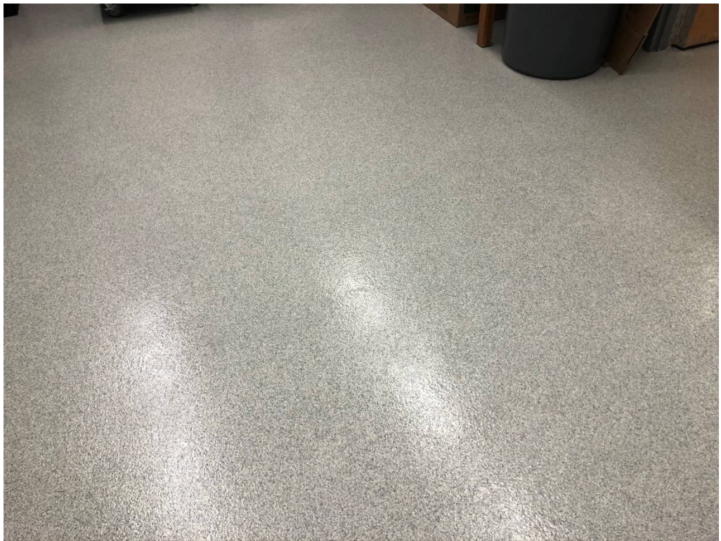
Figure 4 – Vestibule @ Building 1