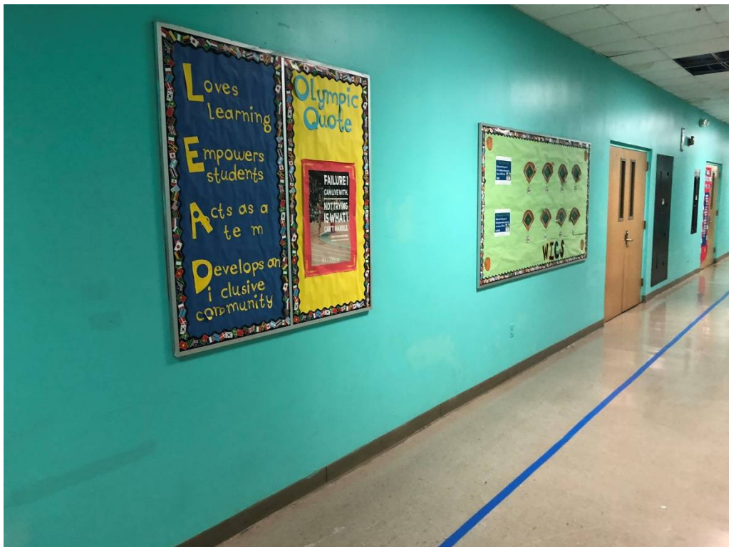
Figure 11 – Contractor to Coordinate with School on Removal of Metal Trimmed Boards (Wood Boards to Remain in Place and Paint to Cut around them)