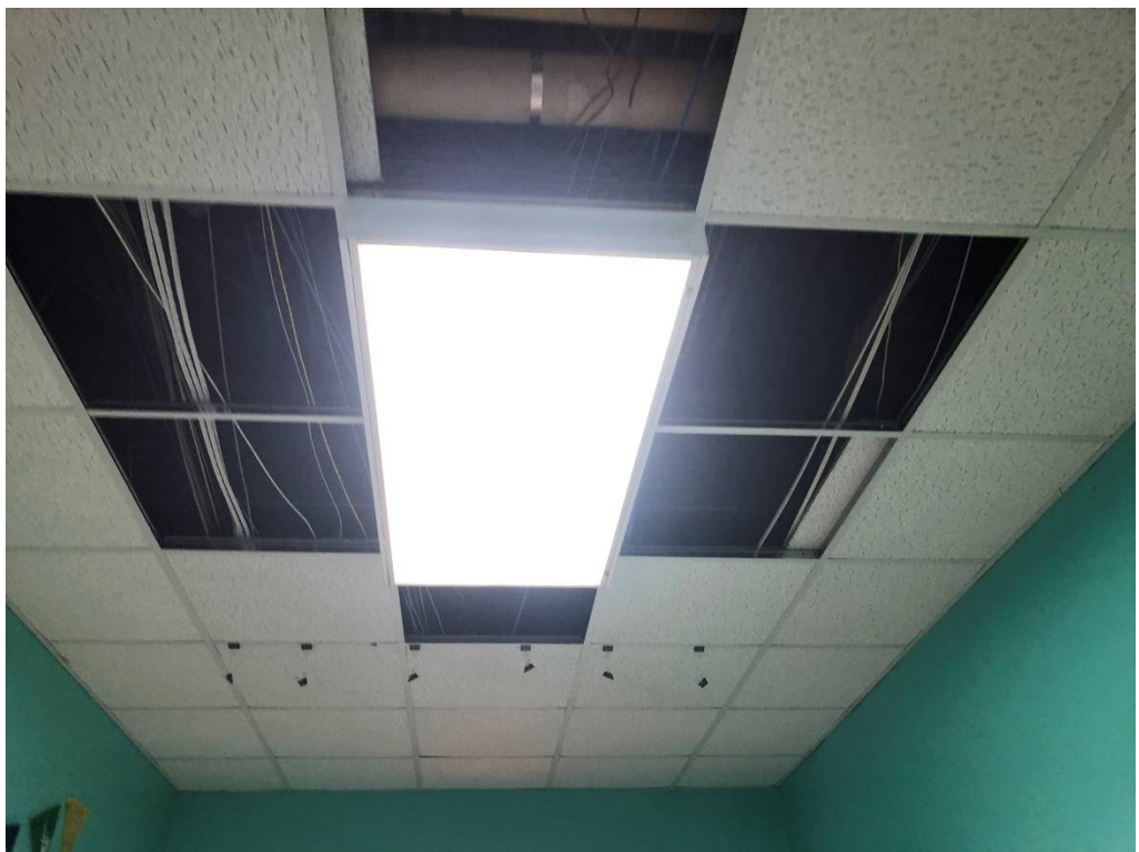
Figure 12 – Ceiling Work Began at Main Hall