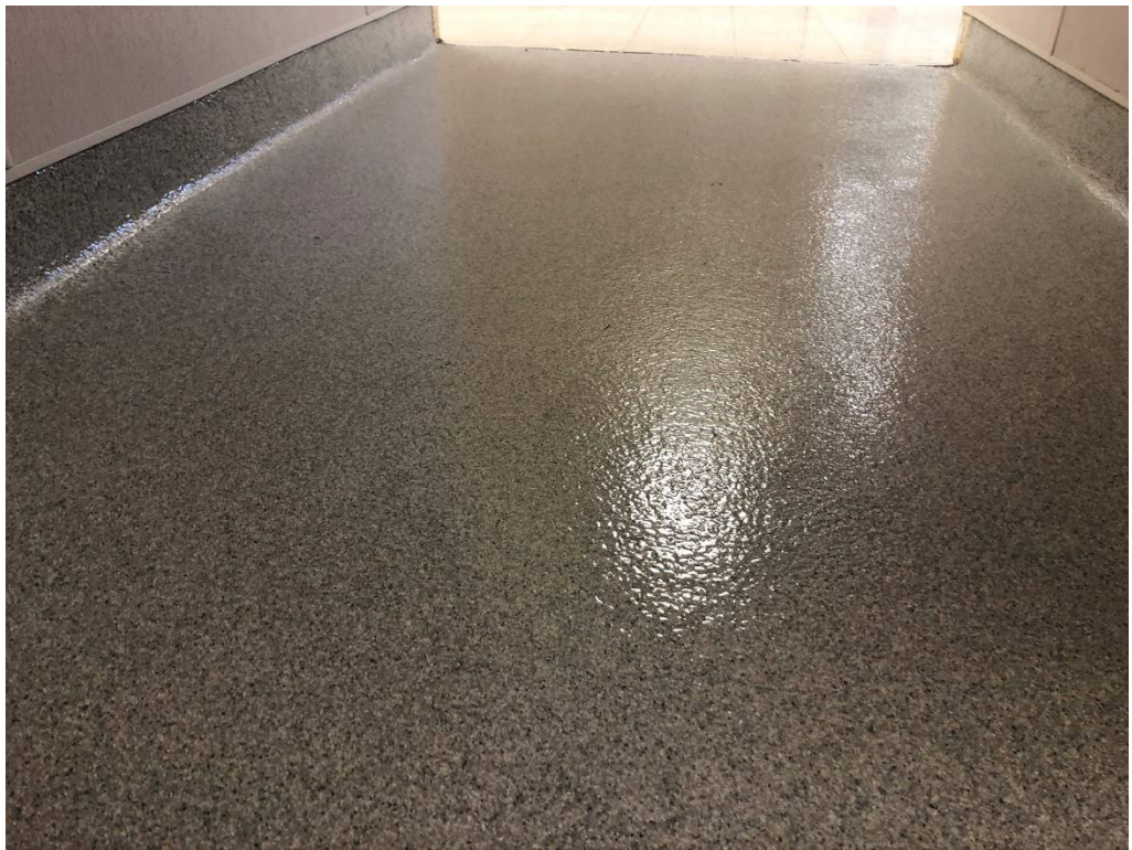
Figure 2 – Vestibule @ Building 3